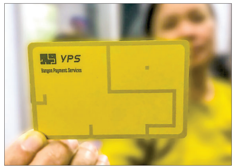
Yangon Payment Service (YPS) card.