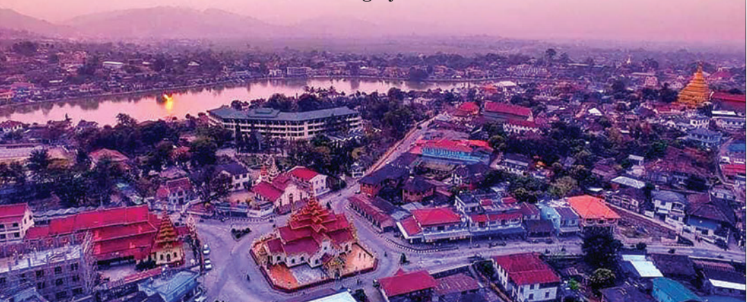
An aerial view of Kengtung that won the ASEAN Clean Tourist City Award.

The Myanmar delegation, led by the Union minister, also visited the Myanmar Tourism Federation exhibition booth at the ASEAN Tourism Exhibition in conjunction with the ASEAN Tourism Forum 2024.