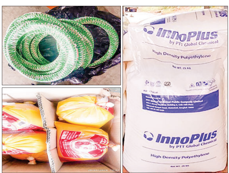
Seized illegal commodities.

According to the Illegal Trade Eradication Steering Committee, ten arrests were made over four consecutive days from 25 to 28 January, with an estimated value of K142.42 million.