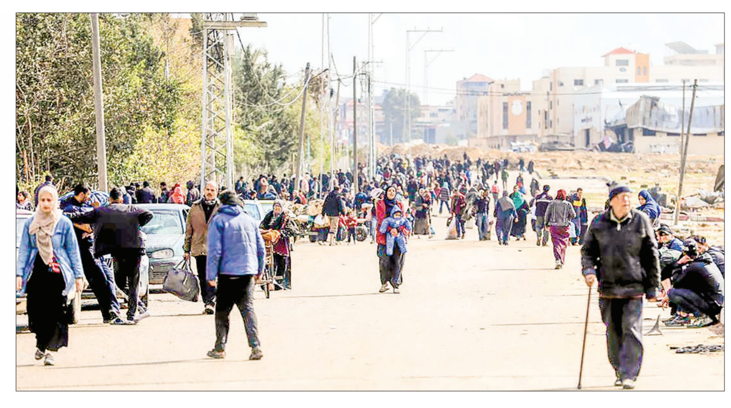
People leave their home after receiving evacuation orders from Israel in the southern Gaza Strip city of Khan Younis, on 29 January 2024.

Fears of a widening regional conflict were compounded after Israel's top ally Washington vowed to respond