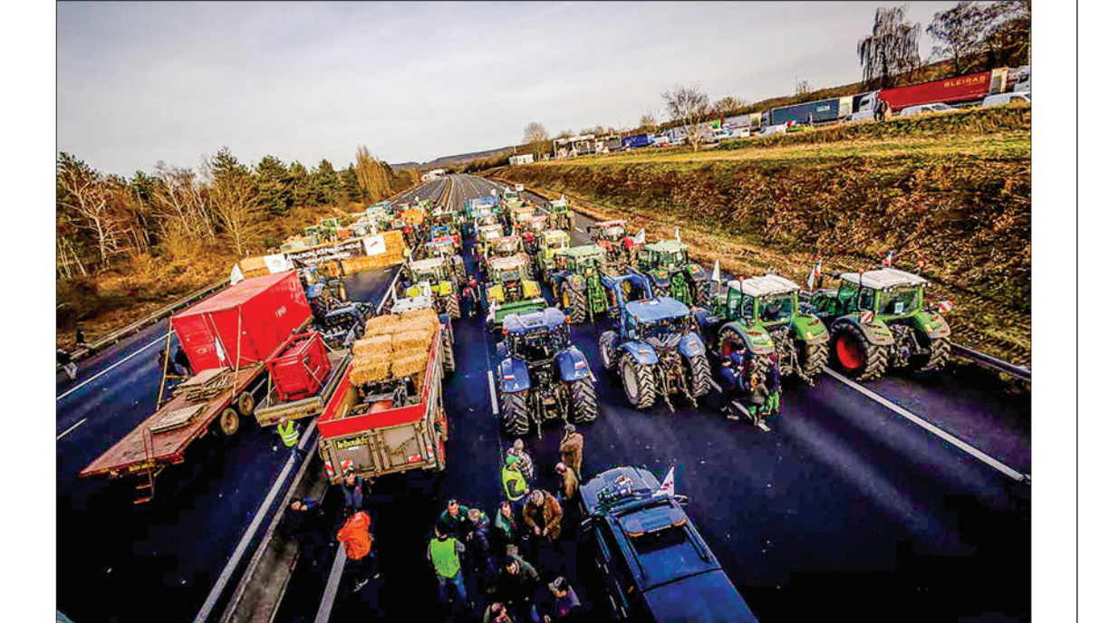
French farmers block a highway with their tractors during a protest in Longvilliers, near Paris, France, on 29 January 2024.

The US government announced on Saturday the decision to review its sanction policy against the South American country, following what it called the "worrying" ruling by Venezuela's Supreme Court of Justice to ratify the disqualification of the opposition candidate for the 2024 presidential elections, Maria Corina Machado. — Xinhua