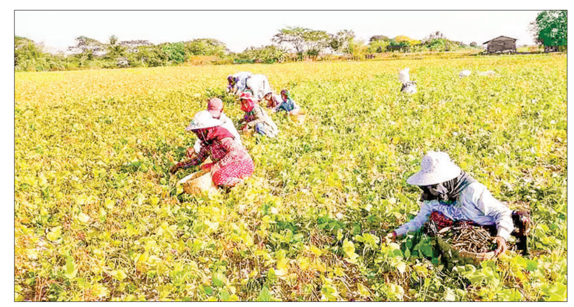
Pulse plantation workers in action for the green gram harvest.

NEWLY harvested green gram is flowing into the market, and the prices continue to surge in Mandalay's market due to the robust demand by Chinese buyers.