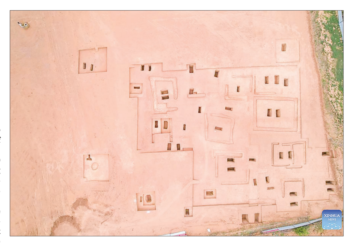
An aerial drone photo taken on 27 May 2023 shows the excavation work area of the ancient trenchenclosed tombs in Helinger County of north China's Inner Mongolia Autonomous Region.

According to the shape of the tombs and the excavated funerary objects, the tombs date back 2300 to 2200 years, which was the late Warring States Period, said Wang Zepeng, an archaeologist at the institute. — Xinhua