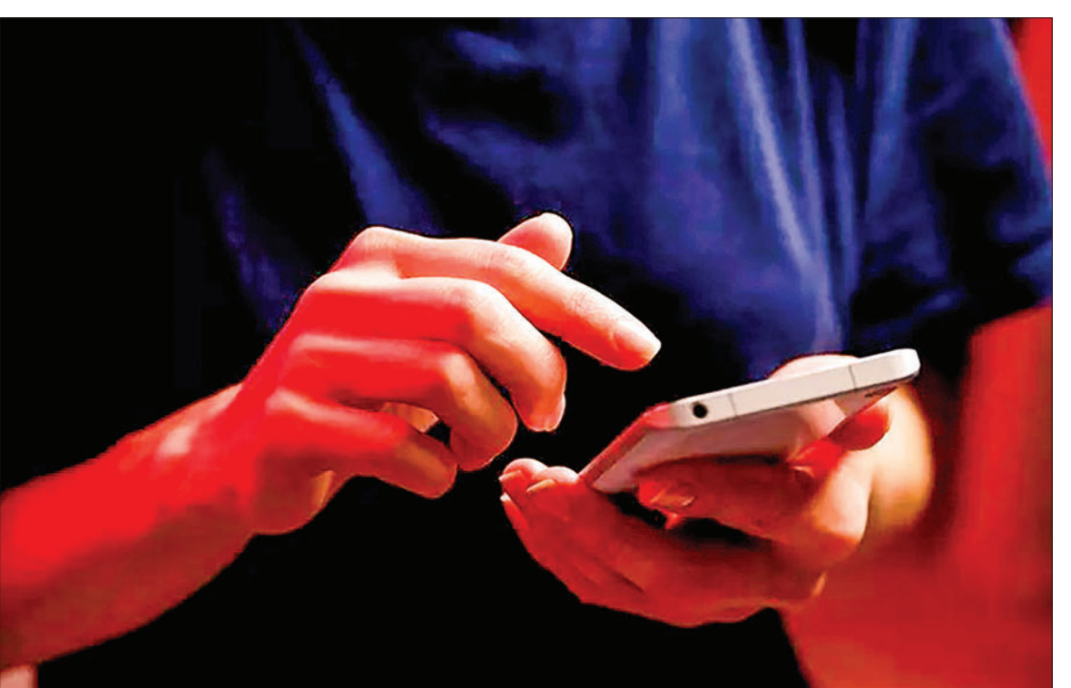
With profound sorrow and longing, I once more hear my mother's lament. I persistently lift my cell phone and dial my mum's number that was recorded in it.

derstanding of my roots, a connection to a lineage of strong, resilient women. Through her words, my grandmother, though long gone, became a living presence in our mornings, a silent participant in our shared history.