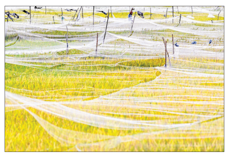
A farmer walks through netting set up by farmers to protect their crops from pest birds in a paddy field in Lhoknga, Indonesia's Aceh province, on 10 January 2024.

Poor diets lead to obesity or undernutrition and associated chronic illness, while polluting farming practices drive global