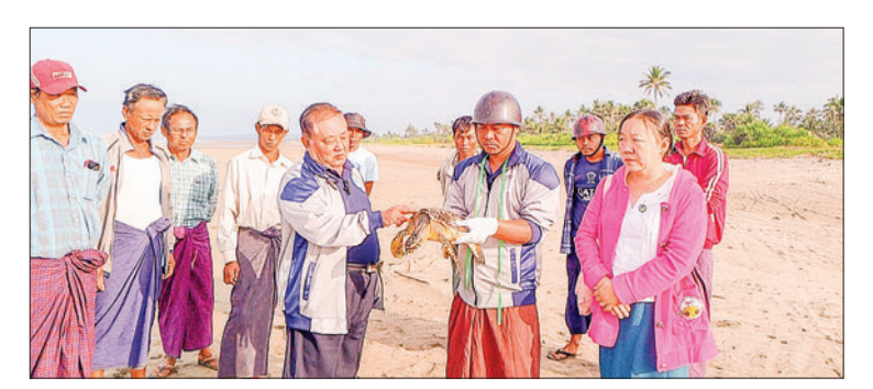
sea turtle release ceremony in action in Haiggyikyun Township.

SEA turtle conservation departments from Hainggyi Island and Tameehla Island of Hainggyikyun Township, Pathein District, Ayeyawady Region, and township level departments held a turtle release event at Kyakan Village yesterday.