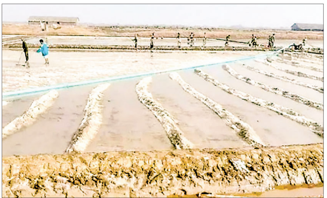
Salt farmers seen working at salt fields in Ayeyawady Region.

Ayeyawady salt is mainly exported to Yangon and Mandalay regions, and the price of fine salt per viss rose slightly from K230 to K280 last week due to bouts of rain. — MT/ZN