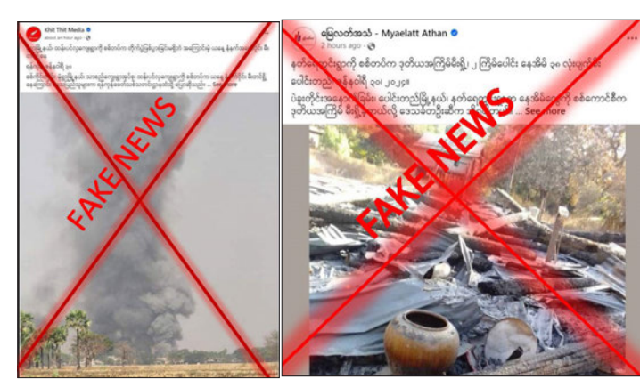
Screenshots validate misinformation.

The true situation was that PDF terrorists set some