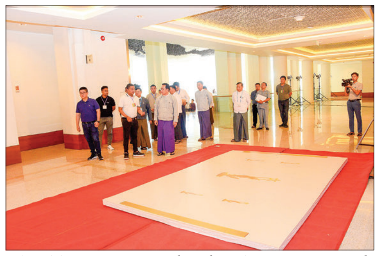
Union Minister U Maung Maung Ohn and party inspect preparatory work for the 2023 Myanmar Film Academy Awards event in Nay Pyi Taw.

They also warmly met receptionists who will bring academy statues to the stage for recipient artistes.