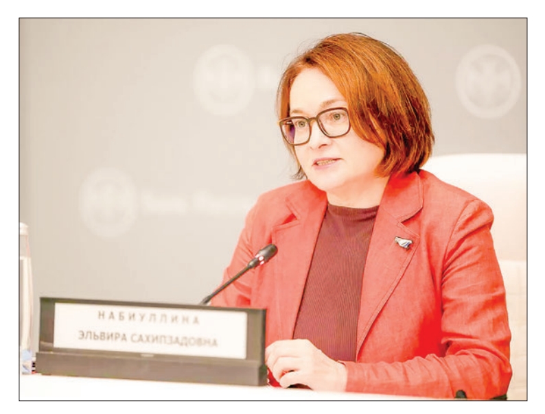
Head of Russian Central Bank Elvira Nabiullina.

The SPFS was created by the Bank of Russia to mitigate the risks of potential disconnection of Russian banks from SWIFT -- an international interbank system for transmitting information and making payments, which connects more than 11,000 organizations in almost every country in the world. — Xinhua