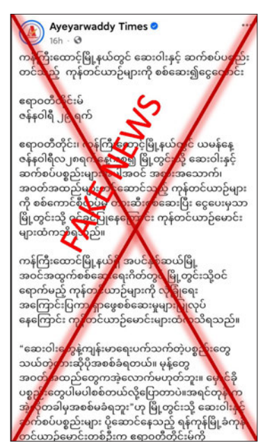
Screenshot validates false news.

THE malicious media outlets are spreading the false information