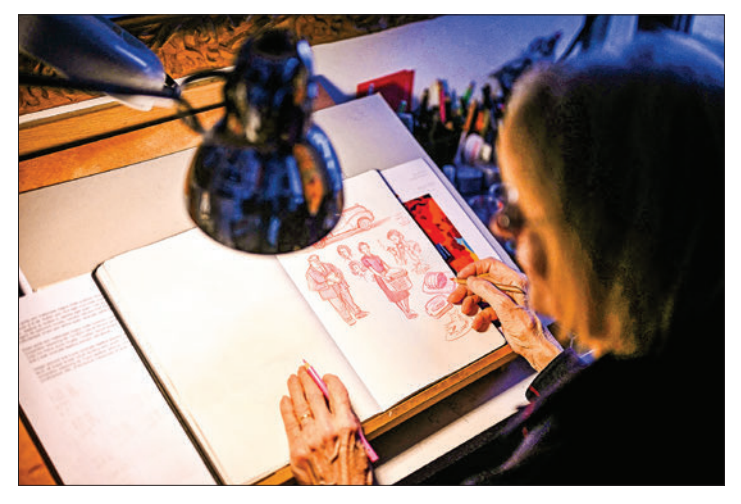
British cartoonist Posy Simmonds works on a drawing as she poses for a portrait at her home in London on 29 January 2024.

POSY Simmonds is only the fifth woman and the first Briton to win the grand prix at France's