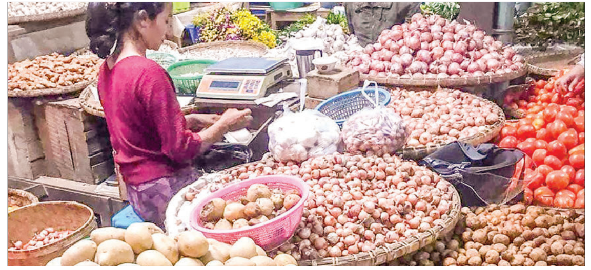
A vendor is organizing kitchen foodstuffs at her retail dry grocery shop.

The highest price in the Seikphyu market was K1,700 with an entry of K85,000 viss. At the same time, the onion fetched only K1,500 per viss in maximum in the Pakokku market that day, with the supply of 66,000 visses of monsoon onion on 30 January.