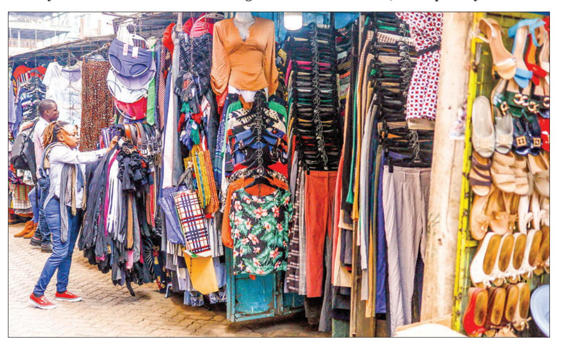
A hawker selling clothes along the business district in Nairobi, on 16 January 2024.

"Growth is projected to remain at around five per cent per annum for the foreseeable future, which should allow for steady rises in real per capita income and reductions in poverty, after the significant disruption caused by the pandemic," the report says. — Xinhua