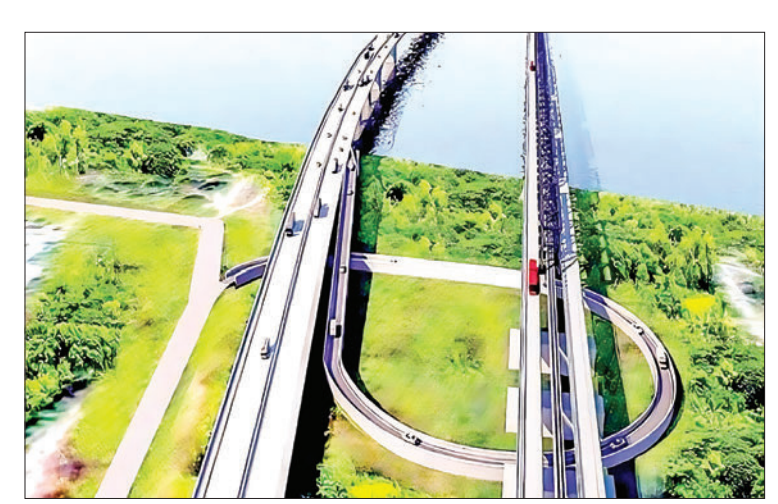
The computer-generated model for the No 3 Thanlyin Bridge.

The Thilawa Special Economic Zone has resulted in a growing number of local and foreign businesses, and property prices in South Yangon District townships – Thanlyin, Kyauktan, Kayan and Thongwa – will likely increase. — Thit Taw/ZS