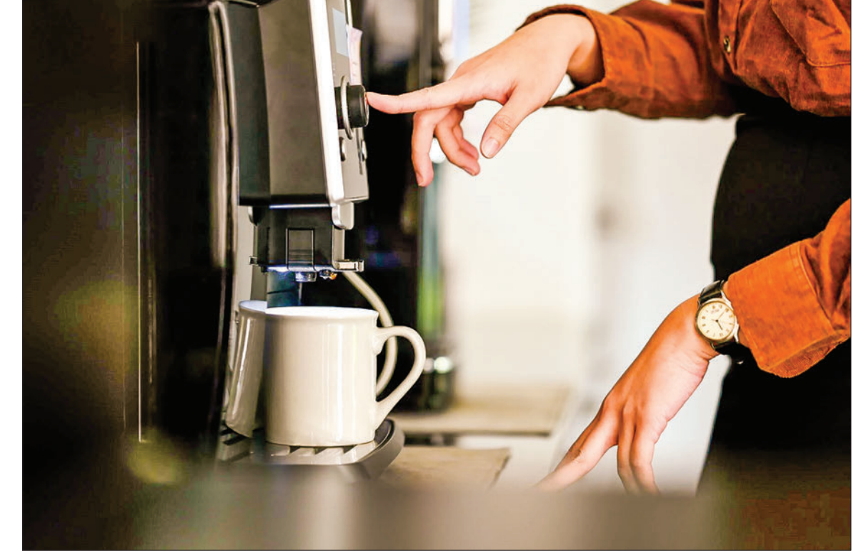
From 31 October to 31 December 2022, the researchers swabbed a total of 25 coffeemakers spanning the range of fully automatic, capsule and espresso machines.