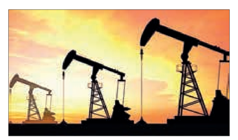
India's robust economic growth and rising aspirations for mobility and tourism are expected to propel the country's oil demand expansion over the next decade, reshaping global oil market dynamics.

The report forecasts India to become the largest source of global oil demand growth by 2030, driven by factors like urbanization, industrialization, and the growing middle class.