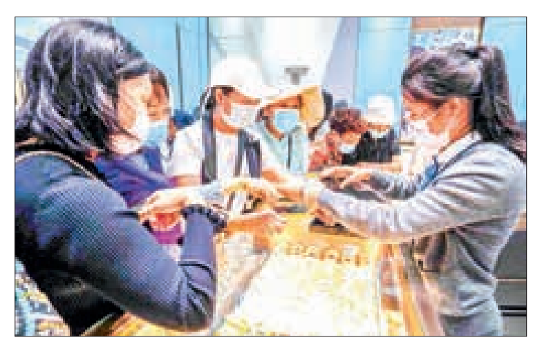
Customers shop for gold accessories at Haikou International Duty Free City in Haikou, Hainan province, on 28 October.

In the Xi'an Tumen branch of China Minsheng Bank, sales of gold bars increased by 50 per cent in January 2024 compared with the monthly average of the second half of 2023. "Gold bars are selling like hotcakes," a staffer told Xinhua. — Xinhua