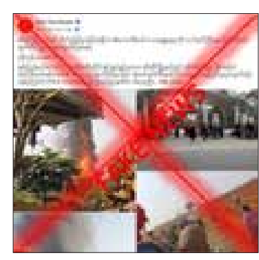
Screenshots validates false reports.

al Organization (militia) troops engaged with the terrorists. Terrorists apparently attacked the villages with heavy weapons and dropped bombs from drones, resulting in civilian injuries and casualties.