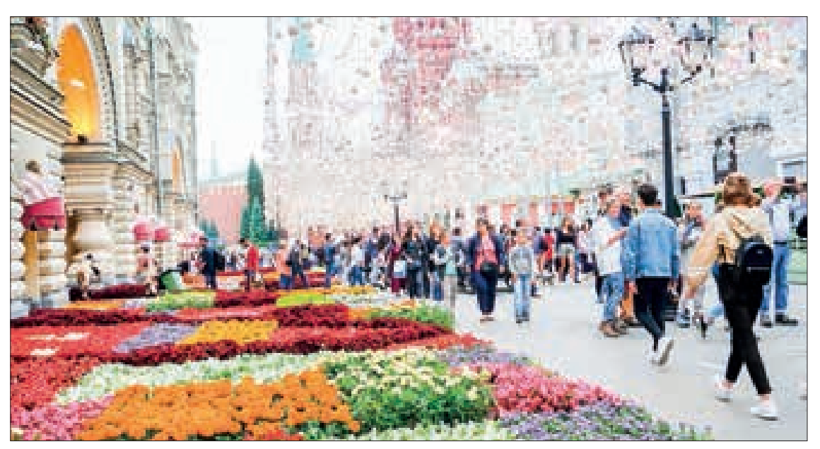
The picture shows one of the sightseeing locations in the Russian Federation.

Those who would pay income tax can visit the Inter-