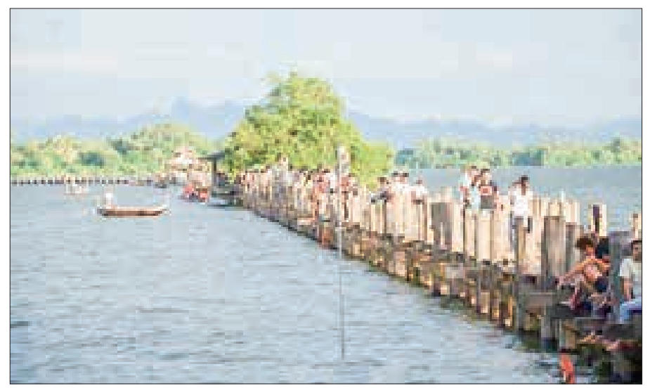
Foreign and domestic tourists are seen visiting the U Bein Bridge.

THE survey of tourist attraction sites in 19 townships across Myanmar, conducted with the aim of promoting hotels and tourism industry effectively,