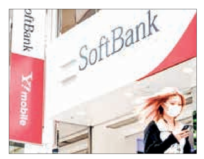
A woman walks past a logo of the SoftBank Group in Tokyo on 12 May 2021.