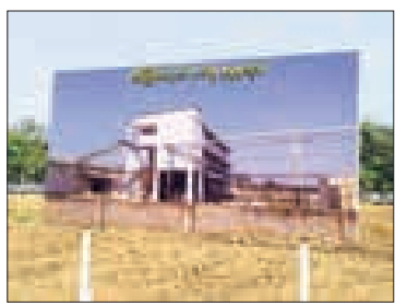
The signage showcasing the construction project of the cooking oil production plant.

The federation will accelerate bran oil and cooking oil production plans. — NN/EM