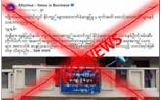
Screen shots\ validate\ misinformation\ and\ fnaccurate\ Claims.

THE malicious media outlets, DVB and Mizzima, intentionally spread false information, claiming that the prisoners of Kyaikmaraw prison in Mon State staged a hunger strike demanding three facts regarding health issues of political prisoners after two political prisoners were incarcerated for possession of phones.