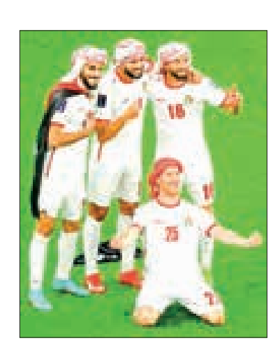
Jordan's players celebrate after defeating South Korea.

Jordan's top division, the Pro League, is professional but wages can be so low that players are forced to take up second jobs