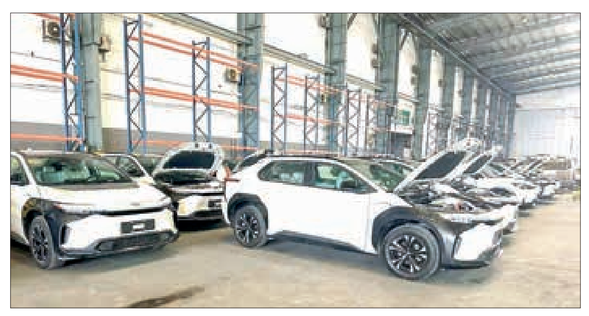
A glimpse of newly arrived battery electric vehicles (BEVs).

The committee for the development of importation, installation and investment of Electric Vehicle and associated businesses held the coord meetings with EV importing companies in April and June and has already noti-