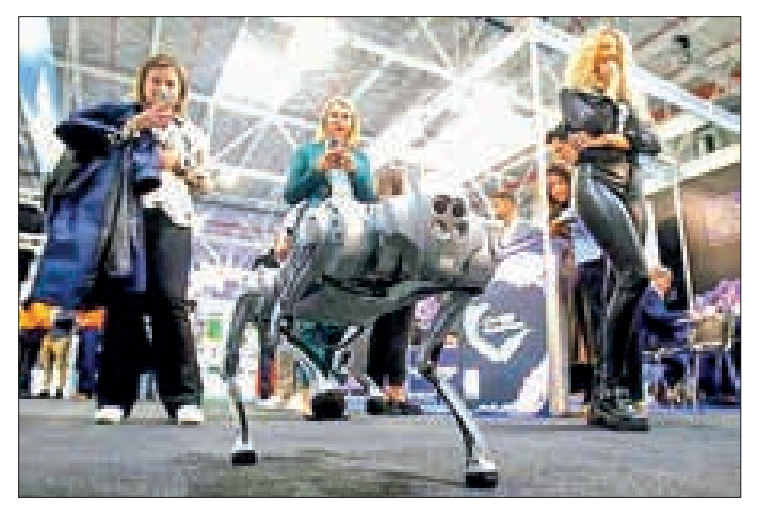
An utilitar robot is seen at GoTech World exhibition in Bucharest, Romania, on 9 November 2023. GoTech World, a two-day IT and digital event in Central and Eastern Europe, showcases technological solutions mainly based on Artificial Intelligence.