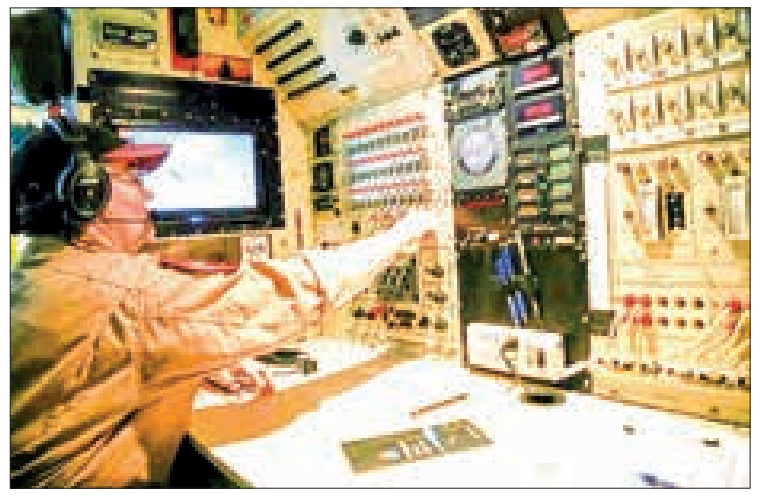
Readings gathered aboard NASA's specially outfitted DC-8 will help scientists determine how pollutants are spread in the air.

Air quality forecasting relies on readings from ground stations as well as satellites, but both methods are limited in their ability to see how pollutants are spread in the air, according to experts. — AFP