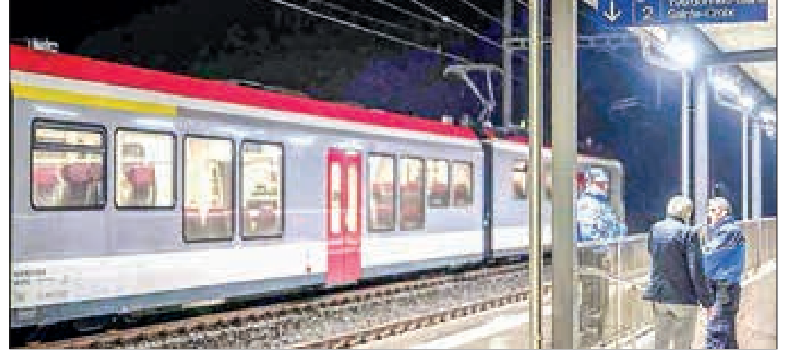
Swiss police officers stand next to a train, where passengers travelling from Yverdon to Sainte-Croix were earlier held hostage, in Essert-Sous-Champvent, western Switzerland on 8 February 2024.

A total of 15 hostages were taken — 14 passengers and the conductor — with the ordeal dragging on for nearly four hours, from around 6:35 pm to 10:30 pm (1735 GMT to 2130 GMT). — AFP