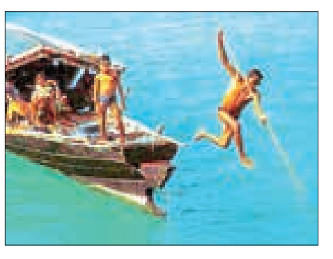
A Salon man catching fish using a traditional way.

The festival has traditionally been held at Makyongalat Village, boasting the largest Salon population since immemorial. — TWA/NT