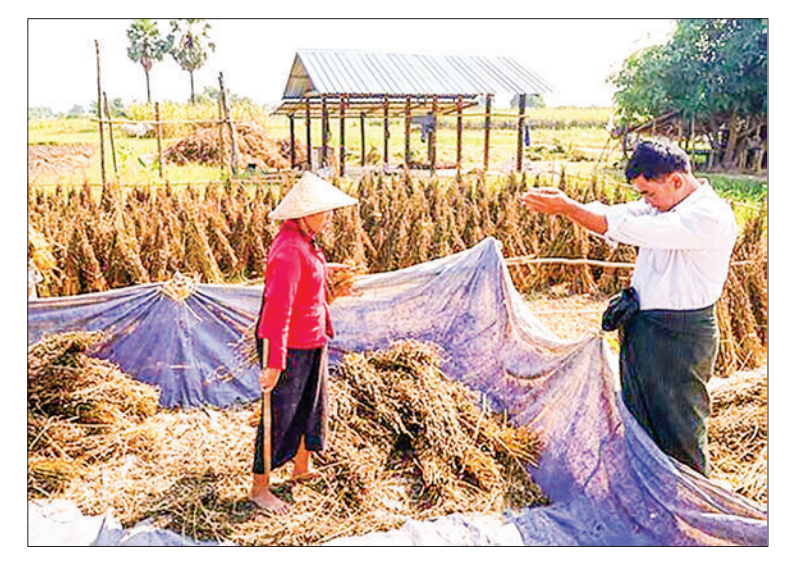
The State's economic fund will provide seeds for these 70 acres under the contract farming of the Department of Agriculture.

them by providing technology and inputs for 70 acres in Zalun," said an official from the Ministry of Agriculture, Livestock and Irrigation. In the domestic market during this week, the price of black sesame (Samone) is stable at K350,000-K390,000 per 45 visses, while those of white sesame (ordinary), white sesame (Japan) and brown sesame are K360,000-K380,000, K400,000-K405,000 and K310,000-K315,000 respectively, with a decrease of K5,000-K10,000 per bag, according to Mandalay wholesalers. - Thit Taw/ZN