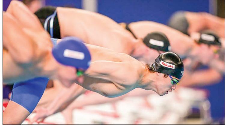
Pan Zhanle (C) of Team China competes during the men's 4X100m freestyle relay final of swimming event at the World Aquatics Championships 2024 in Doha, Qatar, 11 Febuuary 2024.

As such, Yangon United and Rakhine United, under the leadership of foreign head coaches, will take part in the forthcoming MNL, while other clubs will be under national head coaches. — Shine Htet Zaw/KZL