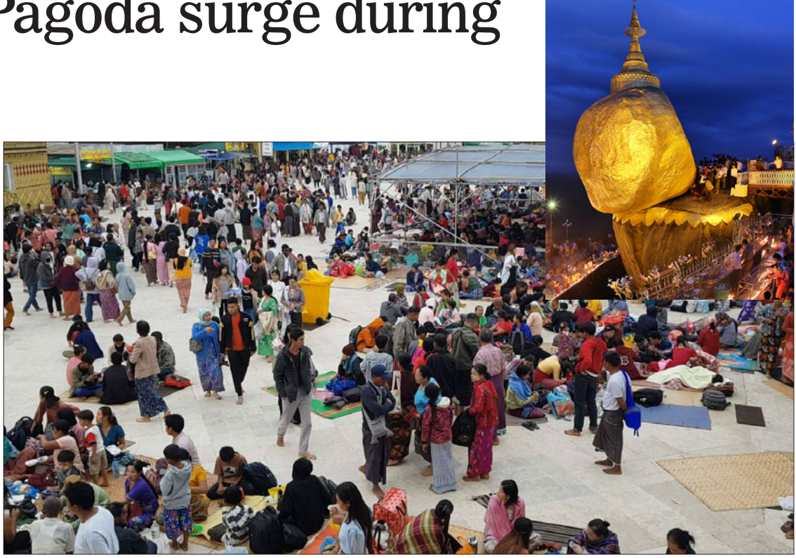
The photo shows some pilgrims visiting the Kyaiktiyo Pagoda.

The Buddha Pujaniya Festival at Kyaiktiyo Pagoda is typically usually held from the full moon day of Thadingyut to the Kason full moon day, with the pagoda open to the public every day. — ASH/MKKS