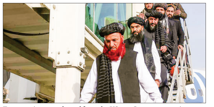
Two ex-prisoners released from the US-run Guantanamo prison get off a plane in Kabul, Afghanistan, 12 February 2024.

The Huthis, part of the anti-Western, anti-Israel "axis of resistance" of Iranbacked groups, have been targeting Red Sea shipping vessels since November, triggering US and British reprisal attacks. — AFP