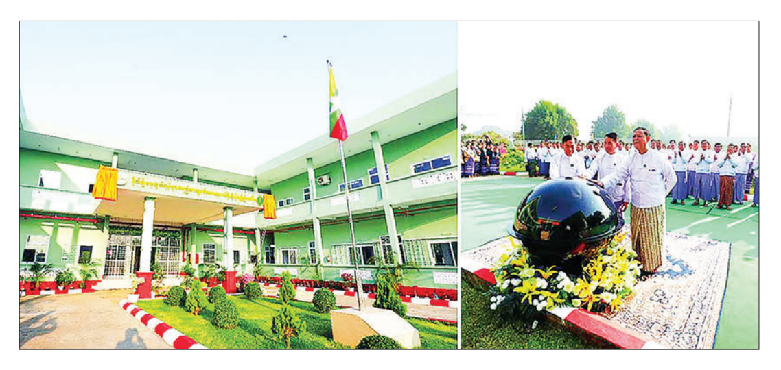
The opening ceremony of the agricultural quality control laboratory on 11 February honouring the 77th Anniversary of Union Day.

THE Department of Agriculture, under the Ministry of Agriculture, Livestock, and