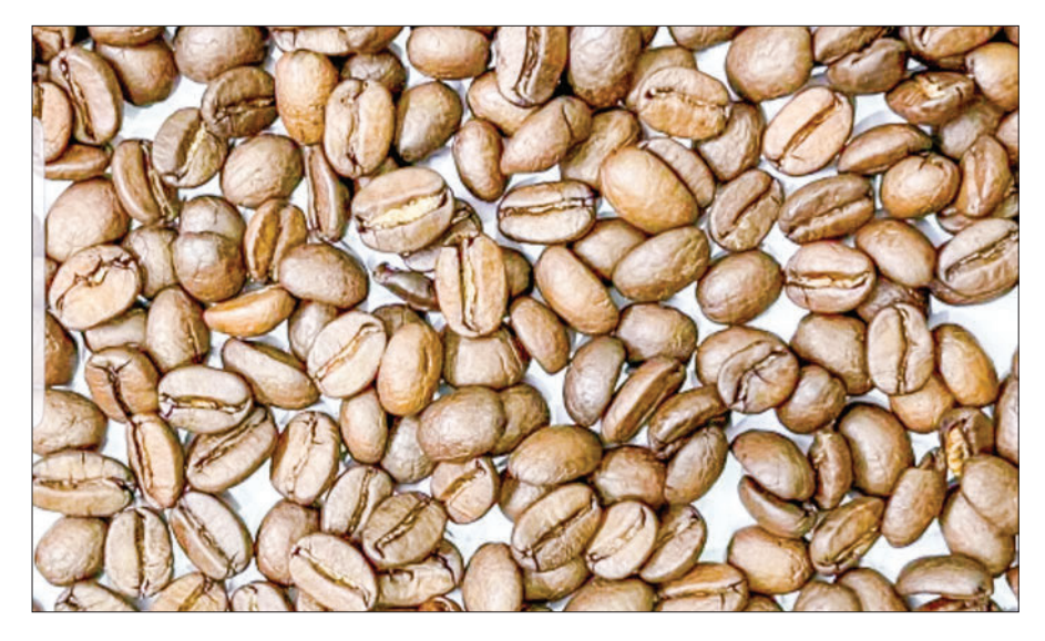
Coffee beans from PyinOoLwin.

THE Myanmar Coffee Association (MCA) MCG's factory in PyinOoLwin will share