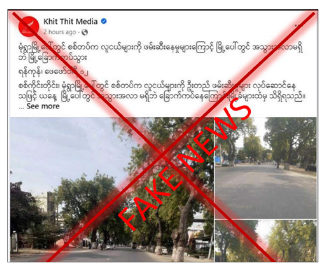
Screenshot validates the spreading of false news.

MALICIOUS media outlets are disseminating false reports claiming that Tatmadaw arrested over 40 youths in Monywa, Sagaing Region, on the evening of 11 February, causing fear and empty streets.