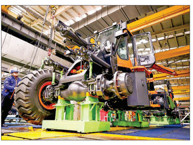
An employee works at a wheel loader assembly line of a Develon subsidiary in Yantai, east China's Shandong Province, 26 December 2023.

In the next stage, China will expand domestic demand, stimulate the vitality of various business entities, promote self-reliance in high-level science and technology and accelerate the development of a