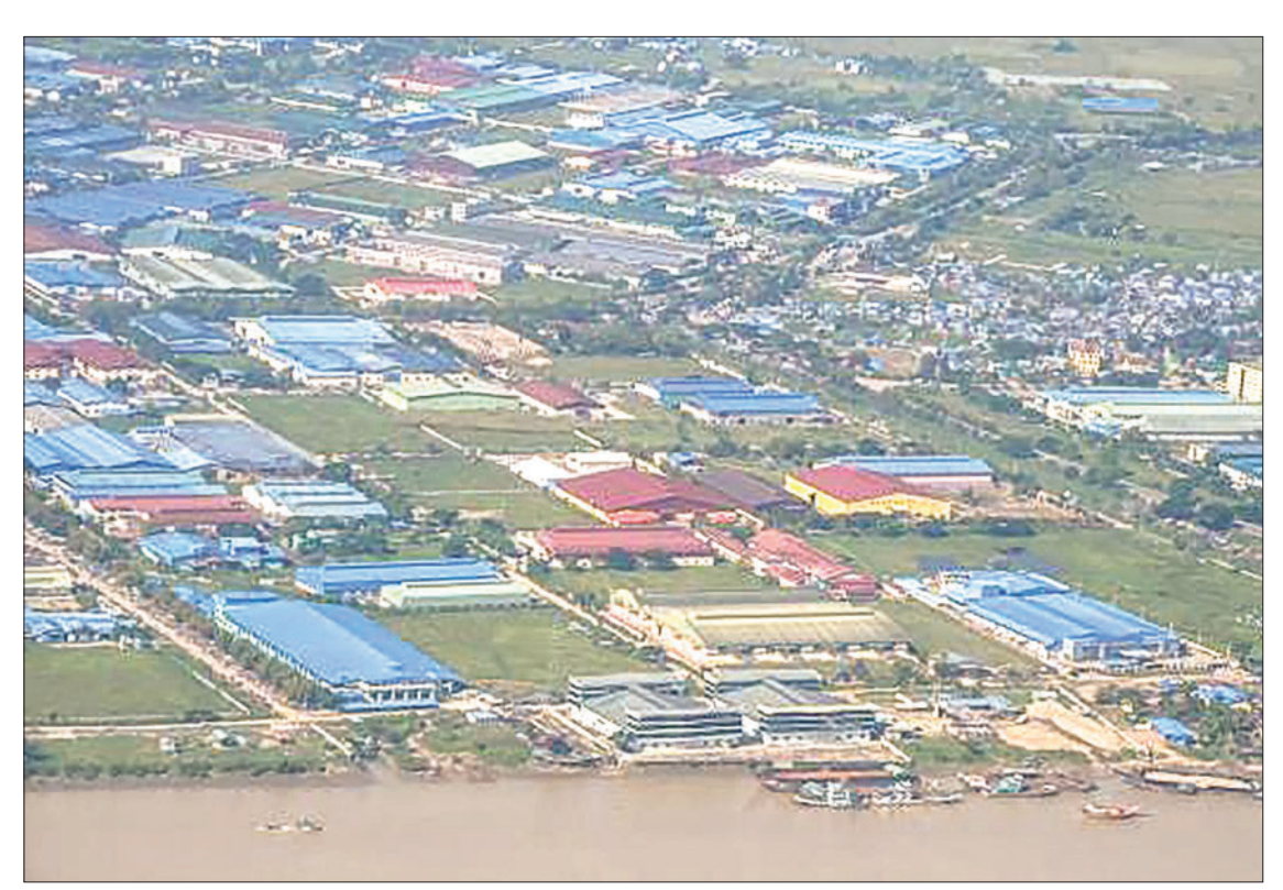
The Shwepyitha Industrial Zone operating with foreign investments.

During the same period, 74 Myanmar national businesses were given the green light to expand their investments across nine sectors, amounting to K1,295.254 billion. K876 billion was earmarked for the industrial sector, K169.843 billion for the electricity sector, and K117.05 billion for the livestock and fishery sector. — ASH/ TMT