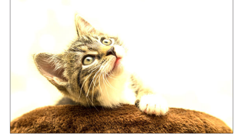
Pets might carry fleas into the home, which then bite humans.

Different vegetables have different medicinal phytonutrients with different therapeutic properties, so eating varieties of vegetables in combination is preferred. A proper diet is a reliable and better way to prevent and treat cancer.