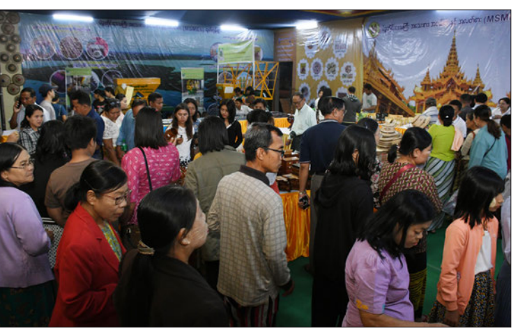
Visitors throng the MSME products show and traditional food sale.

Ko Wai Yan, from Tatkon, said, "We can explore the culture, tradition, local products of ethnic people and well-known places in a single place. I have never seen such dances and costumes of ethnic people before, and I have