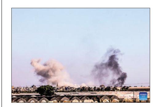
Smoke rises after an Israeli strike in the southern Gaza Strip city of Khan Younis, on 11 February 2024.