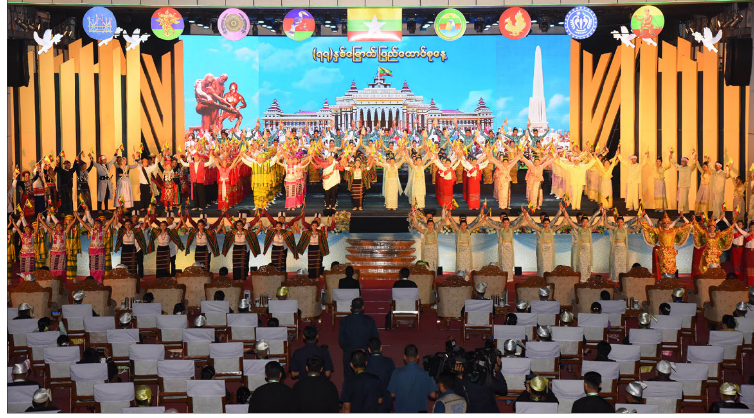
The Senior General, his wife and dignitaries watch the performance presented by the ethnic traditional cultural troupes yesterday in Nay Pyi Taw.

The dinner was also attended by the SAC Secretary and wife, the Joint Secretary and wife, council members and their wives, members of the SAC Central Advisory Board, retired senior military officers, union ministers, union-level dignitaries and their wives, the Nay Pyi Taw Council chairman, senior military officers from the Office of the Commander-in-Chief and their wives, advisers to the SAC Chairman, the commander of Nay Pyi Taw Command, deputy