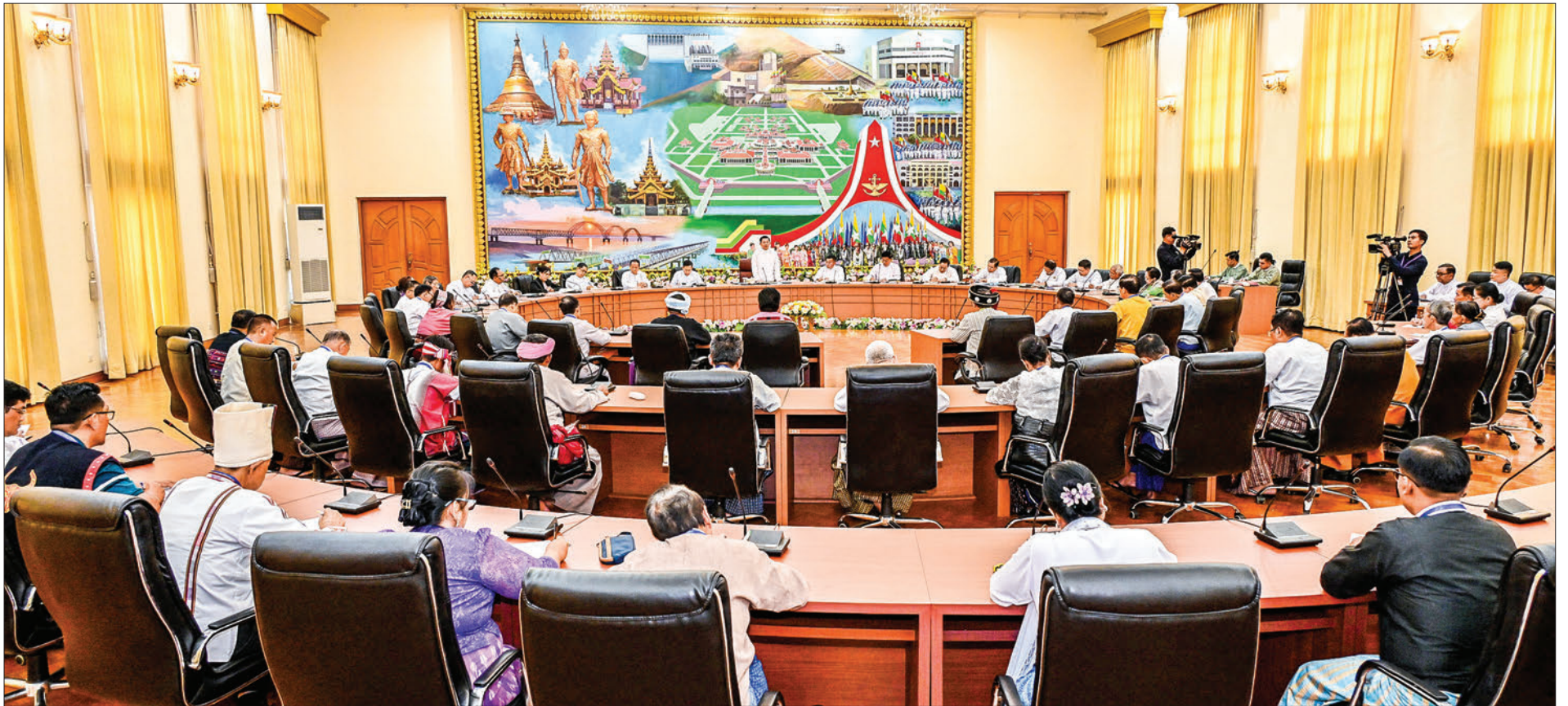
State Administration Council Chairman Prime Minister Senior General Min Aung Hlaing holds talks with officials from registered political parties yesterday in Nay Pyi Taw.