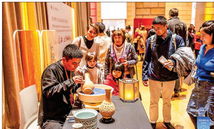
A Chinese artisan demonstrates porcelain making at the Philadelphia Museum of Art Lunar New Year Festival in Philadelphia, the United States, on 11 February 2024. The Philadelphia Museum of Art hosted a day-long immersive Lunar New Year Festival full of hands-on activities exploring Chinese culture on Sunday.

"I think having the craftsmen to come all the way from China and perform things that you don't usually get to see is very attractive. And the event was very popular," she said. — Xinhua