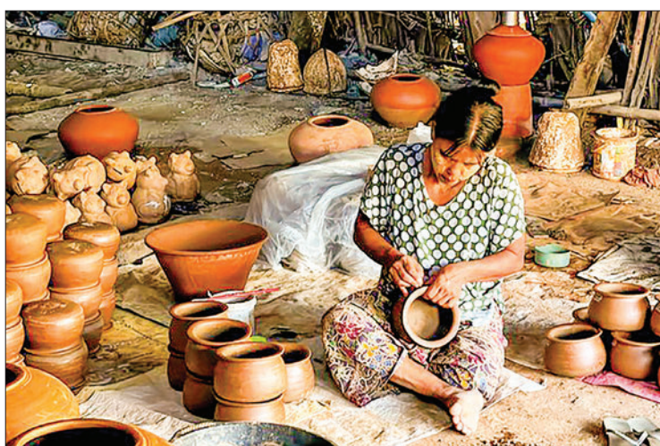
(L&R): Photos depict pots produced by Twantay Township and a female pottery artisan dedicatedly passionate about her craft.

In 2000, with assistance from UNICEF, a project to