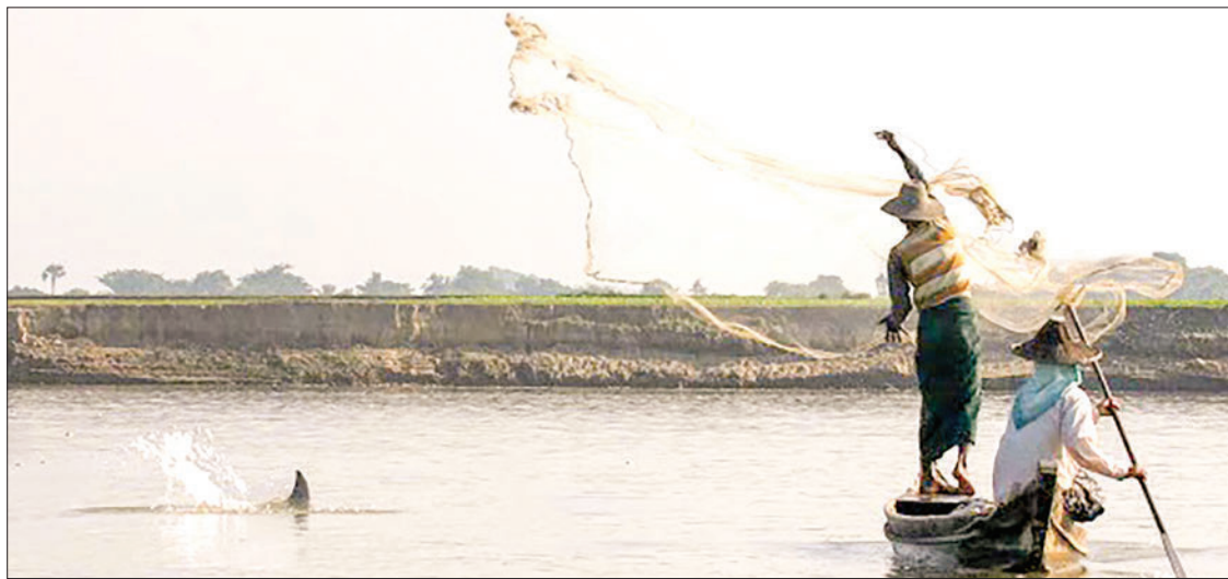
The artisan net fishing of fishermen being assisted by Irrawaddy dolphins.

It is noted that many visitors are attracted to observe the net-fishing practices of fishermen collaborating with dolphins in the Mandalay-Kyaukmyaung area, particularly during the low water period of the Ayeyawady River,