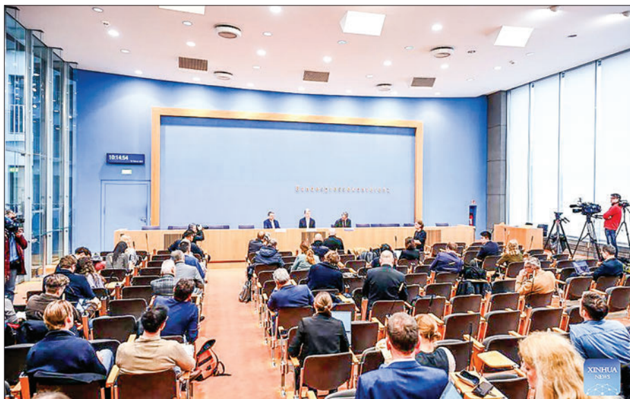
The Munich Security Report 2024 is released in Berlin on 12 February 2024. The Munich Security Report 2024 published ahead of this year’s Munich Security Conference expressed worries over the “lose-lose dynamics” amid growing geopolitical tensions and rising economic uncertainty.

AN annual report published ahead of this year’s Munich Security Conference expressed worries over the “lose-lose dynamics” amid growing geopolitical tensions and rising economic uncertainty.