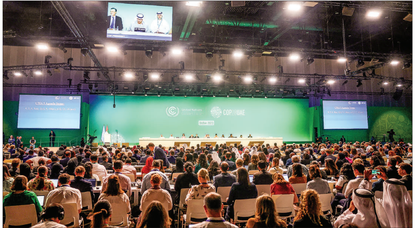
Participants attend a COP28 plenary session at the United Nations climate summit in Dubai on 13 December 2023.