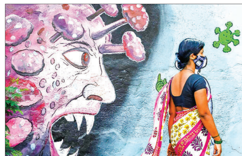
Recent studies, such as one analyzing blood proteins of over 110 long Covid patients, are providing valuable clues to understand the mechanisms behind this condition and why it persists in some individuals.

(To my beloved son and other children who play internet games every day)