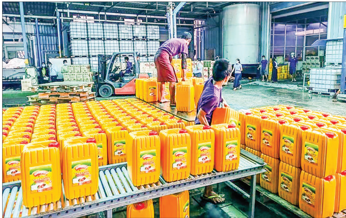
Workers seen organizing jerrycans of cooking oil for distribution and sale.

Nevertheless, the market price is way higher than the reference price.