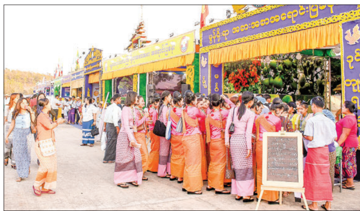
Crowds of visitors are seen at the show and food fair yesterday.

The business people from MSME sectors and those who run manageable MSME businesses also visited the show, and the relevant officials explained the information to develop the MSMEs, the challeng-