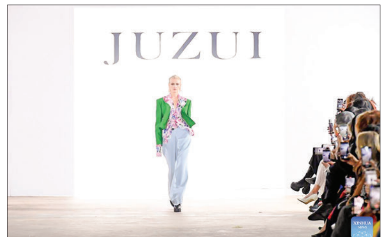
A model presents a creation of JUZUI during the New York Fashion Week 2024 in New York, the United States, on 11 February 2024. Chinese brand JUZUI on Sunday staged its runway show at the New York Fashion Week by drawing inspiration from blossoming peony, a flower rooted in the East.

"It's always better to be person-to-person. Otherwise, you don't get the right picture, unless you can meet the people and explore with them and become friends," Musk added. — Xinhua