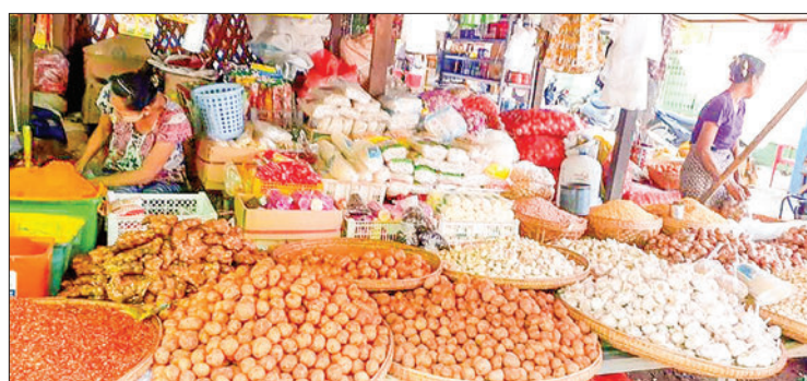
A retail dry groceries outlet.

The wholesale prices of chilli peppers were registered at K9,500-K11,500 per viss for long chilli pepper and Mohtaung va-