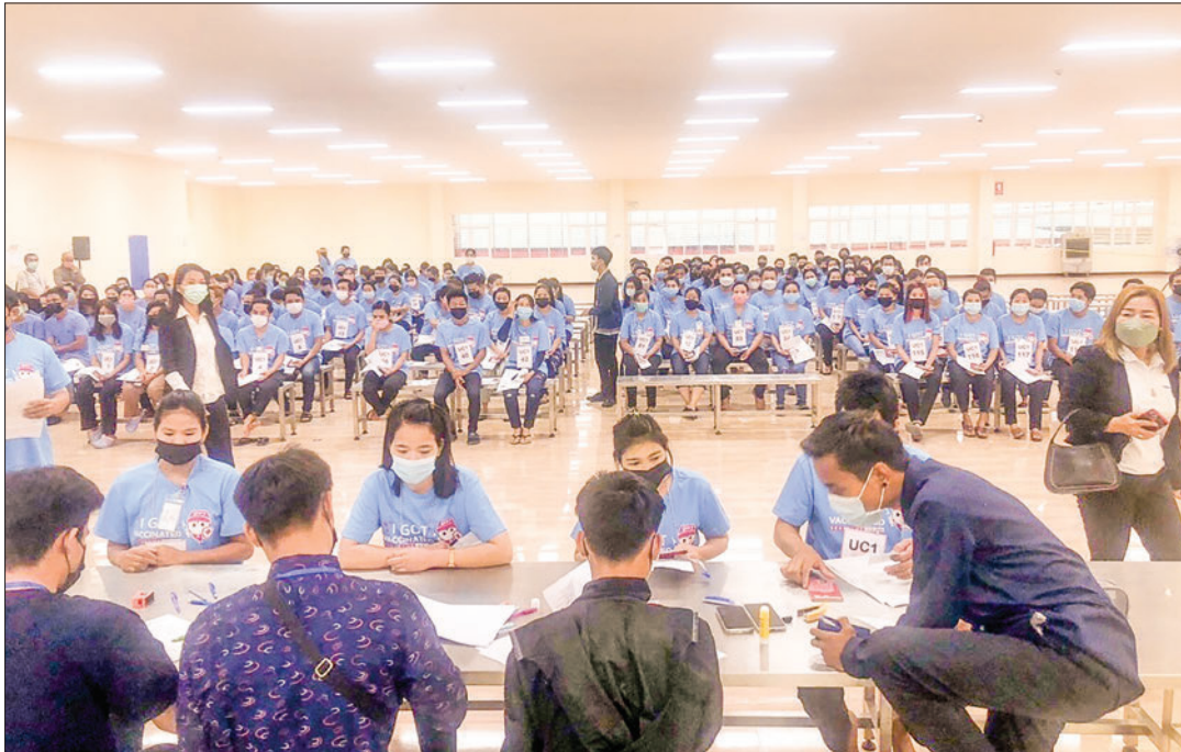
The queue seen to wait for passports in the hall.

ON 12 February, the Myanmar embassy in Thailand announced that a Mobile Team would assist Myanmar workers holding Certificates of Identity (CIs) in obtaining passports.