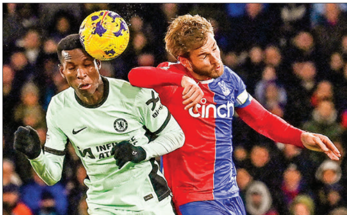
Chelsea's Senegalese striker (15) Nicolas Jackson (L) fails to get this header on target under pressure from Crystal Palace's Danish defender (16) Joachim Andersen (R) during the English Premier League football match between Crystal Palace and Chelsea at Selhurst Park in south London on 12 February 2024.

The home side were decimated by key injuries with all three of their star players Eberechi Eze, Michael Olise and Marc Guehi ruled out. Hodgson and the club's board are under attack from the fans and banners held up before kick-off took aim at a "weak club culture" and "weak transfer policy". — AFP