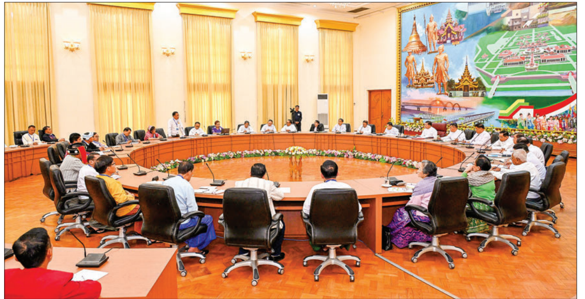
The discussions are underway at the yesterday's meeting between the Senior General and representatives from registered political parties in Nay Pyi Taw.

Chairpersons, vice-chairpersons and officials from political parties discussed participation in ensuring peace and stability of the nation, necessary measures for holding an election, and cooperation in social,