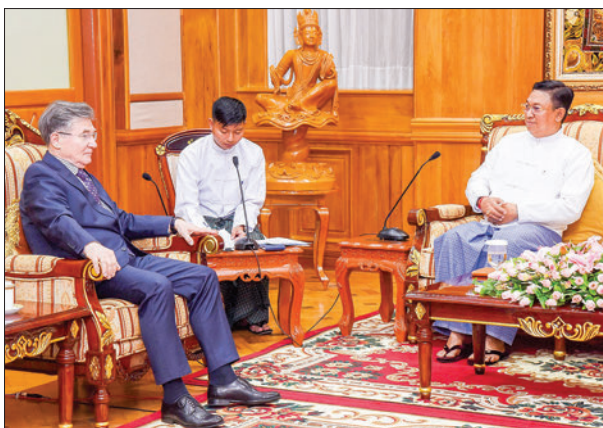
The ambassador of the Russian Federation calls on Union Minister Admiral Moe Aung yesterday.

ADMIRAL Moe Aung, National Security Adviser and Union Minister for the Ministry 4 at the SAC Chairman's Office, met with a delegation led by Mr Iskander Azizov, Ambassador of the Russian Federation to Myanmar, at the State Administration Council office in Nay Pyi Taw yesterday afternoon.