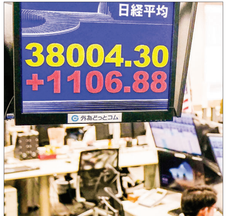
A financial data screen in Tokyo shows the Nikkei Stock Average briefly trading above the 38,000 line on 13 February 2024.

Analysts said the market was lifted by participants returning to Tokyo markets after an extended weekend in which domestic firms' favourable quarterly earnings reports lifted optimism, while the US Dow Jones index hit a new all-time high and European shares gained. — Kyodo