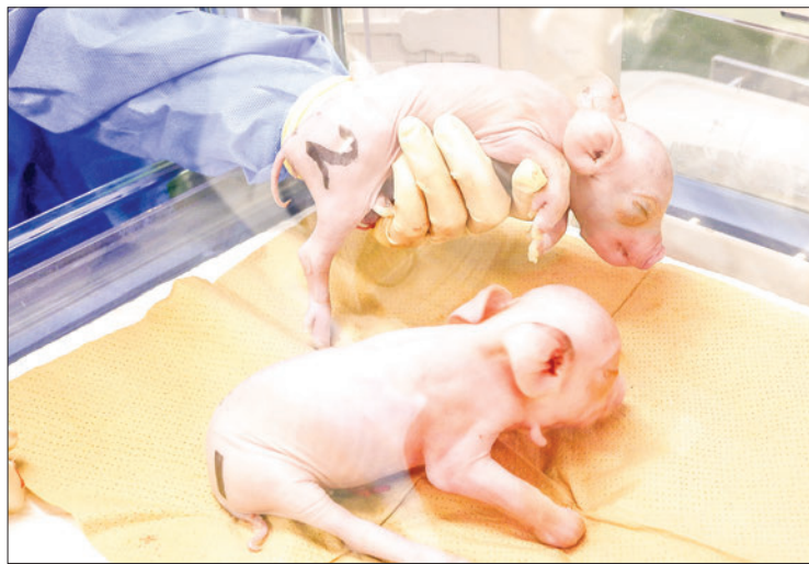
The photo taken on 11 February 2024 at an undisclosed location shows genetically modified piglets bred for human organ and cell transplants by a team led by Japanese venture PorMedTec Co

The team including members from US biotechnology