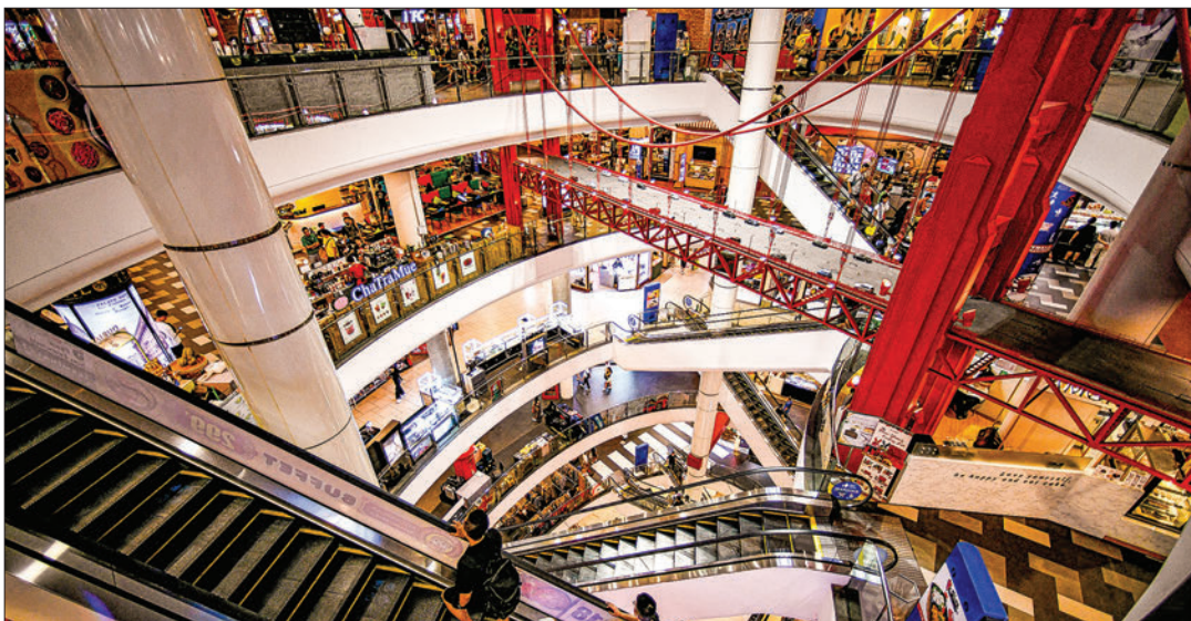
People take escalators and walk inside Terminal 21 shopping mall in Bangkok on 21 January 2024.

The January figure was attributed to the government's stimulus measures, notably the income tax deduction and energy and gasoline price cuts, along with rebounding foreign tourist arrivals, the UTCC said in a statement. — Xinhua