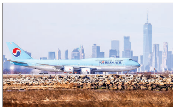
A Boeing 747 passenger aircraft of Korean Air airlines prepares to take off to Seoul at JFK International Airport in New York as the Manhattan skyline looms in the background on 7 February 2024.

The commission also had concerns on the merger's impact on cargo transport services between all of Europe and South Korea. — AFP