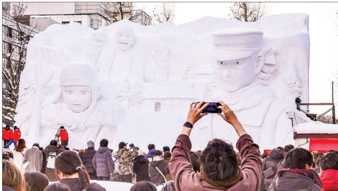
The photo taken on 11 February 2024 shows large snow sculpture of characters from popular anime series Golden Kamuy. (Copyright Satoru Noda/Shueisha, Golden Kamuy Project)

THE Sapporo Snow Festival drew 2.39 million visitors through Sunday, with an organizer saying attendance has recovered to pre-pandemic levels after the removal of coronavirus measures.