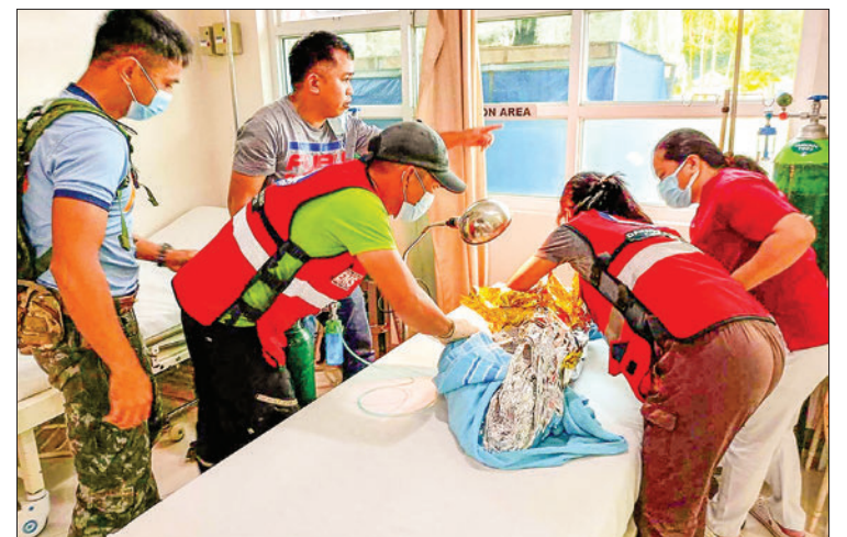
This handout photo taken and released on 9 February 2024 by the Philippine Red Cross shows rescuers provide medical attention to a child at the Doctors Community Hospital in Mawab, Davao de Oro, following her rescue nearly 60 hours after a landslide hit a gold-mining village in the southern Philippines.

tions outside the main building and then spread “throughout the building”. Images from Monday showed exploding fireballs, as flames and several blasts tore up a water slide and a pall of black smoke rose over the city. “There is no smoke development now that affects the surroundings, but there are still flames and smouldering fires in parts of the building structure,” rescue services said in a statement Tuesday. — AFP