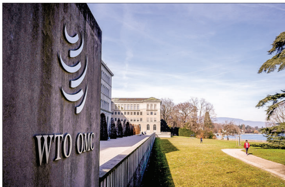
A picture taken in Geneva on 5 February 2024 shows the logo of the intergovernmental World Trade Organization (WTO) at its headquarters. The world's trade ministers could put the final touches to a historic fisheries deal when they meet in Abu Dhabi later this month, but other landmark agreements will likely prove more elusive.

But ahead of the WTO's 13 th ministerial conference (MC13), set