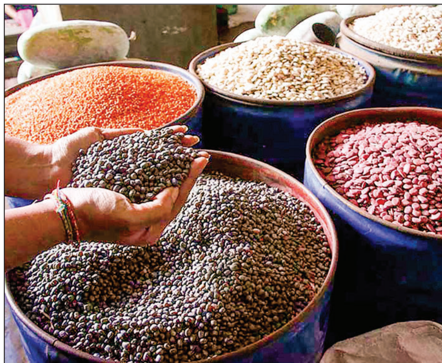
A purchaser is observing the quality of black grams at a beans and pulses outlet.

THE prices of black grams and pigeon peas fell again in the domestic market as the FOB price dropped and foreign demand faltered.