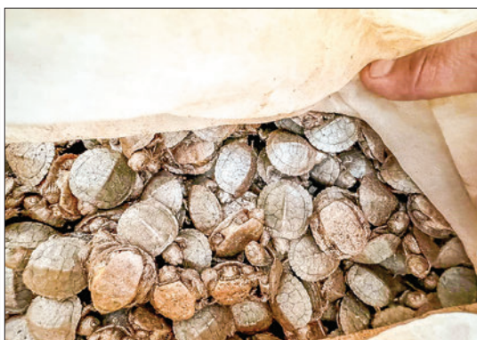
Confiscated illegal commodities and vehicles.