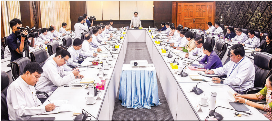
Deputy Prime Minister Union Minister for Foreign Affairs U Than Swe holds talks with ambassadors and charges d'affaires yesterday.

DEPUTY Prime Minister and Union Minister for Foreign Affairs U Than Swe met the ambassadors and 19 chargés d'affaires who were temporarily brought back to Myanmar to attend the head of state's lecture, along with four ambassadors departing for their respective postings, at the Ministry of Foreign Affairs office yesterday.