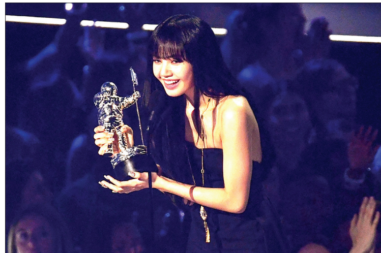
Thai singer Lisa from the group BLACKPINK accepts the Best K-pop award for 'Lalisa' during the MTV Video Music Awards at the Prudential Centre in Newark, New Jersey on 28 August 2022.

A dark, stylish satire on wealth and hypocrisy, "The White Lotus" has been a commercial and critical hit for HBO, with both previous seasons garnering multiple Emmy nominations.