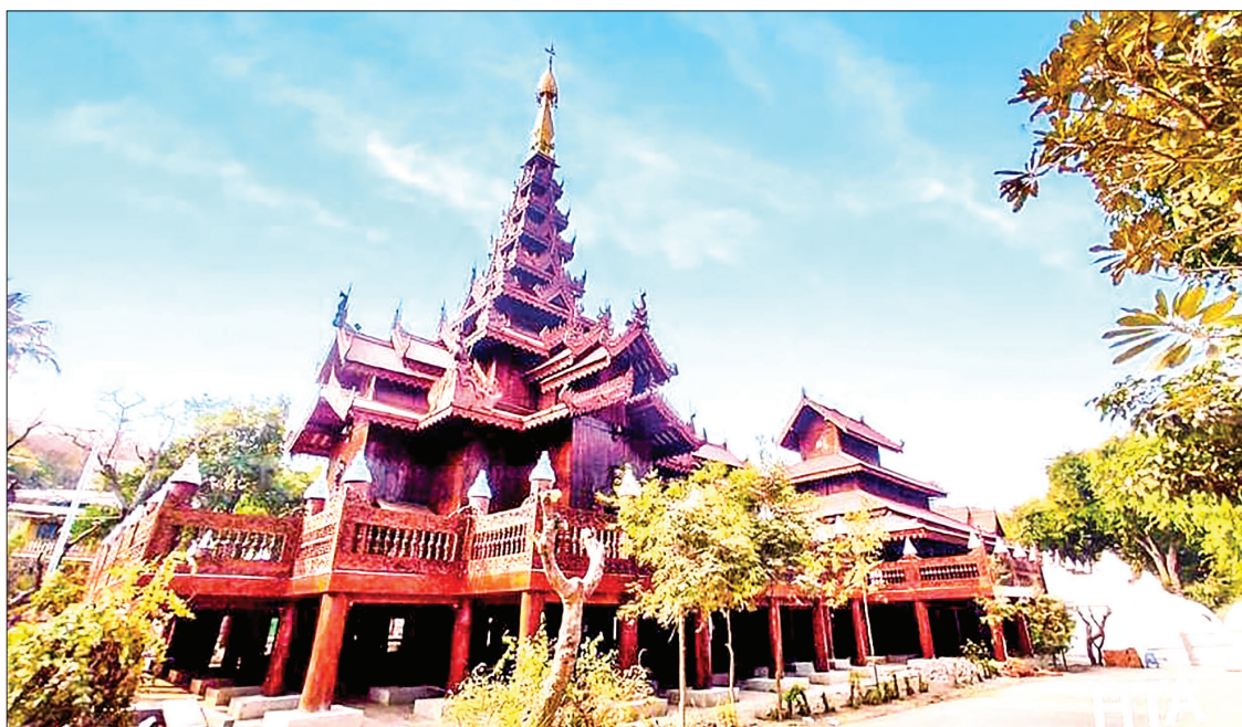
The photo depicts the general view of the Kyun Kyaung (teak monastery) in Mandalay.

"After this monastery was built, it was donated to the first founder Sayadaw of Shwegyin Sect along with the land. For the Shwegyin Sect, this place is its original auspicious ground.