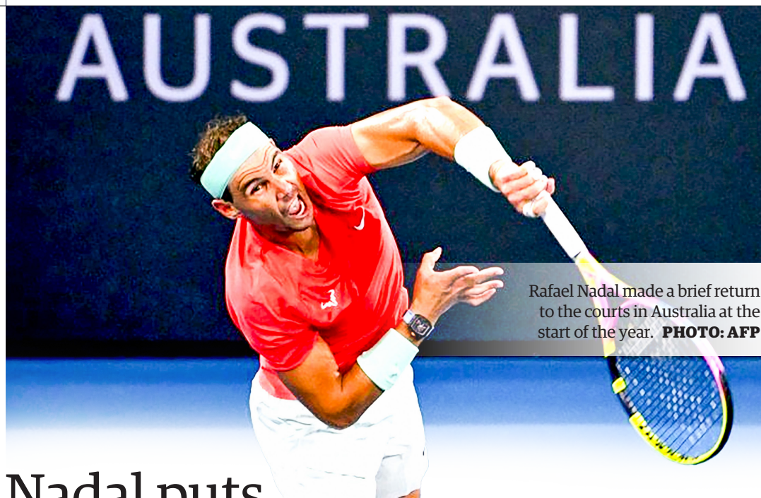
Rafael Nadal made a brief return to the courts in Australia at the start of the year.