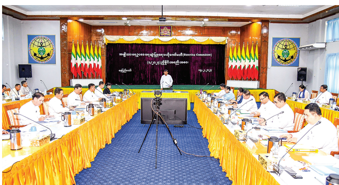
SAC Member Deputy Prime Minister Union Transport and Communications Minister General Mya Tun Oo chairs the 1/2024 meeting of the National Water Law Drafting Steering Committee yesterday.

The General highlighted the formation of National Level Water Resources Committee in 2013 as a drive for drafting