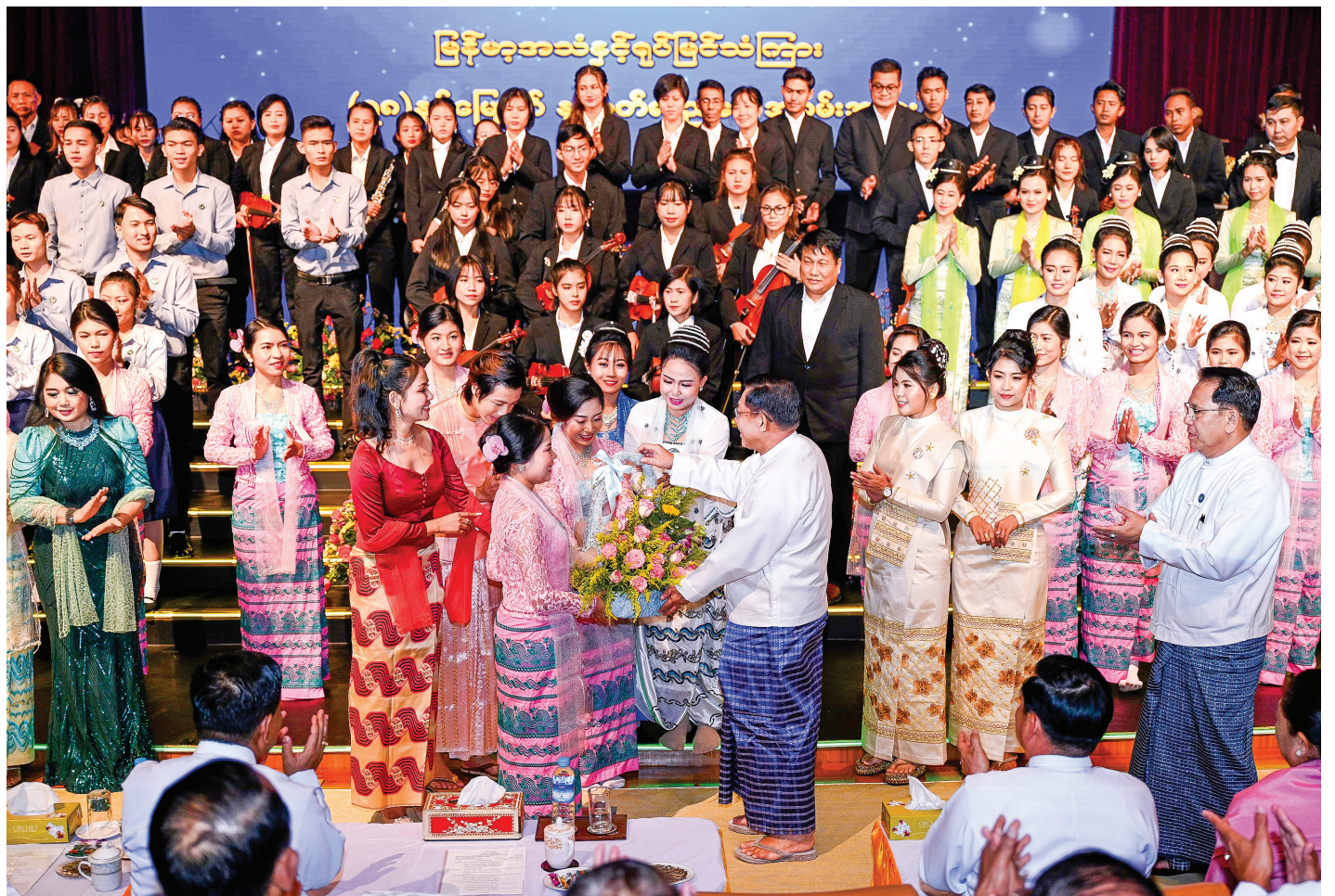
State Administration Council Chairman Prime Minister Senior General Min Aung Hlaing presents prizes and cash awards to the MRTV staff yesterday in Nay Pyi Taw.

Speaking on the occasion, the Senior General said that MRTV is striving to initiate a modern State media due to the reform process conducted by the