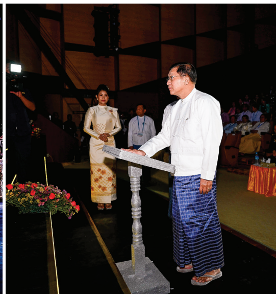
The Senior General presses the button to launch the broadcasting of 19 TV channels and upgrading 11 channels yesterday.

Sports channels, MITV channel, Myanmar Radio, Thabye Radio, and 17 ethnic language radio programmes.