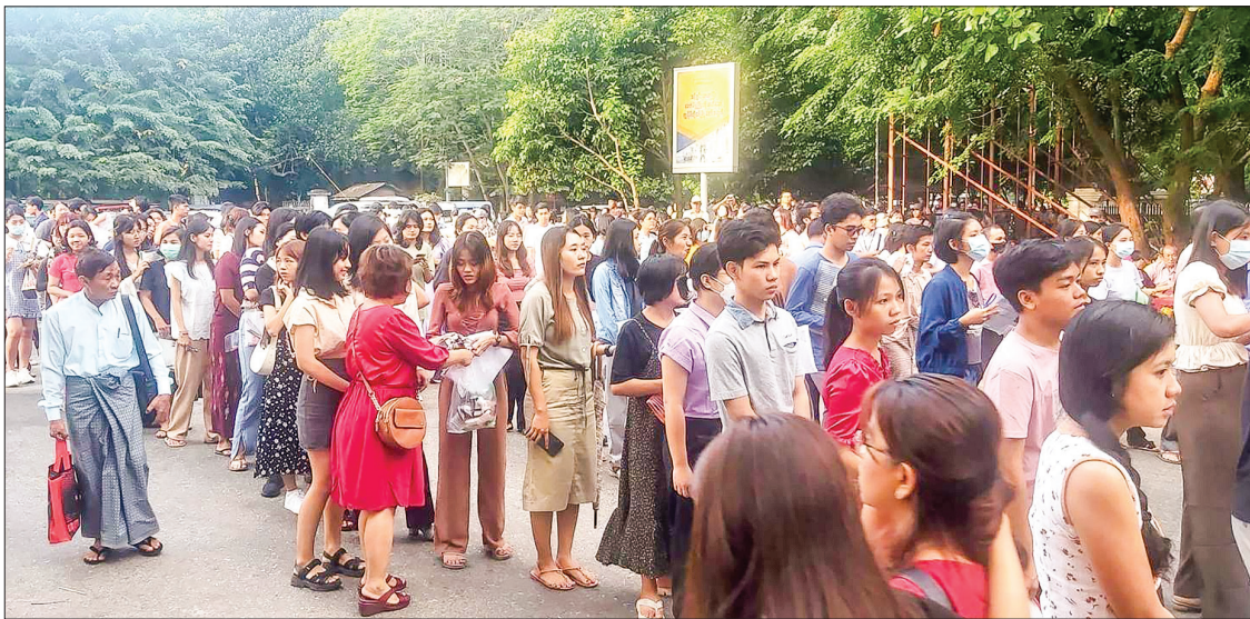
The photo shows exam candidates who sat the JLPT on 3 December 2023.

THE Myanmar Association of Japan Alumni (MAJA) has announced that application forms for the Japanese Language Proficiency Test (JLPT), scheduled for the first week of July, will be available starting on 29 February. The exam will be conducted