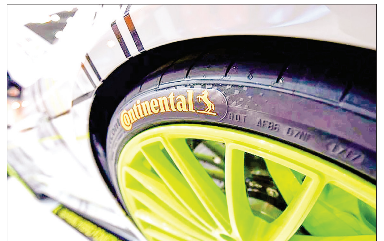
Germany's auto suppliers have been facing problems as the transition to electric mobility gathers pace, after decades relying on fossil fuel vehicles for their profits. PHOTO: AFP/FILE

The cuts would allow Continental to "focus our resources even more on future technologies for software-defined vehicles", von Hirschheydt said. — AFP