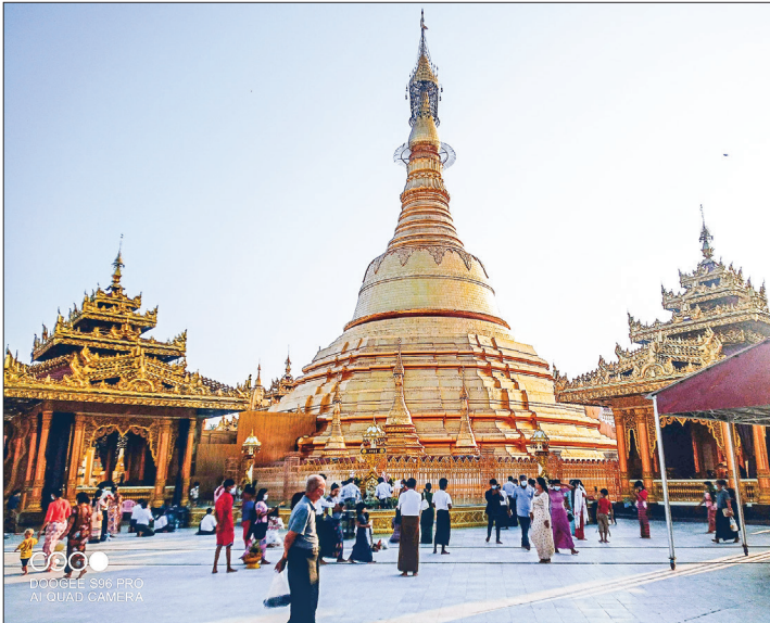
Myanmar's traditional Htamane-making festival and competition were held at the Botahtaung Pagoda in the previous year.