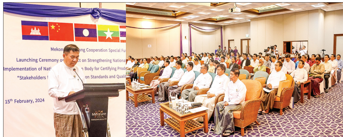
The project to strengthen national quality infrastructure and certification on body underway yesterday.

THE Project on Strengthening National Quality Infrastructure and Implementation of National Certification Body for Certifying Products, Processes, and Services, along with the Stakeholders Engagement Forum on Standards and Quality for Trade Facilitation and Industry Development, was formulated and led by the Department of Research and Innovation of the Ministry of Science and Technology under the Mekong-Lancang Cooperation Special Fund (2023). The event took place yesterday at Mercure Hotel in Yangon.