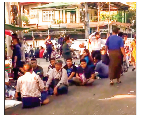
The photo shows people waiting to apply for visas outside the Thai Embassy in Yangon on 15 February 2024.

Applicants can obtain the necessary information by scanning the embassy's QR code. Incomplete appli-