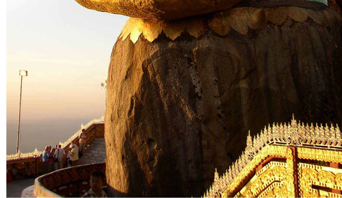
Constructed in 574 BC, Kyaiktiyo Pagoda is one of the world's most important pilgrimage sites for Buddhists and the third most important pilgrimage site in Myanmar after Shwedagon Pagoda in Yangon and the Mahamuni Pagoda in Mandalay.

enshrined in the complex with its magnificent weight perfectly balanced on the edge of a cliff. The Golden Rock is truly a natural and extraordinary sight, which is why it is regarded with such sacred astonishment. The scenery from the Golden Rock is a spectacular sight, and many visitors stay behind the Rock to watch the sunset. The Kyaiktiyo shrine complex consists of several viewing platforms, pagodas, and Buddha shrines. Devotees gather in the area behind the Rock to pray and make offerings, and almost everyone attaches a golden leaf to the Rock as an act of merit. A glimpse of the fascinating Golden Rock is believed to be enough to inspire and enlighten any person to turn to Buddhism. Also, according to legend, pilgrims who