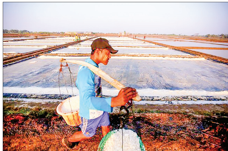
File photo by Xinhua shows a farmer works in salt beds at Panga Village, Thanbyuzayat Township, Mon State.

"The salt price fluctuates depending on supply and demand. Salt manufacturing needs to rely on the weather, so the price gets high if the yield is low when it rains. There was rain in January so the price climbs up about K10-K20 a viss," he said. The export licence is still underway for exporting Mon State-produced sun-dried salt to Japan and South Korea. — MT/ZS