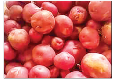
Red potatoes from Kachin State

The wholesale price per viss of mixed small and big-sized red potatoes is from K2,500 to K2,700 while the price per viss of small-sized red potatoes is around K2,500 and big-sized red potatoes is around K3,000, according to Mohnyin red potato market. — Thit Taw/ZS