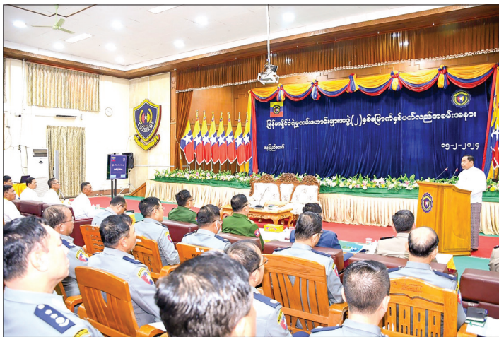
The 2 nd Anniversary of the Myanmar Police Veteran Organization celebration in progress yesterday.

He also urged the police veterans to cooperate to achieve the organization's