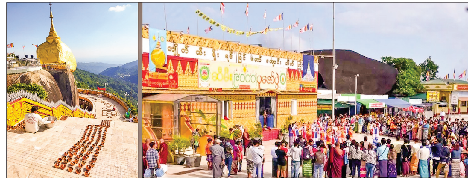
The photo shows the ceremony of offering 9,000 oil lamps to Kyaiktiyo Pagoda