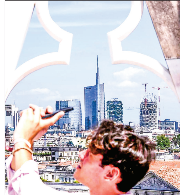
A tourist takes photos on the terrace of Duomo di Milano in Milan, Italy, on 6 August 2021.