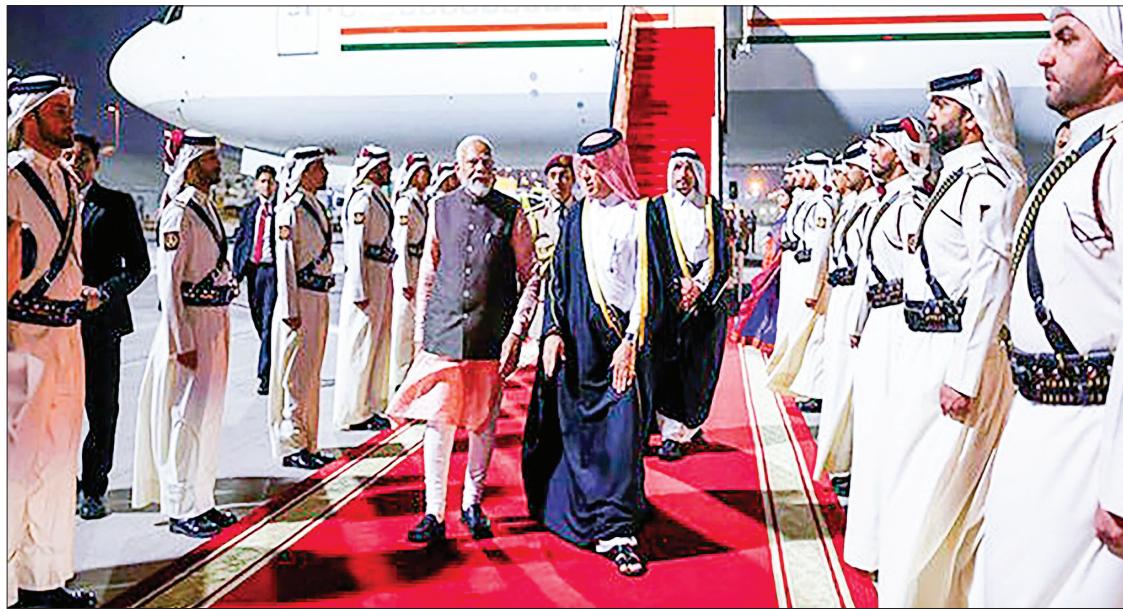
Prime Minister Narendra Modi arrived in Doha, Qatar, for a two-day official visit on 14-15 February.

During his visit, PM Modi will meet Qatar's Amir Sheikh Tamim bin Hamad Al Thani. Earlier, PM Modi met Qatar's Amir Sheikh Tamim bin Hamad Al Thani on the sidelines of the COP28 summit in Dubai and discussed bilateral partnership and the "well-being of the Indian community" living in Qatar.