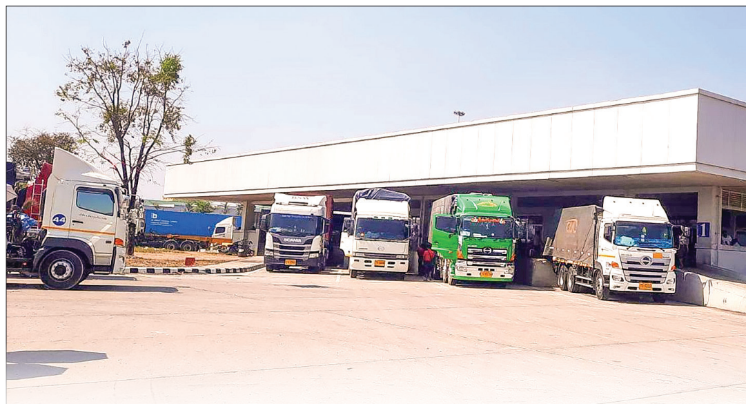
Lorries prepare for export cargoes on the Myanmar-Thailand border.

The non-premium rice prices moved between K74,000 and K93,000 per sack depending on varieties (rice grown under the intercropping system, Ngasein, Thipu and Aemahta) on 15 February in the wholesale depot. Premium Pawsan rice was worth K110,000-K135,000 per sack depending on the producing areas (Shwebo, Pathein, Myaungmya and Dedaye). — NN/KK