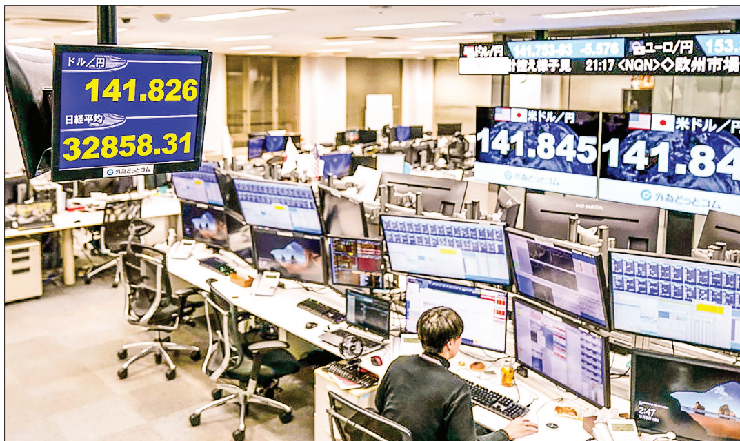
Photo taken in Tokyo on 8 December 2023, shows monitor screens displaying the Japanese yen trading in the 141 zone against the US dollar.

Kanda expressed concern over the yen's nearly 10 yen decline against the dollar in a month, negatively affecting the economy.