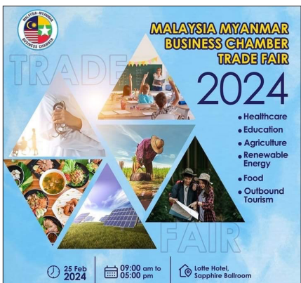
The Malaysia-Myanmar Business Chamber Trade Fair 2024 billboard.

THE Malaysia-Myanmar Business Chamber (MMBC) will organize the Malaysia-Myanmar Business Cham-