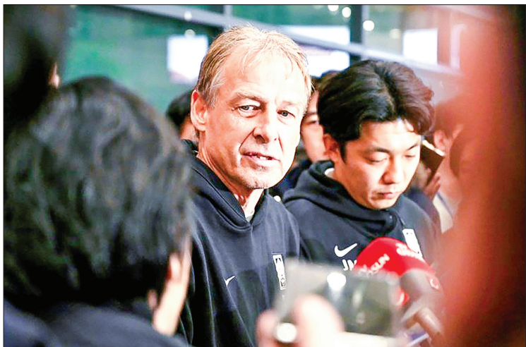
Jurgen Klinsmann's time as South Korea coach could be over.