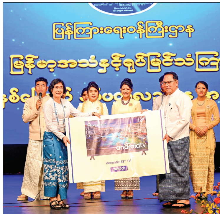
Union Minister U Maung Maung Ohn presents awards to the MRTV personnel yesterday.

The Union minister and the deputy minister then opened a lucky draw for the employees of Myanmar Radio and Television and awarded prizes. — MNA/KZL