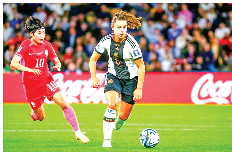
Germany midfielder Lena Oberdorf will join Bayern Munich from Wolfsburg in the summer.

Oberdorf has become a fixture of the German national team set-up, having played in the 2022 final against England at Wembley. She was named best young player at the tournament. — AFP