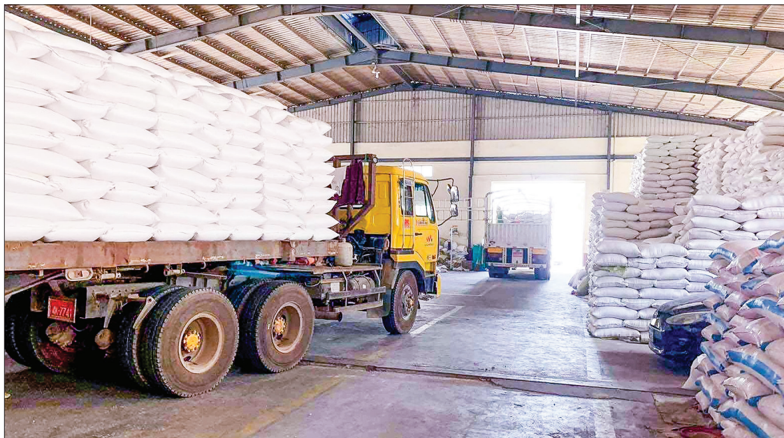
Rice bags are organized at the warehouse.

Under the leadership of the MRF, Myanmar Rice and Paddy Traders Association, export companies and depots are working together to stabilize the price and initiated the rice subsidy scheme starting from 16 February for the low-income people and civil servants to buy the rice at fairer prices at 58 retail shops in 18 townships, Yangon Region. The consumers can purchase reasonably well-milled (15 per cent broken) white rice at K3,300 per pyi (2.13 kg or 4.69 lb). An individual is entitled to buy two pyi at a time. This scheme can cover 18