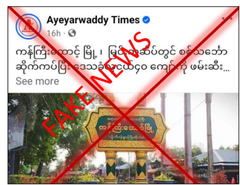
Screenshots validate false claims.