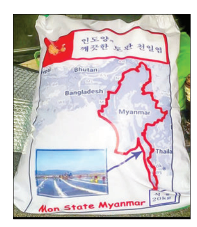
Photo shows a sack of salt exported to South Kores.

In Mon State, 92 salt farmers operate on 5,000 acres. To advance the salt industry, ef-