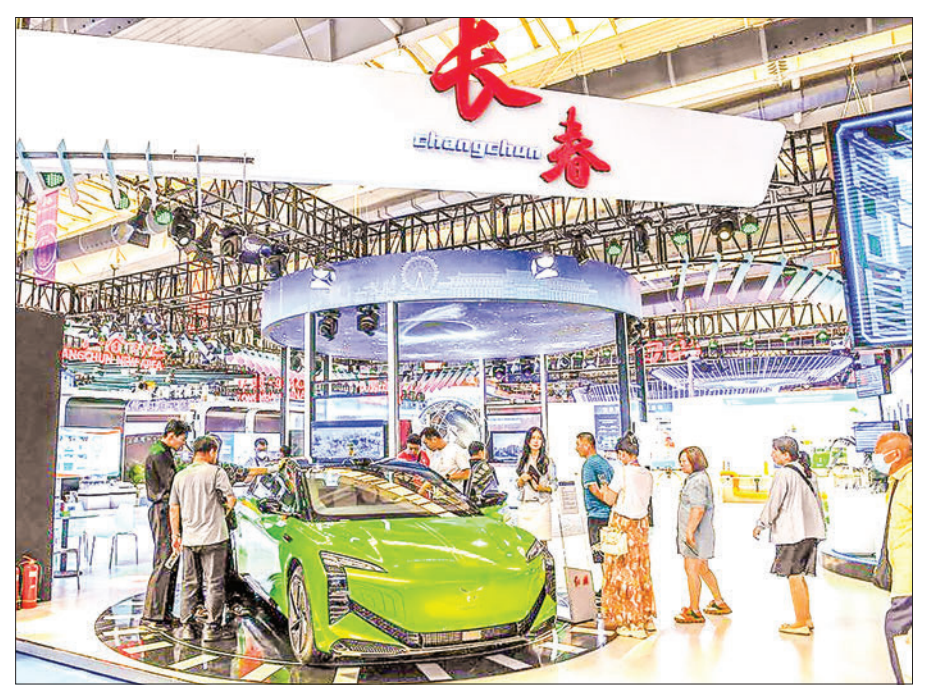
Visitors watch a new-energy car displayed by FAW Hongqi during the 14th China-Northeast Asia Expo in Changchun, northeast China's Jilin Province, 23 August 2023.

The NEV market has witnessed robust expansion in China over the past years thanks to the country's accelerated push for green development and a rapidly growing auto