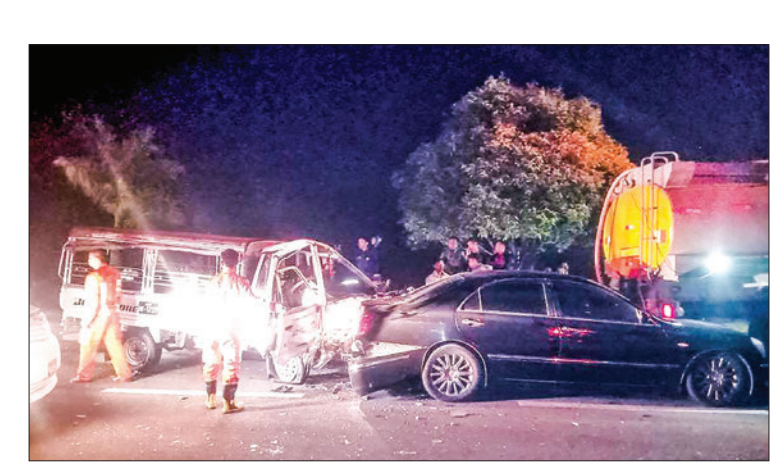
Traffic accidents on the roadside of Thanlwin Road in Pobbathiri Township, Zeyathiri District in Nay Pyi Taw on 14 January 2024.