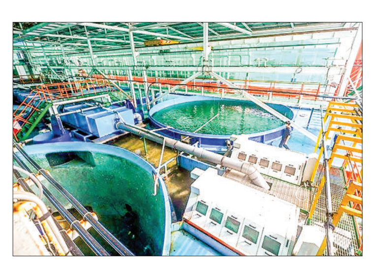
Fish tanks at Singapore's Eco Ark simulate ocean conditions that allow fish to swim against a current while shielding them from diseases.

A high-tech fish farm floats just off the coast of Singapore, part of a plan by a retired engineer who once built oil rigs to bring diners cleaner, healthier seafood.