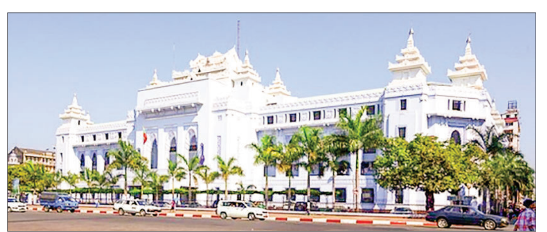
The photo shows Yangon City Hall where the YCDC is located.

The interested persons can buy the tender application forms until 28 February and have to submit them by 29 February. For further information, dial 01-8376708, 01-8377890 and 09-420144112 during the office hours. — TWA/ TMT