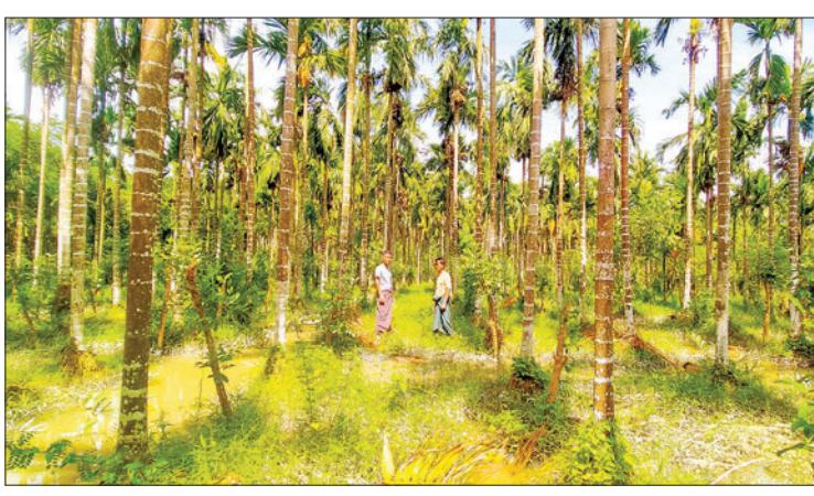
Farmers are seen in an areca nut farm.