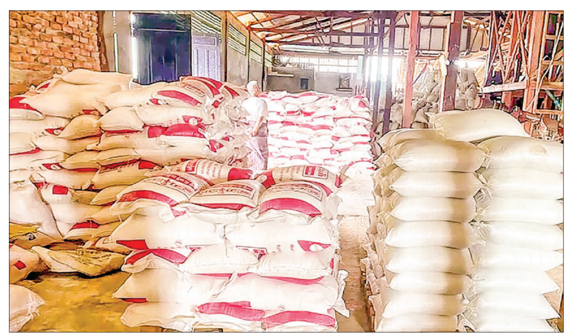
Photo shows sacks of salt in a warehouse in Mon State and they are ready for distributing across the country.

forts are underway to install modern machinery for producing fine iodized salt from coarse salt, as stated by U Win Htein, chairman of the Mon State Salt