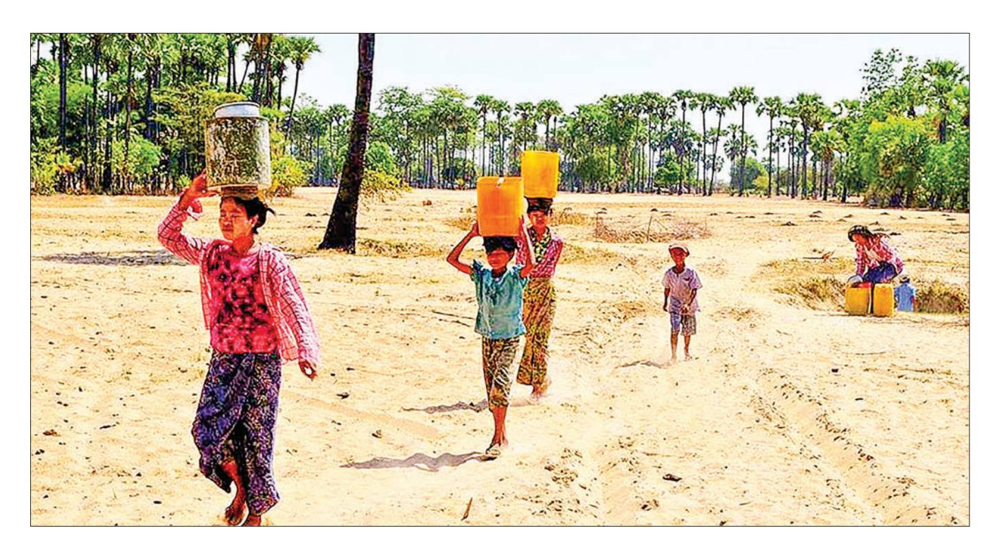
Some local people from Magway Region carrying drinking water last summer.

Furthermore, it is necessary for live-stock farmers to cultivate animal feed plants, and to ensure that the people in the region have enough meat, fish, milk, eggs, and vegetables to consume, and to raise high pedigree and productive animals in the livestock industry under the advice of livestock breeding experts in order to earn more income and improve the socio-economic life of the local people.—TWA/TKO