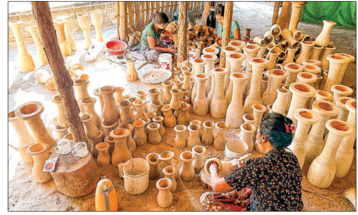
Skilled workers producing musical instruments applying woodturning techniques.

Additionally, the proprietor has a plan to modernize the craft while maintaining its cultural characteristics, so it