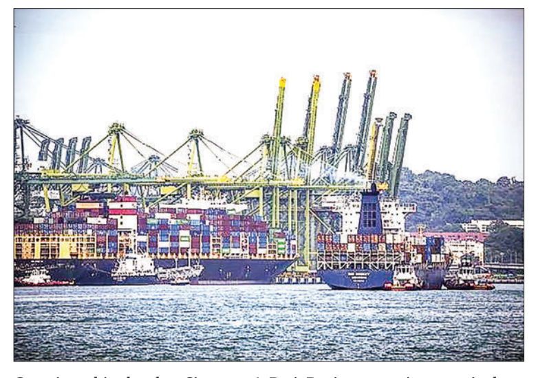
Container ships berth at Singapore's Pasir Panjang container terminal on 31 January 2024.

"Though expecting the situation to improve this year, there are still more uncertainties in the outlook," Wong said, noting that the budget bill will invest more to support households. —Xinhua