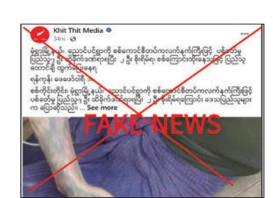
The screenshot validates the fake news about injured person attacked by Tatmadaw.

Likewise, another unfounded report alleged that a heavy weapon attack by the Tatmad-