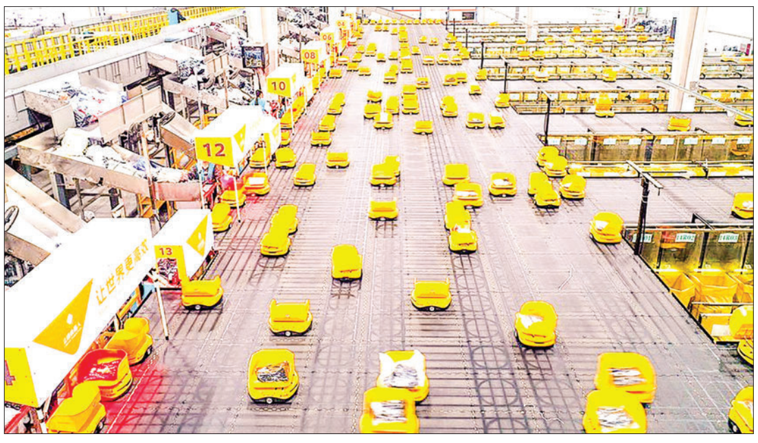
This aerial photo taken on 8 November 2023 shows robots sorting and conveying parcels at an intelligent logistics center in Deqing County, east China's Zhejiang Province.