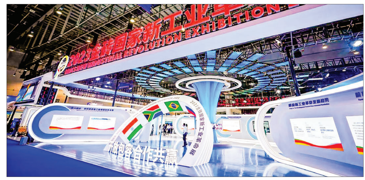
The 2023 BRICS New Industrial Revolution Exhibition focuses on the theme of "Deepening Partnership Cooperation, Promoting the New Industrialization of BRICS Countries", based on the high-end, intelligent, and green development of the manufacturing industry in BRICS countries.

President Putin emphasized Russia's aim to enhance multilateral industrial cooperation with foreign partners, intending to expand alliances with the Eurasian Economic Community, BRICS countries, and other willing associations.