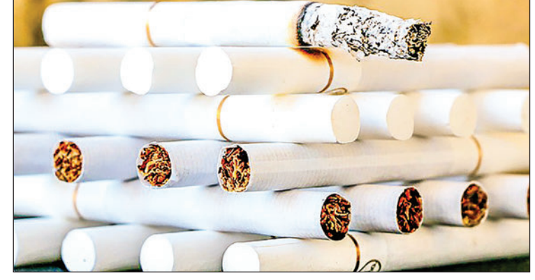
A recent study in the journal Nature revealed that smoking has long-lasting effects on the immune system, even after quitting.

It particularly highlighted changes to what is called adaptive immunity, which is built up over time as the body's specialised cells remember how