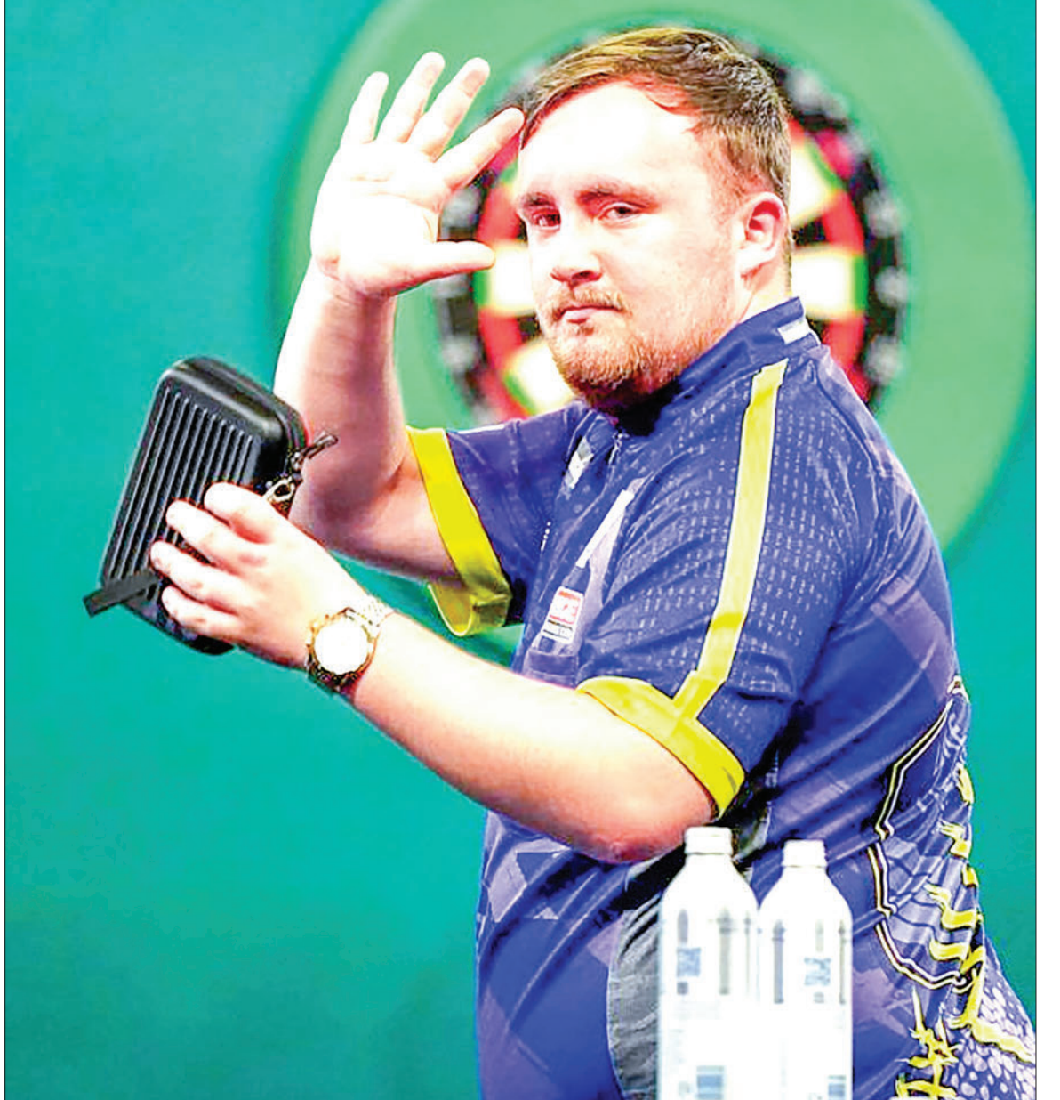
Litter revealed "I don't have any GCSEs" after he reached the PDC World Darts Championship final.

"plant-based" patty full of hydrogenated vegetable fats and sugars (to compensate for the lost yumminess in animal fats) will do nobody any good at all, except the chicken they didn't have to kill.