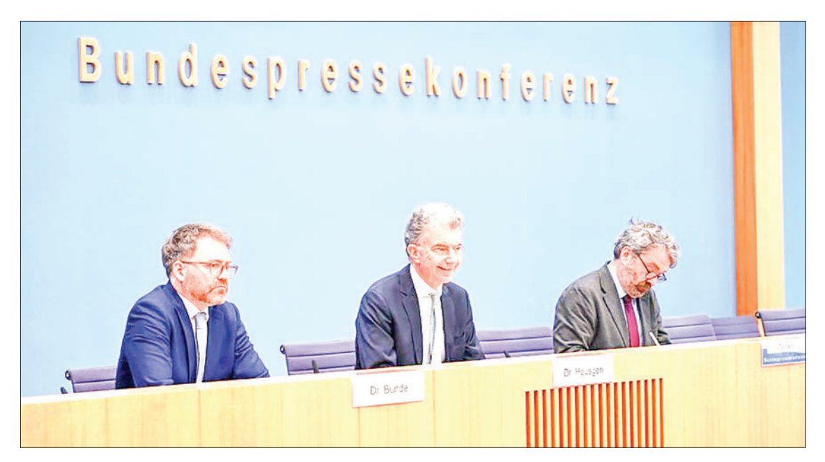
"Deepfakes" refers to digitally manipulated videos or other media created using artificial intelligence (AI) techniques, particularly deep learning algorithms. The 60<sup>th</sup> Munich Security Conference (MSC) opened Friday, with a spotlight on the need to boost cooperation and improve global governance.

TECH giants including Meta, Microsoft and TikTok signed a pledge Friday to crack down on AI content intended to deceive