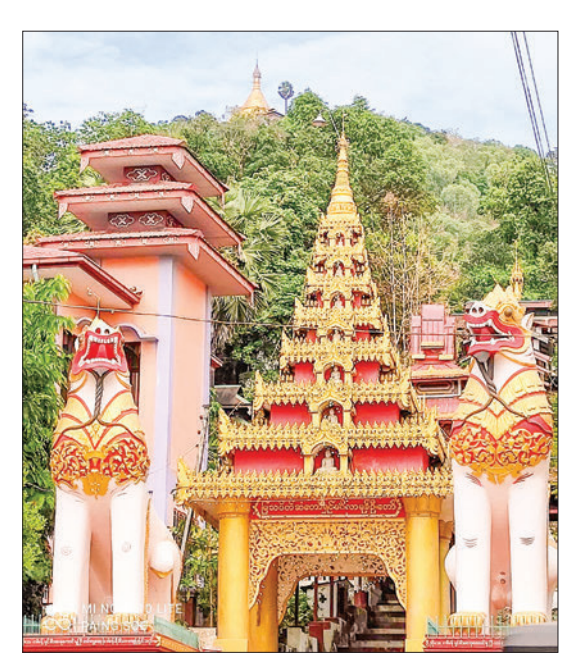
The photo shows the Myathabeik Pagoda.

During the Buddha Pujaniya festival, the Buddha's sermons are recited at the Pagoda's platform. Additionally, at 5 am on the full moon day, the Pagoda on the summit of the mountain will be consecrated by Sayadaws with an offering of flowers, candlelights, joss sticks, and 1,000 bowls of alms. After that, the donors will offer the Htamane alms, rice and foodstuffs to more than 680 monks from 174 monasteries and over