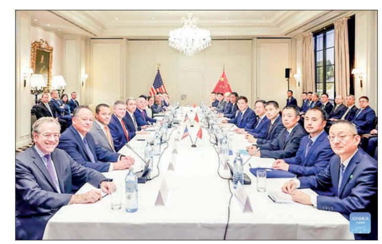
Chinese State Councillor and Minister of Public Security Wang Xiaohong meets with US Homeland Security Secretary Alejandro Mayorkas in Vienna, Austria, 18 February 2024.

Wang said he hopes that the two sides will adhere to the important consensus reached by the two heads of state, uphold the principles of mutual respect, peaceful coexistence and win-win cooperation, respect each other's core interests and