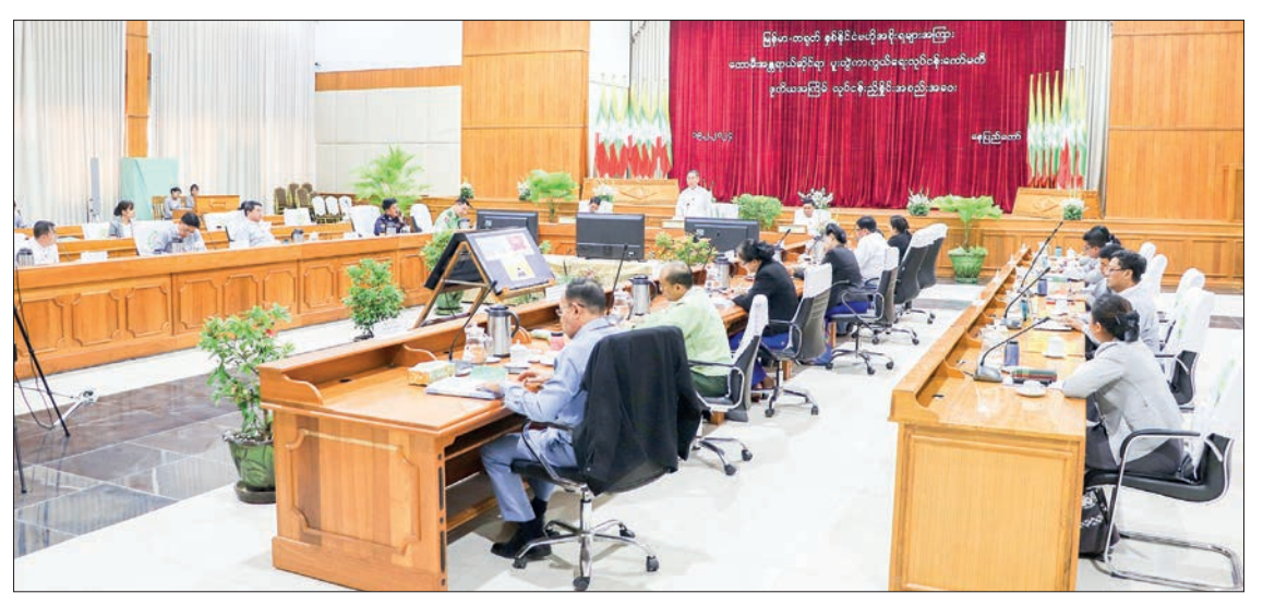
Union Minister for NREC U Khin Maung Yi speaking at Myanmar-China Central Level Work Committee for joint-protection of forest fire in Nay Pyi Taw yesterday.

Then, Vice-Chairman (1) of the working committee Un-