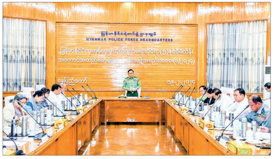
Deputy Minister for Home Affairs and Chief of Myanmar Police Force Lt-Gen Ni Lin Aung addresses the meeting on implementing the five-year anti-human trafficking plan in Nay Pyi Taw yesterday.

Subsequently, the chairman encouraged team members to strive towards completing the fourth quarter of the five-year project (2022-2026), drawn up in accordance with internationally accepted norms, within the designated timeframe. — MNA/NT