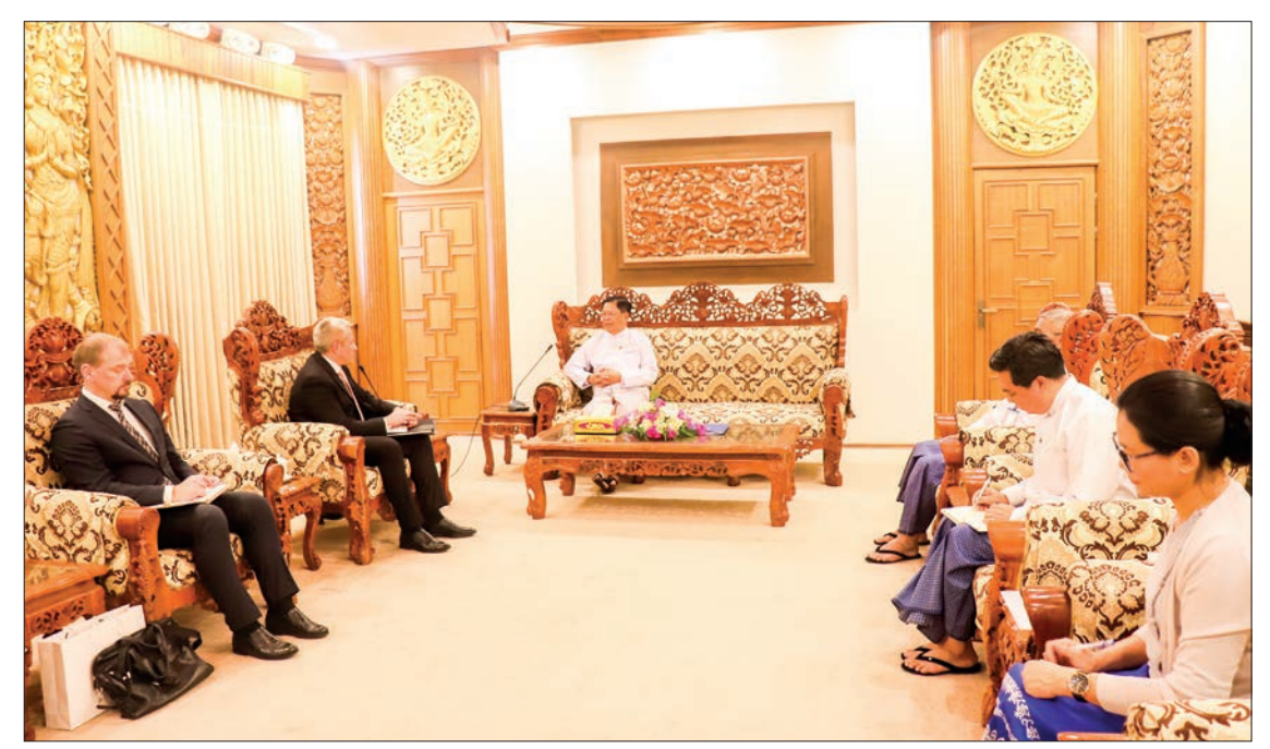
DPM Union Minister for Foreign Affairs U Than Swe holds talks with Belarusian Ambassador Mr Uladzimir Baravikou yesterday.