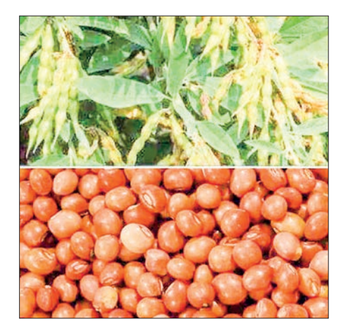
Pigeon pea plants bearing ripening pods.

India has growing consumption requirements on black gram and pigeon peas. According to a Memorandum of Understanding between Myanmar and