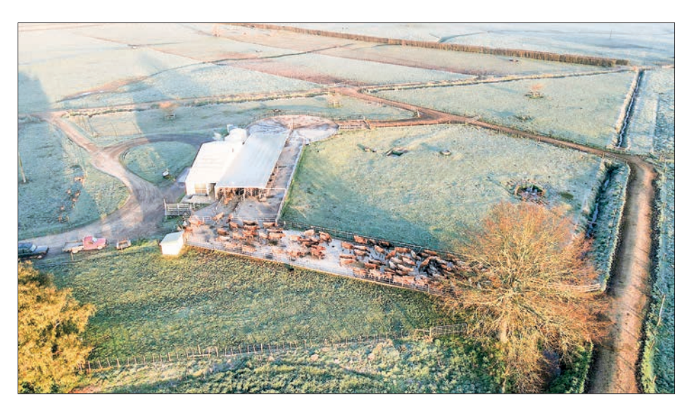
A photo taken on 13 August 2022 shows a herd of cows during milking time on a dairy farm near Cambridge in New Zealand's Waikato region, known for its fertile land and dairy industry.