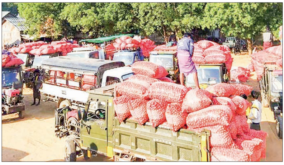
Trucks loaded with monsoon onions entering Seikphyu's commodity depot.

The regions other than Yangon braced for high prices owing to low supply. The highest price was K2,200 per viss in Pakokku, Myingyan and Seikphyu areas on 19 February, which rose