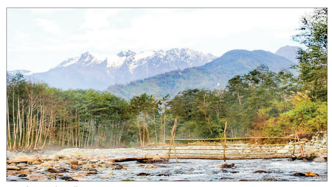
Views from Ziyadam Village.

LOCAL sources report that efforts are underway to enhance the trail leading to the snow-