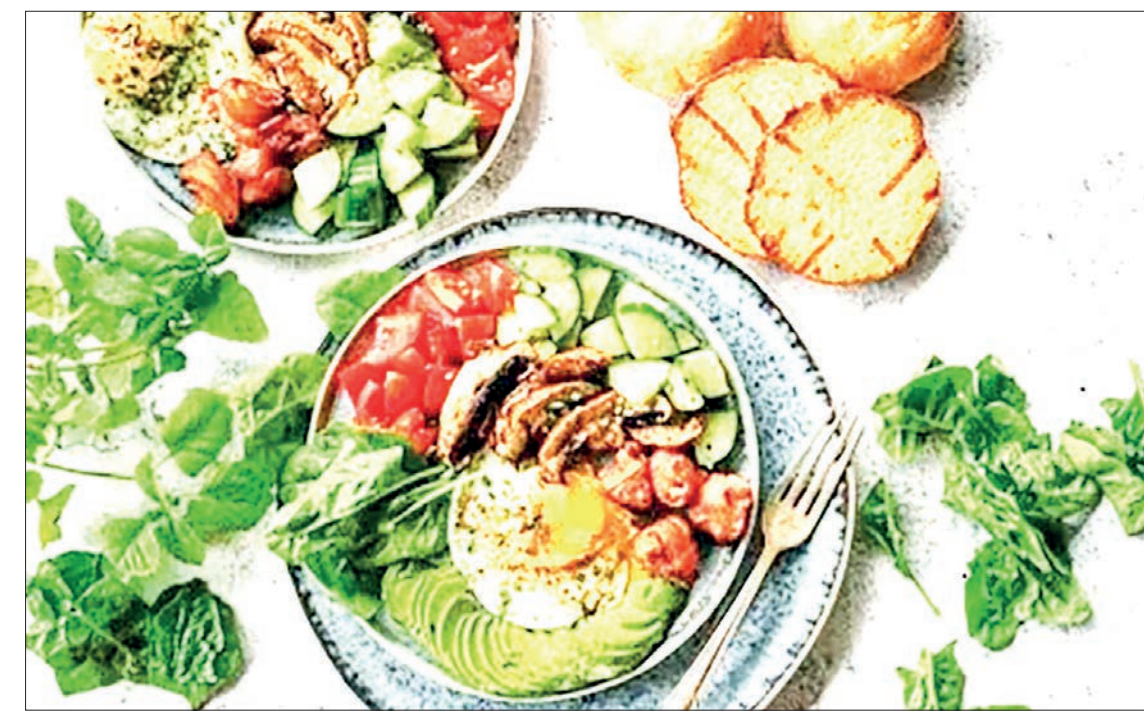
A Danish study found that a protein-rich breakfast boosts satiety and concentration, vital in combating rising obesity and lifestyle-related diseases.

The study followed 30 obese women aged 18 to 30 for three days, during which the women