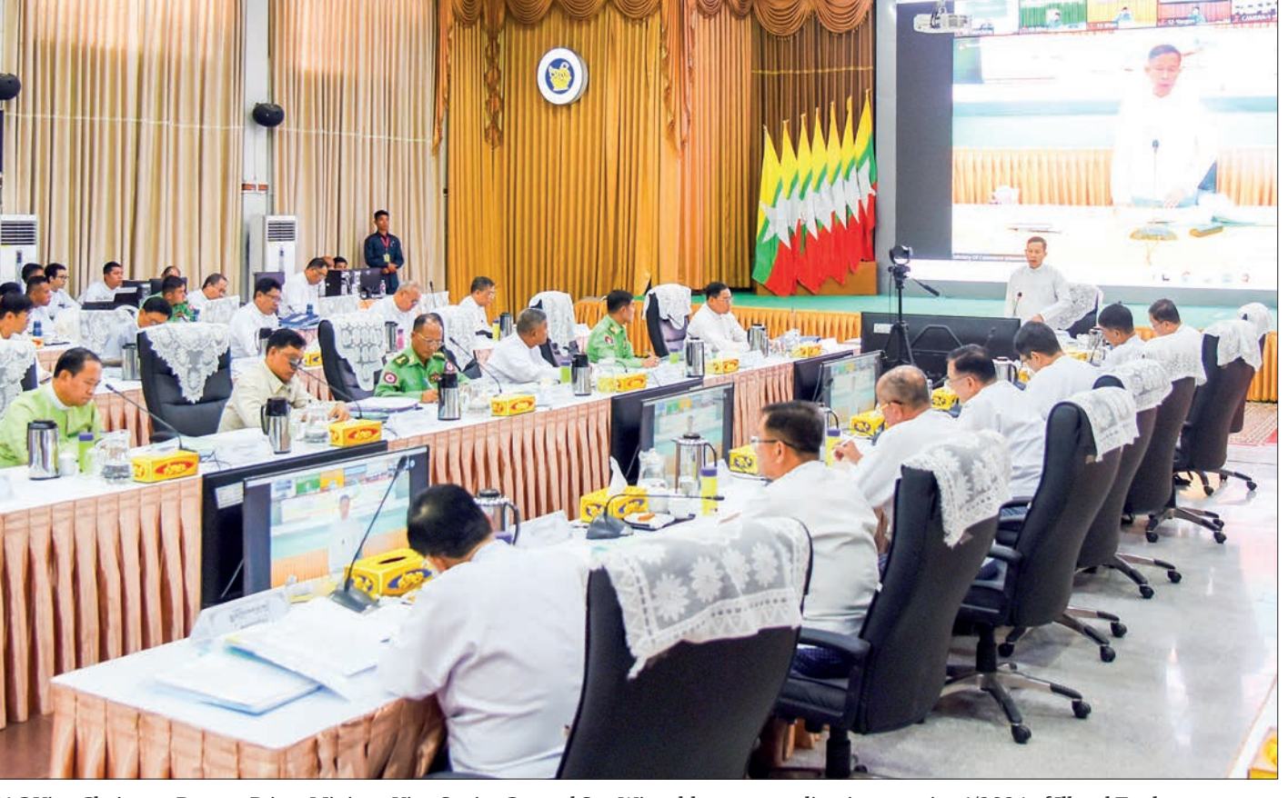
SAC Vice-Chairman Deputy Prime Minister Vice-Senior General Soe Win addresses coordination meeting 1/2024 of Illegal Trade Eradication Steering Committee in Nay Pyi Taw yesterday.