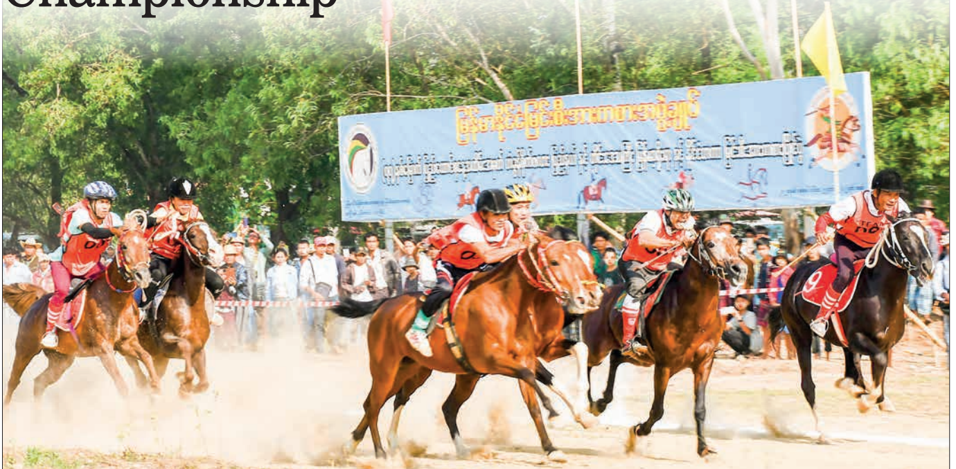
Jockeys competing in different events of equestrian championship in Yangon yesterday.

THE Inter-State/Region Myanmar Traditional and International Equestrian Championship, in honour of the 77<sup>th</sup> Anniversary of Union Day, concluded in Dagon Myothit (North) Township, Yangon yesterday morning.