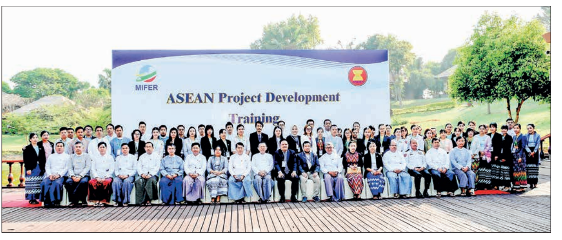
MIFER Union Minister Dr Kan Zaw poses for group photo after ASEAN Project Development Training in Nay Pyi Taw yesterday.

The training will last from 20 to 22 February 2024. The technical experts from the ASEAN Secretariat will give lectures on overview of the ASEAN cooperation projects, the ASEAN project proposal template, formulating Project results in the proposal mate-