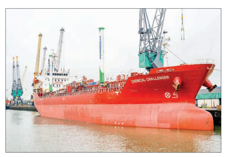
This photograph taken on 16 February 2024, shows a view of the 16,000

"Shipping has always been extremely competitive and it will be a struggle to reach these targets," admitted Grotz, who added the company was unlikely to "make money" on its latest project. — AFP