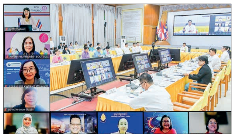
The workshop on advancement of women in ASEAN countries in progress yesterday.

Meanwhile, the Chairperson of the ASEAN Commission on the Promotion and Protection