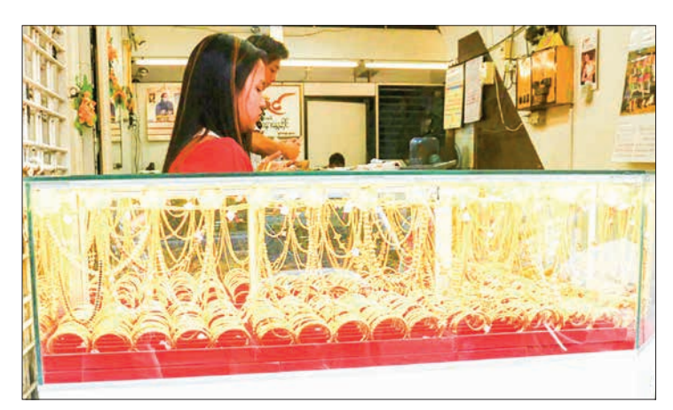
In January 2021, the domestic gold fetched the highest price of K1,336,000 per tical on 6 January. It reached the lowest price of K1,316,000 per tical on 28 January.

THE Yangon Region Gold Entrepreneurs Association (YGEA) will offer a gold training for free at its office at No 42/50 on Shwebontha Street, Pabedan Township between 1 and 10 March.