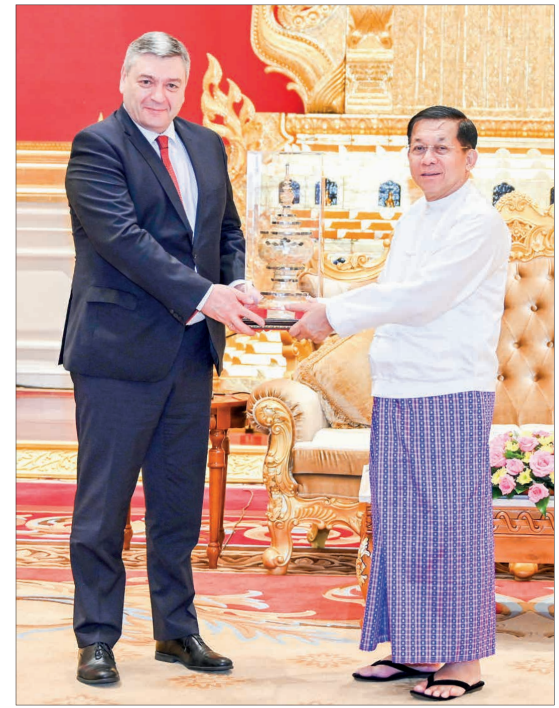
SAC Chairman Prime Minister Senior General Min Aung Hlaing gives gift to Russian Deputy Minister of Foreign Affairs Mr Andrey Rudenko at SAC Chairman Office in Nay Pyi Taw yesterday.

Also present at the meeting were Council Joint Secretary Lt-Gen Ye Win Oo, Deputy Prime Minister Union Minister for Foreign Affairs U Than Swe, Deputy Minister for Foreign Affairs U Lwin Oo and officials. The Russian Deputy Minister of Foreign Affairs was accompanied by Russian Ambassador to Myanmar Mr Iskander Azizov and officials. — MNA/TTA