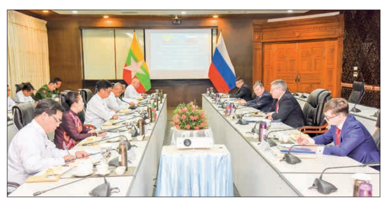
Deputy Minister for Foreign Affairs U Lwin Oo meets Russian Deputy Minister of Foreign Affairs Mr Andrey Rudenko.

THE Myanmar-Russia Political Consultations co-chaired by U Lwin Oo, Deputy Minister for Foreign Affairs of Myanmar and Mr Andrey Rudenko, Deputy Minister of Foreign Affairs of the Russian Federation, was held yesterday afternoon, at the Ministry of Foreign Affairs in Nay Pyi Taw. During the meeting, the two sides cordially exchanged views on the closer collaboration between Myanmar and Russia, the expansion of mutually beneficial cooperation including in the spheres of defence and security, judicial and legal, transport, trade, industry and investment, banking,