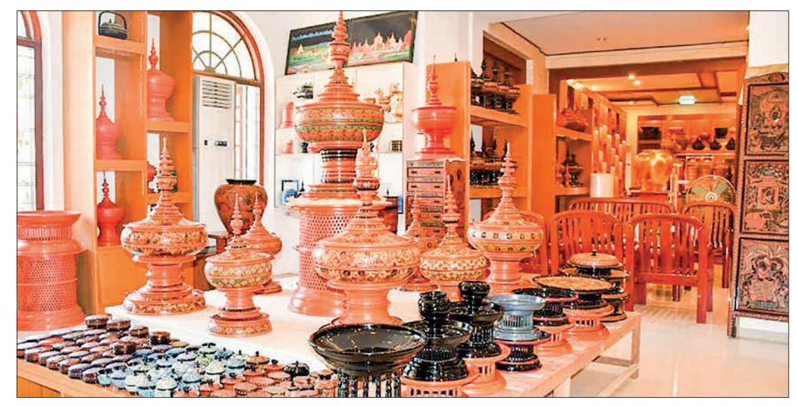
Different types of lacquerwares displayed at showroom.