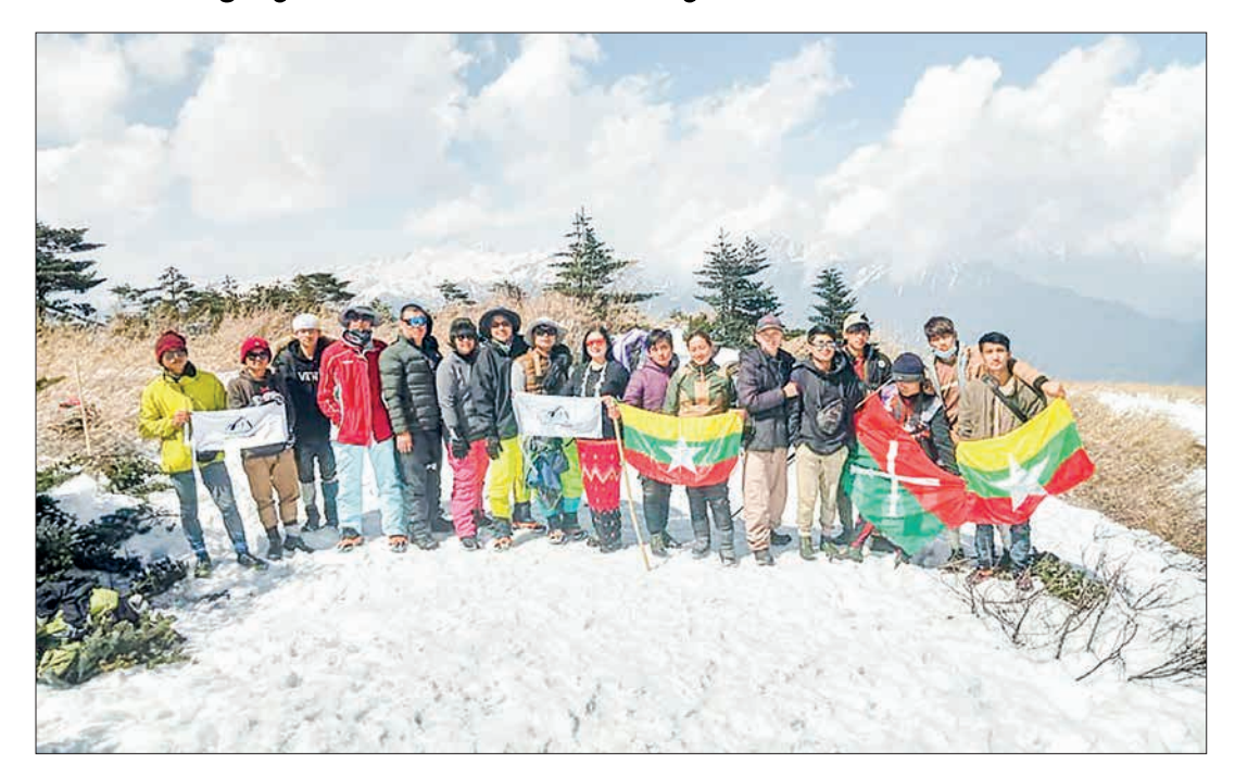
Trekking in Myanmar.