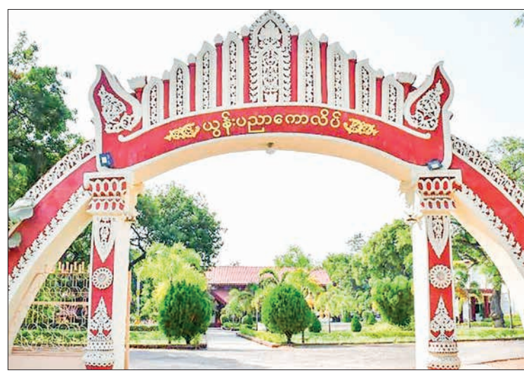
Lacquerwane Technology College (Bagan).

The principal affirmingly addressed that the goals and objectives behind the LTC are preserving lacquer arts and technologies, protecting them from extinction and passing them on to generations for sustainable development.