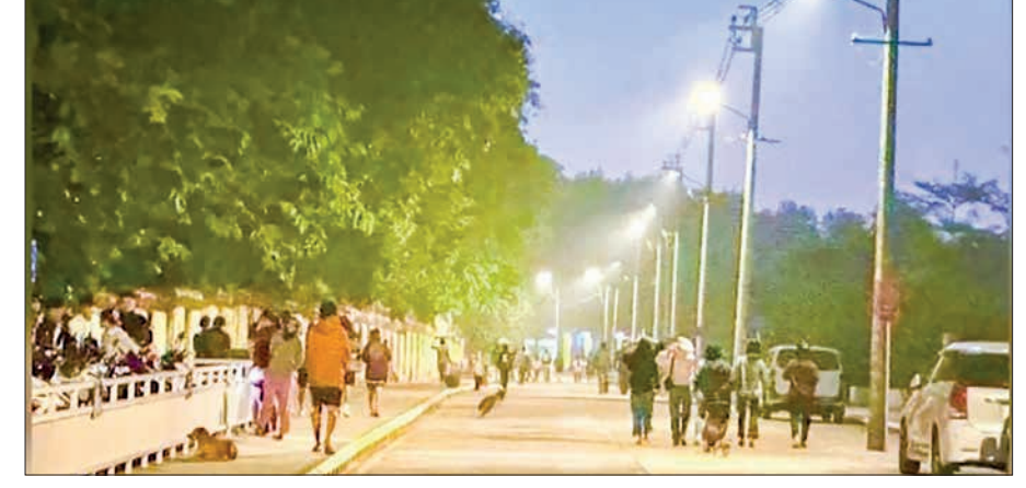
Trekkers and views of Mount Taung Wine.

The Sasana Nwe Foundation has advised Mount Taung Wine visitors to refrain from smoking while walking, to dispose of rubbish properly in designated bins, and for vendors not to conduct