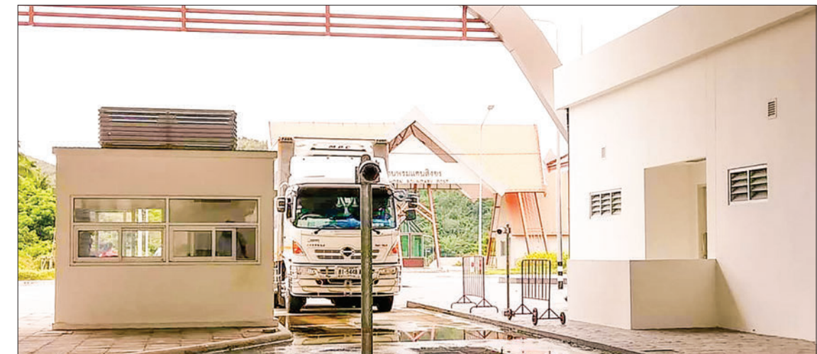
The photo shows the Sinkhun-Mawtaung border trade post through which aquatic products are transported to Thailand.

At the Kawthoung trade post, the primary exports consist of aquatic products to Thailand under the FOB system. Key export items include various fishes, shrimps, octopus, squids, crabs,