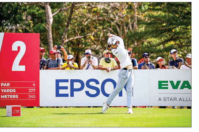
Ko Jin-young of South Korea tees off during the first day of the 2024 Honda LPGA Thailand golf tournament at the Siam Country Club in Pattaya on 22 February 2024.

The world number six from South Korea won both the 2022 and 2023 editions by just two shots and expects another closely fought contest as she aims for a 16<sup>th</sup>