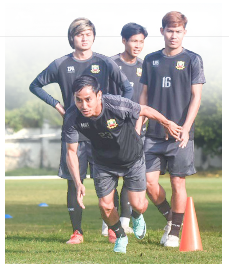
Players from the Shan United are seen under training.

Group matches will be held in two rounds between Thuwunna Stadium, YUSC Stadium, University Stadium and Padonma Stadium, and the top team from each group will qualify for the semi-finals. Group A first, Group D first, Group B first, and Group C first will compete in semi-final matches.