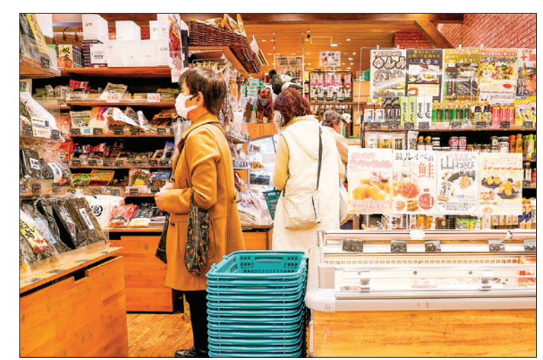
Customers gather at a souvenir shop that sells local seafood in Tokyo on 27 February 2024.

The easing of inflation, as measured by the nationwide core consumer price index that excludes volatile fresh food, came as the effects of higher import costs partly due to a weak yen continued to dissipate. But it beat market expectations that it would slip below the Bank of Japan's two per cent target for the first time since March 2022.