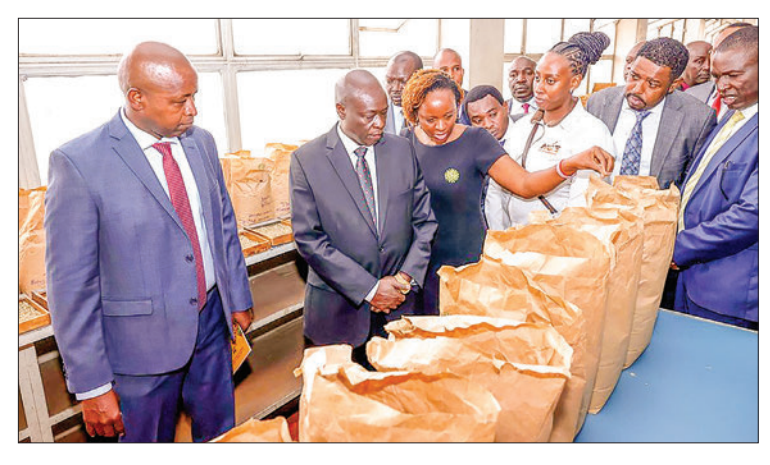
Deputy President Rigathi Gachagua (2nd L) looks at coffee varieties at the Nairobi Coffee Exchange Auction in Nairobi, capital of Kenya, on 15 August 2023.

Apuoyo added that coffee exports to African countries in 2023 amounted to less than one per cent of the total exports, with the largest African destination being South Africa. He noted that the government is currently implementing several reforms, such as the rollout of the 27.4 million dollars Coffee Cherry Fund, to enable farmers to access affordable financing. — Xinhua