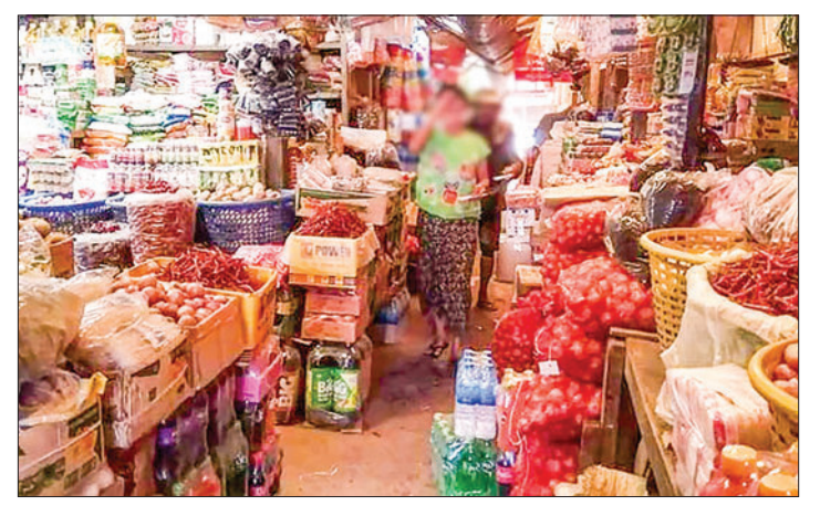
The photo depicts a dry grocery store in a market complex.

the Kyukok garlic price rose to K9,800 per viss. Newly supplied garlic from Shan State fetched K12,500-K14,500 per viss.