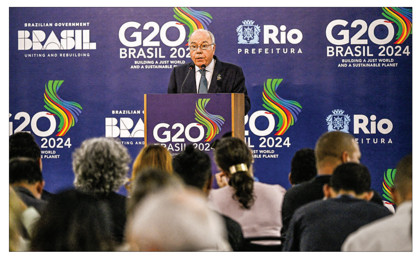
Brazil's Foreign Minister Mauro Vieira delivers a press conference at the end of the G20 foreign ministers meeting in Rio de Janeiro, Brazil, on 22 February 2024.

Of the 257 companies and financial institutions that have been in the Forest 500 for the past decade, 61–23 per cent - still have not published a single commitment on addressing deforestation, it said. — AFP