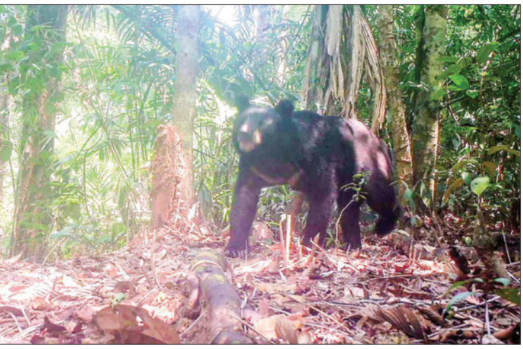
Photos show Indian (or Bengal) tigers (L), Sun bear (Above) and Gaur (Below) from Htamanthi Wildlife Sanctuary.

rare species, including the tiger, were recorded from day trips, camping and Nanyanyin camp in February 2023. The Htamanthi Wildlife Sanctuary stretches