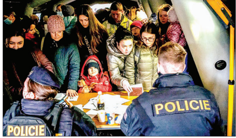
Ukrainian refugees line up to file for residency permits at the Department of Foreign Police in Prague, Czech Republic, on 2 March 2022.

According to the report, Syrians continued to lodge the most applications, with Afghans remaining the second. Applications from Syrians were up by 38 per cent compared to 2022, while those from Afghans were down by 11 per cent. — Xinhua