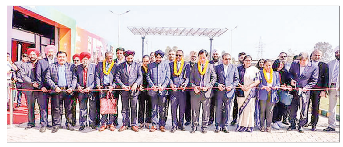
The photo shows the opening ceremony of the Mach Auto Expo 2024.

THE Ministry of Foreign Affairs has reported that discussions on investment opportunities and potential cooperation in automotive technology between Myanmar and India took place at the 13th Mach Auto Expo 2024 ince, India.