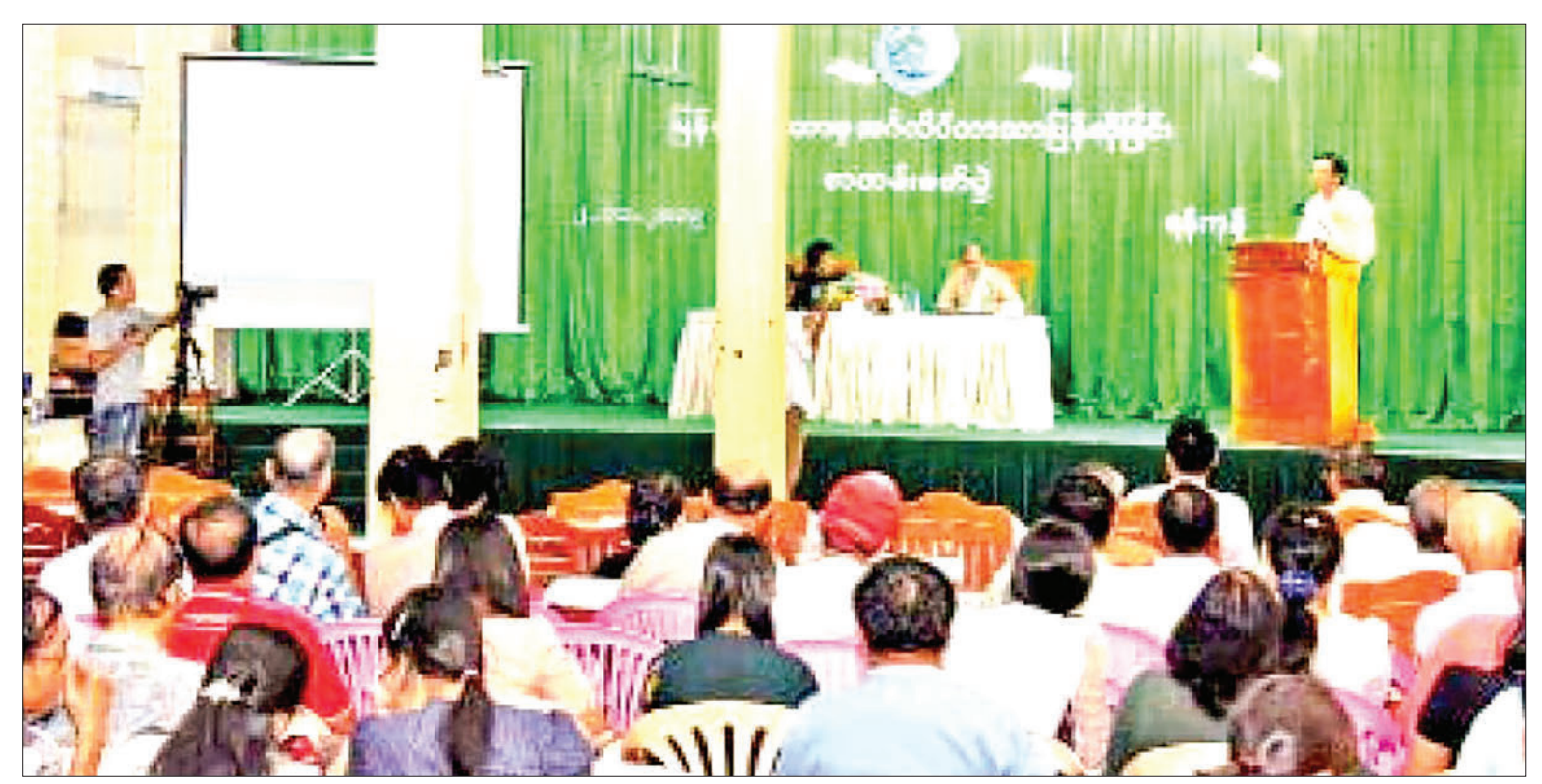
The Paper Reading Session on Translation (from Myanmar to English) occurred on 2 and 3 November 2019. It can rightly be called the 27<sup>th</sup> occurrence of its kind. Similarly, it signifies the fifth translation event so far.

ed those events, which had become a Friday evening highlight in Rangoon's (Yangon's) cultural life. These open-air performances were held weekly from early November until the advent of the monsoon in May.