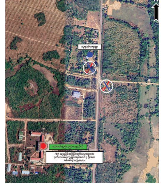
The map shows the place of faculty members captured by terrorists.

Security forces have pledged to take effective action against the terrorists under anti-terrorism laws and other relevant statutes, as their actions violate international conventions, including the Geneva Convention. — MNA/NT