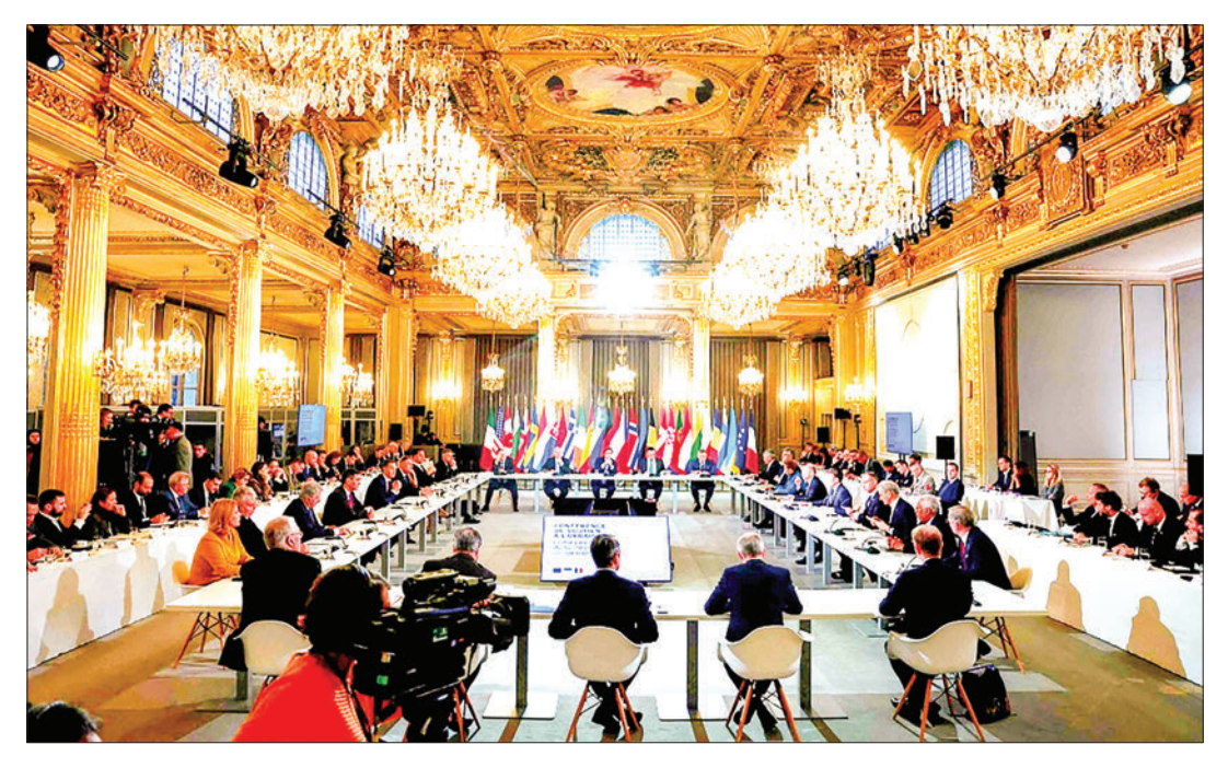
Macron delivers a speech to open a conference in support of Ukraine with European leaders and government representatives at the Elysee presidential palace in Paris, on Monday.

Macron's comments came after a conference on Ukraine in Paris, where he mentioned the possibility of sending troops but did not indicate a consensus among Western leaders.