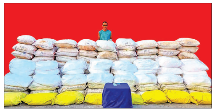
An arrestee seen with seized restricted chemicals in Pyigyidagun Township, Mandalay Region.

A total of five tonnes of restricted chemical (caffeine), valued at K2 billion, was seized in Pyigyidagun Township, Manda-