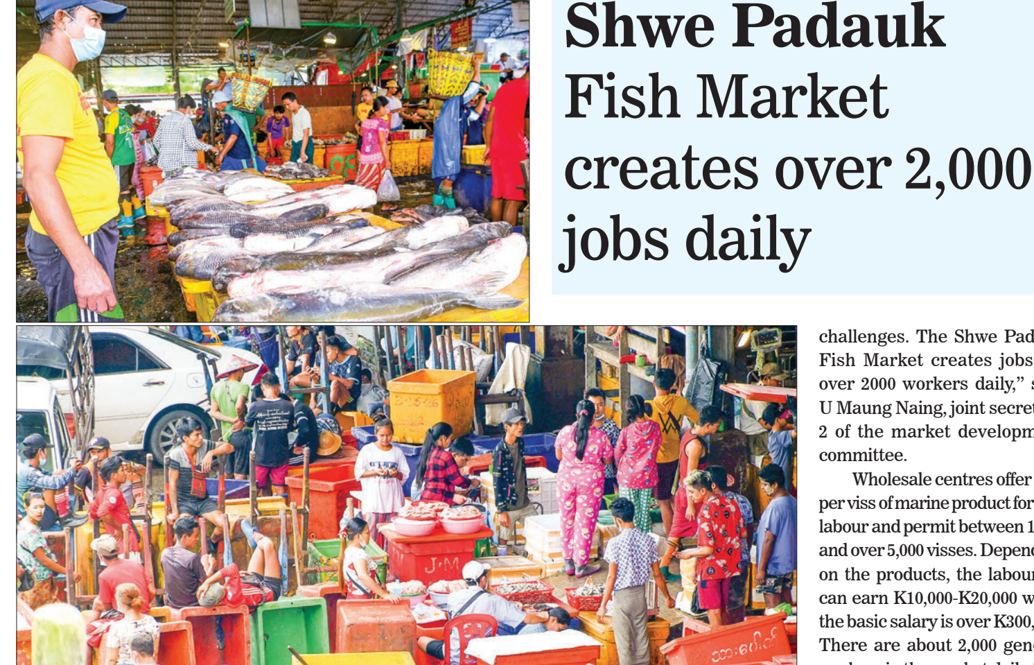
Photos show the bustling scene of the Shwe Padauk Fish Market.

"People excavate fish ponds by the end of February. If so, the inflow of freshwater will be high. Especially in summer, the fish are captured and transported to the market as a preventive measure against the impact on fish in summer. It is okay for the consumers. People competitively distribute to the Yangon market and also to countryside areas, so the fish market was alive with normal financial circulation previously. But it isn't easy this year.