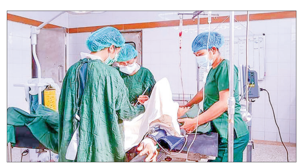
Medical staff members participate in the surgical operation in Kyaikto People's Hospital on 26 February 2024.

"After securing blood donors, we explained the situation to her relatives and asked them whether they would prefer an operation or a referral. It is dangerous because the patient might not survive the journey to the district hospital, which is at least