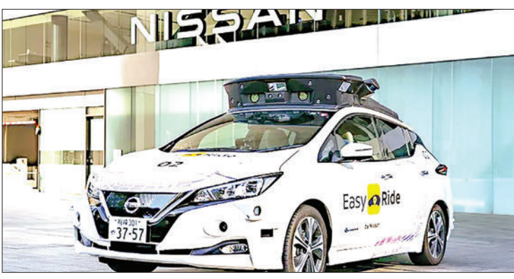
Nissan has been testing business models for self-driving mobility services in Japan and abroad since 2017.

Japan is far from the only place with autonomous vehicles on the roads, but its gov-