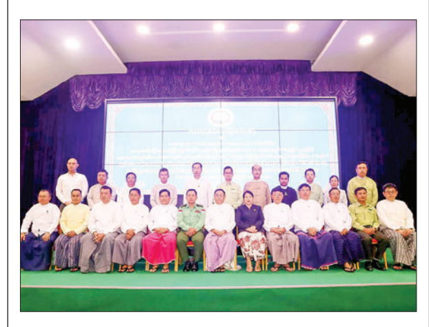
Attendees, including the Taninthayi Region's chief minister, seen at the feasibility study signing ceremony.

THE Taninthayi regional government has announced that projects to generate 10.8 megawatts of electricity from hydropower and solar energy will commence in Kyunsu Township, Myeik District, Taninthayi Region.