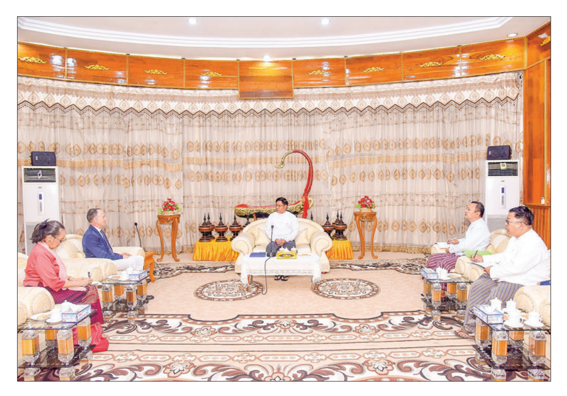
The UN Resident Coordinator for Myanmar and Humanitarian Coordinator ad interim calls on SAC Member Deputy Prime Minister Union Defence Minister Admiral Tin Aung San yesterday.

STATE Administration Council Member, Deputy Prime Minister and Union Minister for Defence Admiral Tin Aung San received United Nations Interim Resident Coordinator for Myanmar and Interim