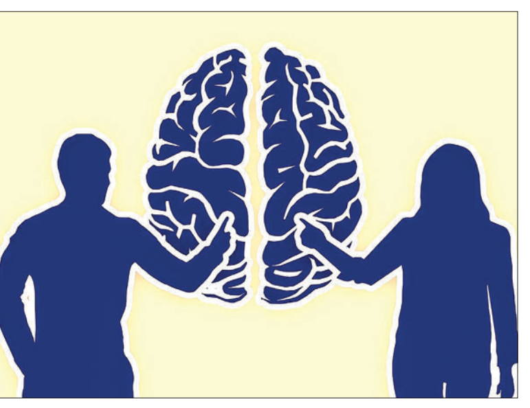
The study suggests a potential sex-specific connection between distinct abdominal fat and brain health, particularly in middle-aged males at high risk of Alzheimer's.

creas, liver and abdomen measured with MRI. "In middle-aged males at high Alzheimer's disease risk — but not females — higher pancreatic fat was associated with lower cognition and brain volumes, suggesting a potential sex-specific link between distinct abdominal fat and brain health," said Beeri, who is the Krieger Klein Endowed Chair in Neurodegeneration Research at BHI and a faculty member of the Rutgers Institute for Health, Health Care Policy, and Ageing Research.