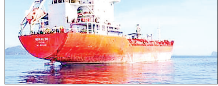
A ship loaded with palm oil seen entering Myanmar in 2022.

When sugar prices are at K900 per viss, one tonne of sugarcane arriving at the factory is priced at K38,000. In 2023, one tonne of sugarcane was K150,000, while sugar prices ranged from K3,600 to K3,700 per viss. During sugar production at the factory, sugar prices rose to K4,100 per viss. Therefore, more earnings are expected during the sugarcane harvesting season in 2024. Along with the increasing price of sugar, the cultivation of sugarcane is also expanding, and more sugar factories are being constructed. Sugarcane productivity per acre in Myanmar is only 30 tonnes, whereas in India, it is 150 tonnes. However, jaggery production is less likely to expand. Thus, jaggery prices in the domestic beverage market remain higher than sugar, making ordinary sugar palm jaggeries popular within the market, according to a jaggery seller interviewed by the GNLM. - TWA/ TMT