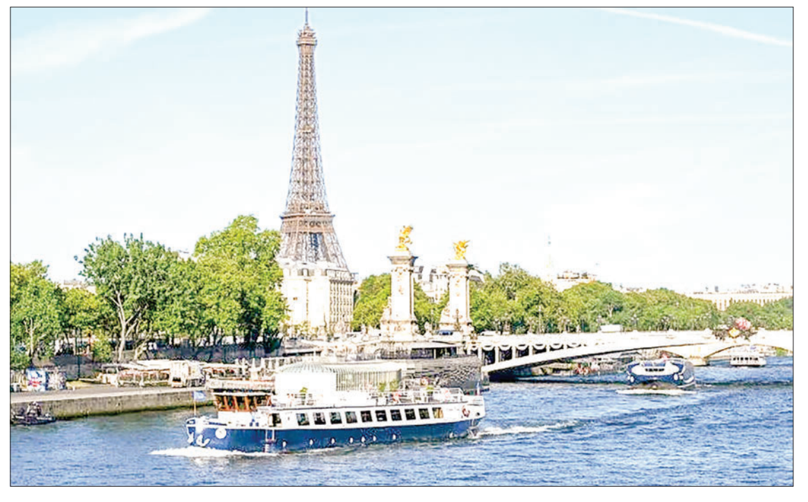
A bag containing police security plans for the Paris Olympic Games has been stolen from a train at Gare du Nord station.

With the Games starting on 26 July, approximately 2,000 municipal police officers will be deployed, alongside around 35,000 security forces expected to be on duty each day.