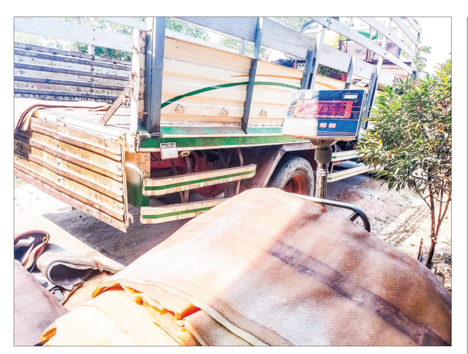
Rubber piles await transport from Mon State to Yangon depot for export to China and Malaysia.