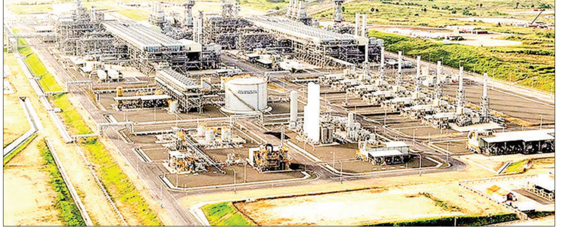
ExxonMobil PNG Limited operates PNG LNG on behalf of five co-venture partners.

Throughout its lifetime, the project is expected to produce the equivalent of about one billion barrels of oil, according to TotalEnergies.