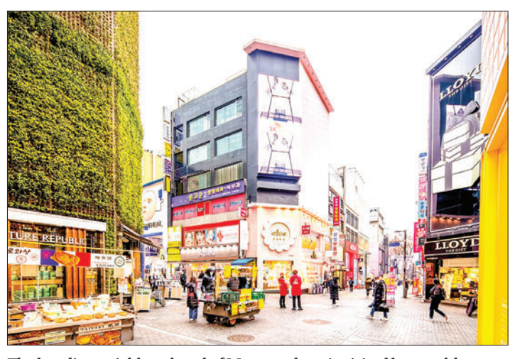
The bustling neighbourhood of Myeong-dong is visited by roughly two million people each day.

South Korea's birth rate hit a record low last year, despite significant government efforts to boost childbirth. With one of the world's lowest birth rates and longest life expectancies, the country faces a demographic challenge.