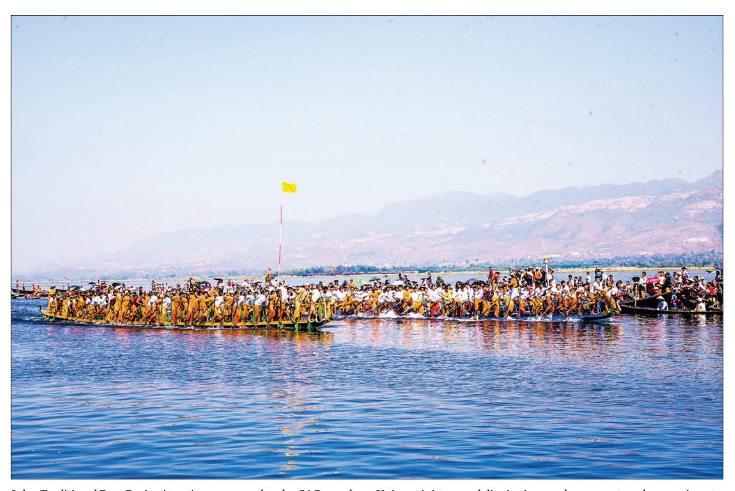
Inlay Traditional Boat Racing in action on a grand scale. SAC members, Union ministers and dignitaries are also present on the occasion at Inlay Lake in Nyaungshwe Township, Shan State, on 5 February 2024.