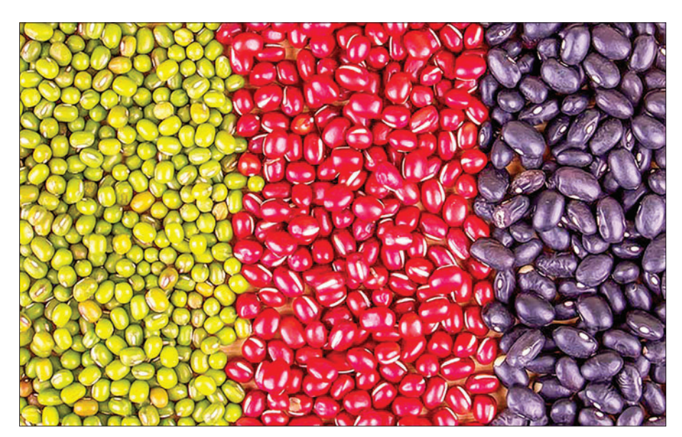
Myanmar exports kidney beans to China, India, Japan, Singapore and other foreign countries via border and maritime trade channels.

Myanmar conveyed over 24,163 tonnes of kidney beans worth $29.77 million to foreign trade partners between