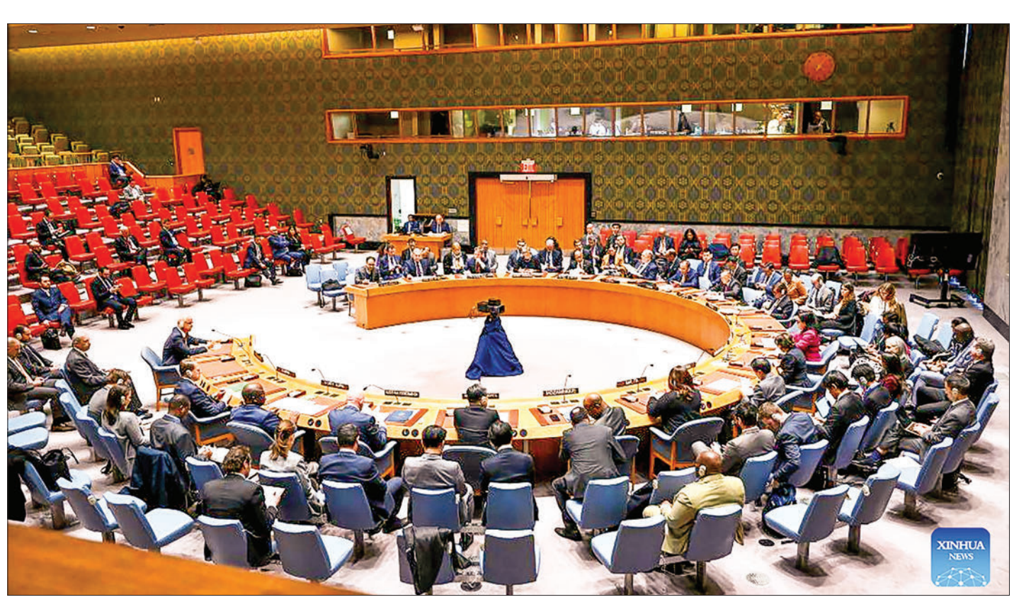
A panoramic view of the UN Security Council is seen as it convenes an emergency session to deliberate on the escalating conflict in Gaza at the UN headquarters in New York on 5 February 2024.

HE UN Security Council on Monday convened an emergency session to address the escalating conflict in Gaza, a situation that is exacerbating tensions throughout the Middle