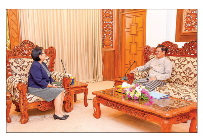
Deputy PM Union Minister U Than Swe receives the UNHCR Representative in Myanmar yesterday.

UNHCR's ongoing activities in Myanmar and ways and means for further cooperation between the Government of Myanmar