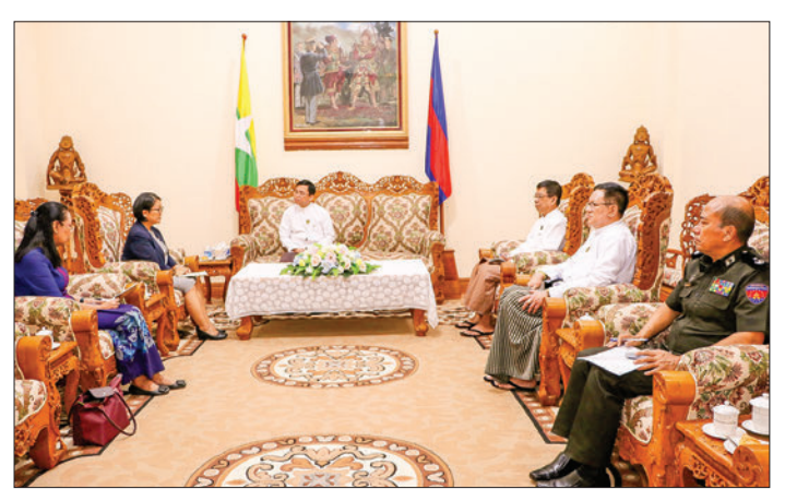
The UNHCR Resident Representative calls on Union Minister U Myint Kyaing yesterday.

tion and Population U Myint Kyaing received Resident Representative Ms Noriko Takagi of the United Nations High Commissioner for Refugees (UNHCR) in Myanmar and party at the reception hall of the ministry in Nay Pyi Taw yesterday.