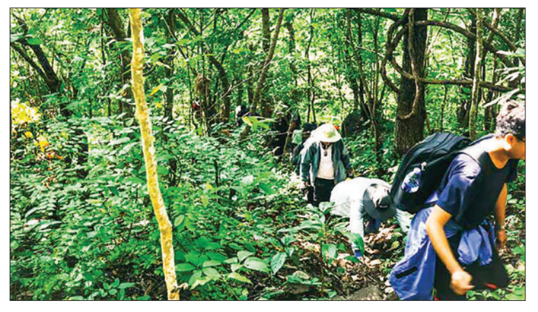
The image captures volunteers participating in a clean-up campaign on the slopes of Mt Popa.

THE garbage collection effort for a clean Mount Popa campaign is gaining interest from the people, according to the data. This campaign will commence in the early morning of 18 February and will see environmentalists share their knowledge with an audience of nearly 100, including invited local people. "People coming on their own are requested to arrive by the evening of 17 February. The Maha Giri mountaineering team will set up a camping ground at the foot of the hill, and as many tents as they have will be provided. Another