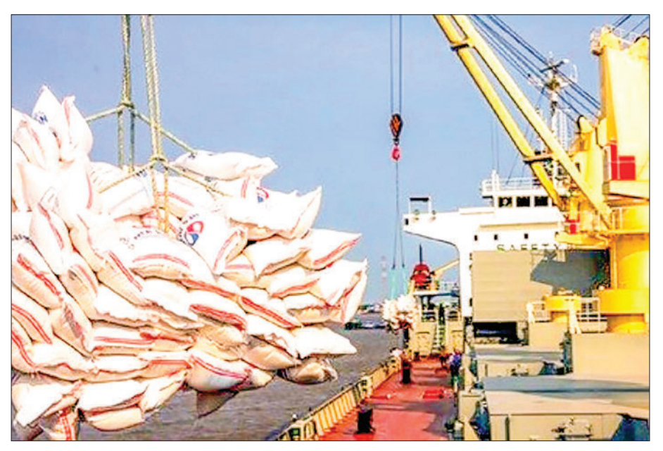
Export rice bags seen being loaded on the merchant vessel at Yangon Port.

THE value of Myanmar's rice and broken rice exports amounted to US$574 million from over 1.16 million tonnes in the past ten months of the current financial year 2023-2024 beginning 1 April, comprising 1.08 million tonnes by seaborne trade and 80,000 tonnes