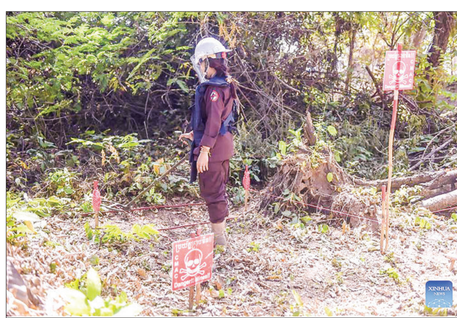
A deminer searches for mines and unexploded ordnance at a minefield in Siem Reap province, Cambodia, 16 January 2024.

from 4,320 in 1996 to 32 in 2023 and below 100 a year in the last 10 years. — Xinhua