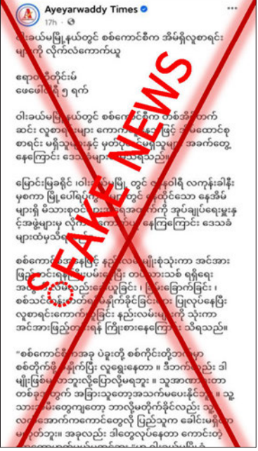
Screenshot validates false claims.

The malicious news media is only spreading propaganda with false information to scare the people of the peaceful villages and towns of the country. — MNA/KZL