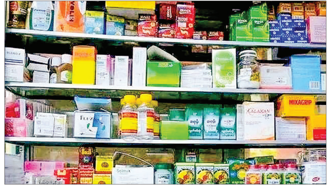
Imported medicines are seen being displayed on the shelf at a store.

Among the more than 50 million population of Myanmar, over 2 million people have chron-