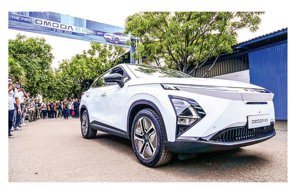
Chery's electric vehicle model Omoda E5 is seen during roll-off ceremony in Bekasi, West Java province, Indonesia, on 2 December 2023.

be a brand that can support our domestic market, so that Indonesia can benefit from developing EV batteries here. And the government encourages the commitment of Chery to keep investing and increasing local content in Chery products," Hartarto said.