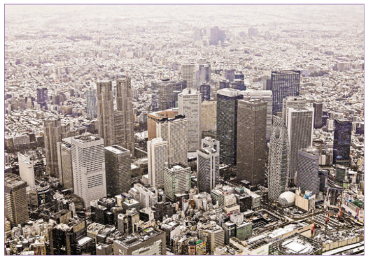
Photo taken from a Kyodo News helicopter on the morning of 6 February 2024 shows skyscrapers in Tokyo's Shinjuku district after snowfall peaked in the capital.

Cannabis was taken off the list of banned narcotics in June 2022 under the previous government, which included the pro-legalization Bhumjaithai party. The move prompted hundreds of cannabis dispensaries to sprout around the country, particularly in Bangkok, provoking concern from critics who urged the need for tighter legislation. On Tuesday, the kingdom's health minister said the new bill — which bans the recreational use of cannabis — will be proposed to the cabinet meeting next week. "The new bill will be amended from the existing one to only allow the use of cannabis for health and medicinal purposes," Chonlanan Srikaew told reporters. — AFP