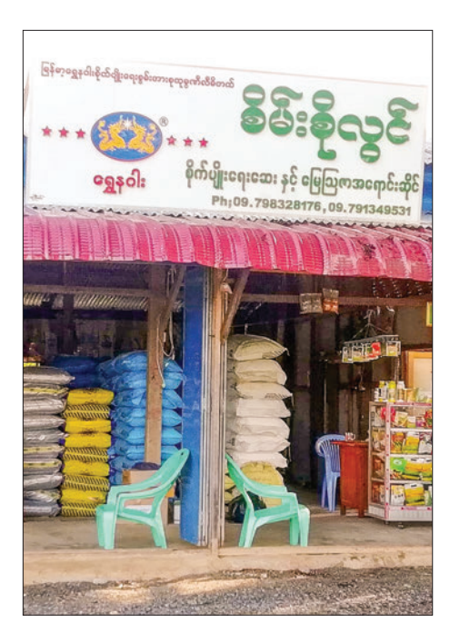
The photo shows a fertilizer shop in Nay Pyi Taw.

Myanmar's fertilizer imports were higher, totalling about 7,000 tonnes compared to the previous period. The fertilizer imports came from China, Viet Nam, Thailand, Germany, South Korea, Chinese Taipei, Norway, and Malaysia. — TWA/MKKS