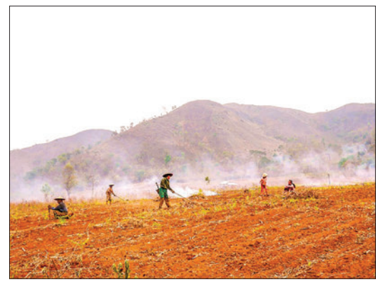
Farmers at work on the permitted vacant land.

THE Union Minister for Agriculture, Livestock and Irrigation stated at the central committee meeting on 1 February that the ministry would