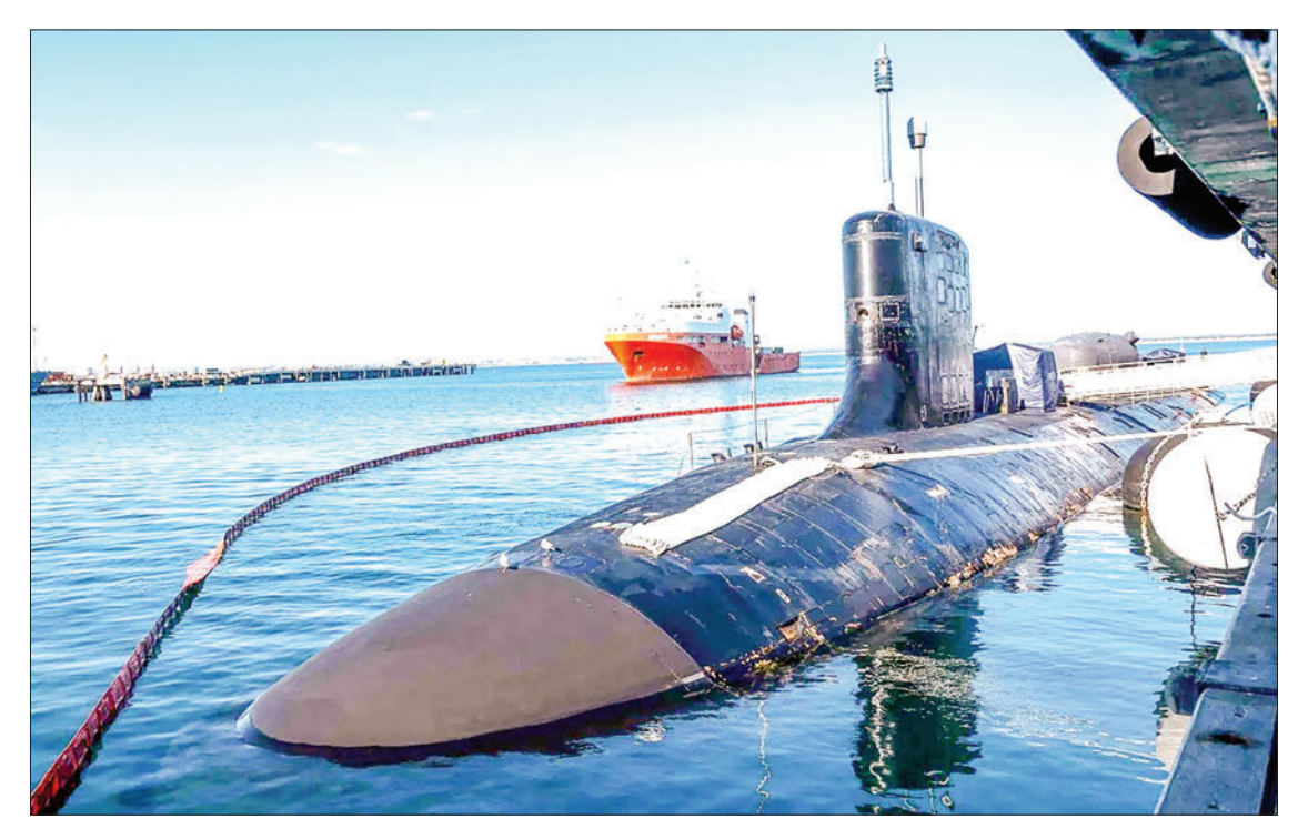
AUKUS member-states unveiled the trilateral defence partnership in September 2021, initiating plans for Australia to build a fleet of nuclear submarines with US and UK technology.

Ministers welcomed the establishment of the 2+2 mechanism as a step to further strengthen the Australia-New Zealand alliance to address challenges in close partnership," the ministers said in a joint statement released by the Australian Defence Ministry. — SPUTNIK