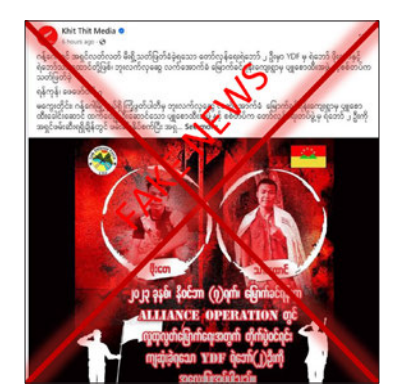
Screenshot validates misinformation.

According to a resident who does not accept terrorist acts, the terrorists near Kokosu village in YeU Township threatened the villagers because the news of their preparation for an