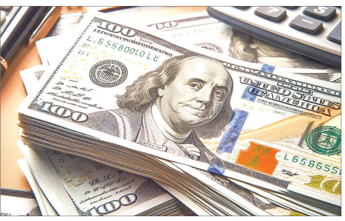
Those illegally holding foreign currencies are to face legal actions under the Foreign Exchange Management Law, the CBM warned again

Meanwhile, the reference exchange rate of the Central Bank of Myanmar is K2,100.