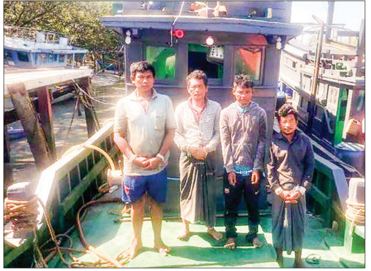
Suspects from the vessel Ta Tine Ya.

Arrest warrant issued for U Kyaw Lwin for online scam, money laundering