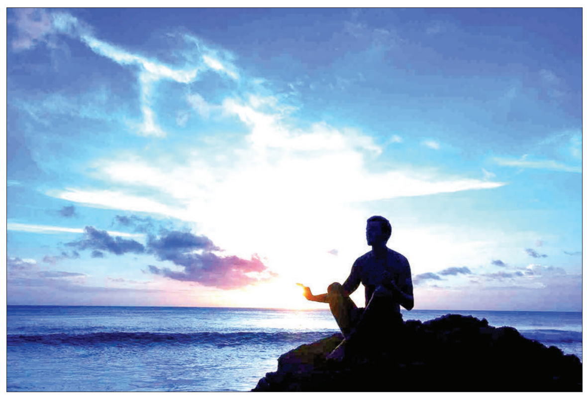
Negligence was not a dismissal of the world but a conscious choice to untangle from attachment, fostering mindful living and appreciation of each moment.

As I delved into these principles, I realized they were more than just guidelines; they were tantamount to practising negligence. The term, often misunderstood in common parlance, held profound significance in the literature of Buddhism. Far from its negative connotations, negligence, as expounded by Sitagu Sayadawgyi, was a practice of detachment,