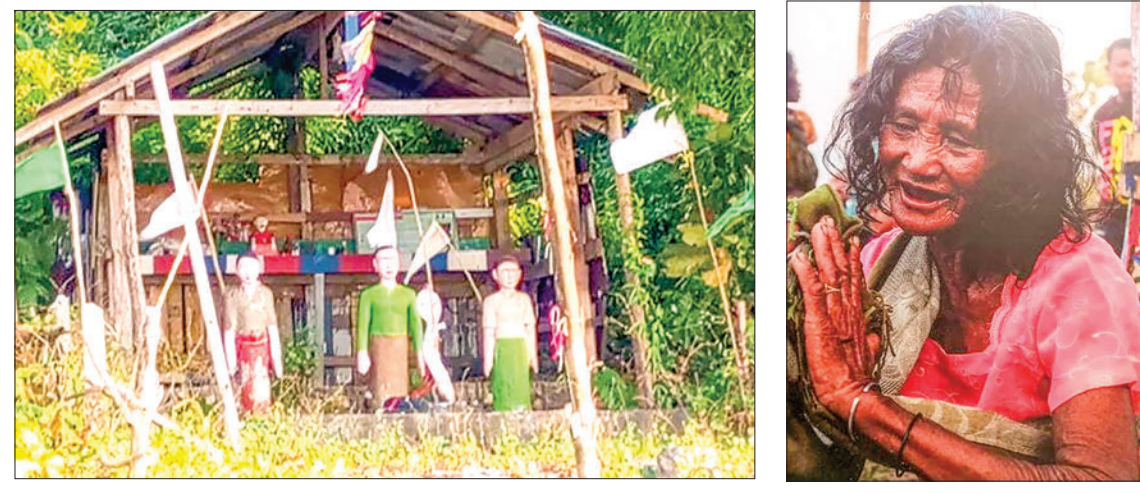
Captivating photos capture the vibrant spirit festival celebrations in the Myeik Archipelago.

Shamans invite spirits to the festival, wishing abundant catches throughout the year and good health. They then offer food and drinks to the spirits. Ceremonies will occur