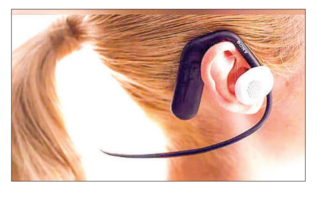
The innovative design positions the speaker near the ear canal, providing a rich sound experience while keeping the ear uncovered.

This product was well received by crowdfunding, which led to its official launch.