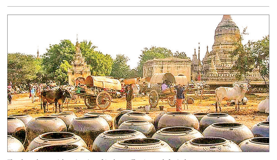
The photo shows a sightseeing view of Ayekyun village's pagoda festival.

THE State Administration Council has transferred and appointed U Htein Lin, Director-General of the Department of International Affairs and Corruption Prevention of the Anti-Corruption Commission, as Director-General of the Anti-Corruption Commission Office from the date he assumes charge of his duties.