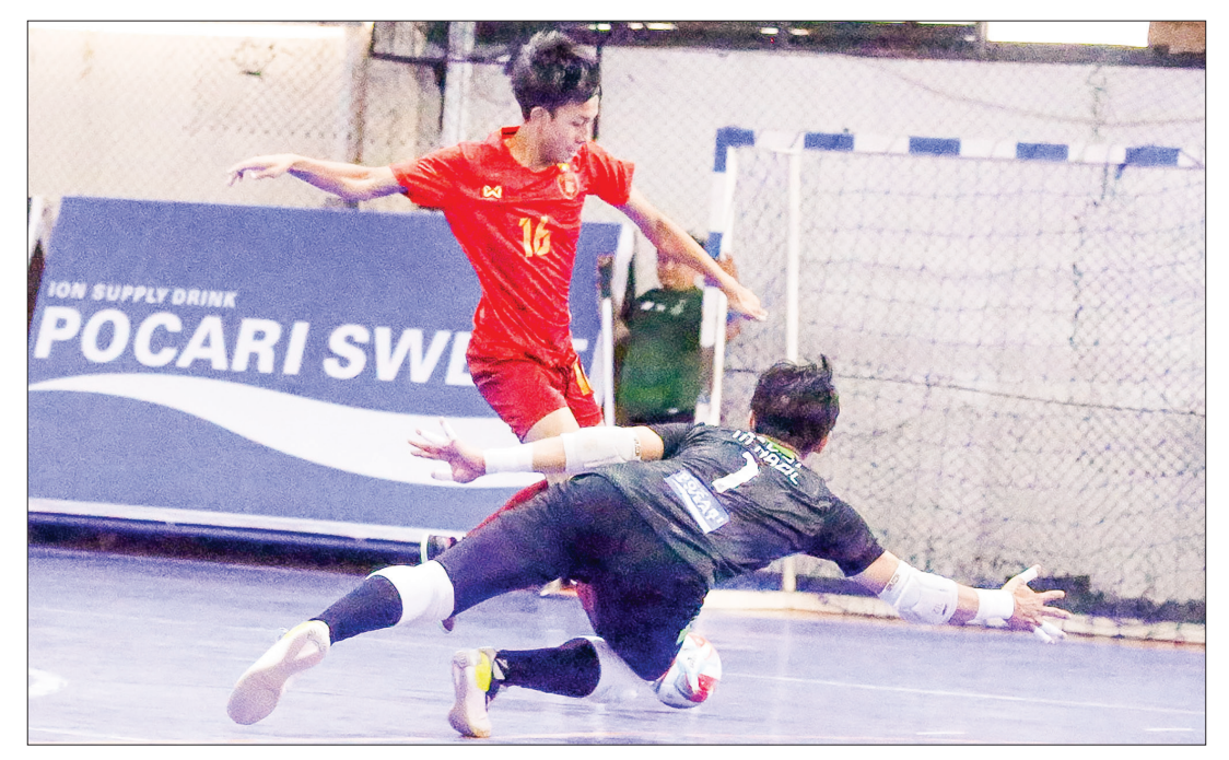
A Myanmar futsal player (red) is seen kicking the ball against the Indonesian Bintang Timur FC goalkeeper during their first friendly match played on 7 February 2024.

THE Myanmar national futsal team, training in Indonesia as a preliminary preparation for the 2024 futsal Asian Cup tournament, lost 11 goals to one against Indonesian league champion Bintang Timur FC on 7 February in the first friendly