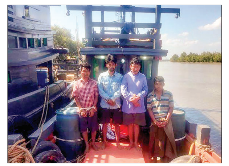
Suspects from the boat Lamin Myitta 7.

From now on, I'd like to ask the AA group so as not to use the lives of such people. I want to say that I am very sorry that our honest lives have been destroyed so quickly.