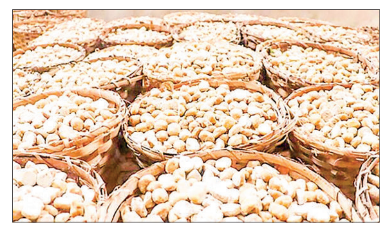
Jaggery and brown slab sugar, Myanmar's traditional snacks, are selling well amid high demand, according to the traders.

The wholesale price of a viss of sweetener jaggery is K5,000 to K7,000, and dessert jaggery is about K6,000. The retail price of brown slab sugar is K5,000 per viss, and the wholesale price is K4,500. — Thit Taw/ZN