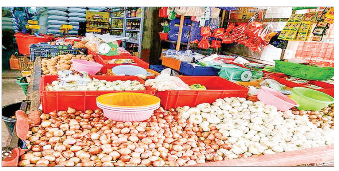
Dry groceries are organized for sale at a retail outlet.

The garlic prices from Aungban, Shan State, touched a high of K16,200-K17,000 per