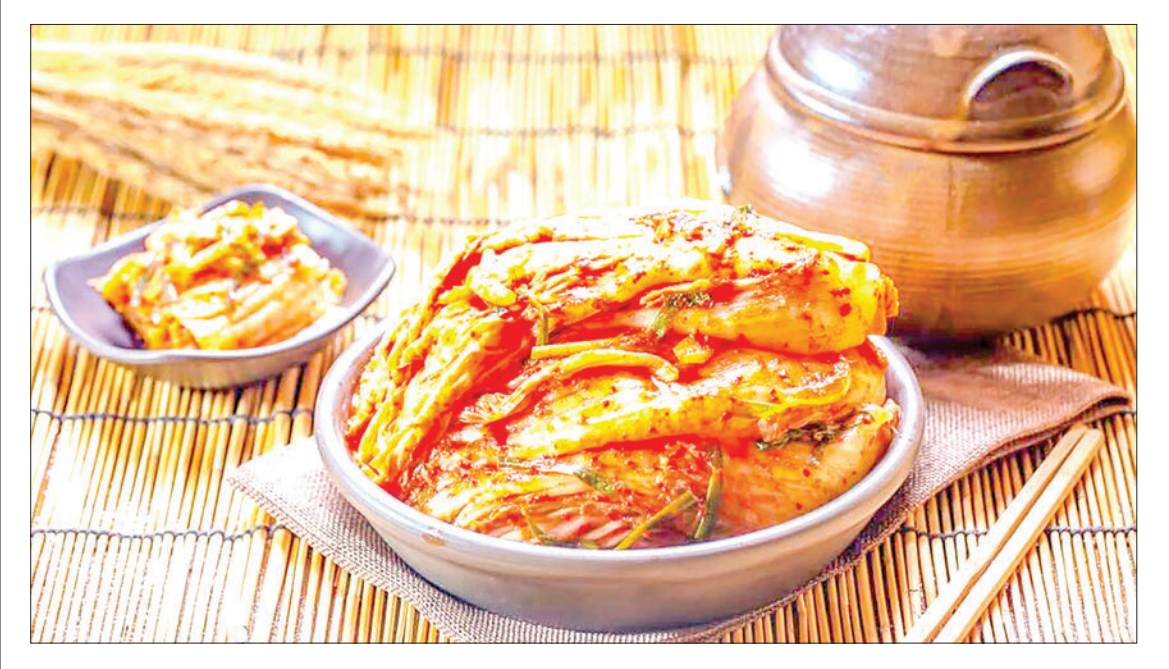
The study, drawing on data from 115,726 participants in the Health Examinees (HEXA) study, explores the link between regular kimchi consumption and a potential reduction in the risk of overall and abdominal obesity.