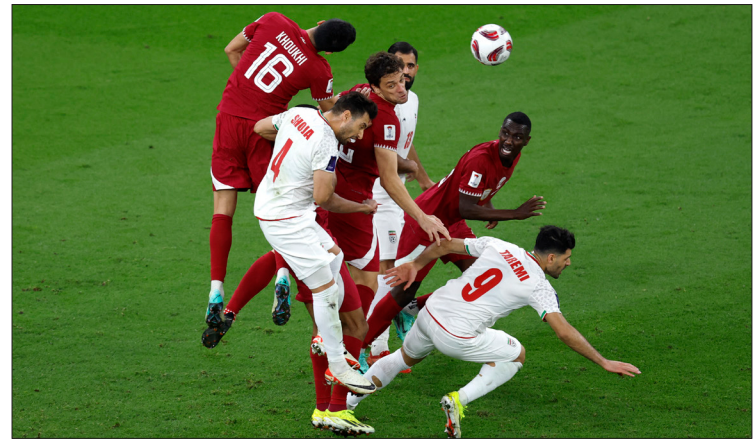
Qatar's defender (16) Boualem Khoukhi heads the ball past Iran's defender (04) Shojae Khalilzadeh and forward (09) Mehdi Taremi during the Qatar 2023 AFC Asian Cup semi-final football match between Iran and Qatar at al-Thumama Stadium in Doha on 7 February 2024. PHOTO: AFP

Qatar's Akram Afif then notched his fifth goal of the tournament with a wonderful strike minutes before half-time. only for Iran to equalize through an Alireza Jahanbakhsh penalty early in the second period. — AFP