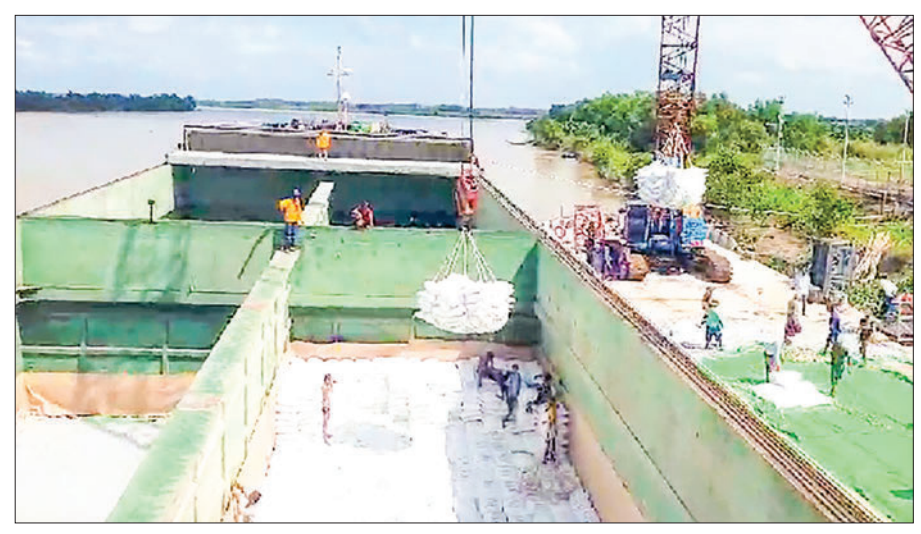
File photo shows bags of export rice being loaded onto the overseas-going cargo ship at international port in Pathein.

The MOU will be signed soon; therefore, the recent meeting held at Bangladesh's Ministry of Commerce decided to gather opinions from the stakeholders concerned in late February. They are asked not to make excessive changes in the proposed draft in detail so that it can be finalized shortly.