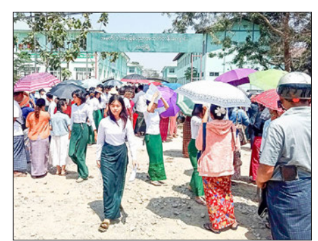
Thandwe Township, Rakhine State.