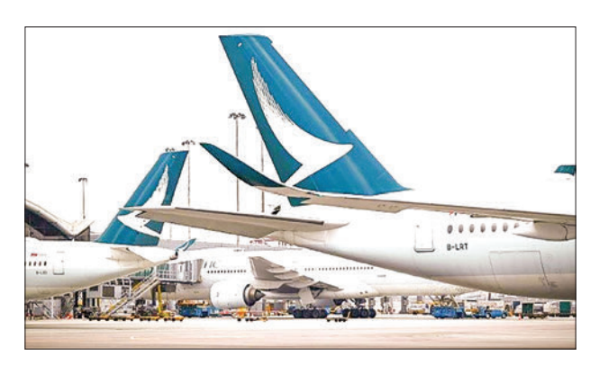
Cathay Pacific's net profit of $1.25 billion was the airline's first since 2019.

Despite the positive turnaround, executives recognize that the rebound will be gradual, considering the prolonged impact of the pandemic on global travel.