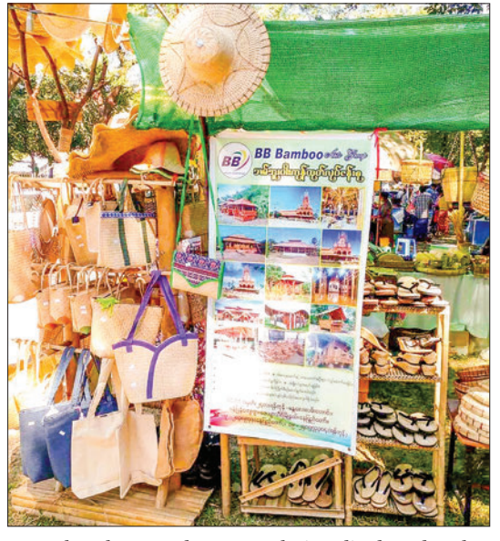
Some bamboo products seen being displayed at the shop.

"If we are capable of mass production, we can compete in the international market. Training on bamboo handicrafts has been conducted occasionally in our country, but too few. We need support to compete in the international market. Bamboo production has been still weak in the local market.