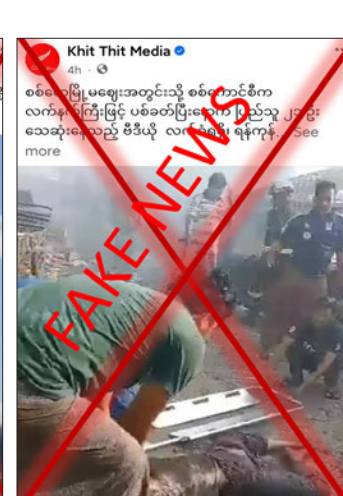
Screenshots validate misinformation and false claims of Khit Thit

and villages using heavy weapons, improvised missiles, and drones, disregarding the lives and property of the Rakhine people. Khit Thit media is con-