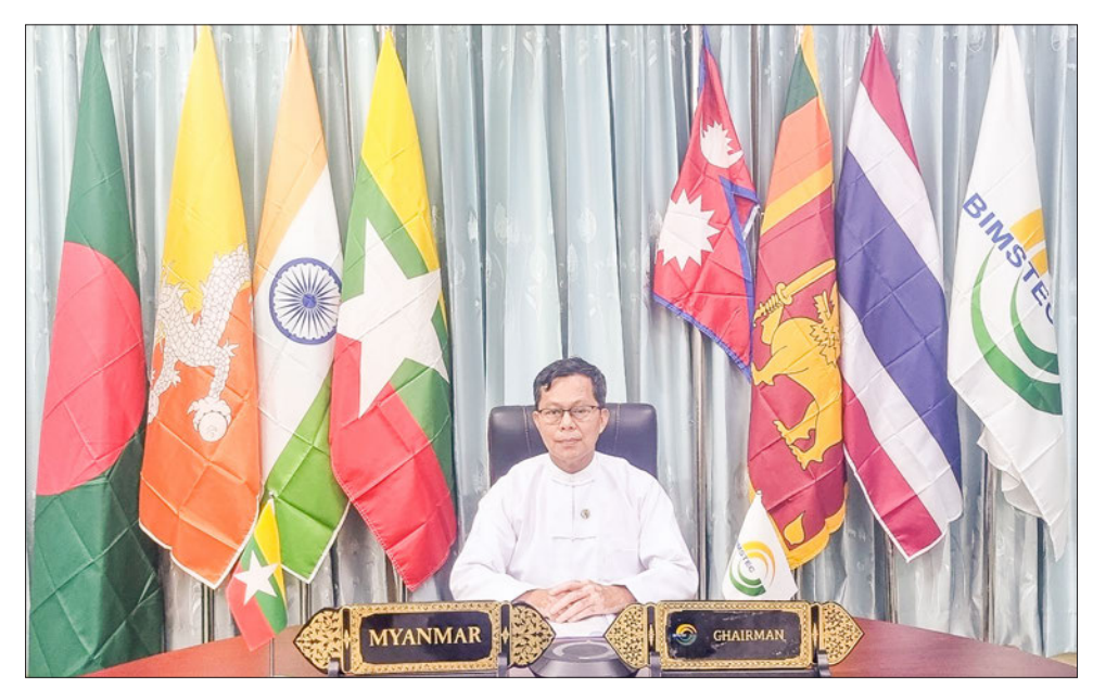
The First Meeting of the BIMSTEC Expert Group on Fisheries and Livestock, which is hosted by Myanmar virtually, in progress yesterday.

MYANMAR virtually hosted the First Meeting of the BIMSTEC Expert Group on Fisheries and Livestock yesterday.