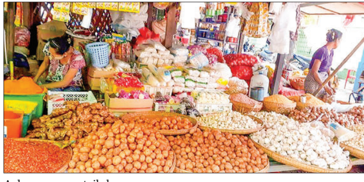
A dry grocery retail shop.

The prices of various pulses stood at K2,990,000 per tonne of