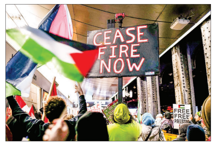
Pro-Palestine protesters gather at Jamaica train station in New York City on 27 January 2024.

Hamas plans to send a delegation to Cairo to discuss a ceasefire deal, including the release of Israeli prisoners of children, women, and the elderly.