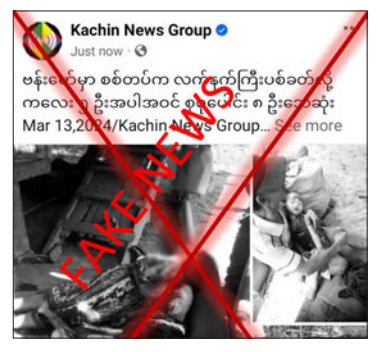
The screenshot validates misinformation of Kachin News

MALICIOUS media outlets have been spreading false news on social media, accusing security forces of attacking Mongka, Moeseinkyun, Sintkin and Kanni villages in Bhamo Township,