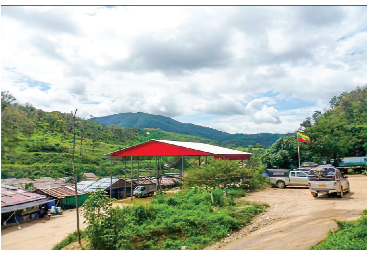
The Hteekhee trade post on the Myanmar-Thai border.