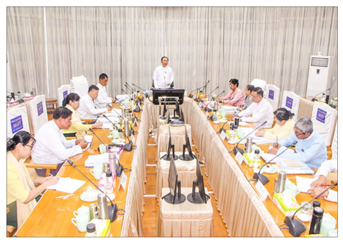
Deputy Prime Minister Union Planning and Finance Minister U Win Shein chairs the Union Price Stability Committee meeting 1/2024 yesterday.

He added that the Central Statistics Organization and Department of Consumer Affairs collected the price lists of 14 essential foodstuffs in 22 townships starting from August 2023 and released the opinions and market status daily. According to the prices reported by the region/state committees to the Union Committee once every two weeks, the rice prices were slightly high in some