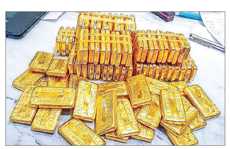
Premium gold of the Academy emblem with rising price on the market.

According to a request letter issued by the YGEA on 12 March, gold traders have been urged to trade just below the prescribed price and to avoid spreading rumours and speculations.