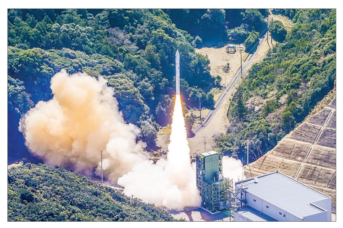
Photo taken from a Kyodo News helicopter shows the Kairos rocket lifting off from Space Port Kii in Kushimoto, Wakayama Prefecture, on 13 March 2024, shortly before it exploded.

Local firefighters were dispatched to the scene. Police said there have been no reports of casualties so far. The rocket exploded midair around five seconds after liftoff, as fragments believed to be from the projectile were scattered around the area, and the scene was blanketed