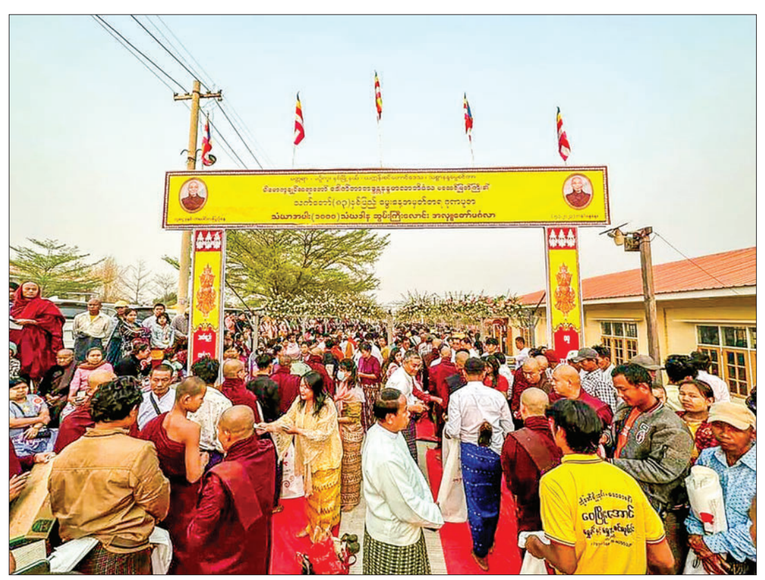
The 83<sup>rd</sup> birthday celebration was held in 2023.