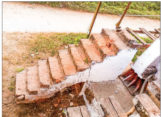
Photos depict the Kabaung Bridge, which is located between Toungoo and Thaungdinegon stations in Toungoo Township, Bago Region, was exploded by terrorists on 12 March.

AN explosion occurred on the Kabaung Bridge, a 680-foot-long beam bridge located between Toungoo and Thaungdinegon stations in Toungoo Township,