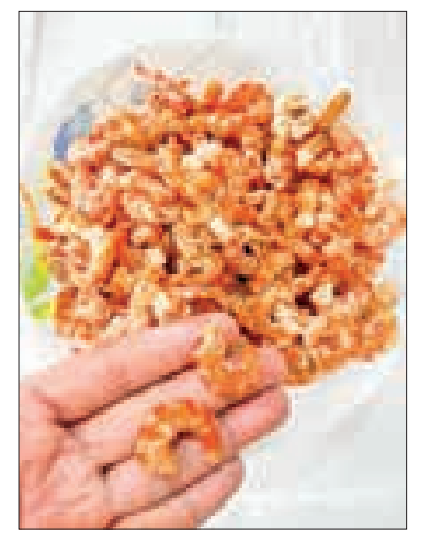
Myeik-produced dried shrimp are on display at the market.

The majority of dried shrimp, which are commonly available in the market, are produced in Rakhine State and