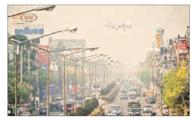
An Air Asia plane descends towards Chiang Mai International Airport amid high levels of air pollution in Chiang Mai on 10 April 2023.

Thailand's former prime minister Thaksin Shinawatra, who was recently freed early from a jail sentence for graft and abuse of power following 15 years in self-exile, visited the market on Friday, donning a face mask while he posed for photos with well-wishers. High levels of pollution frequently hit Thaksin's hometown of Chiang Mai during the early months of the year when farmers often burn crops to clear land, and forest fires and exhaust fumes also add to the problem. — AFP