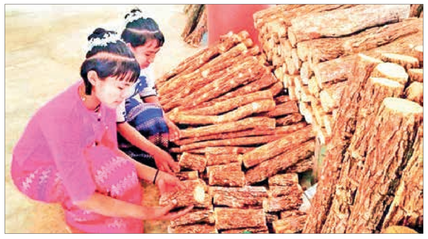
The photo depicts Myanmar Thanaka and Myanmar damsels sorting out Thanaka barks.

yanmar Thanaka will be processed into ready-to-apply products for export to the ASEAN market, as announced by the Myanmar Thanaka Growers and Exporters Association.