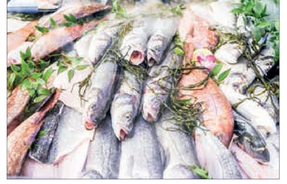
Seafood samples are displayed at the 2024 Seafood Expo North America in Boston. Massachusetts, the United States, 10 March 2024.

China has full-fledged industry chains for tilapia, and tuna and other aquatic products that are a kind of necessity in people's daily life, Deng said, adding that quite a number of poten-