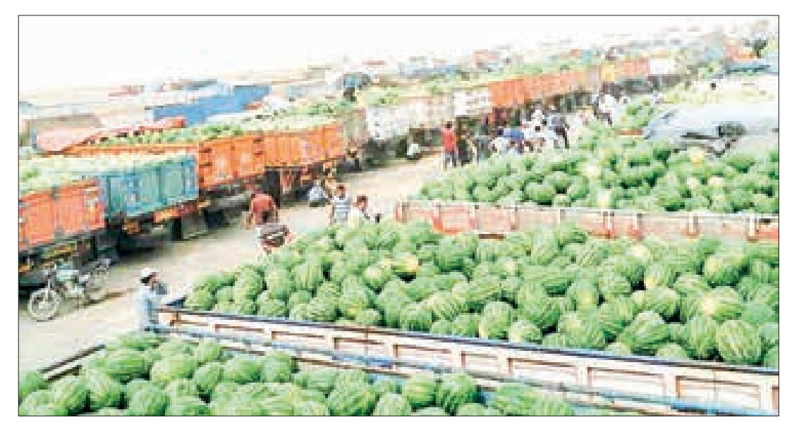
The photo showcases Myanmar watermelons that are to be exported to China.

WATERMELON exports from Myanmar to China are struggling to gain market share due to the conditions of transport routes, according to fruit depots.