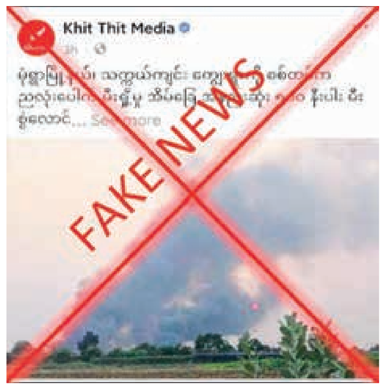
The screenshot validates misinformation.

Khit Thit malicious media circulates fake news alleging security forces