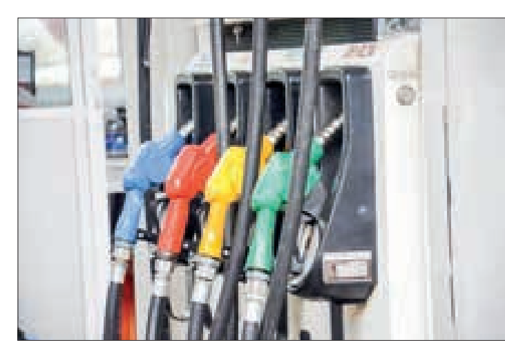
Pumps from a refuelling station in Yangon. The figures reflected a slight increase of K50 to K55 per litre.

OCTANE prices moved up slightly in the domestic fuel oil market as the MOPS price index ticked up.