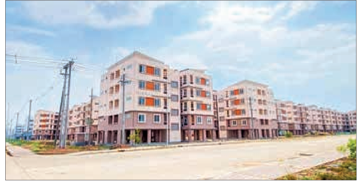
The Thukha Dagon public rental housing.

"When some are actually struggling to obtain living permits, the house owners involve in the drawing-lots system. At