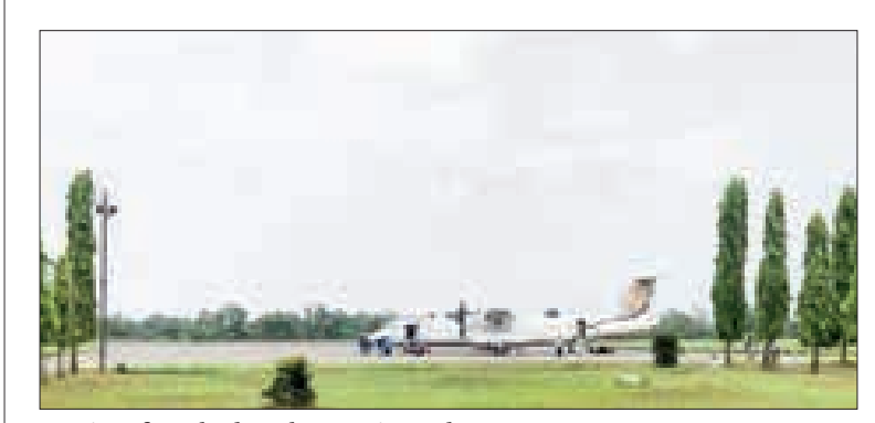
An aircraft parked at Bhamo Airport last year.

AEROPLANES resumed land- has made it convenient for peo-