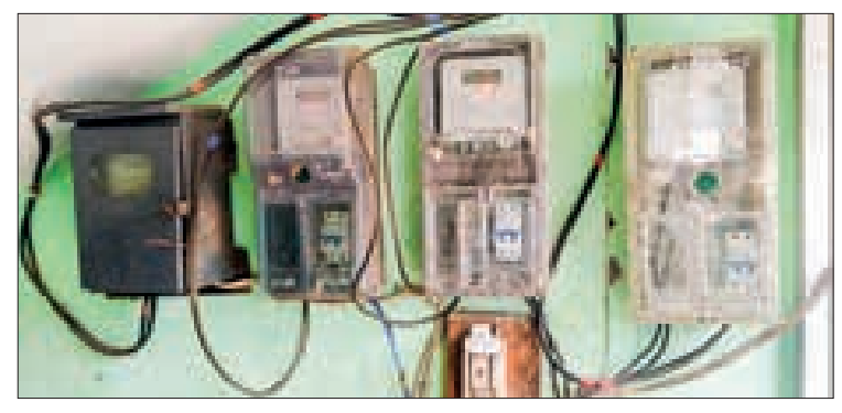
The photo depicts household electricity meter boxes.

fail to pay their bills, and it will be restored upon payment. — TWA/TRKM