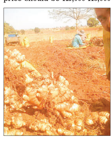
Ginger bags being loaded onto trucks to transport to wholesalers.

"Price has gone up now, at around K3,700-K4,000 per viss at farms. The price started climbing up two weeks ago. Local ginger costs K3,000 and Japanese ginger about K4,000. Pinlon is the biggest wholesale market. The retail price can't be said because retailers sell ginger at K5,000, K6,000 and K7,000. Retail price varies. Generally, wholesale price should be K5,000-K6,000