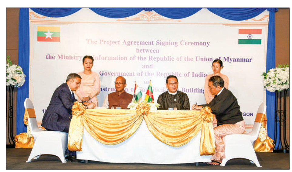
The signing ceremony for the Sarsobeikman construction project agreement in progress yesterday in Yangon.

The Union Minister underscored that the proposed building aims to celebrate accomplished Myanmar writers and literature itself. In this building, historical, literary materials that everyone can study the history of Myanmar literature will be displayed. Moreover, palm-leaf inscriptions (Pe and Parabaik), hand-written scripts of famous Myanmar writers, their photographs and biographies, rare books, literary prize medals, and photographs of various types of printing presses that have been used for generations throughout the history of Myanmar printing will be showed as a gallery. Likewise, literary events such as literary conferences and seminars, literary award ceremonies, literary talk