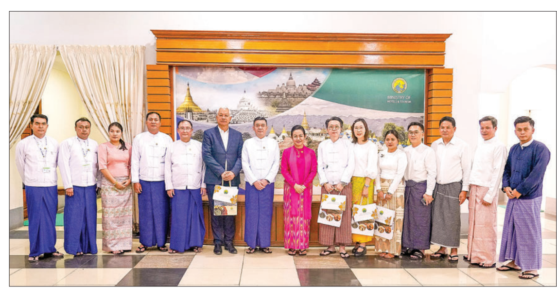
Union Minister Dr Thet Thet Khine poses for the group documentary photo at yesterday's event.

devised to attract tourists from Thailand and beyond, including discussions on Kachin State's snow-capped mountain region, a renowned ASEAN travel destination. Initiatives include inviting Thai business people to explore the area, promoting tourism investment, creating promotional videos, and boosting cooperation with foreign travel documentaries through extensive social media promo-