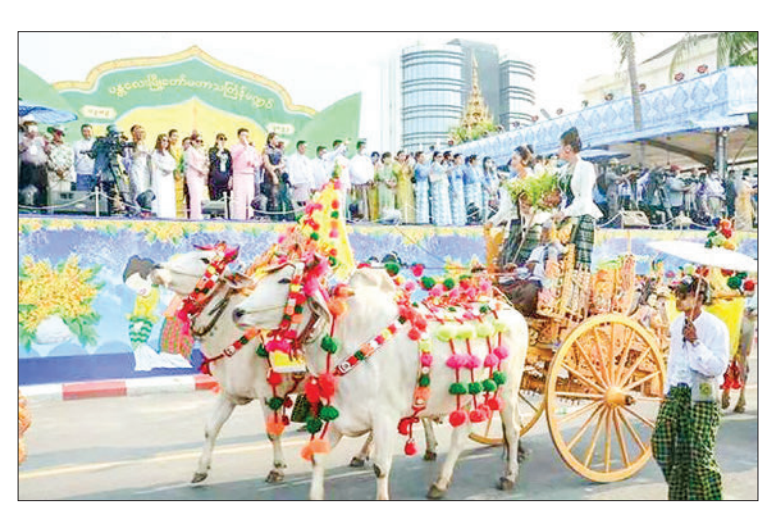
The photo shows a Thingyan decorated bullock cart representing the township at the opening of the Mandalay Thingyan Festival in 2022.

Additionally, festivities will be held in front of Mingala Mandalay, with walking Thingyan and