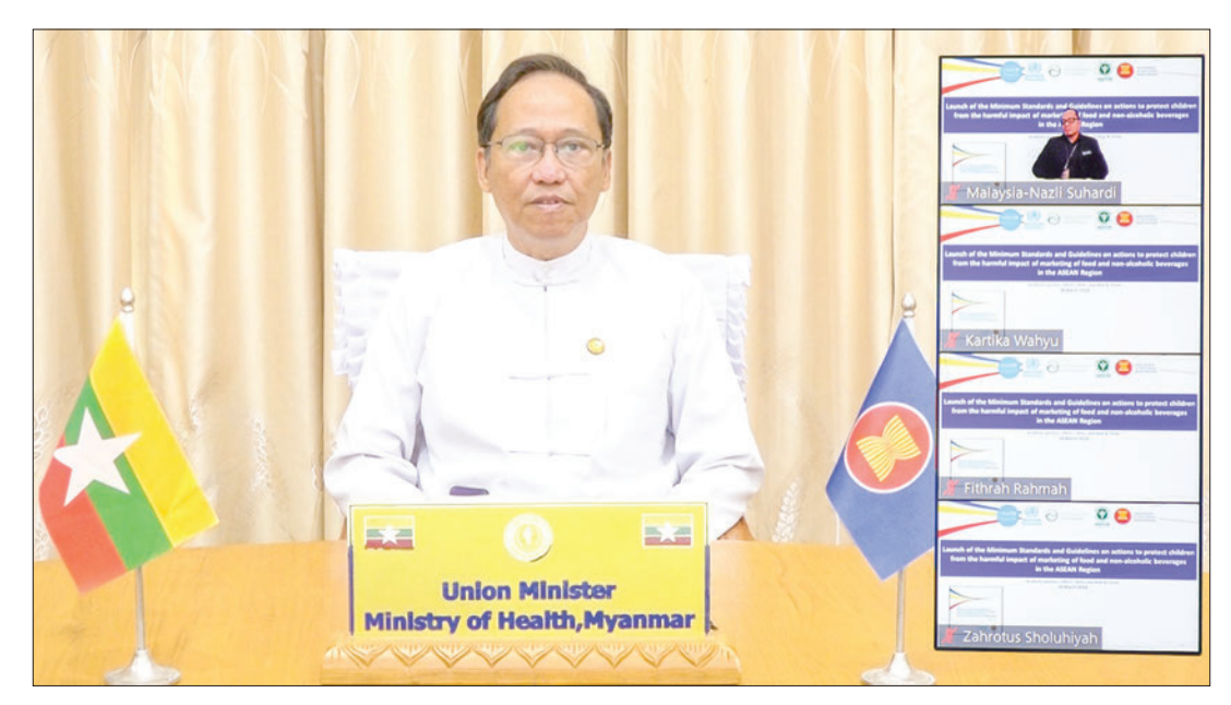
Union Minister Dr Thet Khaing Win virtually participates in yesterday's launching event.

A virtual ceremony was held in Bangkok, Thailand, to launch instructions and basic standards aimed at preventing the sale of food and alcoholic drinks harmful to children in the ASEAN region.