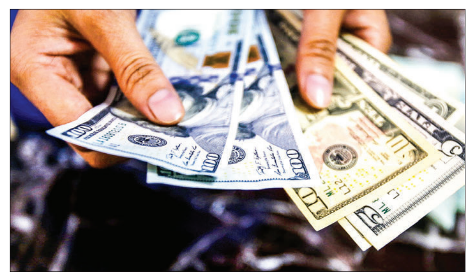
Counting greenbacks at the forex counter.

KYAT weakened to K3,700 against the US dollar on 18 March at the over-thecounter market.