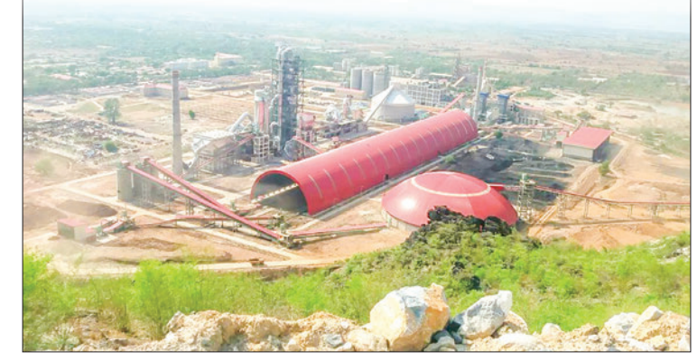
The photo shows No 33 Heavy Industry (Kyaukse) cement factory in previous years.

Efforts by the ministry and relevant departments are focused on fully operating cement factories, sourcing input materials domestically, ensuring the availability of high-quality input materials and machinery, and improving operational efficiency. These efforts aim to reduce reli-