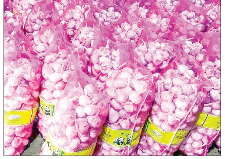
The photo depicts Chinese garlic being sold in the market.

In the second week of February, the price of locally-produced garlic dropped below K10,000, but due to high demand, the price is now K12,000-K13,000 per viss. In previous years, garlic prices were regularly around K5,000, and this year, they have increased. — Thit Taw/ZS