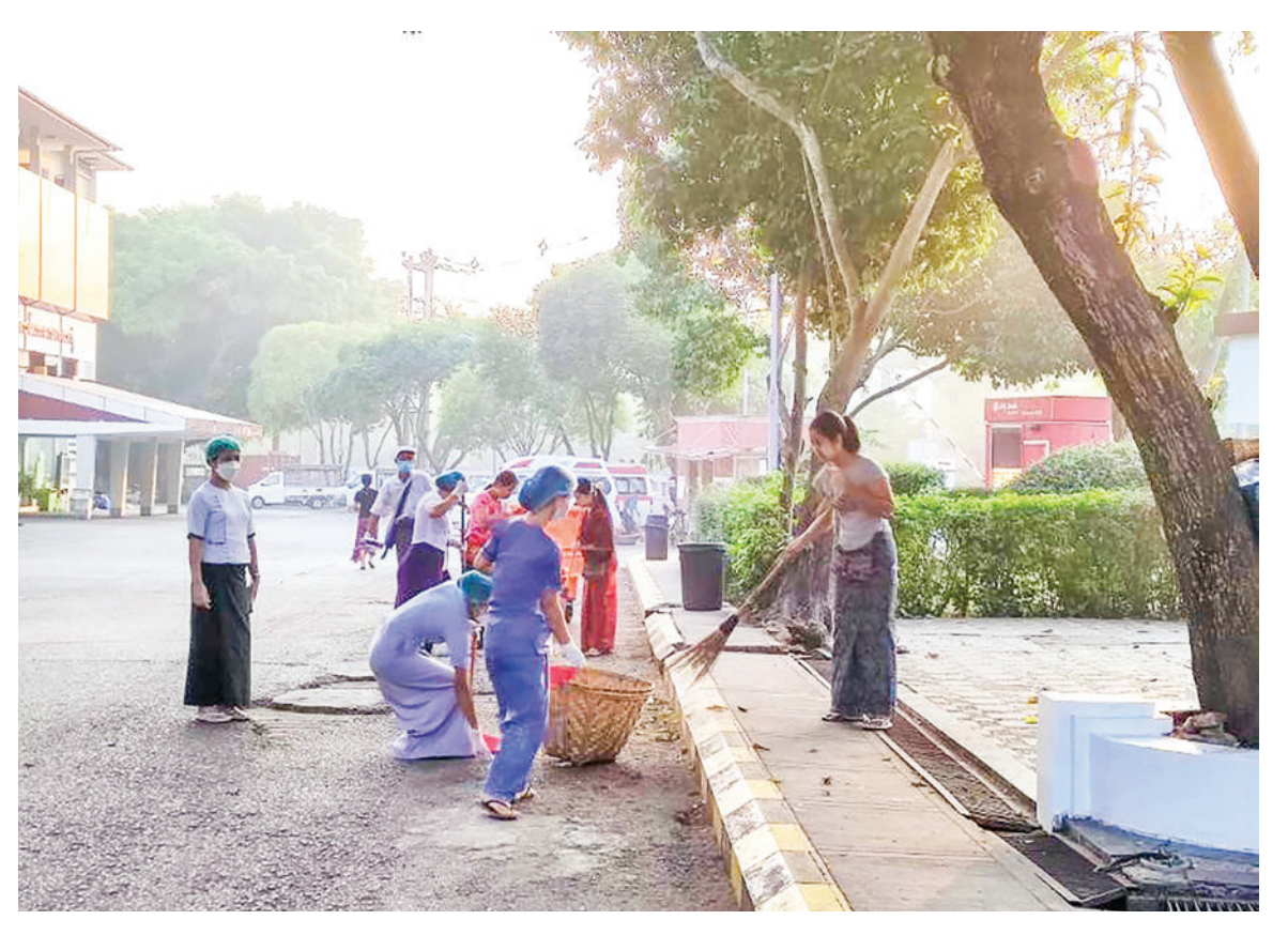
Hospital Environment Cleaning

Hospital management is the field of managing the administrative and operational aspects of healthcare facilities, such as hospitals, clinics, nursing homes, etc. Hospital management professionals are responsible for ensuring the quality of patient care, the efficiency of processes, the safety of staff and patients, the financial