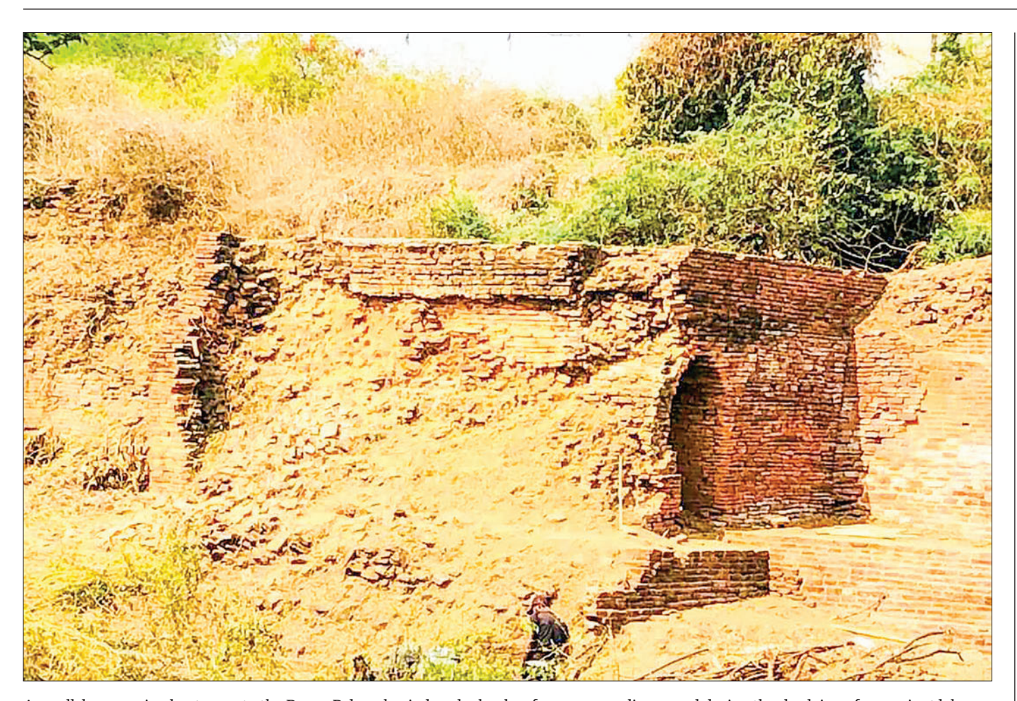
A small, human-sized entrance to the Bagan Palace, buried under bushes for ages, was discovered during the dredging of an ancient lake.