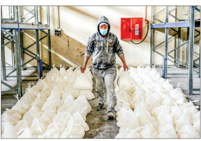
A worker sorts flour bags during the distribution of humanitarian aid in Gaza City on 17 March 2024 amid ongoing battles between Israel and the militant group Hamas.

The IPC hunger monitoring system, carried out by