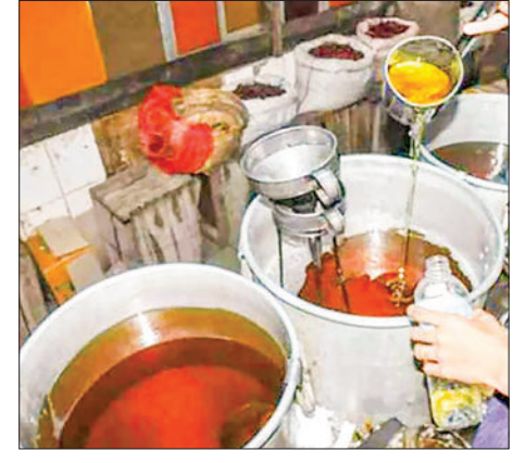
A vendor meticulously arranges edible oil for sale at the outlet.

To control overcharging, the Consumer Affairs Department under the Ministry of Commerce informed the