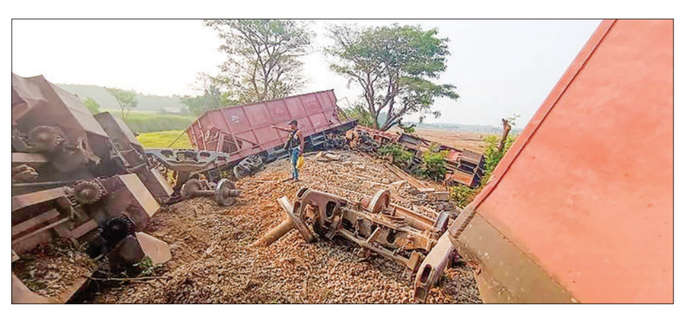
Photos show debris and damage left in the wake of the mine blast perpetrated by terrorists.

THE No 686 Down train, which ran for the Thaephyugon-Kali section on the Bago-Mawalmyine railway, derailed between mileposts 123/1-122/2 of Theinseik and Donwun stations after hitting a mine at 7:10 am yesterday. The mine was planted by insurgent groups.