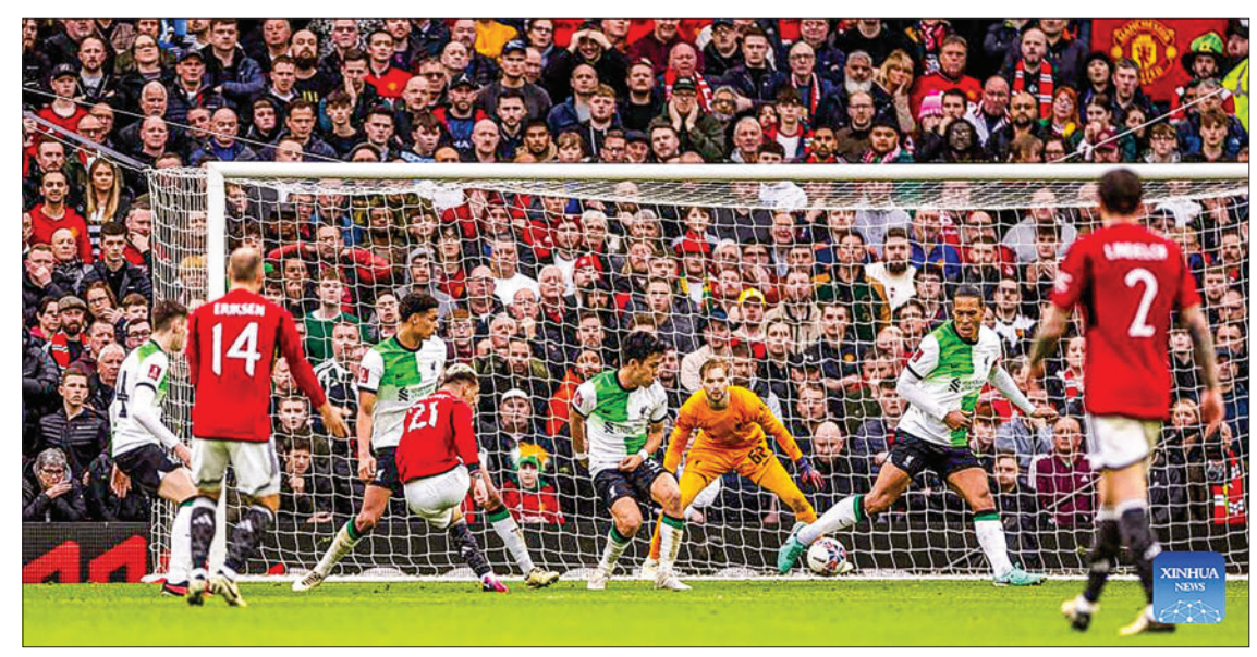
Manchester United's Antony Matheus dos Santos (4<sup>th</sup> L) scores during the FA Cup quarterfinal match between Manchester United and Liverpool in Manchester, Britain, on 17 March 2024.

United will face Championship club Coventry in the FA Cup