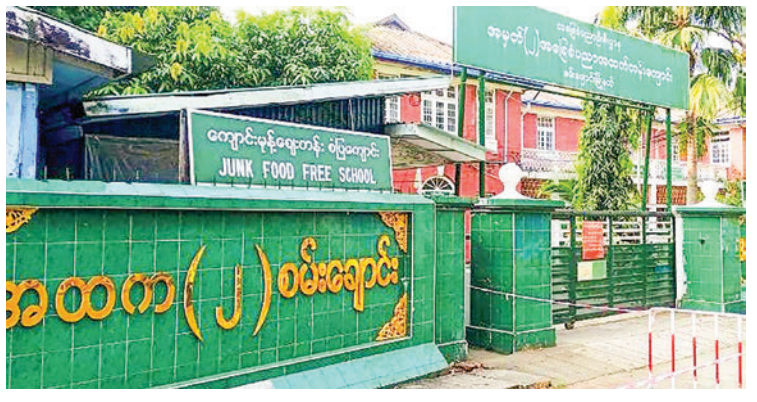
One of the examination centres in Yangon Region - BEHS 2 Sangyoung.

Yesterday, a female student from Yangon Region took the social science subject in the matriculation examination. — MNA/ TTA