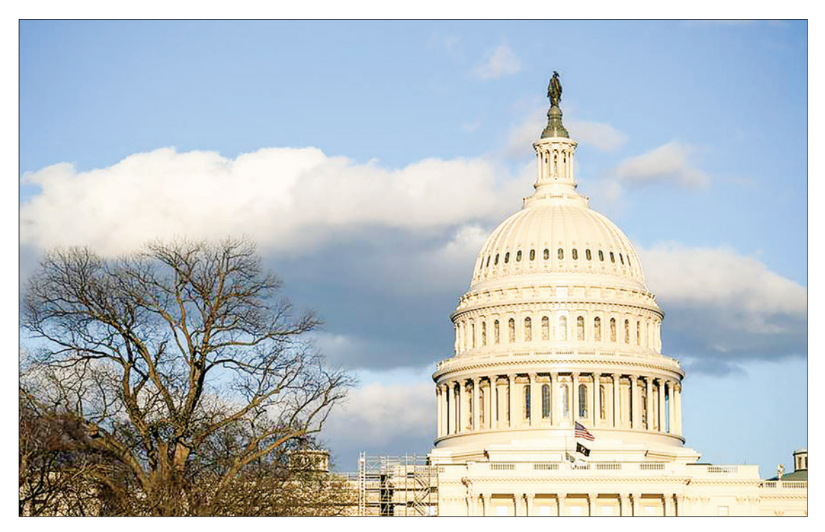
Photo taken on 28 March 2022 shows the Capitol building in Washington, DC, the United States. PHOTO:

Little wonder, the list of challenges troubling US socie-