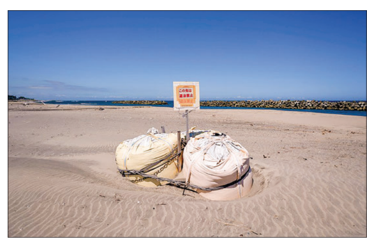
This photo taken on 22 August 2023 shows a "No Swimming" warning sign at Tsurishihama beach in Shinchi town, Fukushima prefecture, Japan.

As per the initial plan, approximately 31,200 tonnes of wastewater, containing radioactive tritium, was released into the ocean since the discharge started in August 2023, with each round of discharge carried out for about