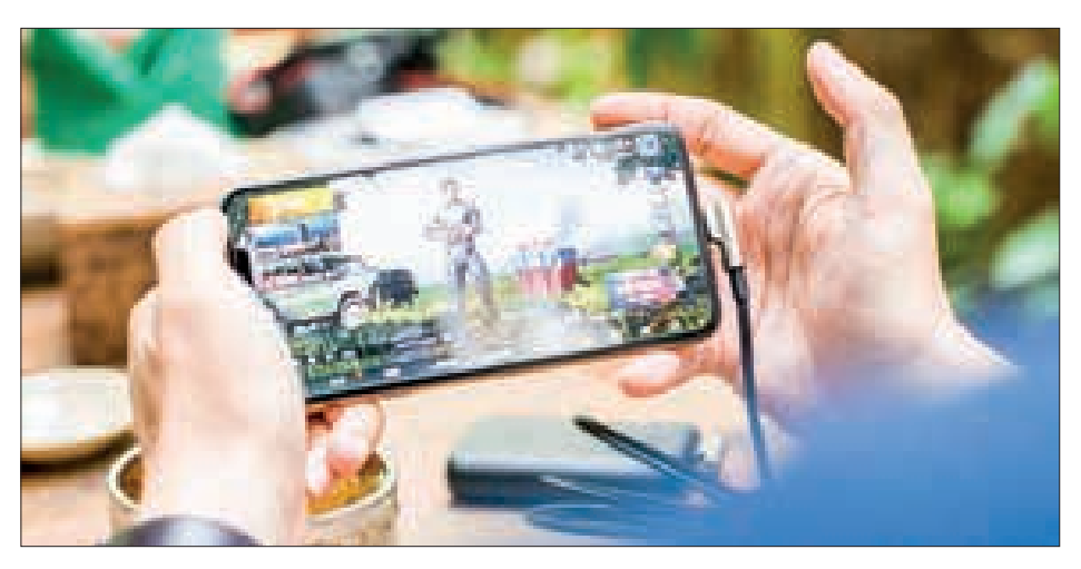
The actual sales revenue of domestic mobile gaming market reached 18.26 billion yuan, representing a remarkable surge of 17.88 per cent compared with the same period last year.

The domestic mobile gaming sector showed significant growth, with sales revenue reaching 18.26 billion yuan, a remarkable increase of 17.88 per cent year on year.