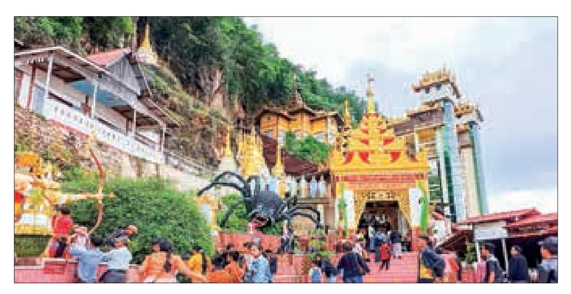
Flocks of foreign visitors seen in destinations of Myanmar.

Yangon Region Investment Committee reportedly allows new investments of Myanmar citizens and foreigners every month in order to create new job opportunities. – ASH/ TMT