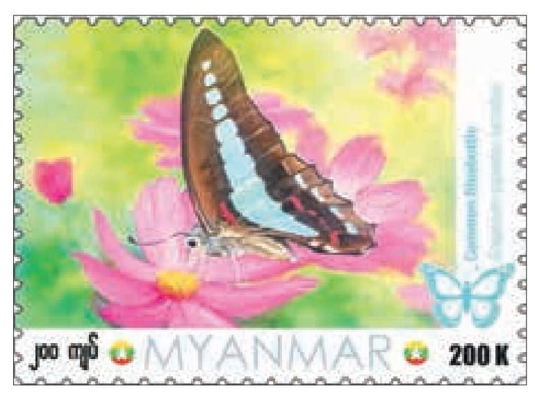
New stamp worth K200 depicting Common Bluebottle butterfly.

STARTING from 9:30 am on 27 March 2024, Myanma Post under the Ministry of Transport and Communications will start selling new stamp worth K200 depicting Common Bluebottle butterfly.