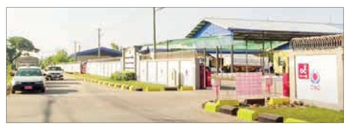
The CNG Department of MOGE seen with taxis for inspection.

ACCORDING to the CNG Department under the Myanma Oil and Gas Enterprise (MOGE) of the Ministry of Energy (MoE),