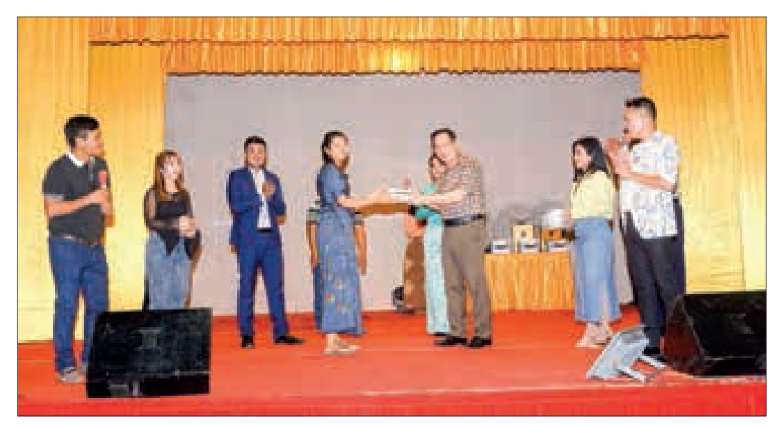
Union Minister for Information U Maung Maung Ohn presents gift to an artiste who performed entertainment for parade columns through the draw-lot system.

U Maung Maung Ohn, Union Minister for Information, attended an entertainment honouring the parade columns participating in the 79<sup>th</sup> Anniversary of Armed Forces Day parade held at the No 3 Transit Centre in Nay Pyi Taw yesterday.