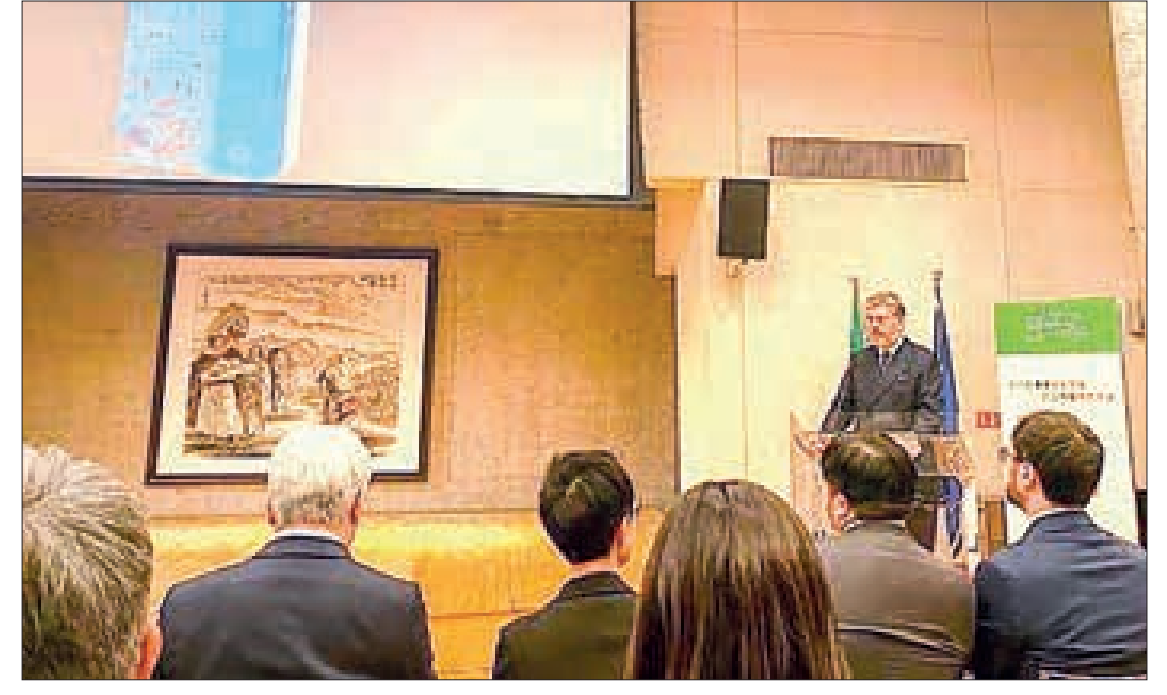
This photo taken with a mobile phone shows Italian Ambassador to China Massimo Ambrosetti speaking during an event commemorating the 700<sup>th</sup> anniversary of Marco Polo's death at the Italian Embassy to China in Beijing, capital of China, 20 March 2024.

This innovative approach intertwines Polo's accounts of China with Calvino's imaginative tales, aiming to ignite Chinese readers' interest in classic Italian literature.