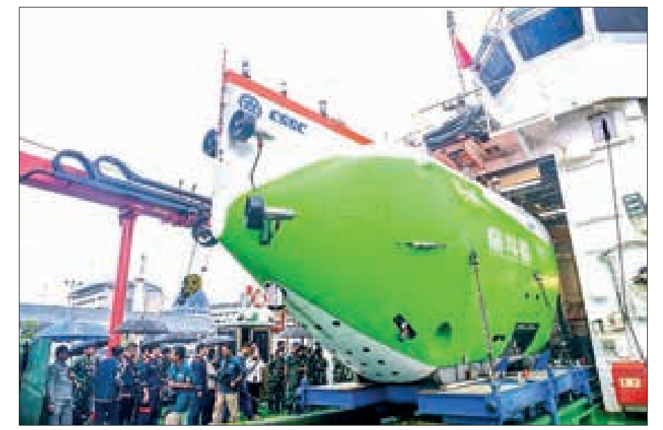
This photo taken on 22 March 2024 shows manned deep-sea submersible "Fendouzhe" on Tan Suo Yi Hao (Discovery One) at the Tanjung Priok Port in Jakarta, Indonesia.

"I hope scientists from the two countries will achieve more high-quality research achievements in the future, contributing more to the creation of a blue ocean economy and sustainable development."