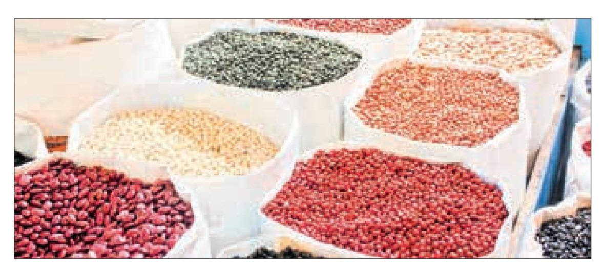
Pulses and beans seen in the domestic market.

Prices of green gram, chickpea and exported beans with FOB prices have been trending down within this week. On 16 March, black gram RC price was K3.02 million per tonne, red pigeon pea was K3.863 million per tonne. However, the prices were falling during three consecutive days from 18 to 20 March, it was priced at K2.877 million on 20 March. On the following