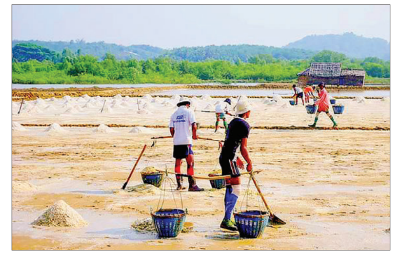
The photo depicts salt farms in Labutta Township, Ayeyawady Region.

"A total of Thirty thousand and one hundred tonnes were produced in three months of this year's salt season from January to March. Coarse salt is mainly supplied to Yangon Region. Fine salt is distributed to its markets along the Ayeyawady River. It is