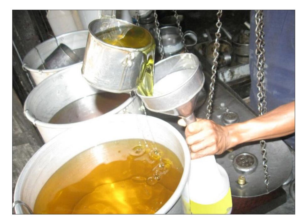
A vendor seen arranging edible oil for sale at the market.

THE wholesale reference rate of palm oil for the Yangon market remained unchanged at K5,250 per viss this week ending 31 March, like that of the previous week ending 24 March, according to the Supervisory Committee on Edible Oil Import and Distribution.