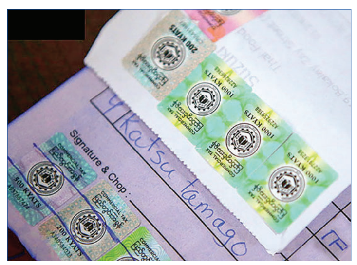
The photo shows a receipt with a tax stamp.

at businesses. Furthermore, business owners are obligated to provide stamped receipts, regardless of whether customers request them. — TWA/MKKS