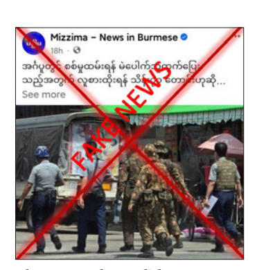
The screenshot validates misinformation.

Since the implementation of the People's Military Service Law, malicious media outlets have engaged in delib-