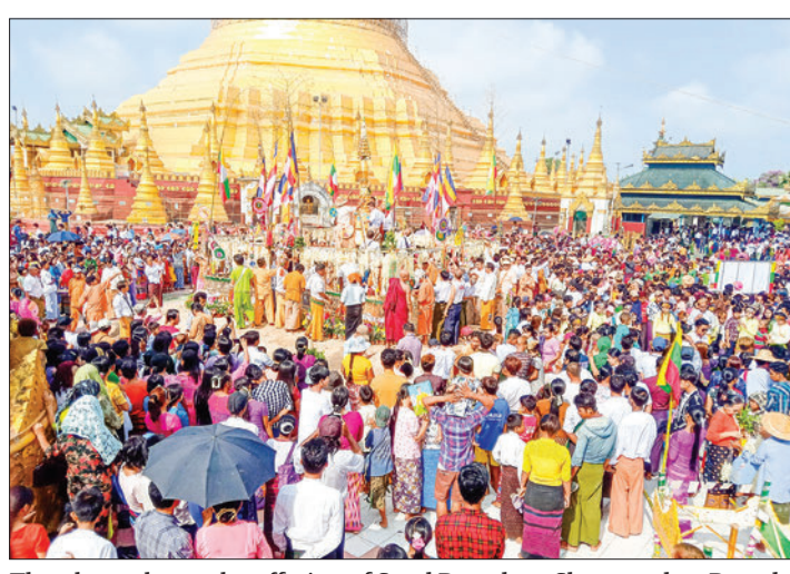
The photo shows the offering of Sand Pagoda at Shwesandaw Pagoda in Twantay in 2023.

lages — Shansugyi, Nyaungdaga, Muelaman, Ngakhan and Masan — collectively gather sand to construct the pagoda, adhering to measurements set by the Shan Literature and Culture Association (Twantay). The pagoda stands nine feet high.