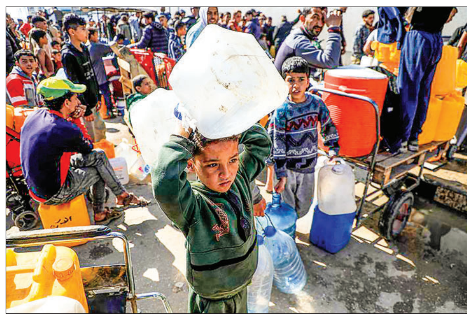
People wait to fetch water in the southern Gaza Strip city of Rafah, on 22 March 2024.

"We must strive to keep the one-ofa-kind services that UNRWA provides flowing because that keeps hope flow-