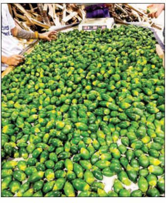
Green areca nuts.

"Young betel nut price is now slightly increasing. It varies from day to day. The price has changed three times in the last few days. The reason is the lower stock. Then the price goes up. As buyers rush to buy amidst the low stock, there is fluctuation in the market opening price rather than a rise in price. In later days, it is expected to fall again," said a betel nut shop owner from