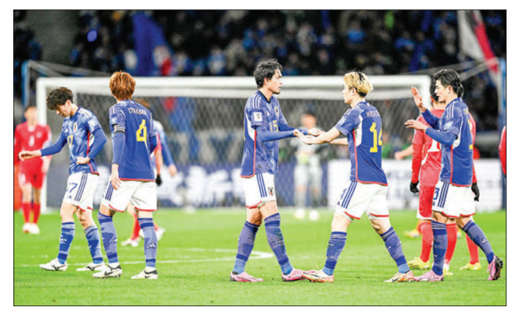
Japan's players celebrate their victory against North Korea during World Cup 2026 qualifier football match at the National Stadium in Tokyo on 21 March 2024.

the FIFA disciplinary committee," football's world governing body added.