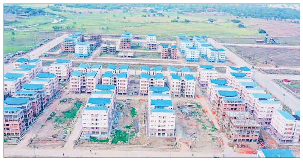
An aerial view of the new Thukha Dagon public rental housing in Dagon Myothit (South) Township, Yangon Region.

Prospective tenants from the public and retired personnel can obtain application forms from the township administration