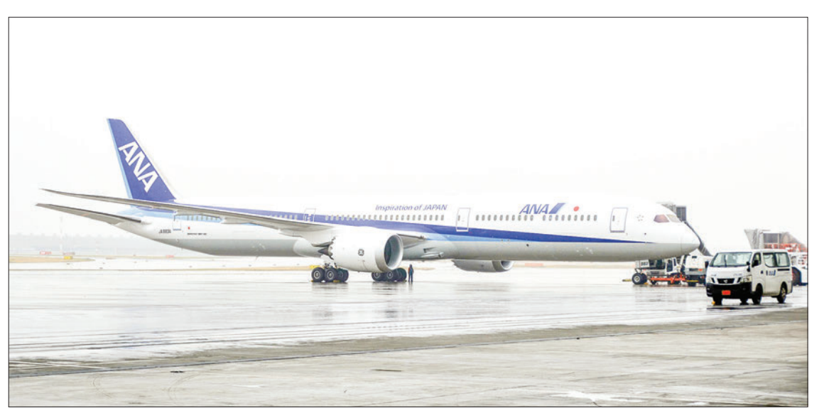
Photo taken at Tokyo's Haneda airport on 25 March 2024, shows All Nippon Airways Co's new Boeing 787-10 that will service domestic routes.

Türkiye's energy imports, which include oil, gas, and other products, were worth around 80 billion US dollars in 2022, according to official data. Akturk also pointed out that it will take years before the full extraction capacity is reached. — Xinhua