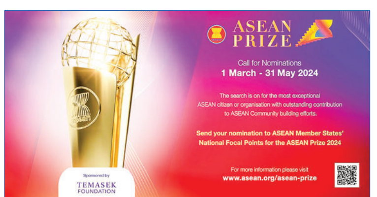
An invite poster of the event.

The winner will be awarded the ASEAN prize trophy and a monetary prize of US$20,000. -TWA/TKO