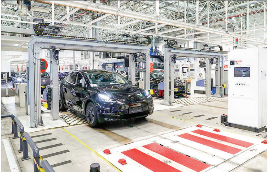
A Tesla electric vehicle undergoes electronic equipment testing before delivery at Tesla's Shanghai Gigafactory in east China's Shanghai, 22 December 2023.

China will take solid steps to accelerate the development of new quality productive forces, boost industrial innovation via technological innovation, speed up upgrading of traditional industries, and fos-