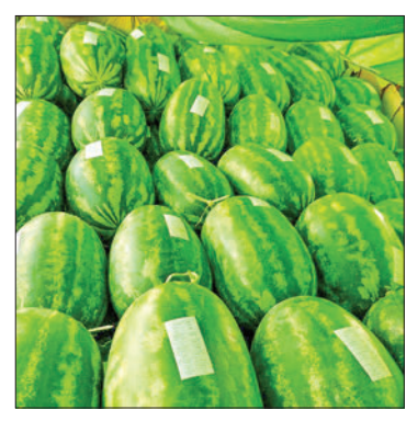
Watermelons are at Khwanyo fruit wholesale centre.

"People buy watermelon slices when they go around because the weather becomes scorching. Watermelons in whole pieces are also selling well. I sell watermelon at K5,000, K6,000 and K7,000 per one depending on fruit size," a watermelon seller in Dagon Myothit (Seikkan) Township told the GNLM. — MT/ZS