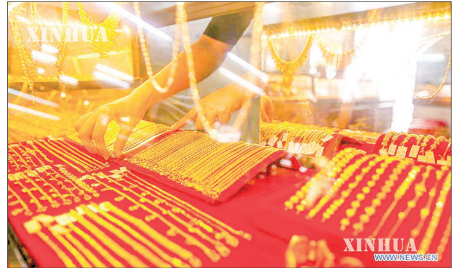
Gold ornaments are displayed at a gold jewellery outlet in Yangon. \, \, PHOTO - XINHUA \,

Those unscrupulous dealers are manipulating the market by misleading information. Authorities concerned are inspecting the cause of price fluctuations, and legal proceedings against them are being undertaken, the noti-