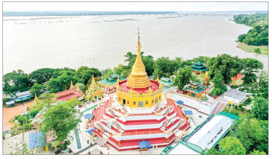
Photos above and below showcase famous destinations in Minbu.