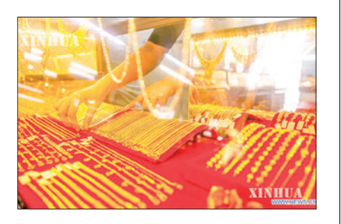
Domestic gold price hits new peak of around K4.3 mln per tical