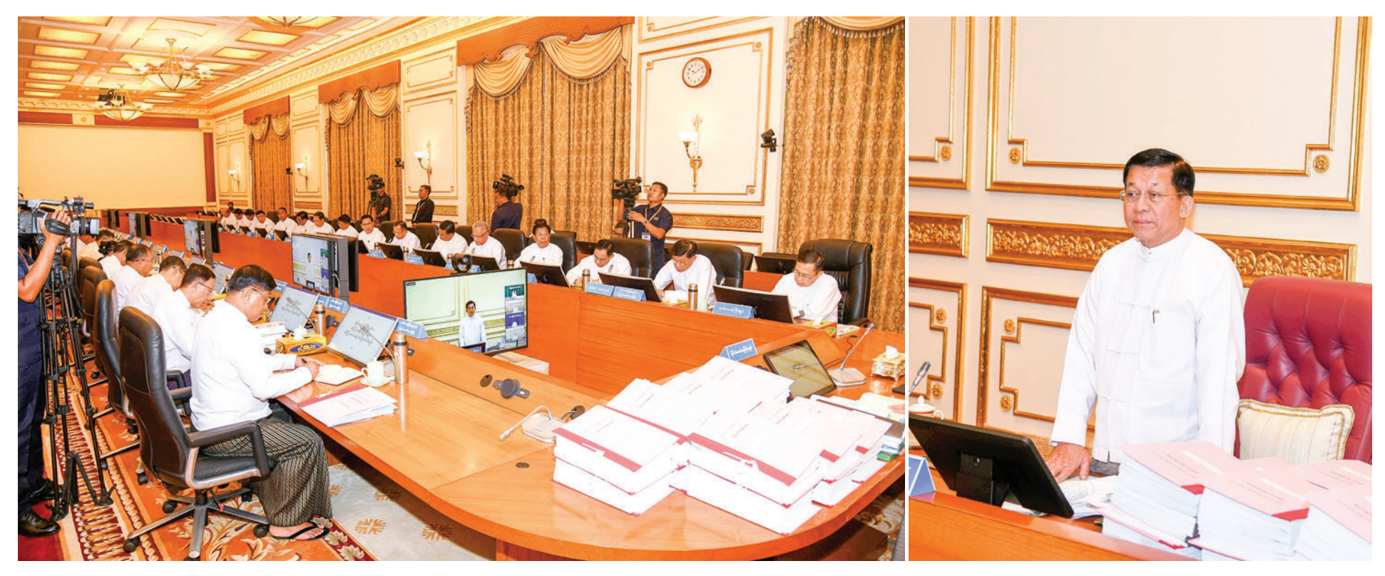
State Administration Council Chairman Prime Minister Senior General Min Aung Hlaing addresses the Union government meeting 3/2024 yesterday in Nay Pyi Taw.

NLY when productivity based on agriculture and livestock farming rises will the State's GDP boost, said Senior General Min Aung Hlaing.