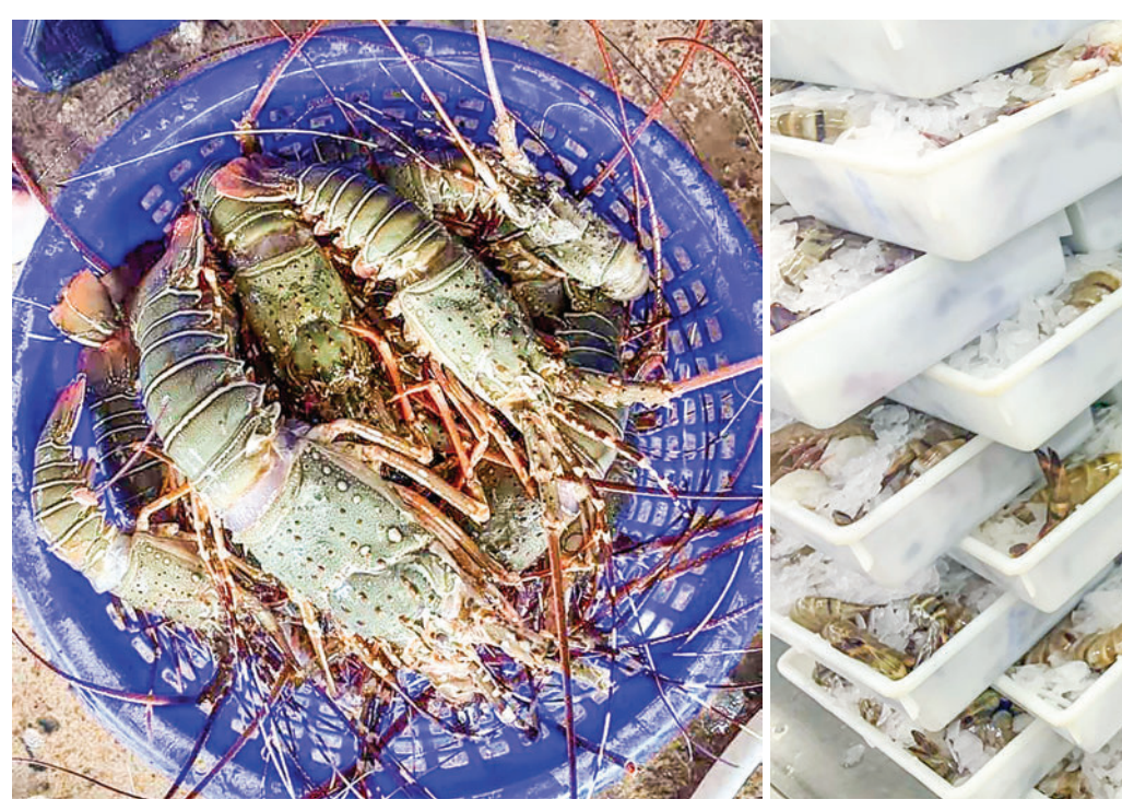
Captivating images showcase exported lobsters and processed fishery products from Taninthayi Region.

The figures showed a downtick compared with those of the corresponding period last year.