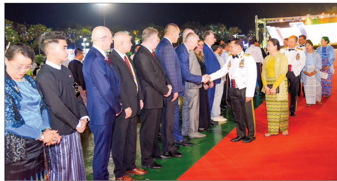
The Senior General cordially greets foreign attendees.