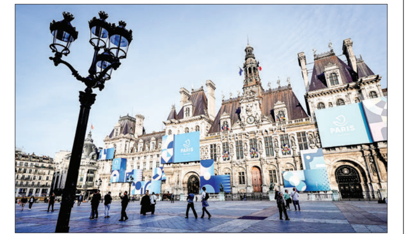
This photograph taken in Paris on 21 March 2024 shows a view of the Paris' city hall decorated with Paris 2024 Olympic and Paralympic Games' posters.

But a 2020 study by academics at the University of Oxford concluded that every summer Games since 1960 had gone over budget, with the average sports-related costs ending up between two and three times (172 per cent) the original estimate. — AFP