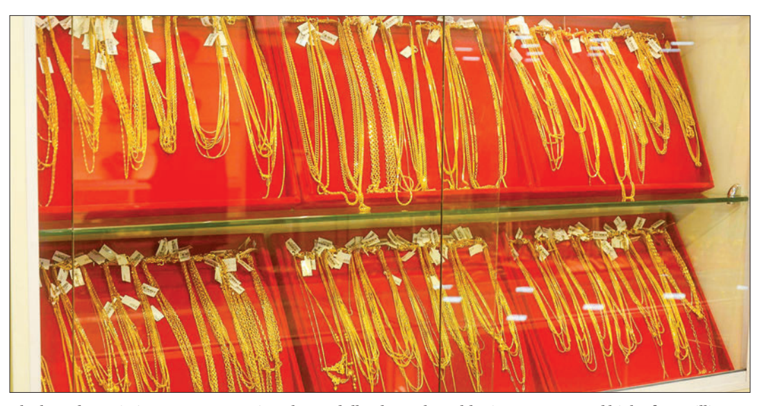
The kyat depreciation to K4,000 against the US dollar drove the gold price up to a record high of K4 million per tical in late August 2023.