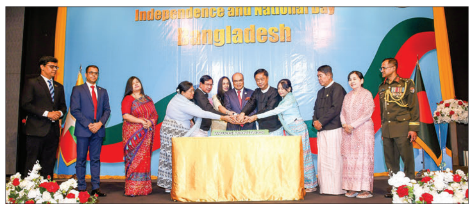
The reception of Bangladesh's 53<sup>rd</sup> Independence Day and National Day celebration in progress yesterday in Yangon.

THE 53<sup>rd</sup> Independence Day and National Day reception of Bangladesh was held yesterday at the Lotte Hotel in Yangon.