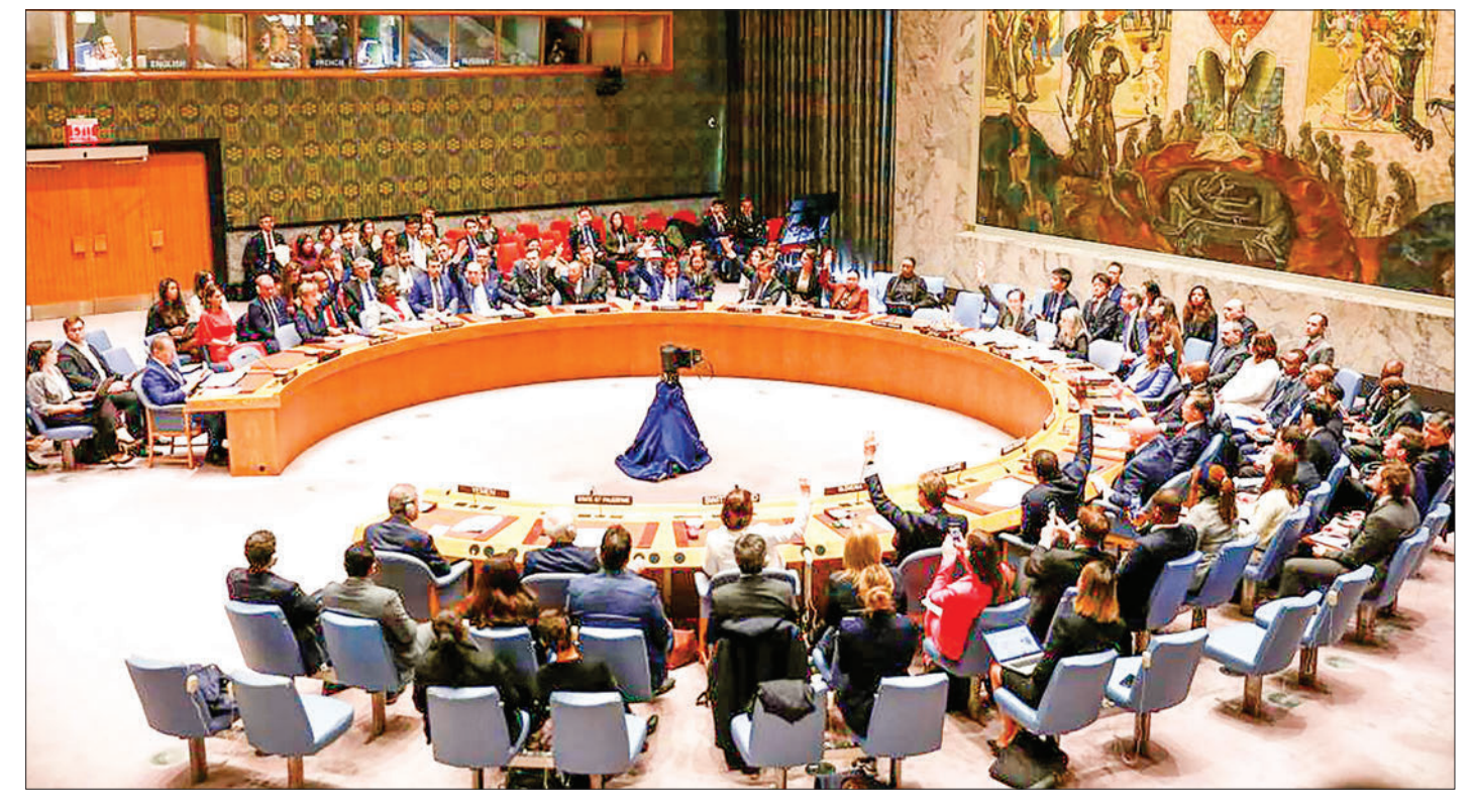
Representatives vote on a draft resolution during a Security Council meeting at the UN headquarters in New York on 25 March 2024. The Security Council on Monday adopted a resolution that demands an immediate ceasefire in Gaza for the holy month of Ramadan.

It also demands the immediate and unconditional release of all hostages, as well as ensuring humanitarian access to address their medical and other humanitarian needs. It further demands that