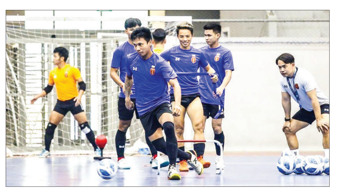
The Myanmar futsal team players are seen in their training session.

THE Myanmar national futsal team will play four international friendly matches before the final stage of the 2024 Asia Cup futsal tournament, which will be played in April.