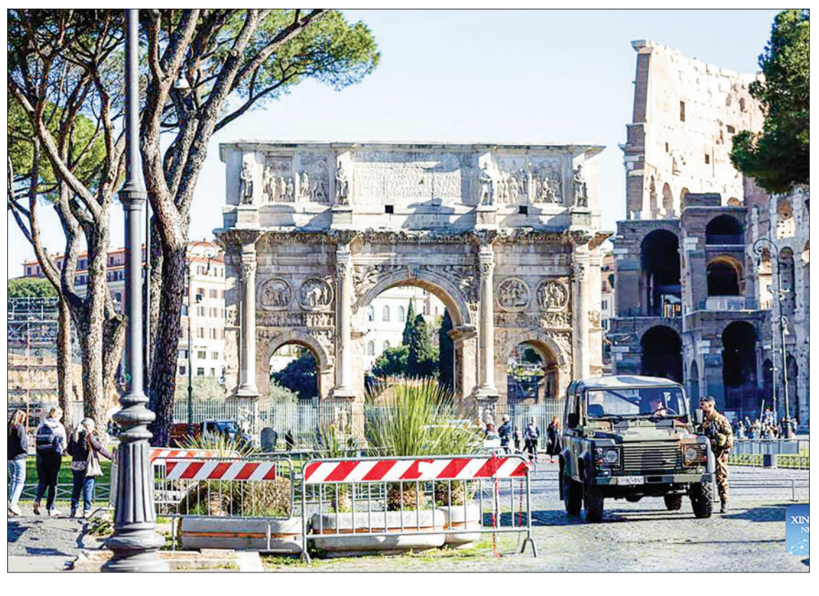
Italian soldiers stand guard in front of the Arch of Constantine in Rome, Italy, 25 March 2024.

Many foreign tourists also visit Italy in this period, with this number estimated at 3.3 million