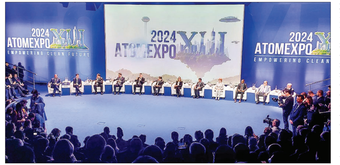
The XIII International Forum ATOMEXPO 2024 underway in the Russian Federation on 25 March 2024.

Next, the Union Ministers attend the launching ceremony of the XIII International Forum ATOMEXPO 2024, as well as the Plenary Session of the Forum, with the topic named "Clean