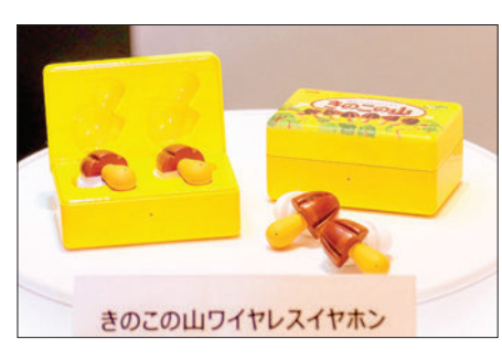
Photo taken in Narita, Chiba Prefecture, on 25 March 2024, shows wireless earphones designed after Meiji Holdings Co's chocolate snack "Kinoko no Yama".

WIRELESS translator earphones in the shape of the beloved Japanese mushroom-shaped chocolate snack "Kinoko no Yama", sold as "Chocorooms" in the