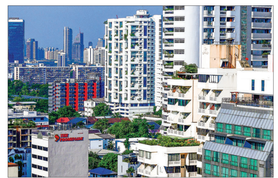
A general view shows residential and commercial buildings in Bangkok on 2 June 2023.

Thailand must also enhance tech competitiveness, strengthen competition regulations, attract skilled professionals, and empower small and medium-sized enterprises through increased access to finance for innovation, according to the report. — Xinhua