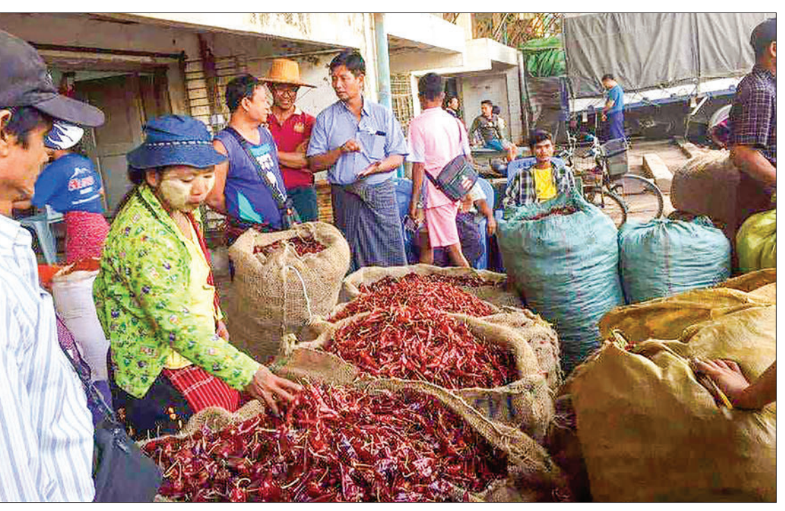
Chilli pepper sacks seen being piled up in front of a warehouse in the Bayintnaung area on 26 March 2024.

prices are declining in late March 2024, chilli pepper might reap a loss for growers. Traders who