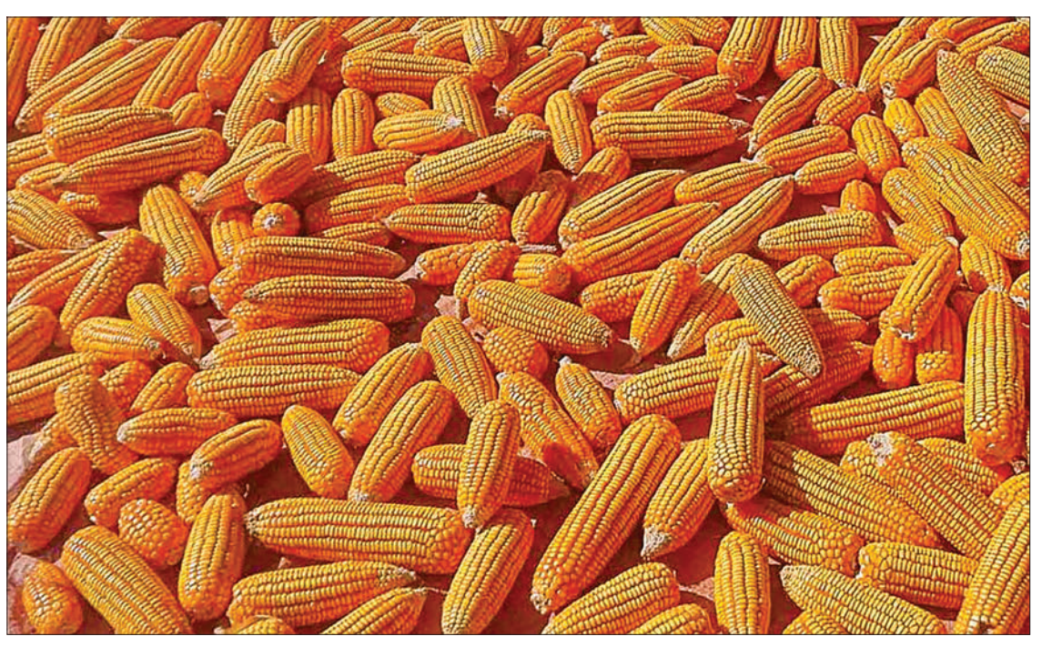
Myanmar exported over two million tonnes of corn to foreign trade partners in the 2022 corn season.

Myanmar exported over two million tonnes of corn to foreign trade partners in the 2022 corn season. The majority of them were sent to Thailand, and the remaining went to China, India, the Philippines and Viet Nam.