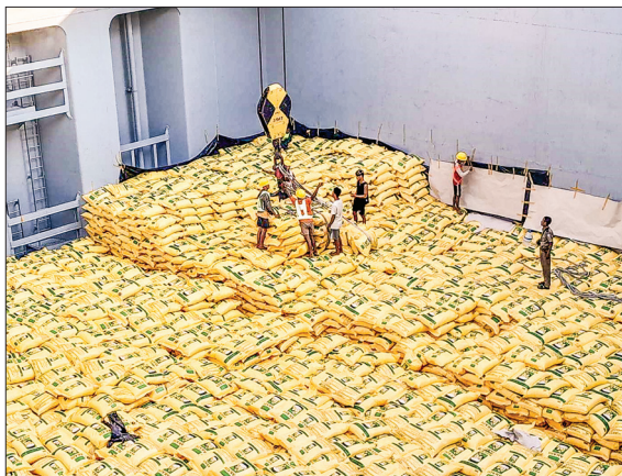
Port workers stowing export rice cargoes.