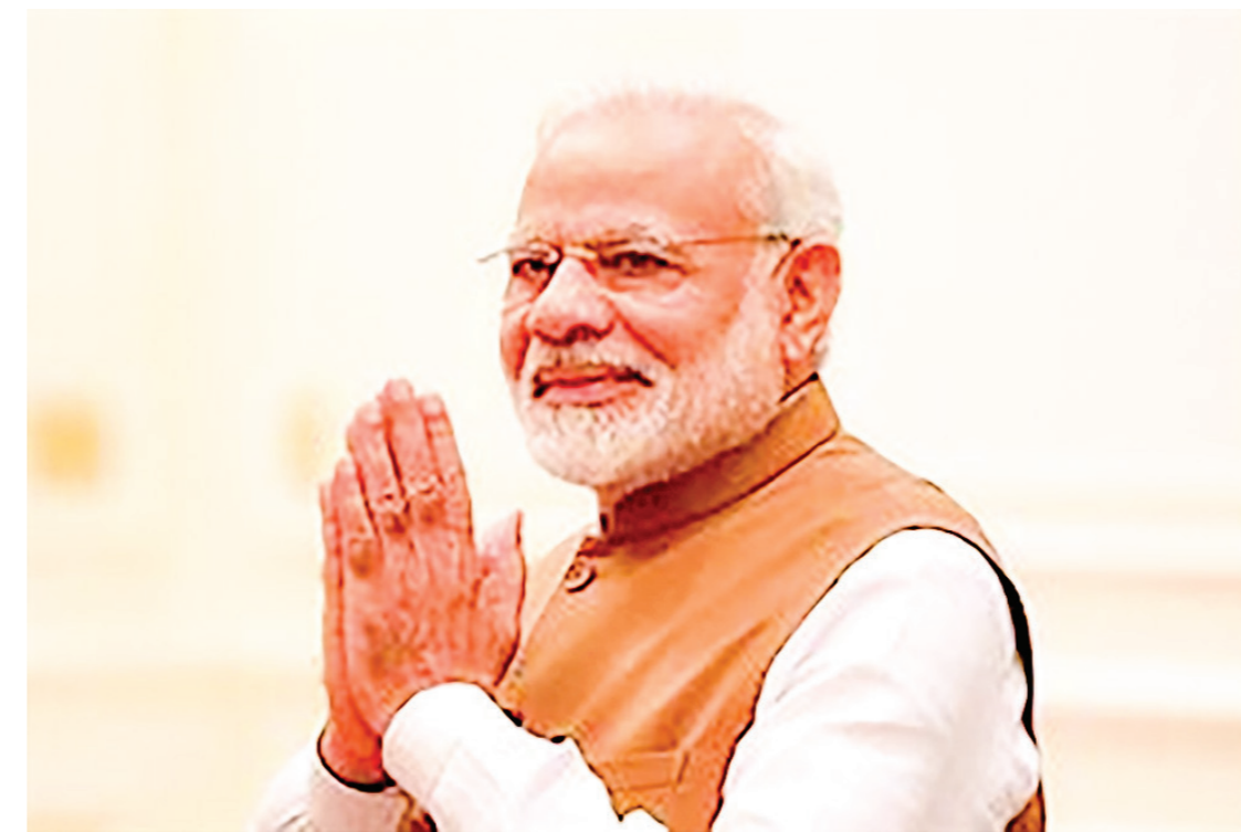
Indian Prime Minister Narendra Modi

A New Concept of Power-Integrated Ideal Power (IIP), which is the combination of four powers, includes soft power, hard power, smart power and just power. The strong points of power are increased efficiency, improved effectiveness, increased readiness, likelihood to show fairness, consistency, eth-