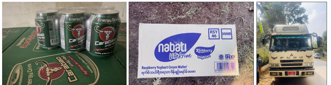
Seized illegal commodities and vehicle in Kayin State.

ON 1 March, a total of 2.878 tonnes of illegal timber worth K382,974 was seized in Yekyi Township and Maubin Township. This enforcement action was carried out under the Forest Law.