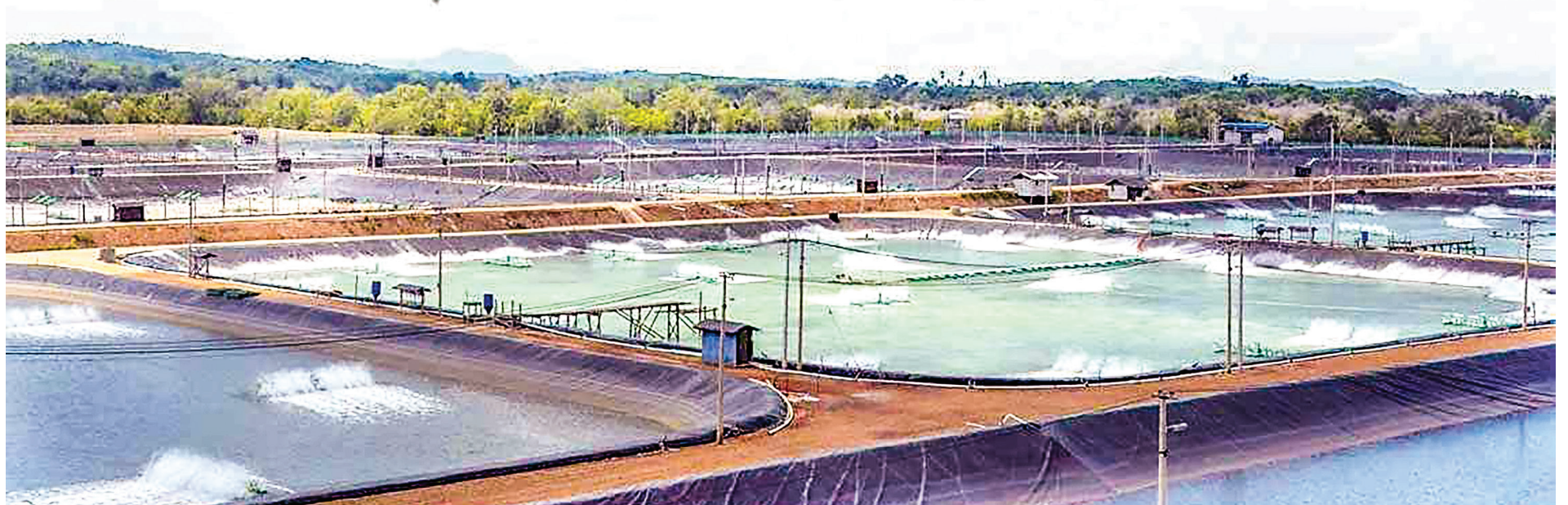
Some saltwater shrimp farming is seen in Myeik Archipelago. Several islands in the Myeik Archipelago, including Katan Island, Masanpa Island, Kyagyiaiw Island, and islands in Palaw and Thahtay, host saltwater shrimp farming businesses that export to the Thai market.

U Tun Naung Oo, the district officer of the Myeik District Fisheries Department (Taninthayi Region), reports a shift towards farming rather than fishing in the Myeik Archipelago. This change comes as saltwater shrimp farming businesses show reasonable success.