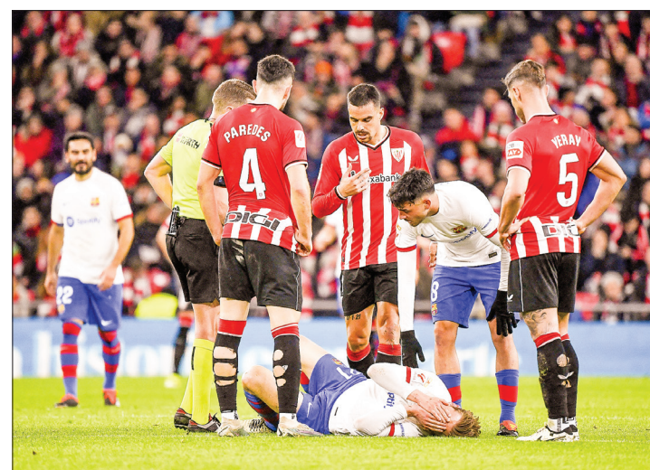
Both teams' players check on Barcelona's Dutch midfielder (21) Frenkie De Jong after resulting injured during the Spanish league football match between Athletic Club Bilbao and FC Barcelona at the San Mames stadium in Bilbao on 3 March 2024.

"We will see how they are between today Sunday and tomorrow Monday," said a downbeat Barcelona coach Xavi Hernandez after the game. "I imagine they will miss several games." De Jong and Pedri are key players for Barcelona and their presence in midfield is one