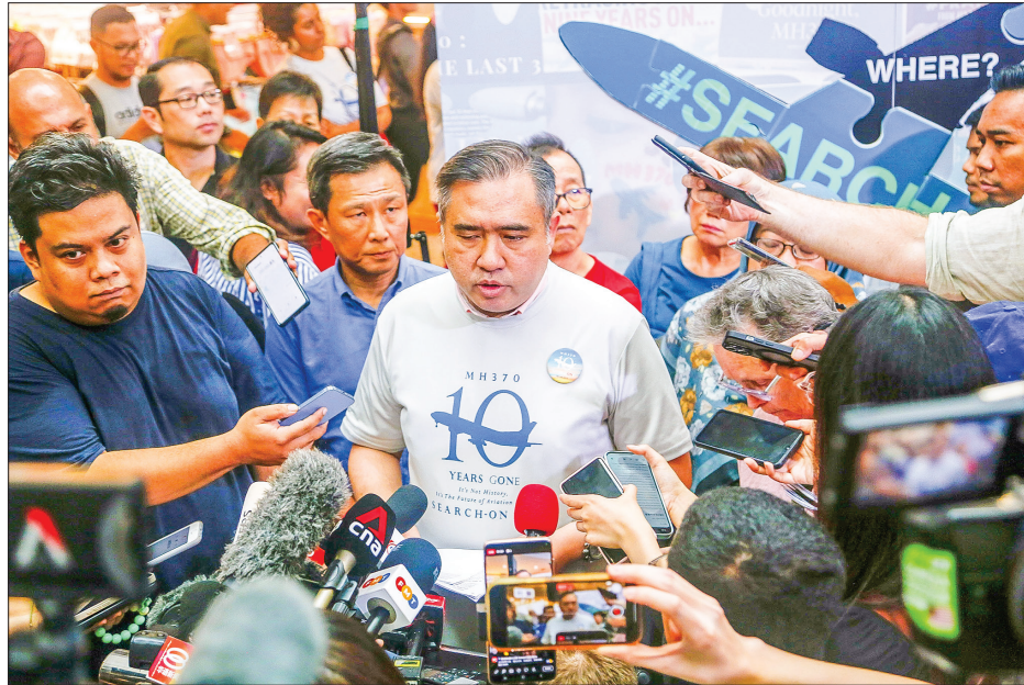
Malaysian Transport Minister Loke Siew Fook speaks to reporters in Kuala Lumpur on 3 March 2024.

Based on radar and satellite communications, it was calculated that the