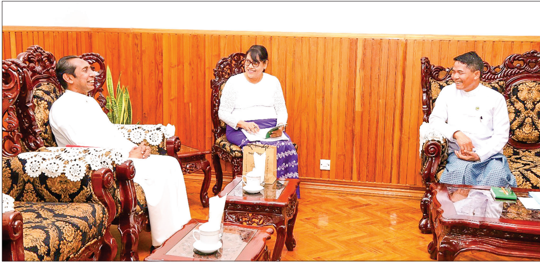
The Sri Lankan ambassador calls on Union Minister U Min Naung yesterday.