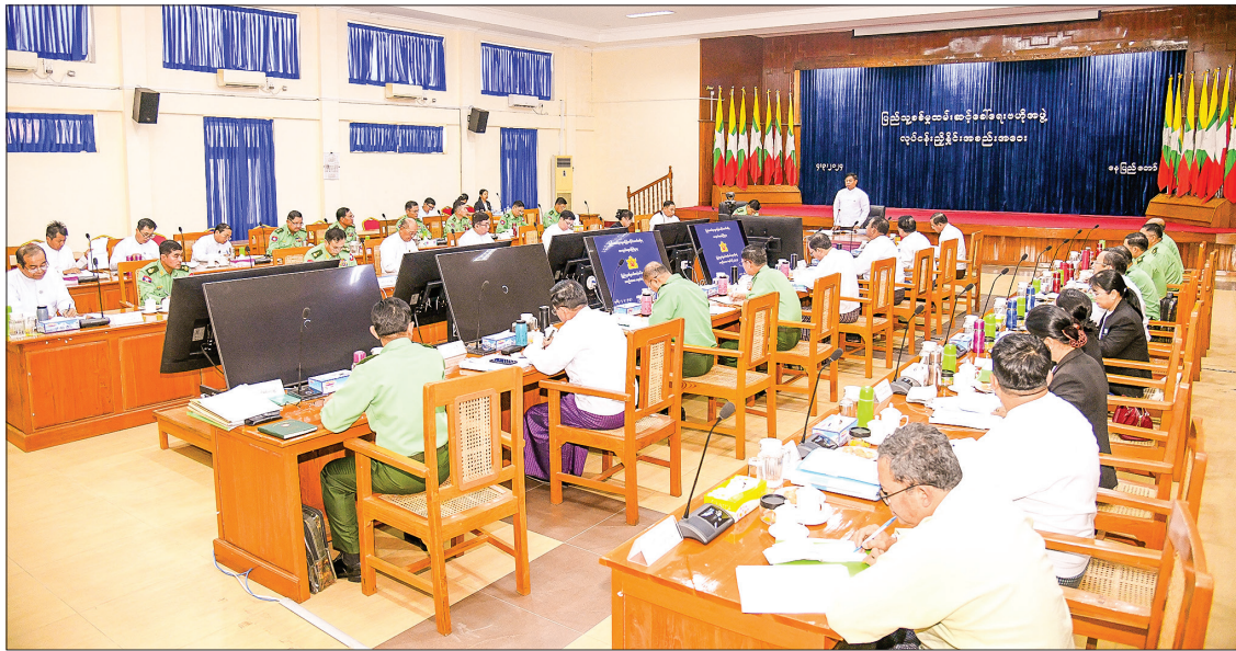
SAC Member, Deputy Prime Minister and Union Defence Minister Admiral Tin Aung San chairs the coordination meeting of the Central Body for Summoning People's Military Servants 2/2024 yesterday.

mation of the chairman's office committee of the Central Body for Summoning People's Military Servants, township, district, self-administered zones and self-administered division com-