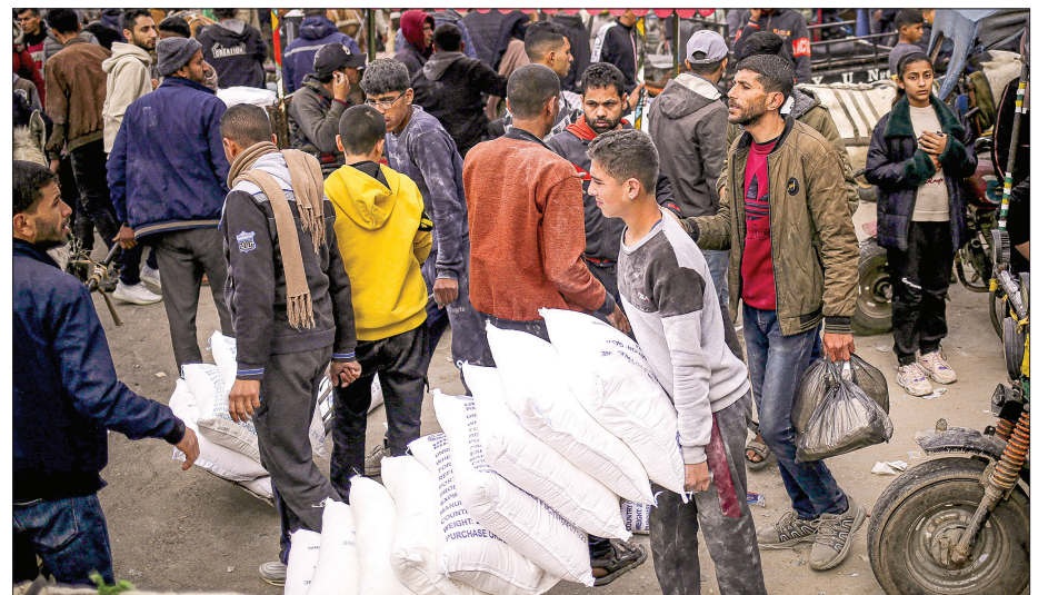
A Palestinian man transports sacks of humanitarian aid at the distribution centre of the United Nations Relief and Works Agency for Palestine Refugees (UNRWA), in Rafah in the southern Gaza Strip on 3 March 2024 amid the ongoing conflict between Israel and the Hamas movement.

The plan on the table aims for a six-week truce, the exchange of scores