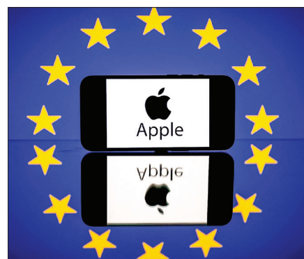
(FILES) This picture taken on 27 April 2023 in Toulouse, southwestern France, shows a screen displaying the Apple logo and the European flag. The EU on 4 March 2024 hit Apple with a 1.8-billion-euro fine ($1.9 billion) for violating the bloc's laws by preventing music streaming services from informing users about subscription options outside of its App Store.

"Apple's conduct, which lasted for almost ten years, may have led many iOS users to pay significantly higher prices for music streaming subscriptions because of the high commission