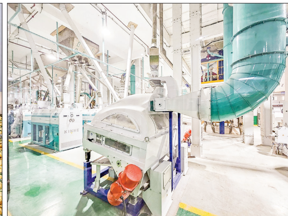
Wilmar Jetty's 1,000-tonne daily rice mill in action.