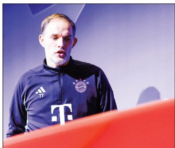
Bayern Munich's German head coach Thomas Tuchel leaves after a press conference on the eve of the Last 16 Second Leg UEFA Champions League football match between FC Bayern Munich and Lazio in Munich on 4 March 2024.

Two early German Cup exits, and elimination at the hands of eventual champions Manchester City in Europe last season, means that Tuchel's only trophy was last year's Bundesliga, some-