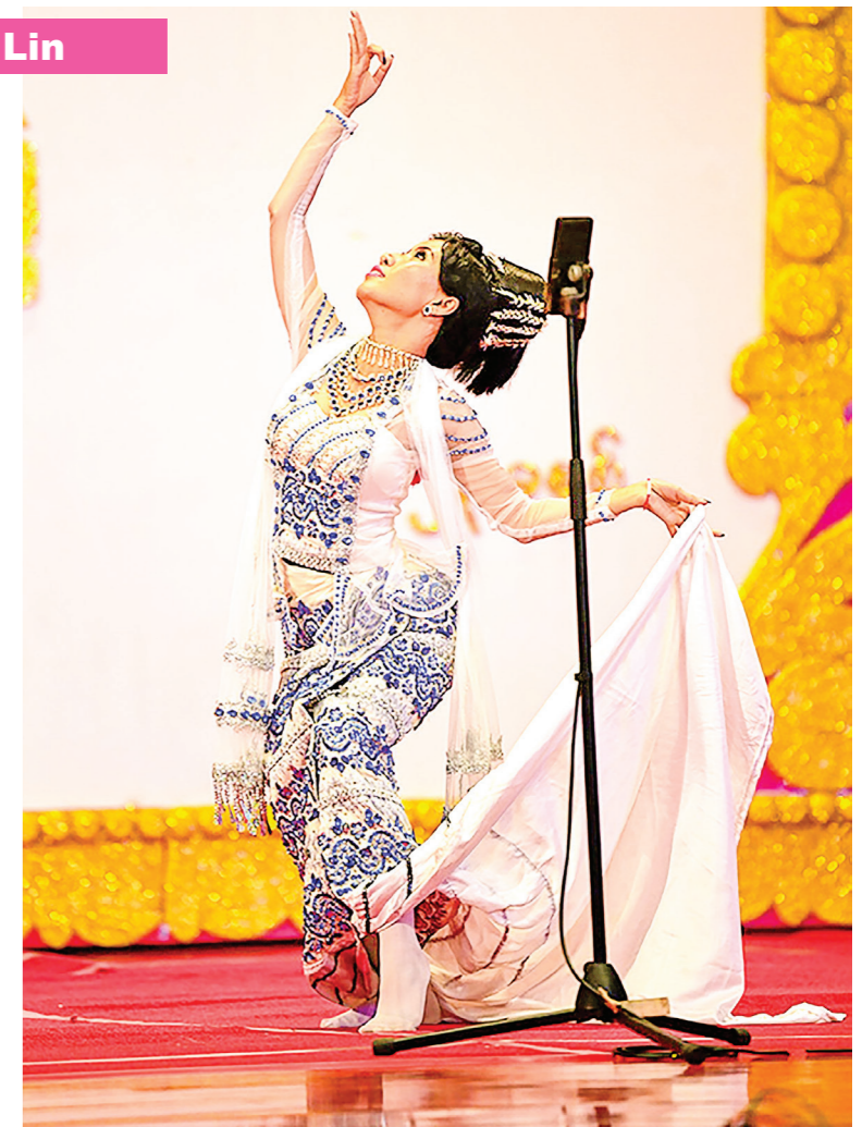
Dance is a prominent and popular form of the performing arts in Myanmar, where dances have traditionally been strict in their adherence form and content.

Myanmar people also express their goodwill towards strangers. It is a cool-water stand, a small shrine-like structure with a roof for seating two or three earthen pots of cool-drinking water. They locate the cool-water stands under a shady tree to