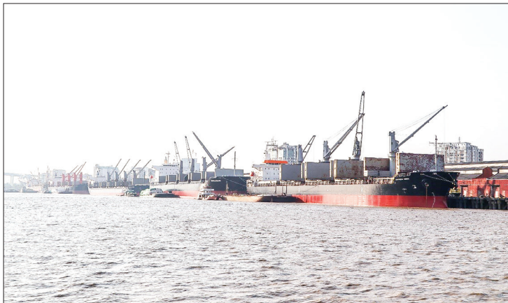
Merchant vessels seen docking at Sule Jetty for loading and unloading.

countries. Corn exports in February totalled 365,472 tonnes, marking the highest monthly export for corn. The total corn