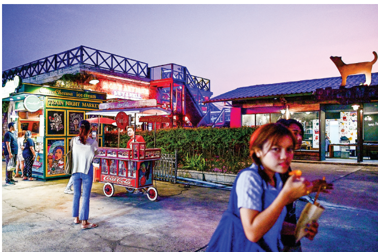
Visitor poses for a photograph next to a Coca-Cola drinks cart installation at the Srinakarin train night market in Bangkok on 3 March 2024.

increase, up from a 1.3-per-cent increase in the previous quarter, according to the National Economic and Social Development Council (NESDC). The growth was mainly attributed to an expansion of employment in the non-agricultural sectors, which rose 2.0 per cent year on year to 27.9 million jobs, the NESDC said in a statement. — Xinhua