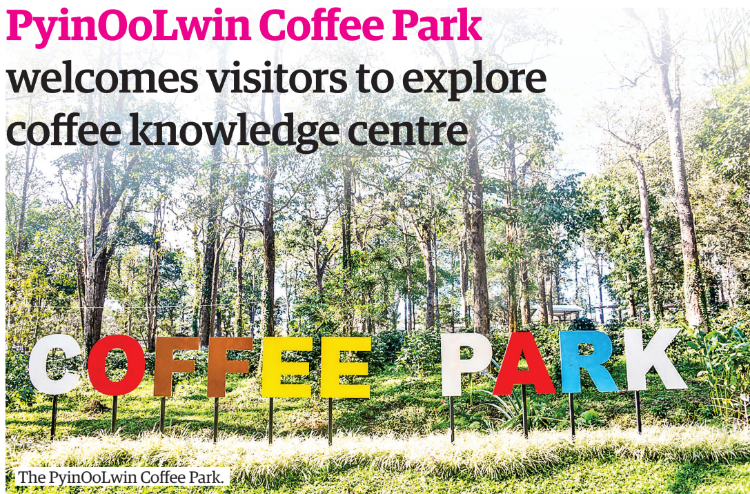
The PyinOoLwin Coffee Park.

can also enjoy locally produced coffee and cuisine available for purchase.