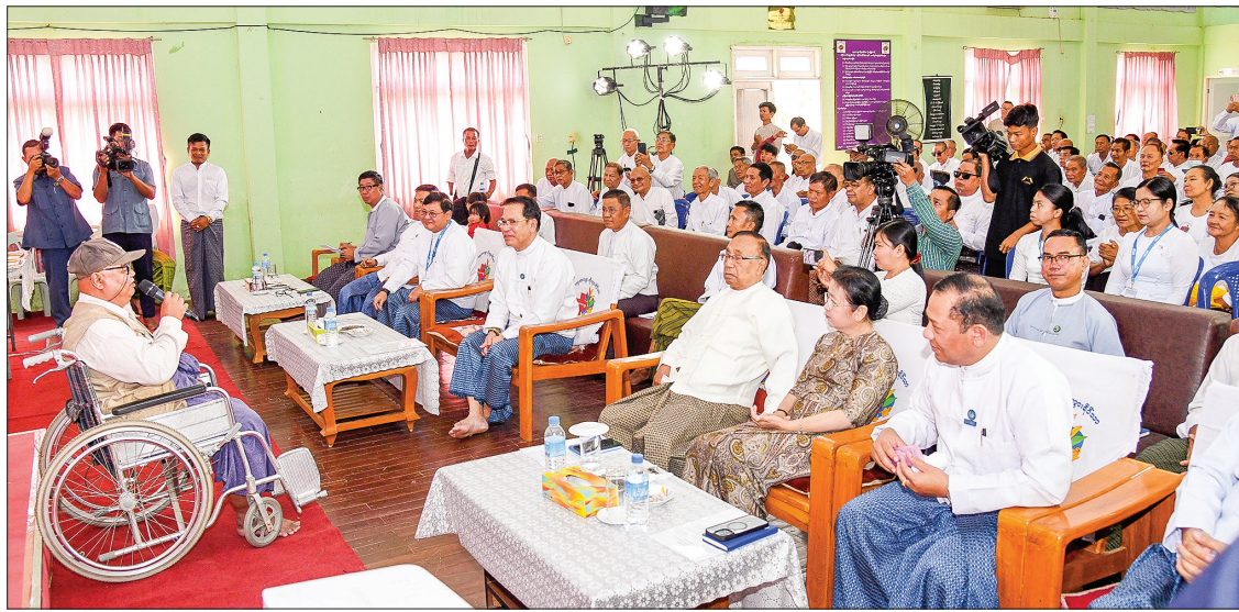
Union Minister U Maung Maung Ohn attends the cash-donation ceremony yesterday in Nay Pyi Taw.

million for the home, MRTV DTH receivers, and DVB T2 set-top boxes to the person in charge of