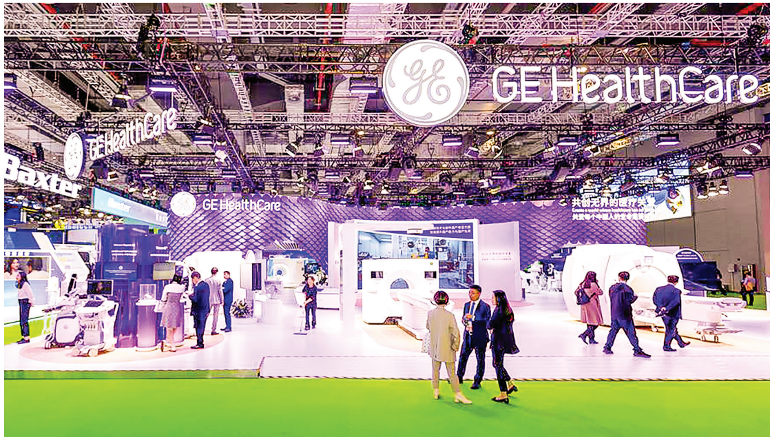
This photo taken on 8 November 2023 shows a booth of GE HealthCare at the 6 th China International Import Expo (CIIE) in east China’s Shanghai.

In the annual China Business Climate Survey released by AmCham China in February, half of the 343 members surveyed placed China as their