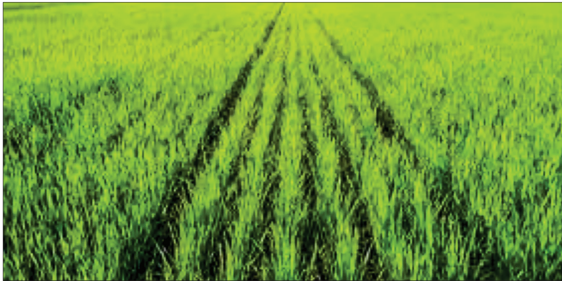
The photo shows a monsoon paddy field in Bogale Township of Pyapon District.

only one Myaungmya district, encompassing Labutta and Myaungmya districts. Under the former arrangement, Myaungmya district had the highest paddy output among the five