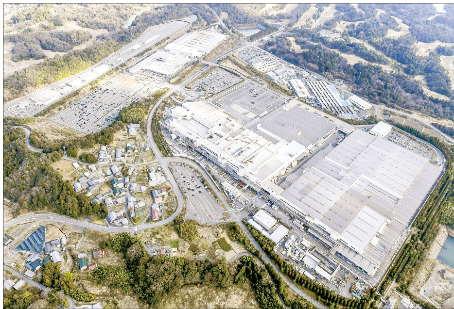
File photo taken in March 2017 shows a Toyota Auto Body Co plant in Inabe, Mie Prefecture.

Toyota Industries said on 29 January that it had fabricated data for a wide range of engines, leading to the halt of shipments of