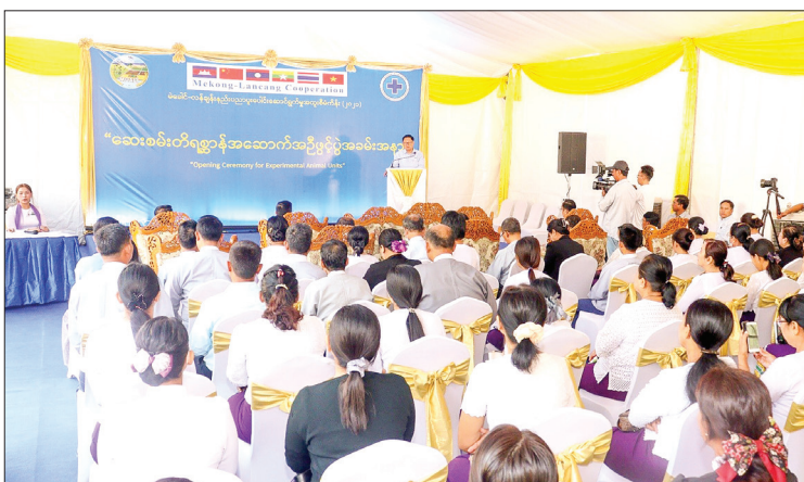
The launch of experimental animal units in action on 3 March.

The deputy minister inspected the breeding of test animals and vaccine production processes.