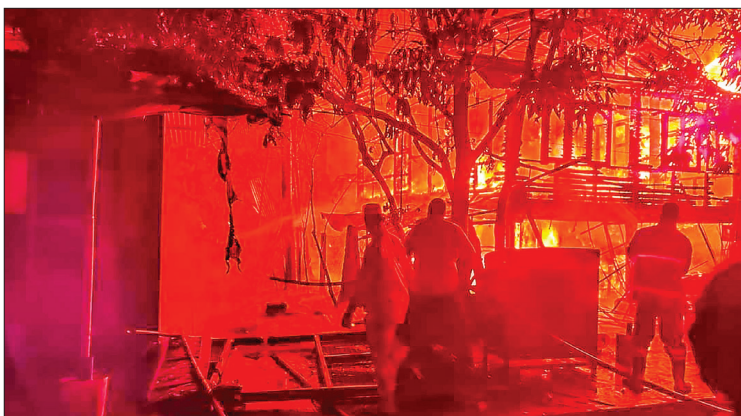
Firefighters seen putting out fire on the 7 th Kawpat compound street in Pyu Township, Bago region.

Comparatively, there were 404 fires in January and February 2022, marking a decrease of 44 incidents this year. However, the total loss cost amounted to K2.7 billion. — TWA/TKO