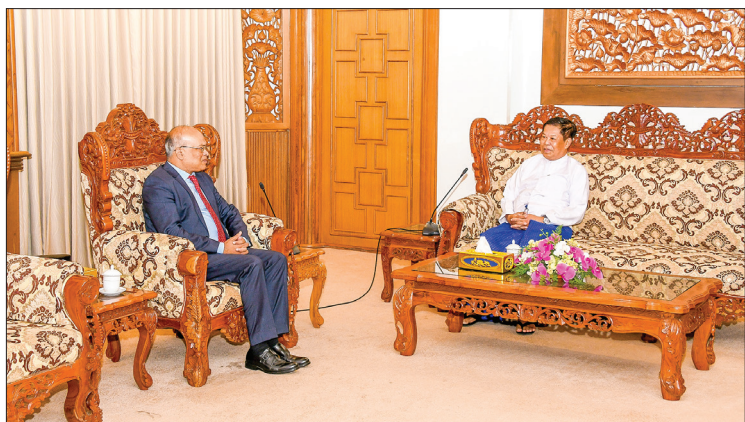
The Bangladeshi ambassador calls on Deputy Prime Minister MoFA Union Minister U Than Swe yesterday.

DEPUTY Prime Minister and Union Minister for Foreign Affairs of the Republic of the Union of Myanmar U Than Swe received Dr Md Monwar Hossain, Ambassador Extraordinary and Plenipotentiary of the People's Republic of Bangladesh to the Republic of the Union of Myanmar, yesterday at the Ministry of Foreign Affairs in Nay Pyi Taw.