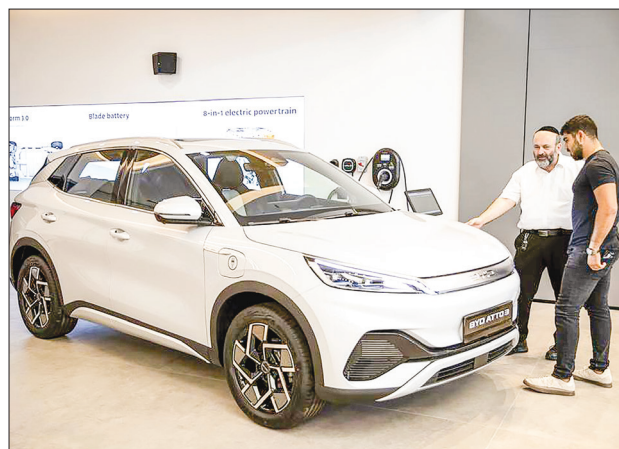
Customers look at a BYD's Atto 3 car at a shop in Tel Aviv, Israel on 17 July 2023.

CHINESE manufacturer BYD Auto topped electric car sales in Israel in the first two months of 2024, according to data released by the Israel