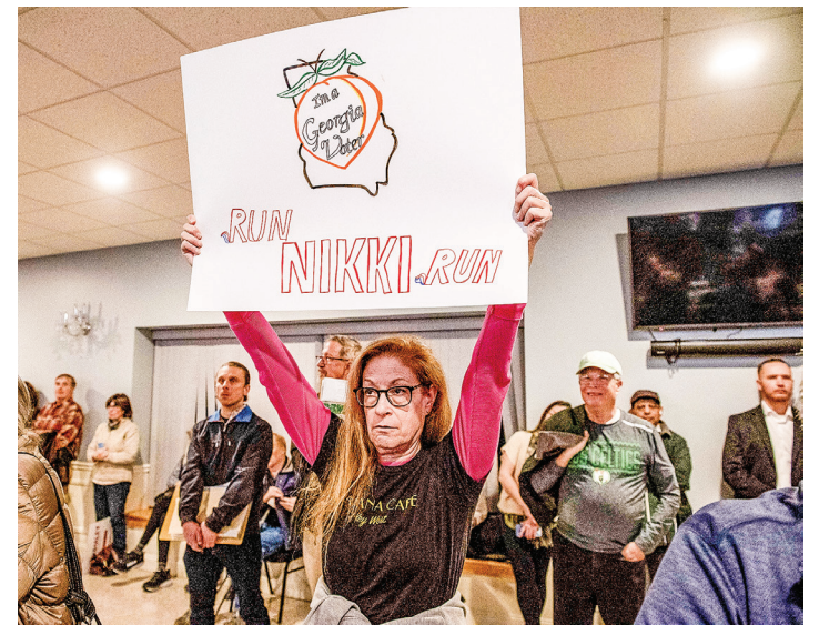
A supporter holds up a placard as US Republican presidential hopeful and former UN Ambassador Nikki Haley speaks during a campaign rally in Portland, Maine, on 3 March 2024.

There is even less high-stakes drama on the Democratic front, as incumbent President Joe Biden is widely expected to be renominated for the job by his party — and