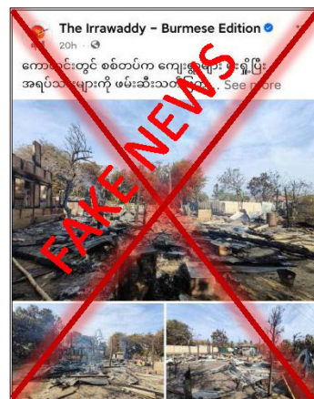
Screenshot misinformation spread by the Irrawaddy Burmese Edition.

REPORTS of malicious media outlets circulating misinformation claim that security forces burned and destroyed several villages, including Thakhukkon Village, Ywama Village, Pekon Village, Kyauktan Village, and Ngagyiai Village in Kawlin Township, Sagaing Region, resulting in the arrest and death of three civilians.