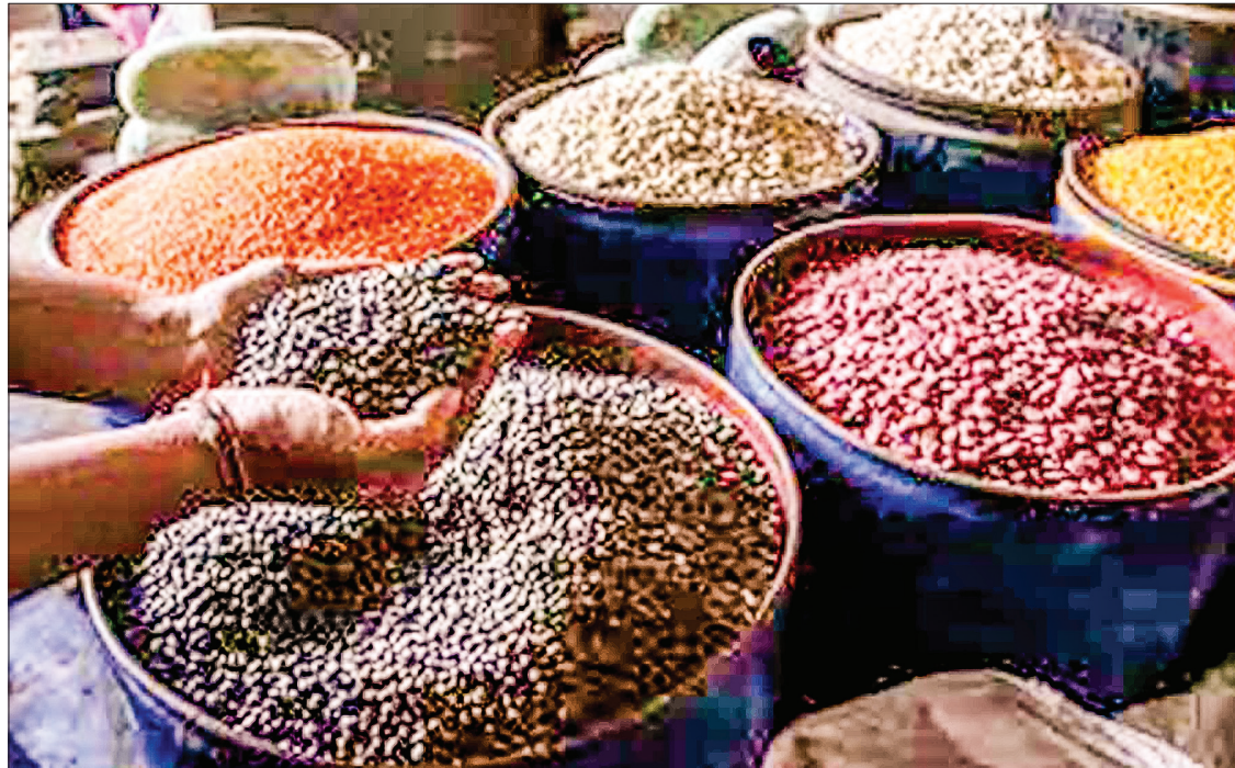
Pulses and beans put on display at the commodity depot.

India also imports the black grams (urad) from Brazil and other countries. Yet, they prefer Myanmar's black grams on account of better quality and higher availability of supply. India extended the free import policy of