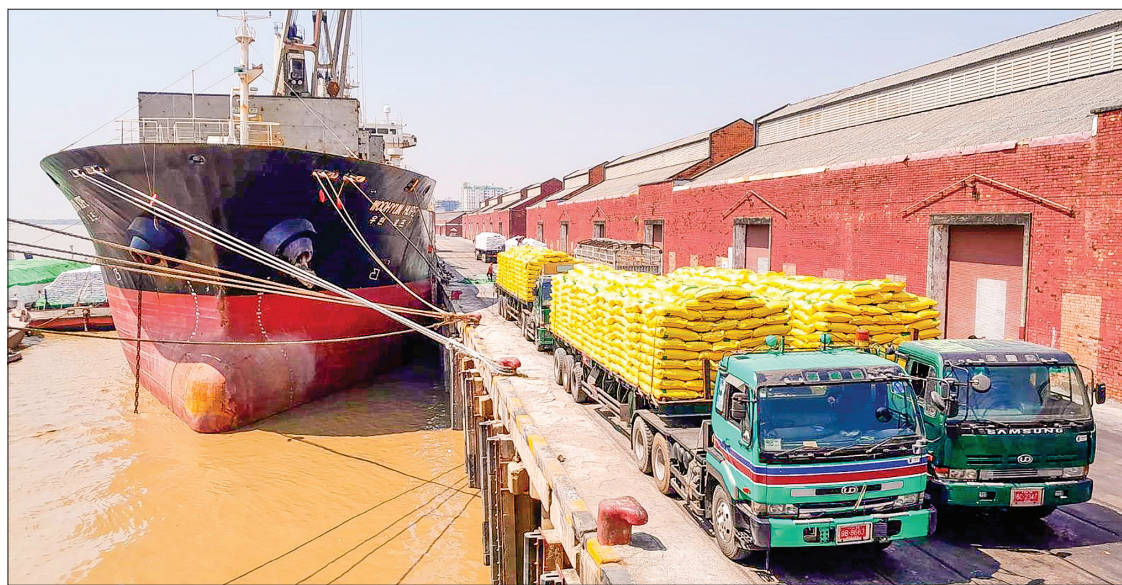
Lorries laden with export rice bags seen preparing for loading them onto the overseas-going merchant vessel.

Traditionally, rice exports have been facilitated via containers. However, due to a shortage of containers in the financial year 2021-22, exacerbated by the COVID-19 pandemic, exporters turned to stacking rice in general cargo vessels. This financial year, the volume of rice exported in containers has doubled compared to the stacking method. Europe, Africa, and Asian countries, including Bangladesh and Indonesia, remain primary