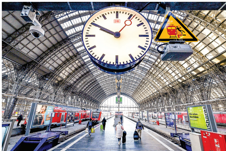
(FILES) Train passengers are seen on a platform at the main railway station in Frankfurt am Main, western Germany, as German train drivers stage a strike, on 28 January 2024.

The call comes less than a week after the last strike, when