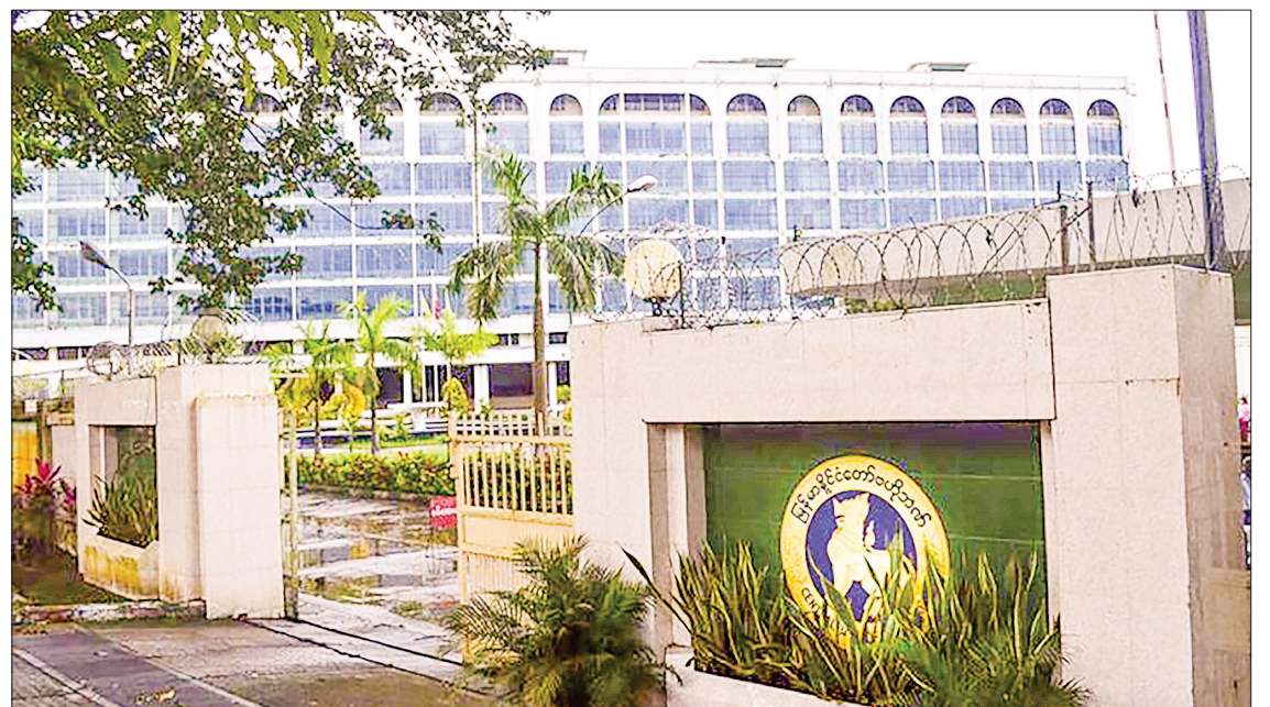
The Central Bank of Myanmar (CBM), Yangon Branch.

and attend the meetings as per the invitation of the foreign governments and associations. — NN/EM