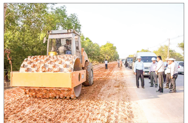
Yangon Region Chief Minister U Soe Thein and officials inspect the upgrading of the Maubin-Twantay road.

On 1 March, Yangon Region Chief Minister U Soe Thein and regional ministers inspected the progress of the production road. Currently, the construction of an earthen road measuring 2,400 feet in length and 19 feet in width, with a thickness of six inches, from Kwinpauk Village to the creek has been completed. The chief minister and his team also assessed the construction of a parking lot, which is 300 feet long, 100 feet wide, and seven inches thick, situated at the junction of Shwemayin Creek and Kwinpauk Creek.