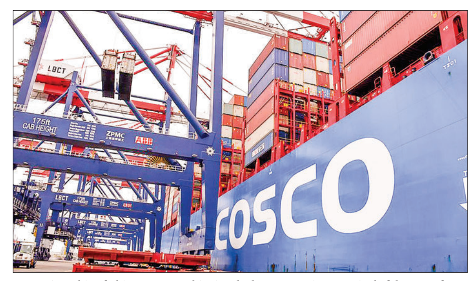
A container ship of China's COSCO Shipping docks at a container terminal of the Port of Long Beach in California, the United States, 20 August 2021.

to lower emissions and further decarbonize the shipping and logistics sectors at the two countries' ports.