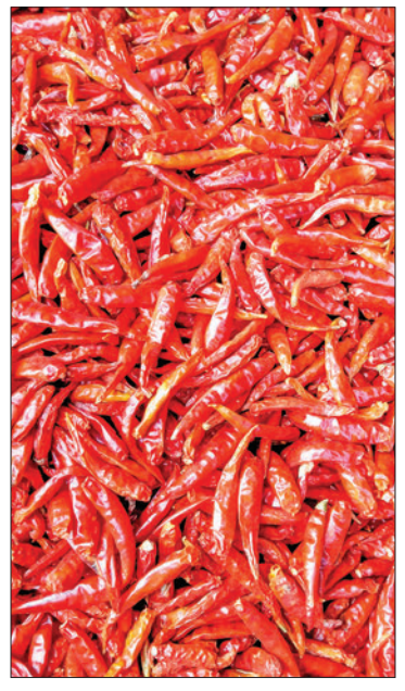
The Moehtaung chilli pepper seen flowing into the market on 5 February 2024.

as the price of chilli pepper processed in cold storage hit K21,000-K22,000 per viss, and the bell pepper price peaked at K31,000 per viss in late 2022. — TWA/KK