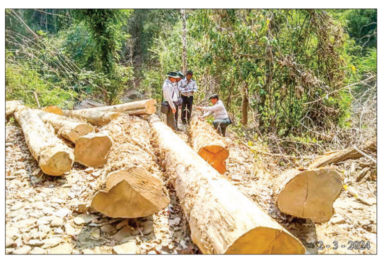
Illegal teak and timbers seized in Bago Region.

Additionally, on the same day, the combined teams captured a So Jen truck (estimated value of K40 million), travelling from Malikha village to Nangwae village, carrying 1,050 kilogrammes of Ammonium Nitrate valued at