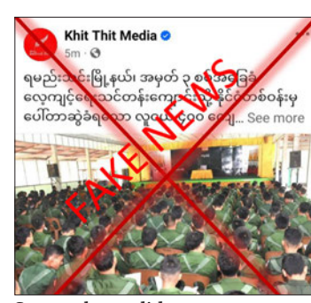
Screenshot validats misinformation.

news is not reliable. Malicious news media and people who don't want peace in the community are spreading false news, such as forceful conscription and arrests by the security forces and administrative organizations, in order to make people and young people afraid so that there is no peace and stability in the country. — MNA/KZL