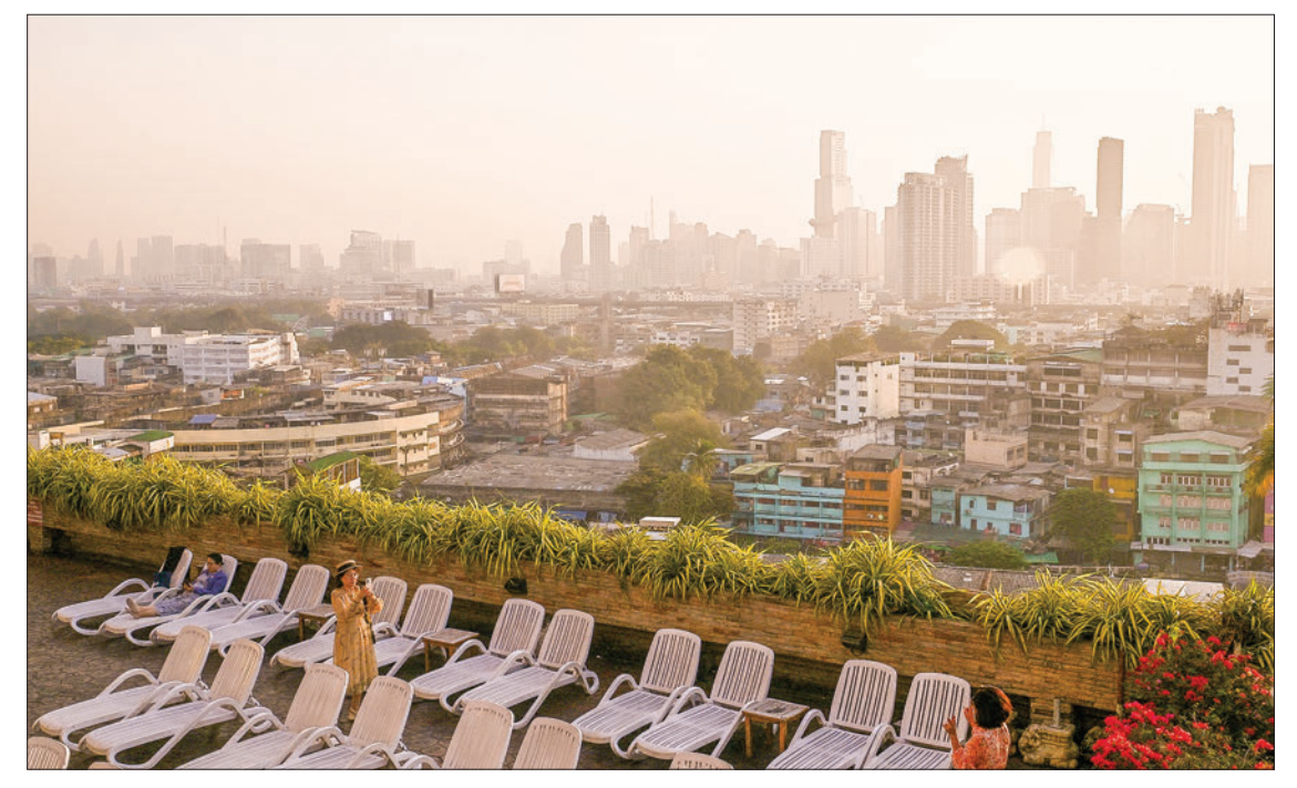
Tourists take photos at a hotel amid moderate levels of air pollution in Bangkok on 15 December 2023.

"According to the Health Data Centre system of the Ministry of Health, in 2023 the number of patients with diseases related to air pollution is 10.5 million," the NESDC said in a