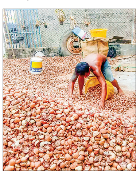
The photo shows a worker cleaning the dried betel nuts.

India's Lax Corporation Co Ltd has expressed interest in purchasing tonnes of dried betel nuts from Myanmar on a monthly basis. The two countries are