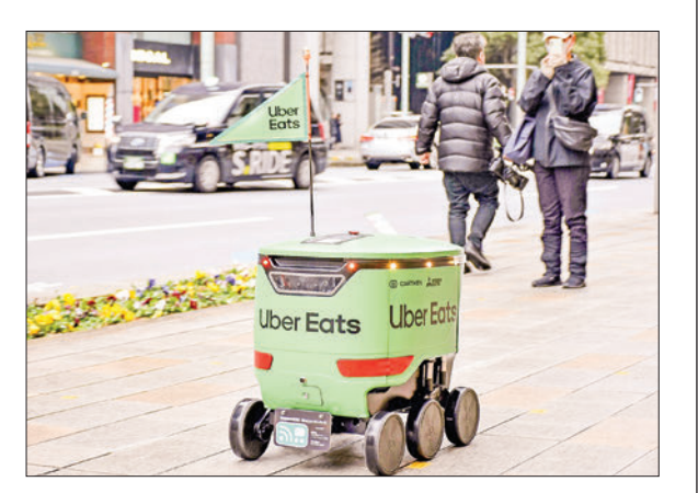
An Uber Eats Japan Inc self-driving robot makes a delivery in Tokyo's Chuo Ward on 5 March 2024.

to 5 pm on weekdays, with two restaurants participating. Customers cannot specify that they wish to have their orders delivered by robot. The box-shaped robot is 71 centimetres long, 46 cm wide and 60 cm high. It runs on six wheels at around a maximum speed of 5 kilometres per hour and can carry up to 20 kilogrammes. — Kyodo