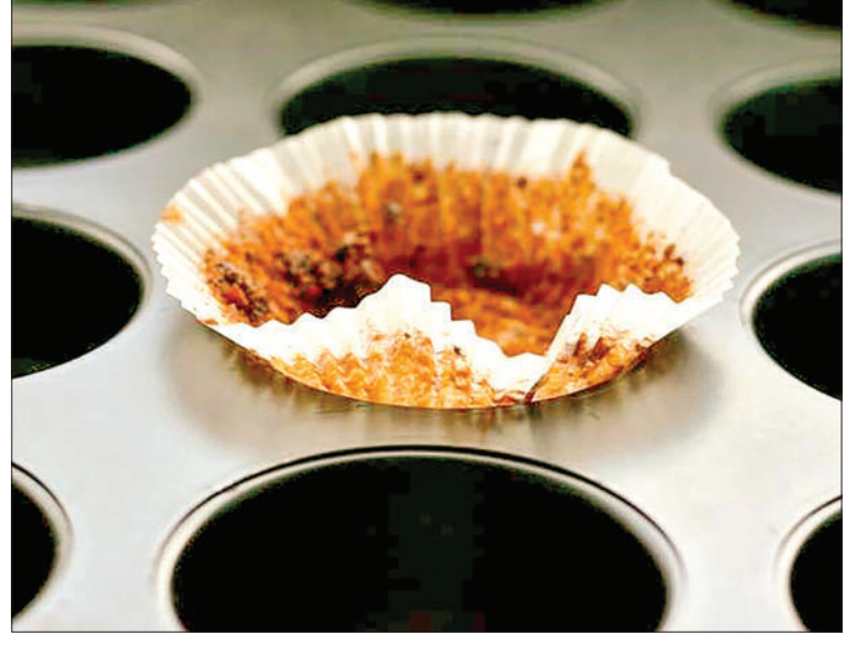
Researchers have discovered that a medication typically used to treat high cholesterol can significantly reduce levels of "forever chemicals" known as PFAS, which are linked to cancer risk and banned in Europe.

Researchers say the results are promising for treating people who have been exposed to high doses of the "forever chemicals".