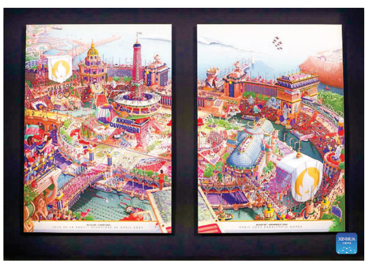
The official posters of Paris 2024 Olympic (L) and Paraolympic games are seen during the unveiling ceremony at the Orsay Musuem in Paris, France, 4 March 2024.

"For the first time at the Summer Games, the Iconic Posters take the form of a diptych, with the same artistic direction. They are two independent