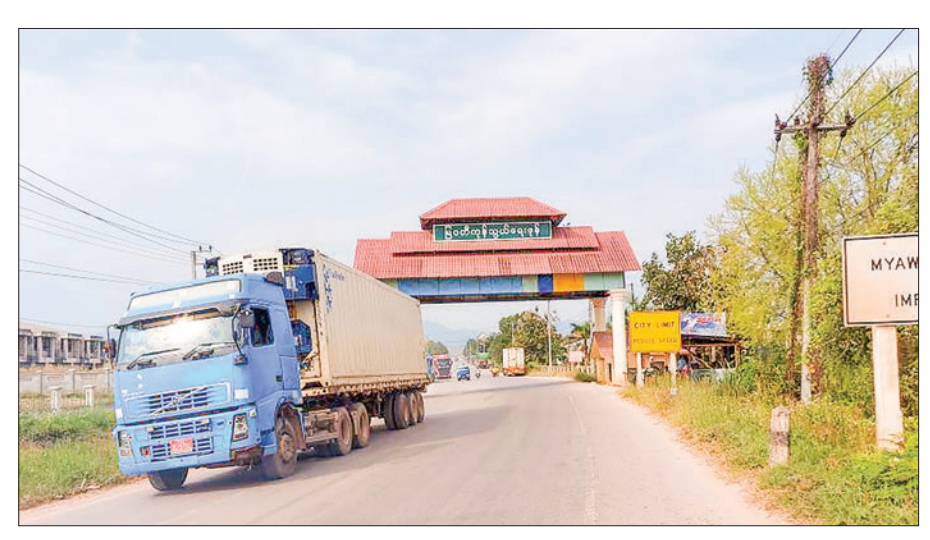
The photo shows a truck passing within the Myawady trade zone.

The main export products include CMP products, agricultural produce,