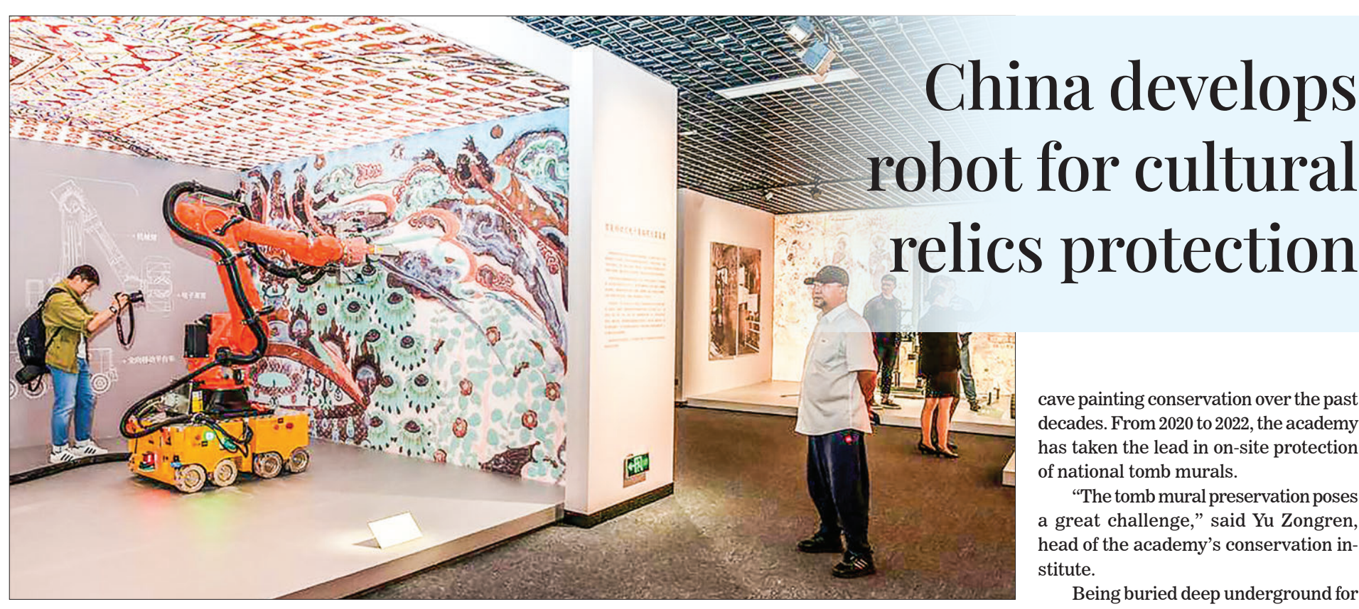
This photo taken on 27 September 2023 shows an intelligent mobile electron beam irradiation sterilization device displayed at a technology and equipment exhibition for the cultural relic protection in southwest China's Chongqing Municipality.

HINA'S strides in space technology are now enriching the preservation of cultural relics, as spacecraft engineers have repurposed a robot originally designed for orbital missions to protect tomb artifacts.