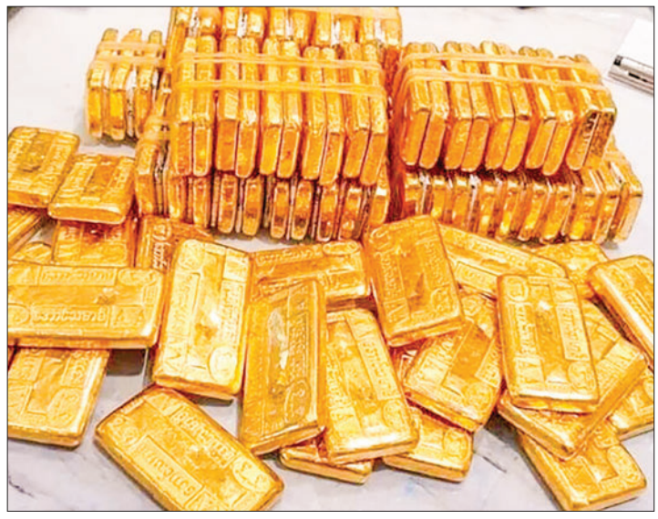
The photo highlights gleaming gold bars on display at the jewellery outlet in Yangon.

Following the CBM's liberalization for authorized dealers for online forex trading on 5 December 2023, the gap be-