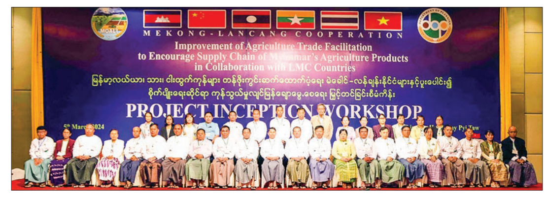
Memorial group photo captured at yesterday's workshop event in Nay Pyi Taw.

The Ministry of Agriculture, Livestock and Irrigation was permitted to implement 35 projects with US$12.18 million with the LMC Special Fund from 2017 to 2023. The ministry implemented four projects in 2023 with US$1.29 million. — MNA/KTZH