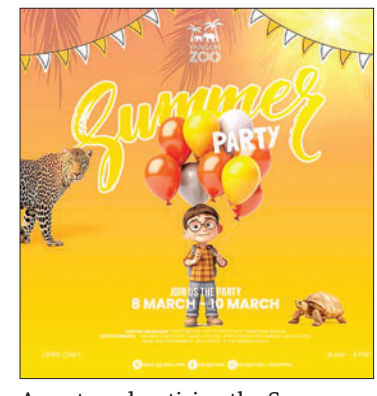
A poster advertising the Summer Party.

It will also include book shops, consumer product sales,