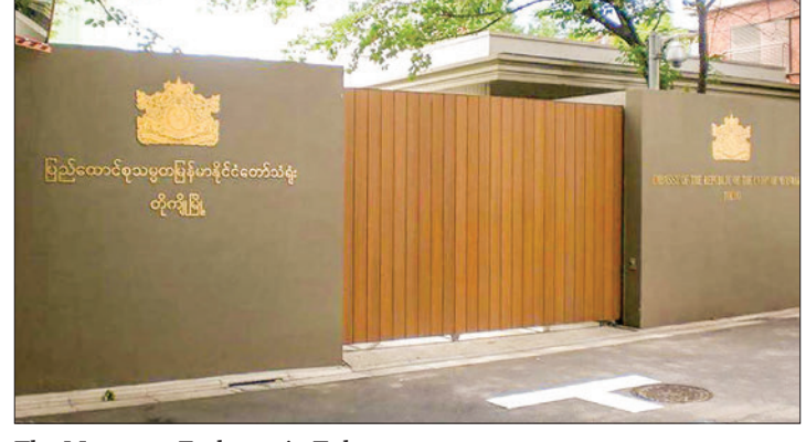
The Myanmar Embassy in Tokyo.

AN online appointment system will be initiated for passport extension and consular services for Myanmar nationals in Japan, the Myanmar Embassy in Japan announced on 4 March.