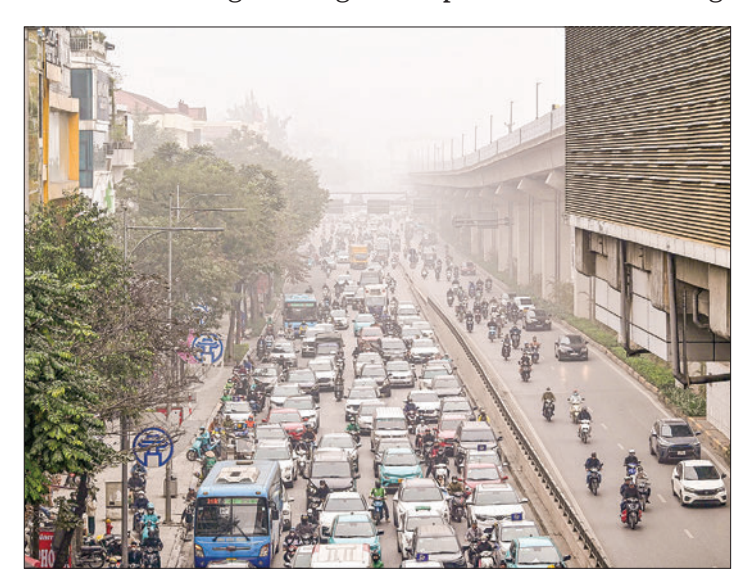
Vehicles drive amid high levels of air pollution in Hanoi on 5 March 2024.

"For the first time in an environmental law, the EU is setting targets to reduce packaging consumption, regardless of the material used," said Frederique Ries, the Belgian EU lawmaker who pushed the text through parliament. — AFP