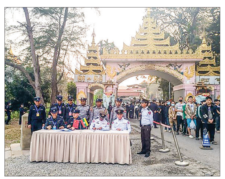
Officials receiving undocumented migrants at the border crossing.

The government has reported that its efforts to locate and repatriate undocumented migrants will continue. — MNA/NT