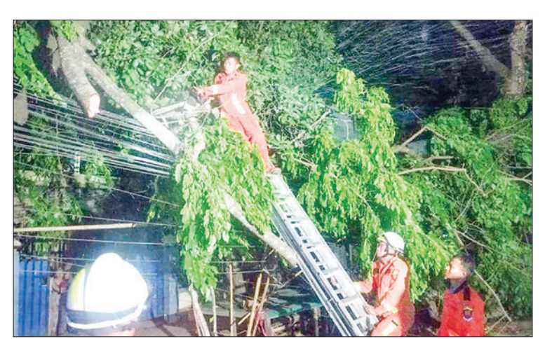
The photo shows clearing works being carried out after trees fell due to strong winds on Maha Bandoola road in Shwepyitha township on 10 April night.

Furthermore, eighteen houses were toppled by strong winds in various states and regions, including Sagaing, Taninthayi, Bago, Mandalay, Shan, and Nay Pyi Taw, resulting in partial destruction of 174 dwellings and affecting 721 individuals. — TWA/ MKKS