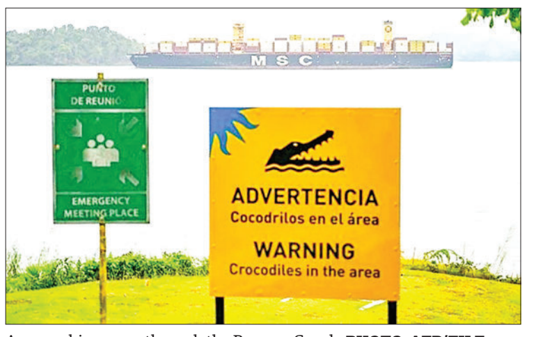
A cargo ship passes through the Panama Canal.

A decree simplifying procedures for transporting cargo by land across the isthmus has already been declared by President Laurentino Cortizo.