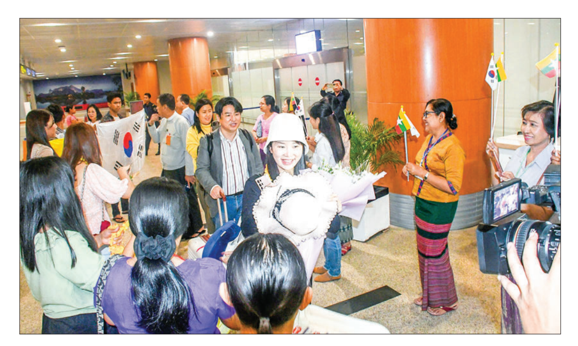
Korean artistes seen being warmly welcomed on their arrival at the Yangon International Airport yesterday.

REPORTS indicate that the second contingent of Korean artistes, slated to participate in the Nay Pyi Taw Walking Thingyan event, arrived in Yangon vesterday evening. Their visit aims to foster cultural exchange and feature performances at the traditional Myanmar Thingyan Festival.