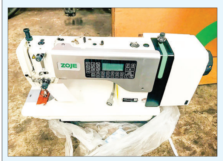
Seized illegally imported ZOJE sewing machine at Myanmar Industrial Port.

The Illegal Trade Eradication Steering Committee reported 20 arrests over three consecutive days, from 8 to 10 April, with an estimated value of K847 million. — MNA/MKKS