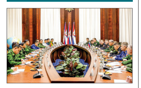
Myanmar attends 2<sup>nd</sup> meeting of Myanmar-Russia Joint Anti-Terrorism Committee