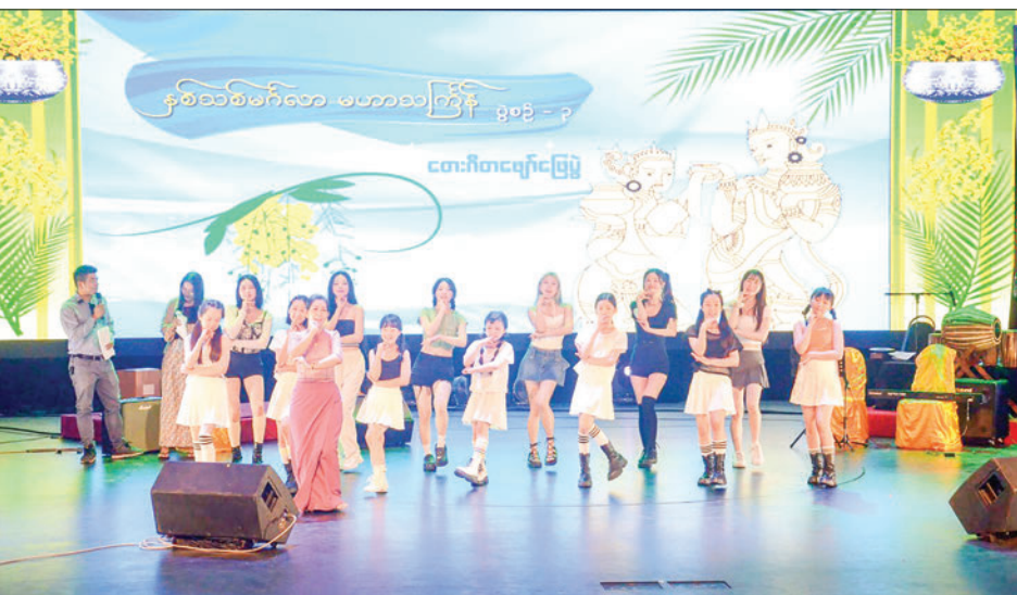
Photos depict the rehearsal for the Friday Night Live Show of Korean artistes in progress yesterday in Nay Pyi Taw.

THE first group of K-pop artistes participating in the Thingvan festival as part of a cultural exchange programme conducted a rehearsal for the festival's