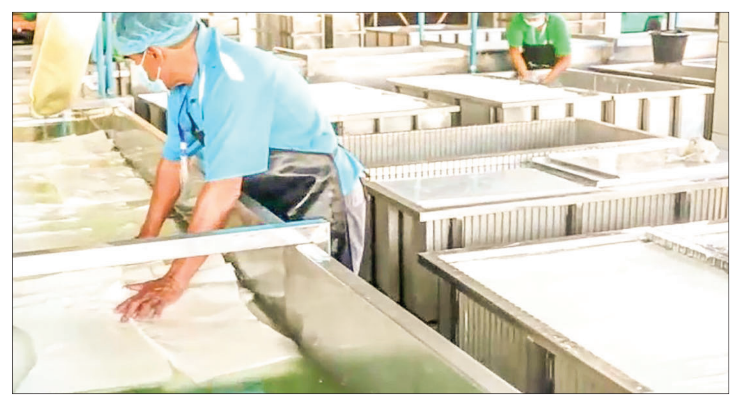
A worker is captured on the rubber processing line, one of Myanmar's key export commodities.