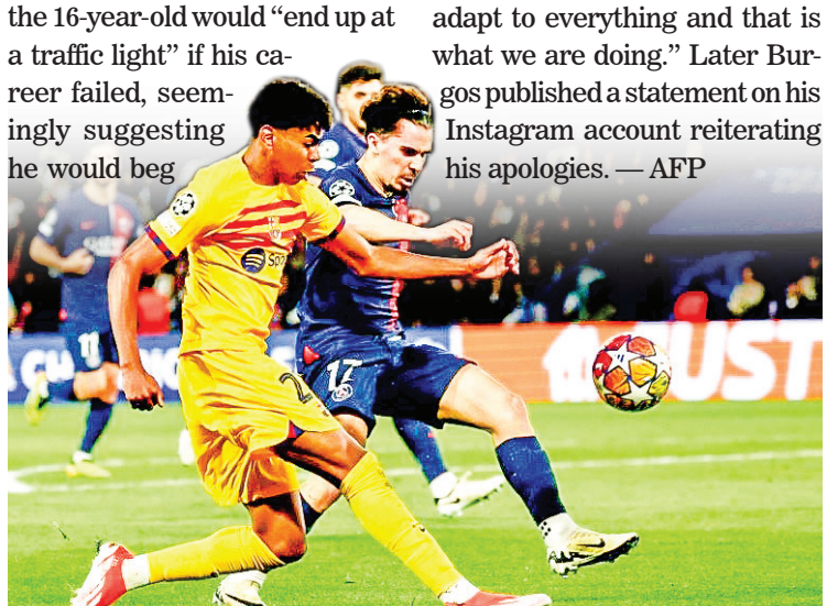
Barcelon forward Lamine Yamal (L) has burst into the limelight this season with dynamic performances on the right wing.