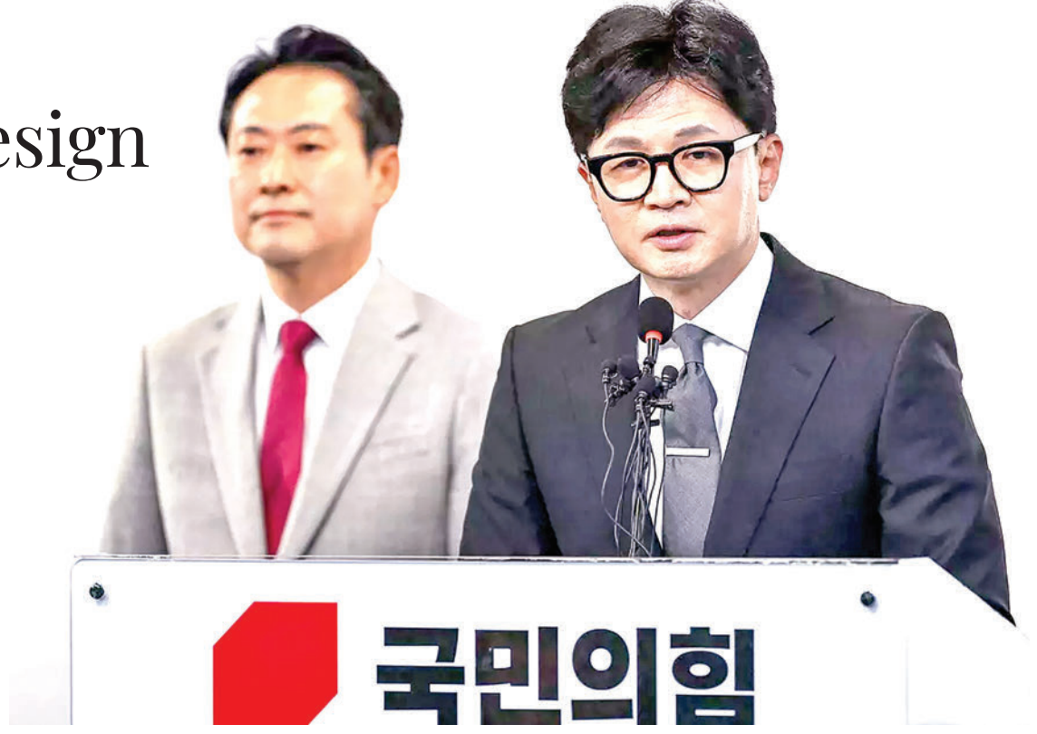
People Power Party leader Han Dong-hoon said after the exit poll results were announced that the party was "disappointed" but would continue watching until official tallies are released.

South Korean Prime Minister Han Duck-soo and nearly all senior presidential secretaries have tendered their resignations following the ruling People Power Party's significant defeat in parliamentary elections, as reported by local media citing the presidential office.