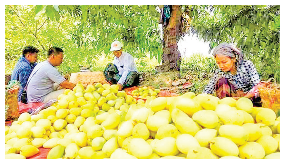
Fruit traders and a worker are seen soting freshly harvested mangoes.

At present, extreme weather and transportation on rough