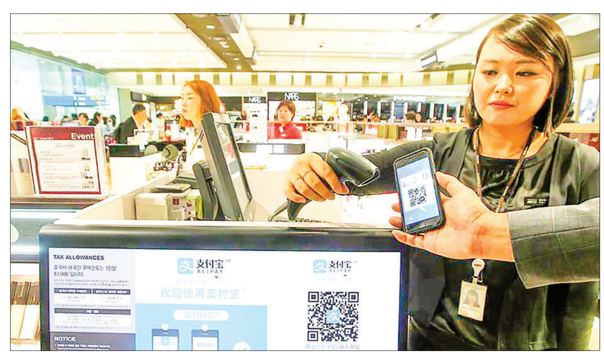
A cashier demonstrates how to use Alipay at a store in Incheon Airport in Seoul, South Korea, 6 October 2016.

This initiative aligns with China's broader efforts to streamline payment services, promote cashless transactions, and encourage mobile payment adoption, as outlined in a guideline released by the State Council in March.