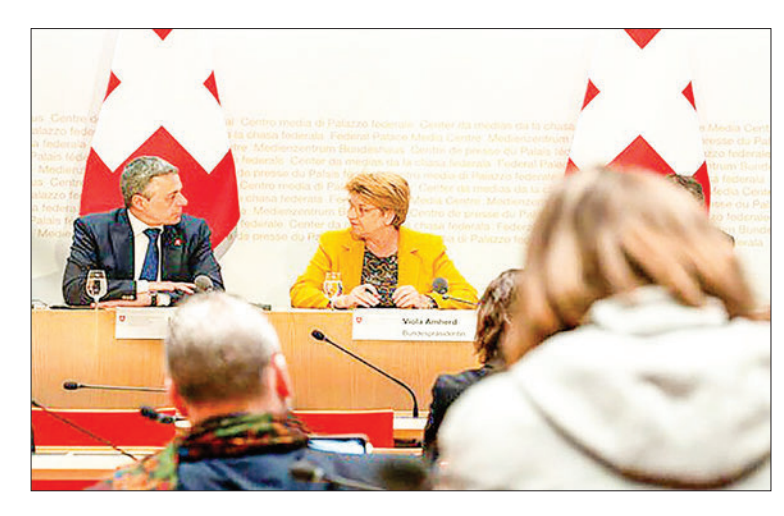
Swiss President and Foreign Minister Ignazio Cassis announced plans for Switzerland to host a high-level international conference in June, inviting over 100 countries to collaborate on forging a path to peace in Ukraine following more than two years of conflict.

Emphasizing Switzerland's commitment to peace and humanitarian values, Cassis highlighted the nation's tradition of playing a pivotal role in such endeavours.