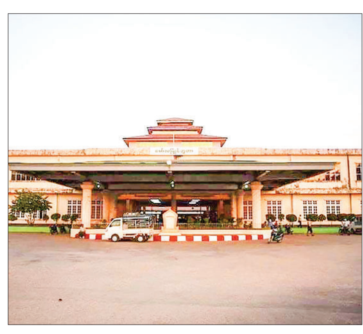
The front view of the Mawlamyine railway station.

Refunds for upper-class and ordinary-class tickets for 11 April will be given from 6 am to 10 am at the daily ticket counter at Mawlamyine Railway Station.