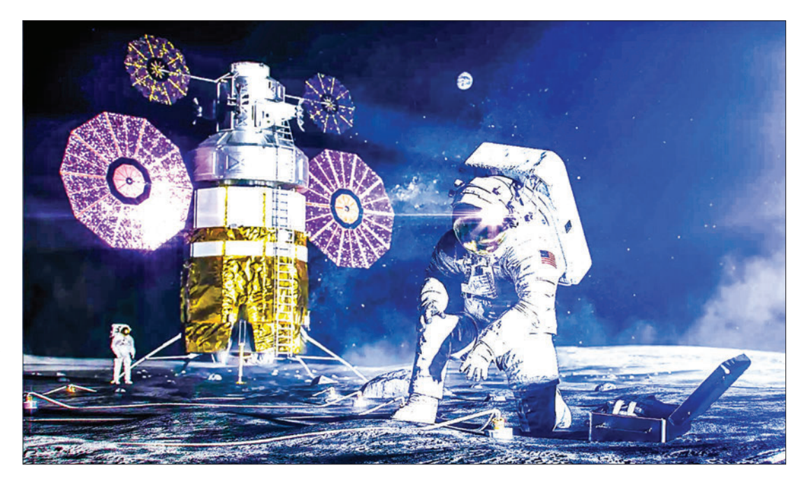
A rendering of the new space suit that NASA is designing for the Artemis astronauts. The suit is called the xEMU, or Exploration Extravehicular Mobility Unit.