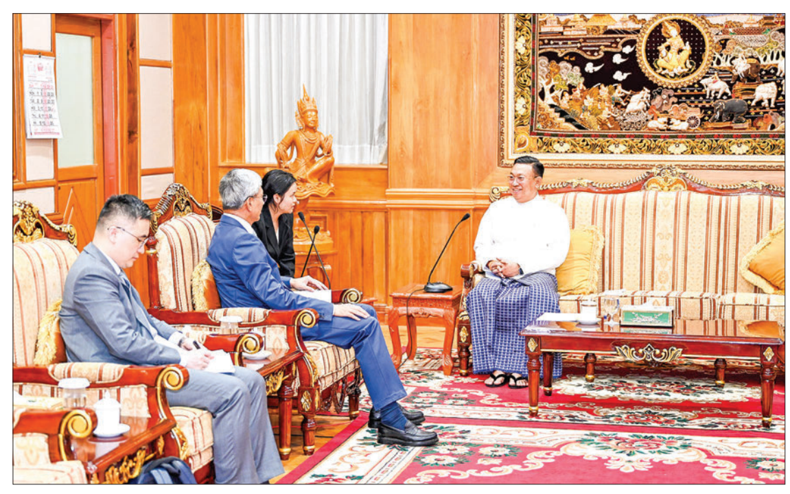
The Chinese Ambassador calls on Union Minister Admiral Moe Aung yesterday.

Also present at the meeting were officials of the SAC Office and the Chinese Embassy in Myanmar. — MNA/TTA