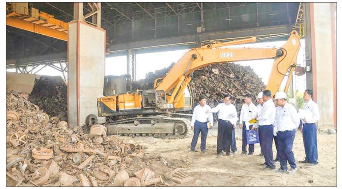
Union Minister Dr Charlie Than inspects the No 1 Steel Mill (Myingyan) yesterday.

ALL staff and engineers have to strive to operate the steel mill producing iron and steel wares, not to halt production, said Union Minister for Industry Dr Charlie Than on his inspection tour of all sections at No 1 Steel Mill (Myingyan) yesterday morning.