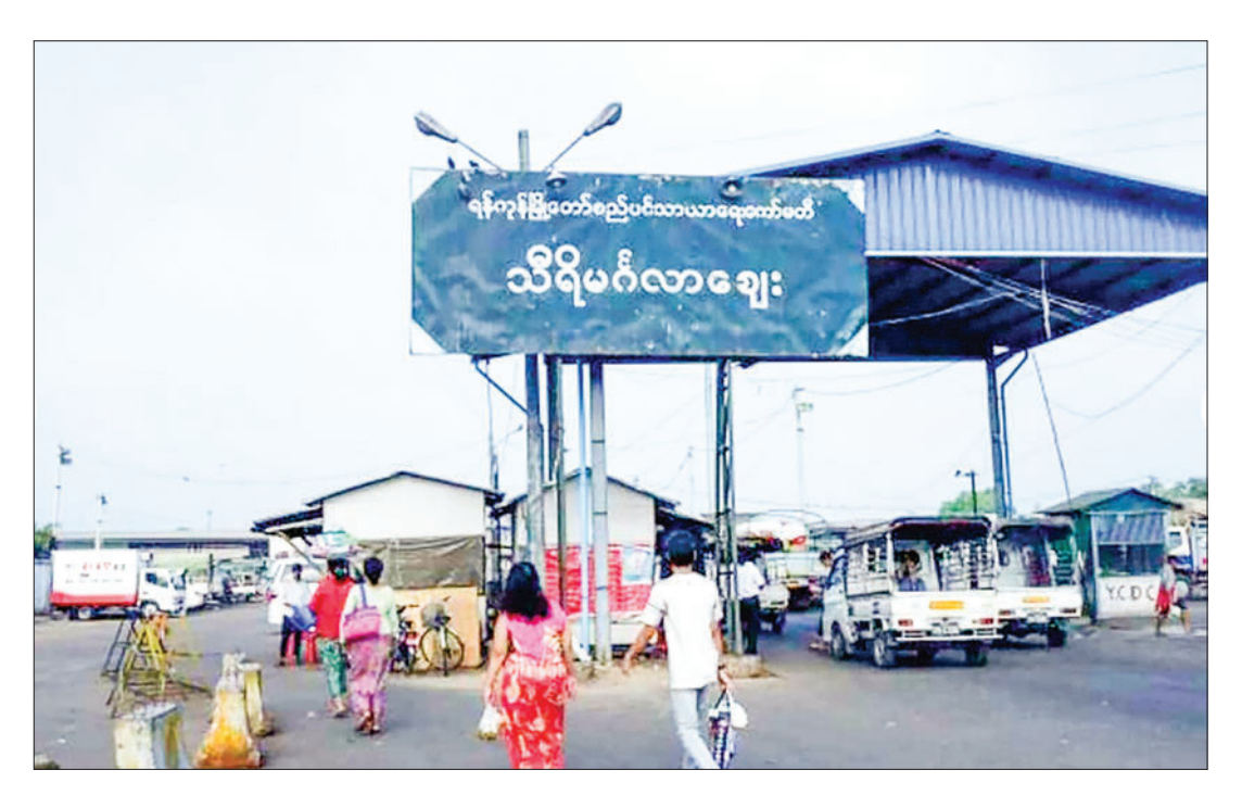
Thiri Mingala Mart in Hline Township, Yangon.