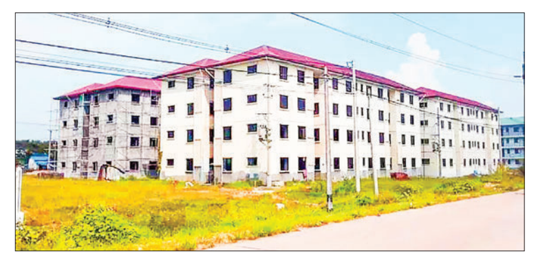
Aung Myint Mo housing units between Yoma Yeiktha and Aung Myint Mo street, Ward 144, Dagon Myothit (South), Yangon Region.

If there are any difficulties with the registration, people can contact the DUHD on 067 340 7527, 09 795 824 722, the CHID Bank on 01 837 0124, 01 837 0125, and call centre on 09 401 010 810 and 09 401 010 820 during office hours, it said. — MT/ZN