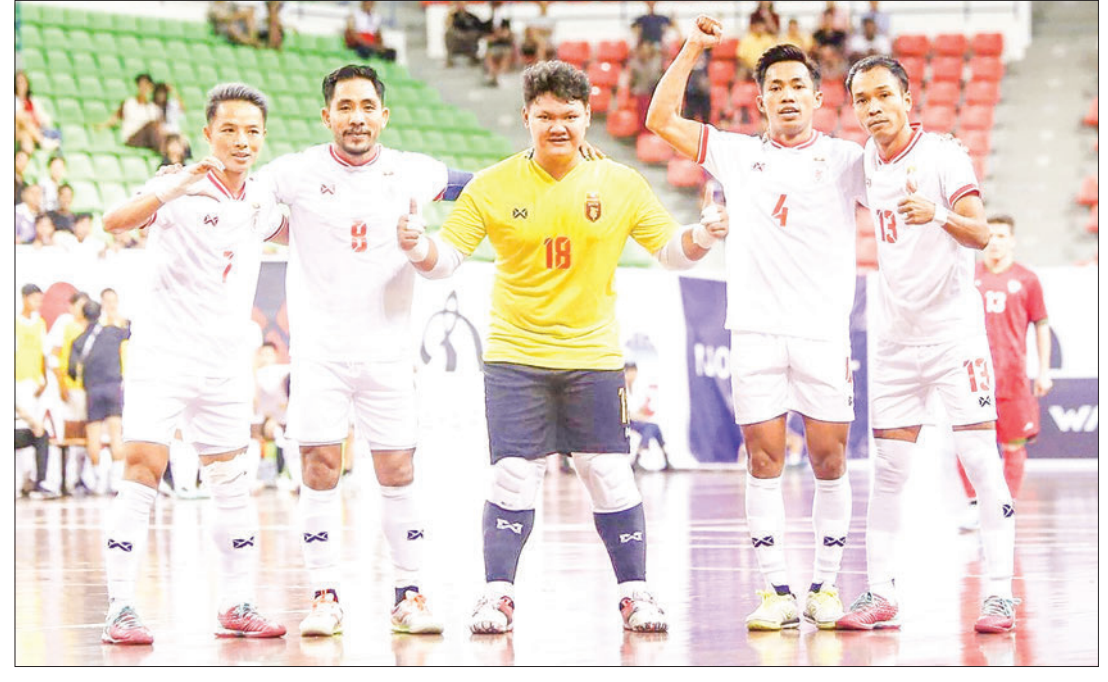
Players of the Myanmar national futsal team celebrate victory in a warm-up match.