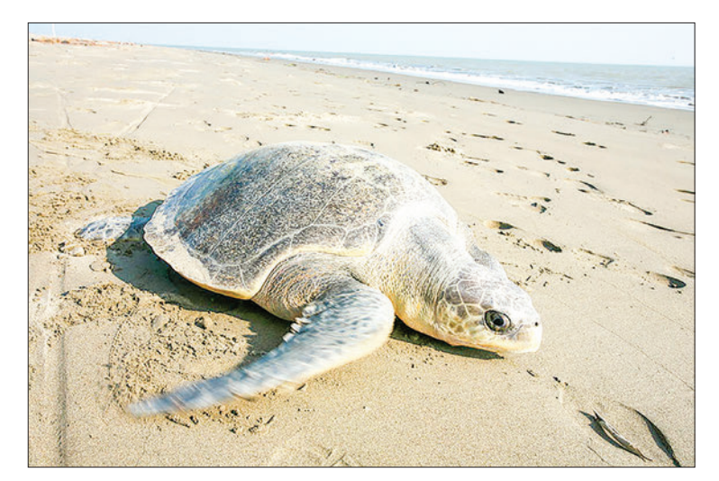
The Thameehla Island, where sea turtle species come to lay their eggs every month, regardless of the season.