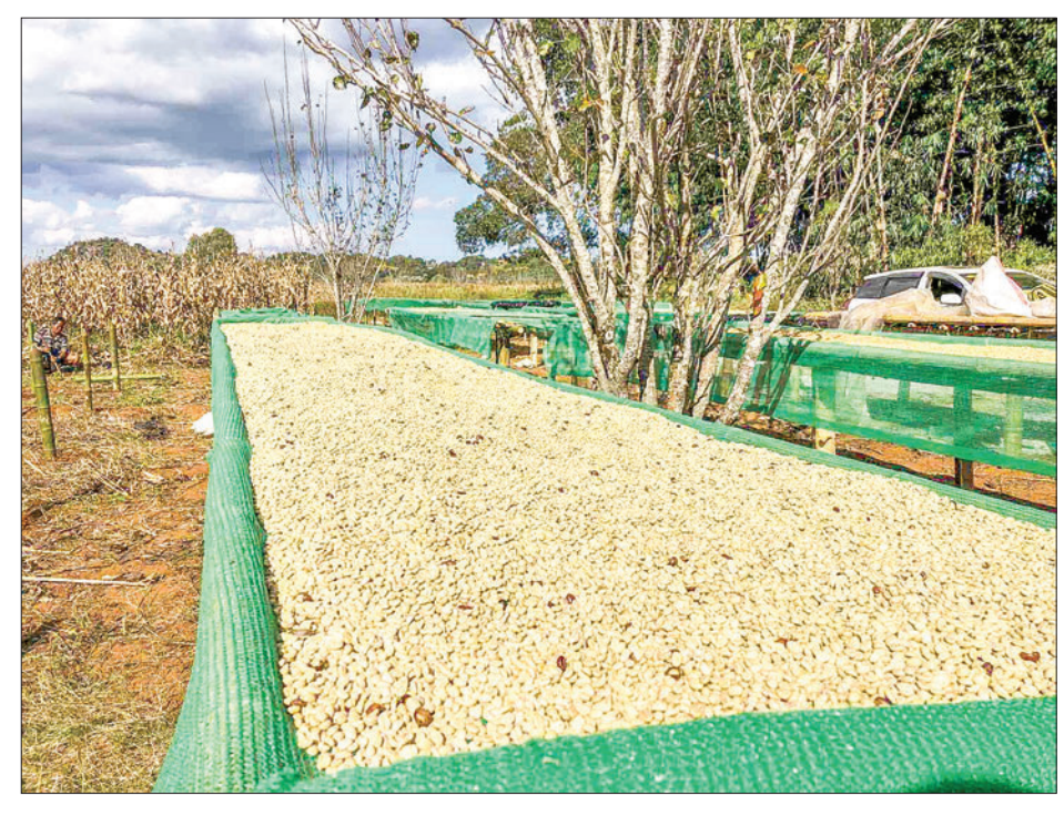
A stretch of freshly harvested coffee beans, representing Myanmar's agricultural export industry.

Myanmar has been implementing the National Export Strategy (NES) 2020-2025 in order to boost exports. The priority sectors of the NES include agricultural production, garment and apparel, industrial and electronic device, fishery business, forest product, digital manufacturing and service, logistic service, quality management, trade information service, innovation and entrepreneurship sectors. — NN/KK