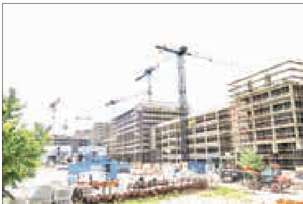
A construction site is seen in Berlin, capital of Germany, on 30 July 2021.

The downward trend in recent years continues, with only 18,200 apartments granted building permits in February. Destatis reports show a significant 35.1-per-cent decline compared to the same month in 2022.