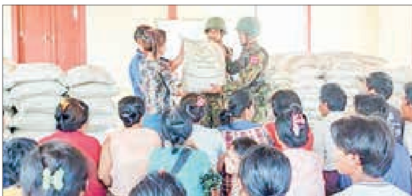
Officers from Western Command provide rice, edible oil and food items to local from Taungsauk village on An-Padan Road, An Township, Rakhine State yesterday.

Officials from the command visited and encouraged the activities and provided 307 households from seven villages on the An-Padan Road with bags of rice, bottles of oil, and