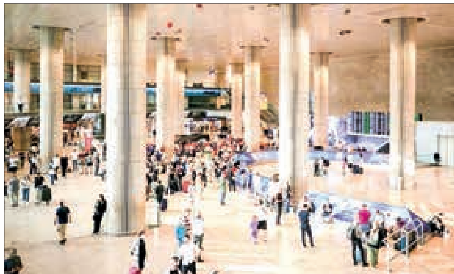
Travellers are seen at Ben Gurion International Airport near Tel Aviv, Israel, 8 October 2023.

“We are continuously monitoring the situation