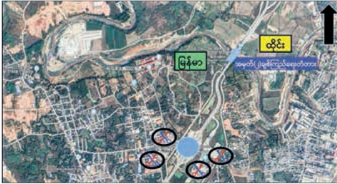
The map shows the site where some pro-terrorists from KNU, KKO (splinter group), and PDFs yesterday collusively attacked the security forces near the No 2 Thai-Myanmar Friendship Bridge in Myawady Township, Kayin State.