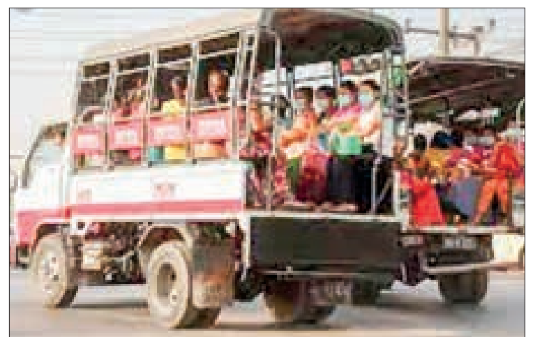
Garment workers in Yangon Region seen on a transport minitruck.

“Thingyan holidays will last until 21 April. They will reopen on Monday, 22 April. Some prosperous factories have hired private cars and sent their workers to the places closest to their homes. They will also make the same arrangements for their return. Some didn’t go back to their towns and just stayed here,” he added. — MT/ZN