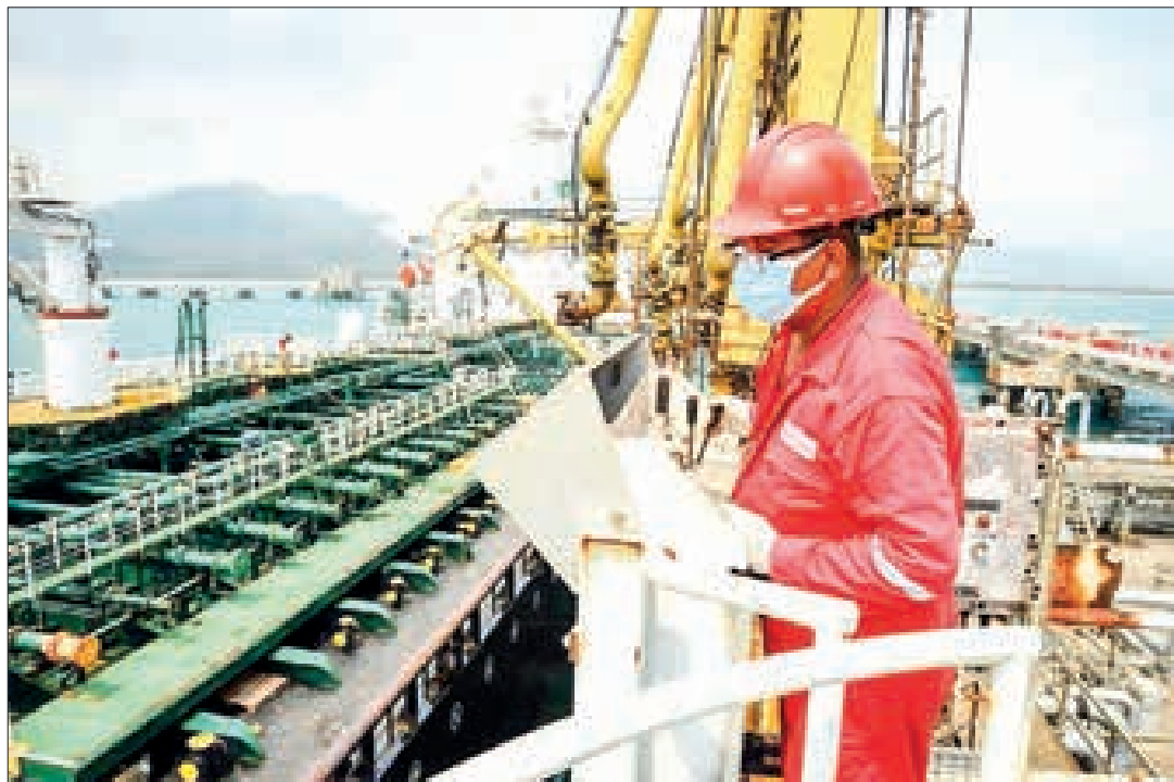
A worker from Petroleos de Venezuela operates machinery in front of the Fortune oil tanker, docked at the El Palito Refinery, Carabobo state, Venezuela, on 25 May 2020.

Venezuela "reminds the entire world that with or without licences, with or without unilateral coercive measures, it is determined to be a free nation," Gil said. — Xinhua