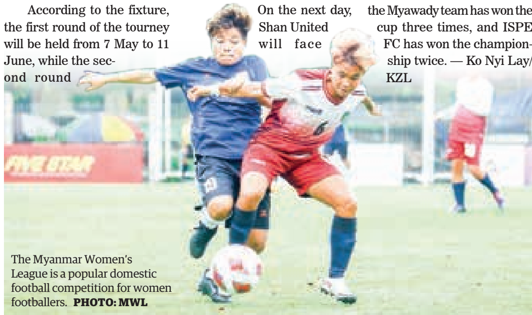
The Myanmar Women's League is a popular domestic football competition for women footballers.

The Myanmar Women's League is being held for the sixth season this year, and in the five times it has been held, the Myawady team has won the cup three times, and ISPE FC has won the championship twice.