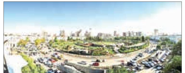
India is forecast to maintain its position as a major growth engine in Asia due to strong investment, recovering consumption and gains in electronics and services exports. Connaught Place, officially Rajiv Chowk, is a major economic hub in New Delhi, India.

The ADB warns of worsening geopolitical tensions and conflict, including attacks on cargo vessels in the Red Sea by the Iran-backed Houthis, and extreme weather, among others, as potential risks to growth. — Kyodo