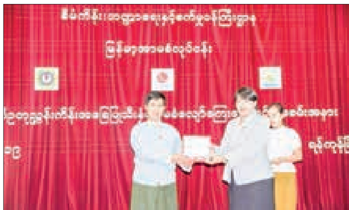
The photo shows a ceremony of Myanma Insurance providing weather-based insurance in 2019.

The insurance system is based on rainfall, which is widely implemented in countries that prioritize agriculture, and it is also planned to be paid by the insurance system based on weather index-based insurance. Buying insurance policies may become mandatory for farmers, and the authorities