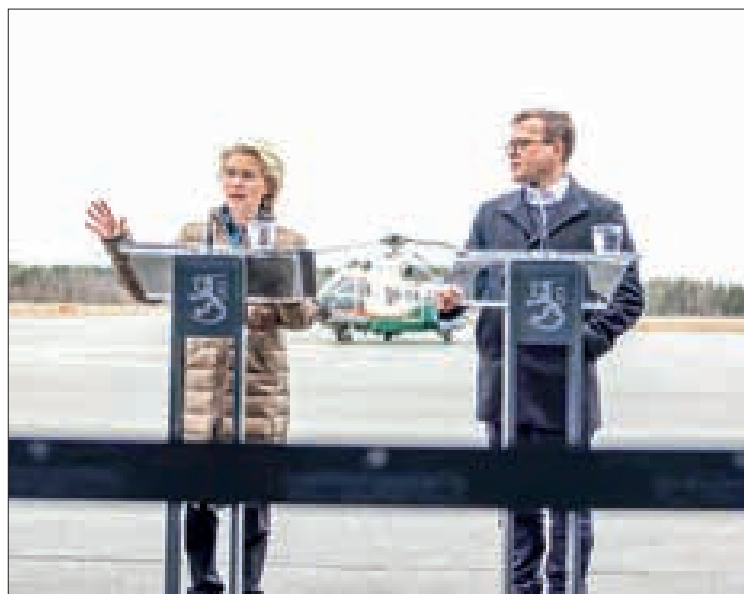
European Commission President Ursula von der Leyen (L) and Finnish Prime Minister Petteri Orpo attend a press conference at Lappeenranta airport, southeastern Finland, on 19 April 2024.

According to local media reports, the purpose of their visit to the eastern border was to inspect a pilot fence, about three kilometres long, built near the Imatra border crossing. — Xinhua