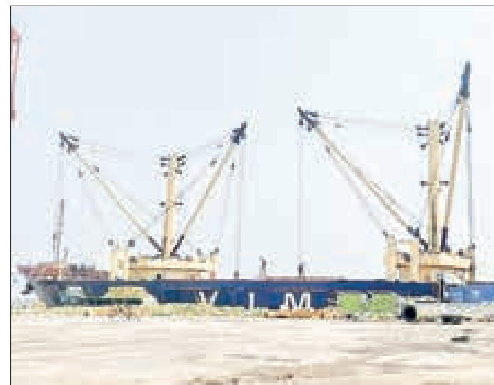
Export corn bags are loaded at The Myanmar Terminal-TMT, Yangon yesterday.

AS the government is encouraging the country's economy by increasing exports, the Ministry of Commerce and the Union of Myanmar Federation of Chambers of Commerce and Industry collaborate to improve the export sector: On 20 April, a total of 12,700 tonnes of corn were exported via The Myanmar Terminal – TMT (formerly known as Bo Aung Kyaw Jetty) as part of the government-private collaboration scheme. A total of 6,600 tonnes of corn will also be exported from Ahlon International Port Terminal 3 on 21 April, 2,700 tonnes of corn from Min Htet Min Jetty on 22 April, and another 7,150 tonnes from The Myanmar Terminal, respectively. — MNA/TMT