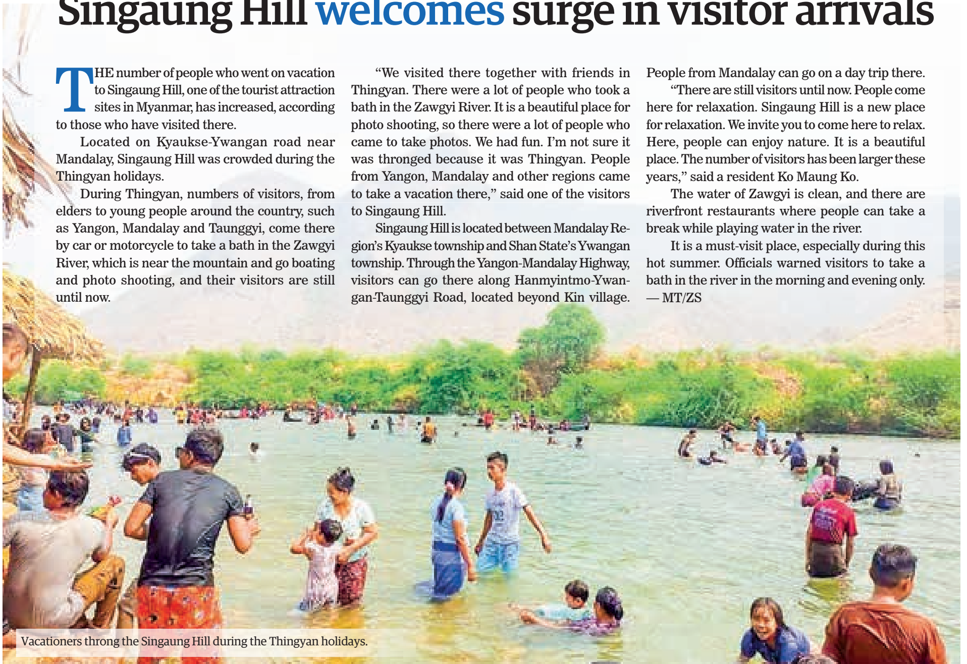
Vacationers through the Singaung Hill during the Thingyan holidays.

It is a must-visit place, especially during this hot summer. Officials warned visitors to take a bath in the river in the morning and evening only. — MT/ZS