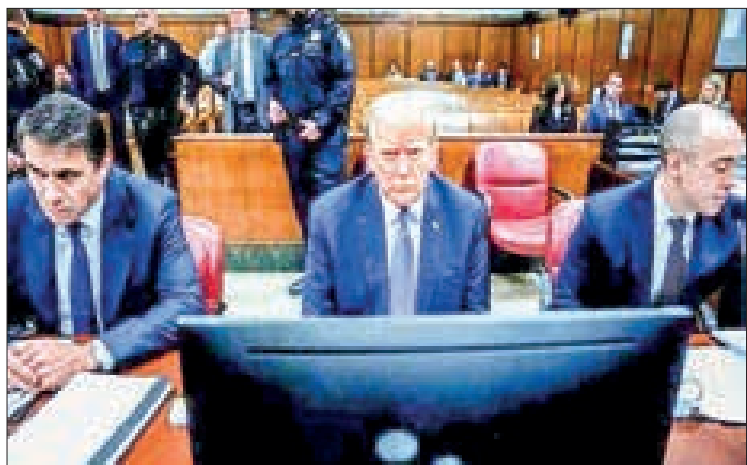
Trump's charges stem from allegations of falsifying business records linked to a hush-money arrangement with an adult film actress before the 2016 election.

A jury is set to hear opening statements on Monday on whether former US President Donald Trump falsified bank records to hide an alleged affair from people in the 2016 election, The Washington Post reported.