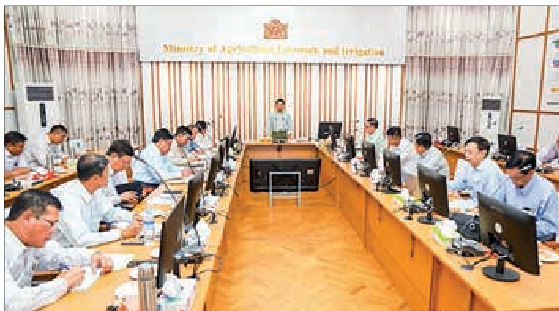
A meeting on implementation of edible oil special zone and expansion of long-staple cotton plantation in progress in Nay Pyi Taw yesterday.

departments concerned also need to supervise to achieve exact figures of sown acreage and production rate to manage the policies systematically. Then, the Union minister made proper instructions regarding the need of water and agro chemicals in expanding the long staple cotton plantation, technical assistance to harvest the cottons, reviewing of local production rate and consumption to expand the plantation in respective finan-