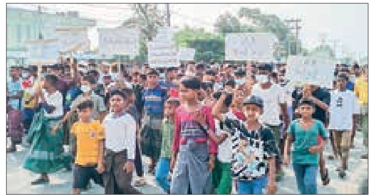
Bengalis from Sittway Township demonstrate at the rally in Sittway yesterday.

During the demonstration, they held placards stating: “We do not want the NUG, AA insurgents who are destroying the peace and stability of the country. We do not want terrorist attacks, fighting, stop firing heavy weapons at residential areas and protect Sittway”. — MNA/TKO