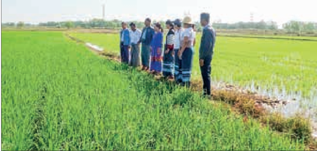
Officials inspect the yield of 90-day Thai rice by the Shwe May Cooperative Society in January.