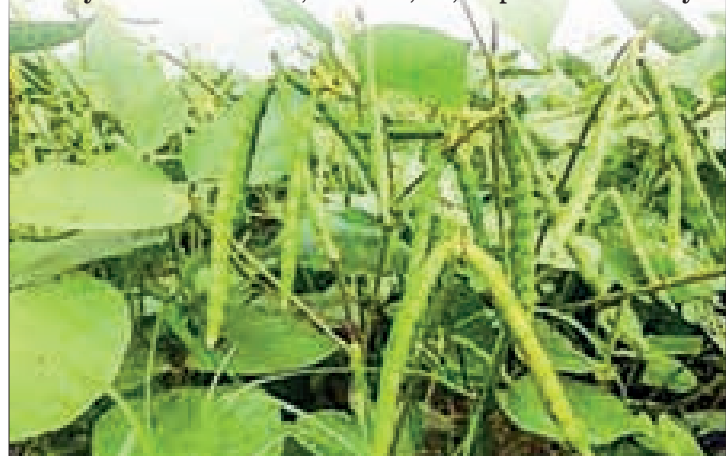
Green gram plants bear successful fruits in the farm.

The Ministry of Agriculture, Livestock and Irrigation and the Ministry of Commerce have agreed to export the green grams to European countries for bean sprouts starting in 2015. — NN/EM