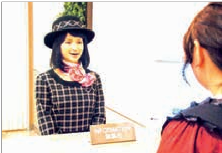
An AI-assisted humanoid robot at information desk at a shopping mall.

This initiative aims to garner broader support for the "Hiroshima AI Process", an effort launched last year by the Group of Seven nations to facilitate discussions on establishing global regulations.