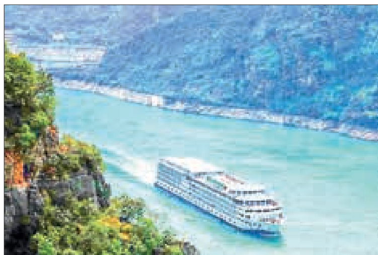
Travel routes to Xinjiang, Zhangjiajie, and the Three Gorges Reservoir are popular. A cruise ship sails through the Wuxia Gorge, one of the Three Gorges on the Yangtze River, in Wushan County, southwest China's Chongqing Municipality.

"Dev radiates goodness. His humanity shines through every time he graces the screen, leaving you no choice but to root for him even when his character is doing something foul; his presence makes you understand where he's coming from," he wrote and praised Dev's latest release, Monkey Man. — ANI