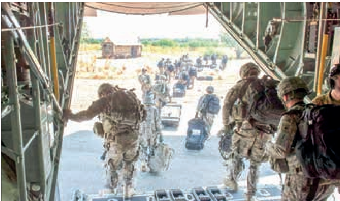
US soldiers and East Africa Response Force soldiers depart a US Air Force C-130 Hercules aircraft in Juba, Sudan, 18 December 2013. The US State Department requested the assistance of US military forces in evacuating personnel from the embassy in Juba to Nairobi, Kenya, amid political and ethnic violence in South Sudan.