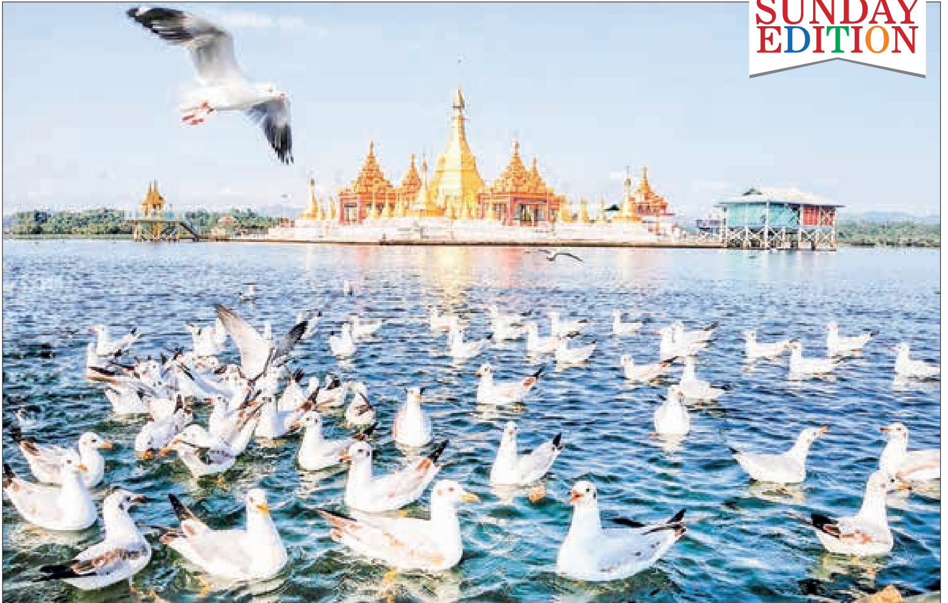
Waterfowl at the Indawgyi Lake in Mohnyin Township in April. Indawgyi is the largest lake in Myanmar and the third largest in Southeast Asia.