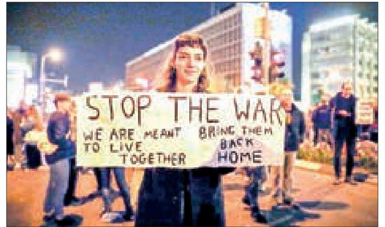
A woman holds a sign during a protest rally against the war in Gaza and calling for a ceasefire, in Tel Aviv, Israel, on 24 February 2024.

likely disrupt the current Israel-Hamas negotiation, the newspaper reported. The Palestinian movement has already turned to at least two alternative countries to host its political headquarters, including Oman, according to the report. On 7 April, a new round of the Israeli-Hamas talks started in the Egyptian capital of Cairo. The ceasefire proposal made at the talks provided for the release of 40 Israeli hostages in exchange for 900 Palestinian prisoners as a part of a three-stage plan adopted by international mediators. Hamas largely rejected the proposal, saying it would present its own plan for a permanent end to the conflict in the region.— SPUTNIK