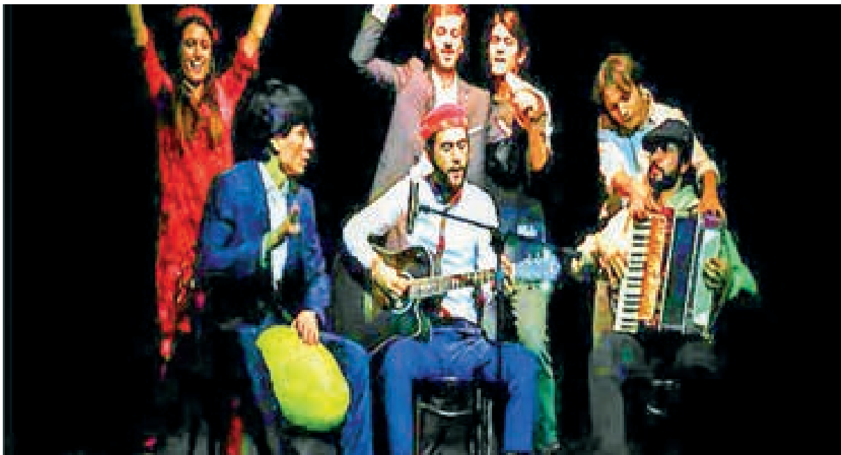
Expressing enthusiasm for Russia's creative achievements, the extensive network of cultural and educational partners in BRICS+ countries is offering an internship for young theatre and film actors.

Various esteemed institutions from participating nations, such as the Beijing Film Academy, the Bangalore University Film Academy from India, and others, have been invited to participate in the programme.