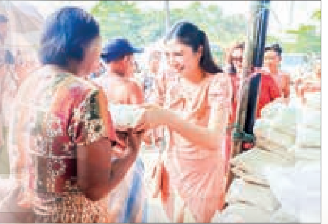
The photo shows actress Shwe Tha Mee, who donates foodstuffs.

Currently, the actress is famous for her movies broadcasting via Maha Application, and she works with Maha Application and Hey Play Application. – ASH/KTZH