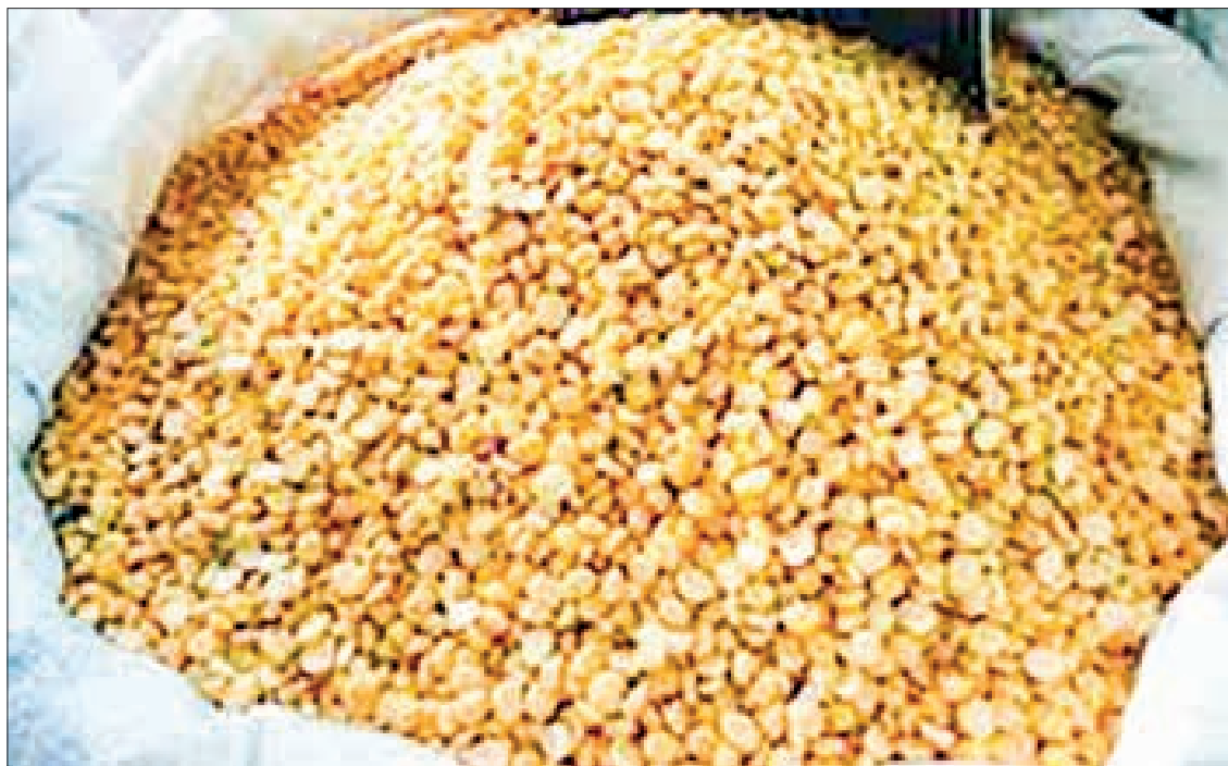
Chickpeas seen for sale in the market.

Myanmar ships a small volume of chickpeas to foreign