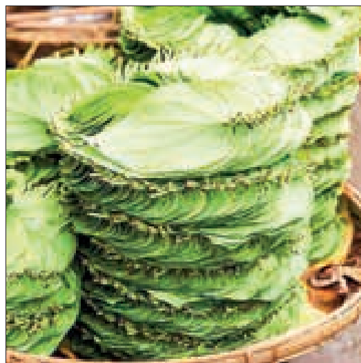
Betel leaves for sale at the Thiri Mingalar market.

ALTHOUGH the betel price increased during Thingyan, it dropped in the previous two days,