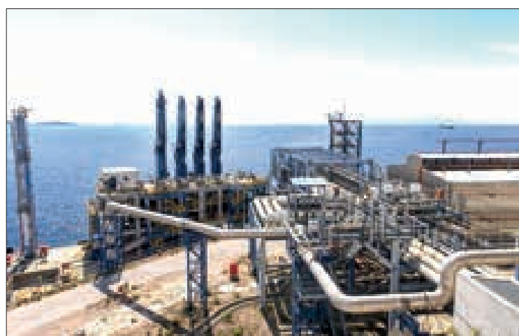
Photo taken on 21 September 2022 shows Greece's only liquefied natural gas (LNG) terminal on the islet of Revithoussa near Athens.