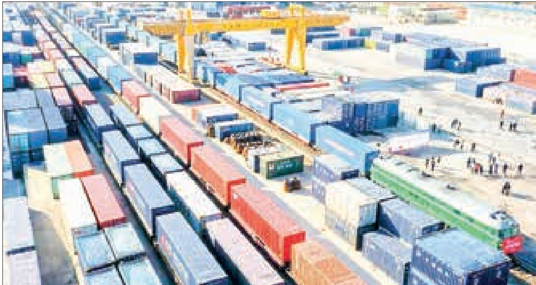
Aerial photo taken on 17 February 2020 shows a China-Europe freight train fully loaded with auto parts, mechanical facilities and garments bound for Moscow of Russia and Minsk of Belarus waiting for departure at Xiangtang railway port in Nanchang, east China's Jiangxi Province.

Nanchang International Land Port (NILP) in Nanchang, Jiangxi Province, China, operates at full capacity daily, facilitating seamless logistics operations with fully loaded freight trains departing for various destinations, including Nansha Port in Guangzhou.