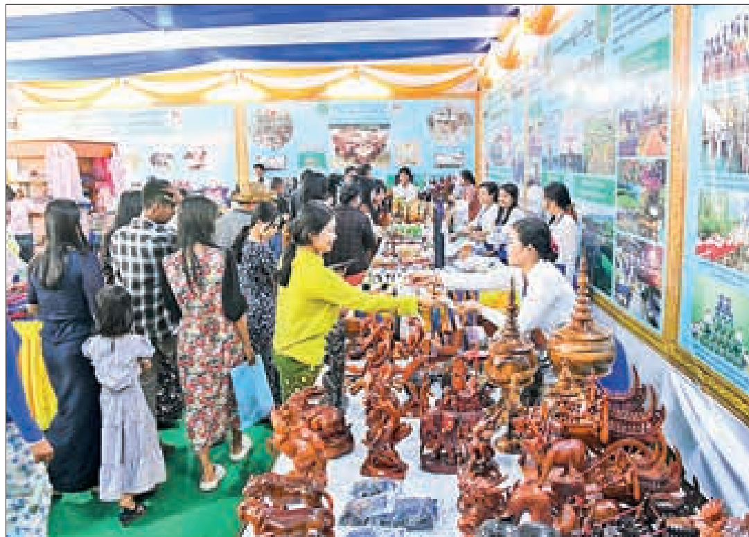
Visitors through the previous MSME exhibition event.