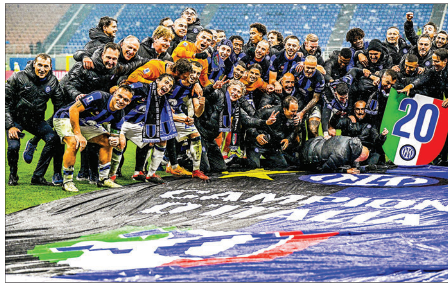
Inter Milan players and team members celebrate winning the 2024 Scudetto championship title on 22 April 2024, following the Italian Serie A football match between AC Milan and Inter Milan at the San Siro Stadium in Milan.

INTER Milan sealed the Serie A title on Monday after beating AC Milan 2-1 and creating an unassailable lead at the top of the league with their sixth straight