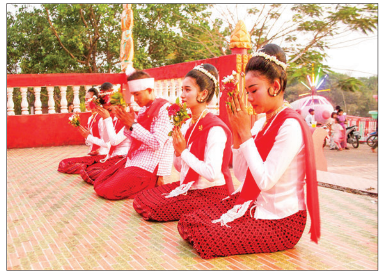
Young villagers are depicted worshipping at the pagoda festival.

scores assigned by five scoring teams based on the condition of bullocks, carts, elegance, costumes, and physical positions. The winner received a worthy award, and the festival attracted visitors from far and wide.