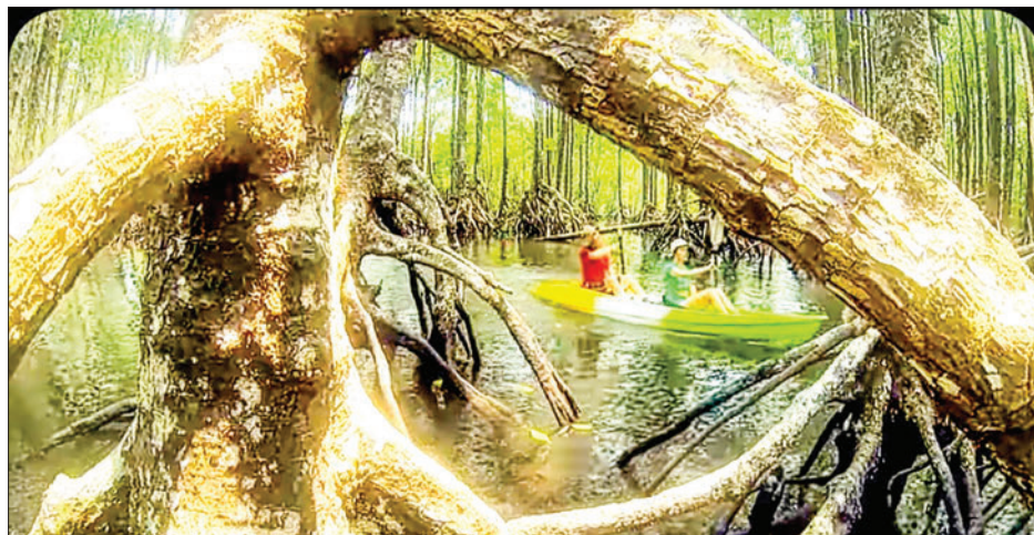
Captivating interior views of Lampi Marine National Park, a vital part of the blue economy driving tourism.

Brunei boasts one ASEAN Heritage Park, one in Laos, two in Cambodia, two in Singapore, three in Malaysia, six in Thailand, seven in Indonesia, eight in Myanmar, nine in the Philippines and ten in Viet Nam. The ASEAN Community possesses 49 ASEAN Heritage Parks. SEE PAGE-10