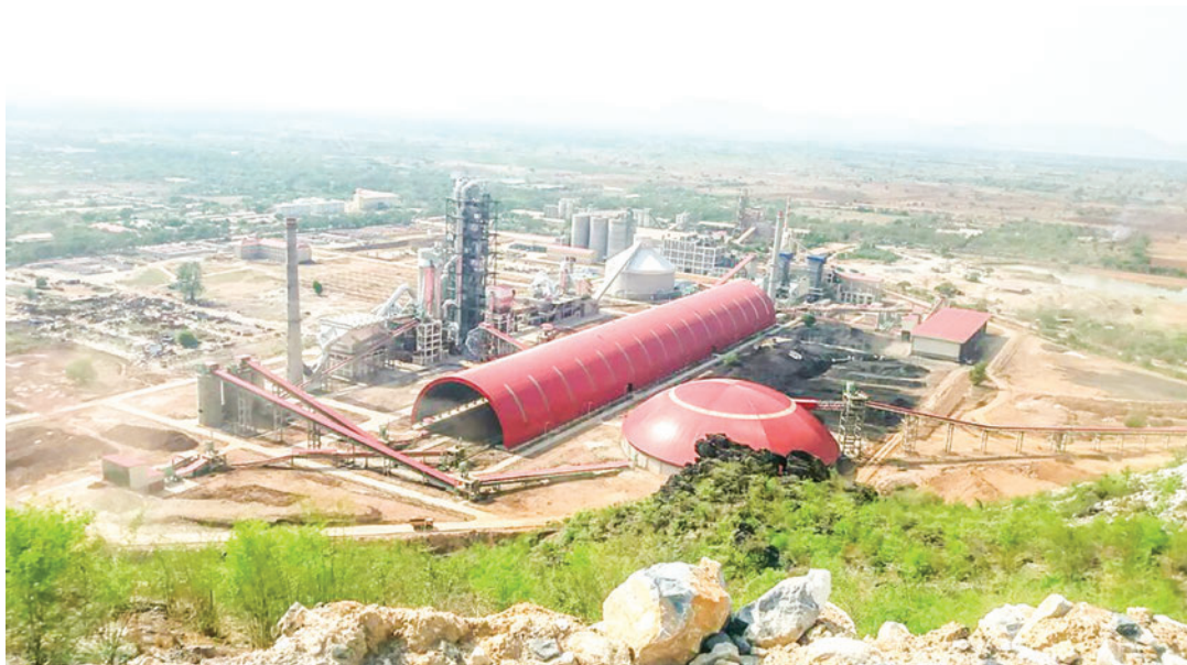
Heavy Industry 33 (Kyaukse).