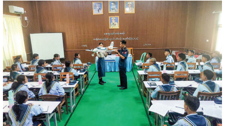
Images showcase basic and advanced maritime and aviation training activities.

flying techniques, airfield procedures, RC/Flight simulator