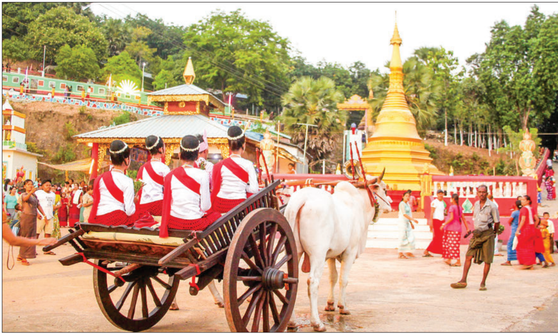
Competitor: Adorned bullock cart with village damsels onboard.

THE 49 th Pagoda Festival and Adorned Bullock Cart Competition of Kamamo Village in Chaungzon Township, Mon State, took place on a grand scale