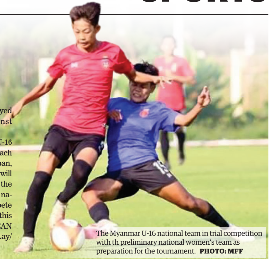
The Myanmar U-16 national team in trial competition with the preliminary national women's team as preparation for the tournament.