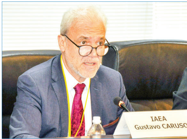
Gustavo Caruso, head of an International Atomic Energy Agency task force, attends a meeting with Japanese officials and Tokyo Electric Power Company Holdings Inc representatives at the Foreign Ministry in Tokyo on 23 April 2024.