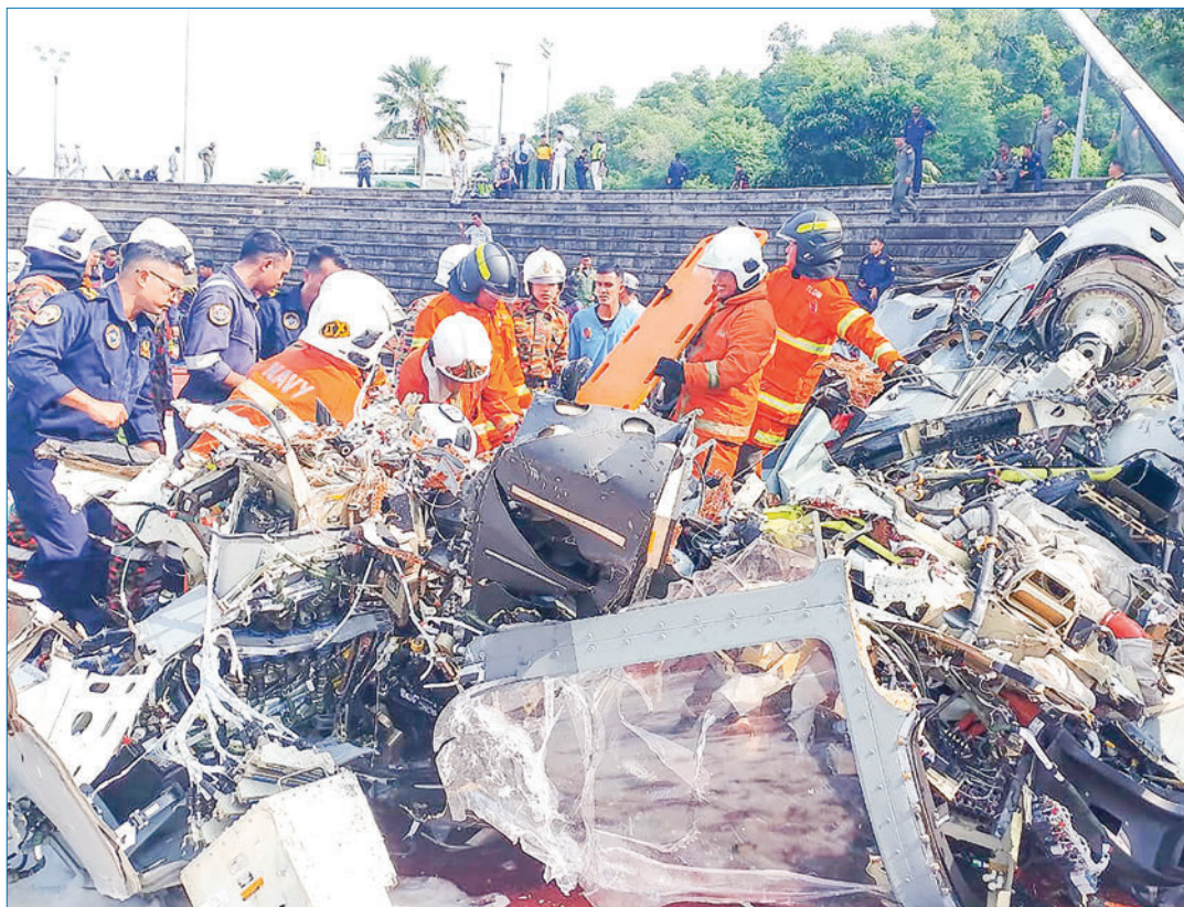
This handout picture taken and released on 23 April 2024 by Perak's Fire and Rescue Department shows rescuers inspecting the crash site after two military helicopters collided in Lumut in Malaysia's Perak state.

The AgustaWestland helicopter crashed at the naval base's swimming pool area.