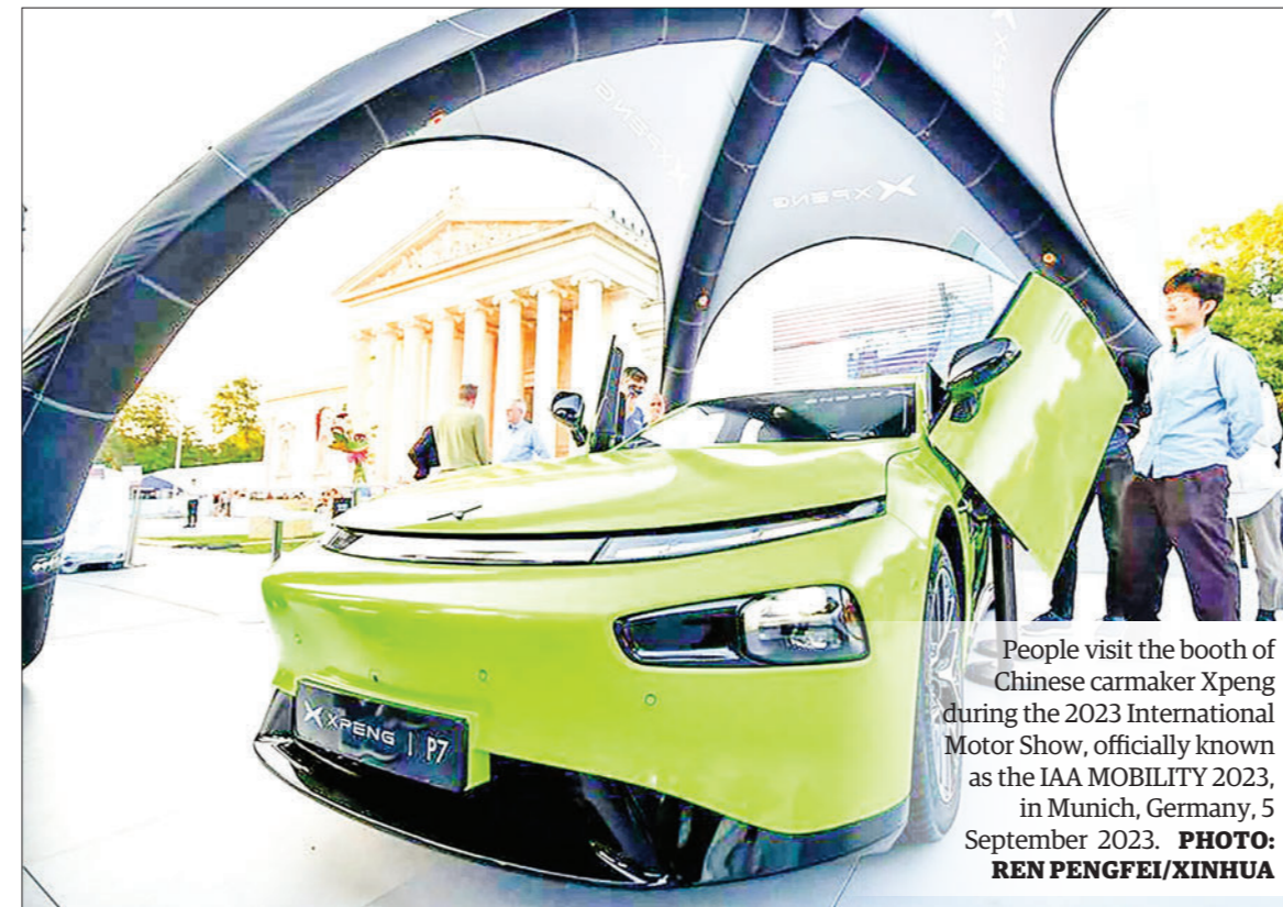
People visit the booth of Chinese carmaker Xpeng during the 2023 International Motor Show, officially known as the IAA MOBILITY 2023, in Munich, Germany, 5 September 2023.

In about three minutes, NIO's Power Swap Stations allow ve-