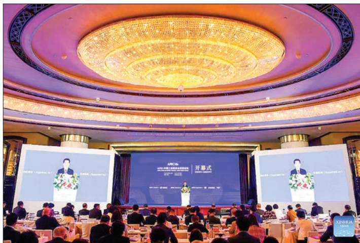
This photo taken on 22 April 2024 shows a view of the opening ceremony of the APEC China Business Council Hong Kong Forum in Hong Kong, south China. The APEC China Business Council Hong Kong Forum opened on Monday in Hong Kong with participants discussing the stabilizing and smoothing of global industrial and supply chains and promoting sustainable development.

Paul Chan, financial secretary of the HKSAR government, said that Hong Kong is an international financial, trade and shipping centre. It is a founding member of the World Trade Organization and a member of APEC. — Xinhua