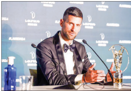
Serbian tennis player Novak Djokovic reacts during a press conference at the 2024 Laureus World Sports Awards in Madrid, Spain, 22 April 2024.