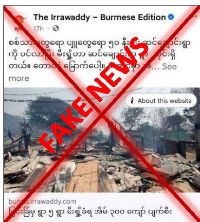
The screenshot validates fabricated stories.

Joint security forces are conducting area security in order to prevent PDF terrorists from entering the towns and villages in Mandalay Region and carrying out terrorist acts. But subversive news media intentionally conspire to create fear and misrepresentation of the security forces with false information. — MNA/KZL