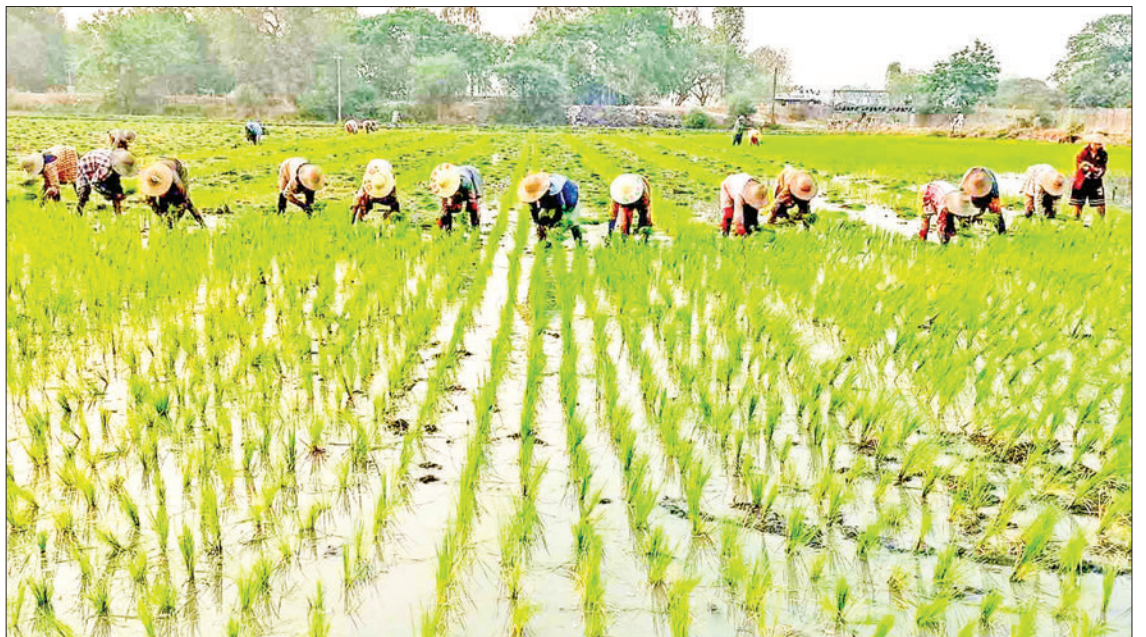
The photo shows an acre of summer paddy and farmers working on it.

Training on Good Agricultural Practices (GAP), cultivation methods for increasing yields, and research and technical training for improving target yield will be provided in May, July, and September, respectively. — ASH/TRKM