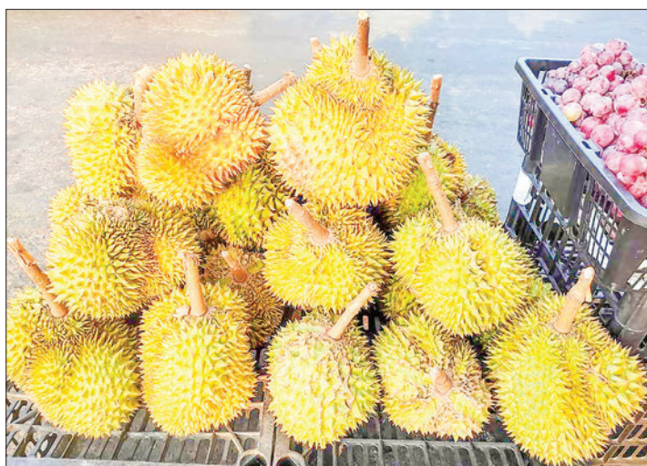
Thai durians, also known as grafted durians, have occupied the market.

dalay Region, and the fruit production will be plentiful in June. We expect the sales to be higher. If there is a lot of production, there will be consumers because most Myanmar people like durian. Nine out of ten women like durian,” he said. Thai grafted durians have moderate sales in the market, but they are expensive compared to Myanmar durians, which is why their sales have been still low.