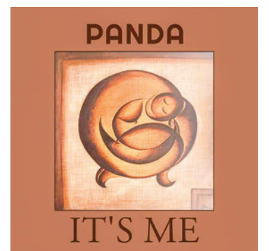
Some paintings of PANDA which will be displayed at the exhibition.

The exhibition will feature paintings by Panda that are available for viewing and purchase. Additionally, colourful artworks such as watercolours, oil paintings, and acrylic paintings will be on display at the 'IT's ME' Solo Art Exhibition. — ASH/TRKM