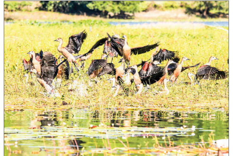
The image beautifully depicts migratory birds thriving in the serene sanctuary of Indawgyi Lake.

economy as well as geological features and climate. Travellers are interested in nature-based tourism, such as the maritime, land, and ice-capped mountains. Myanmar is one of the countries that grab the interest of visitors. Myanmar is a country with plenty of natural heritage,” said U Kyi Oo, head of Lampi Marine