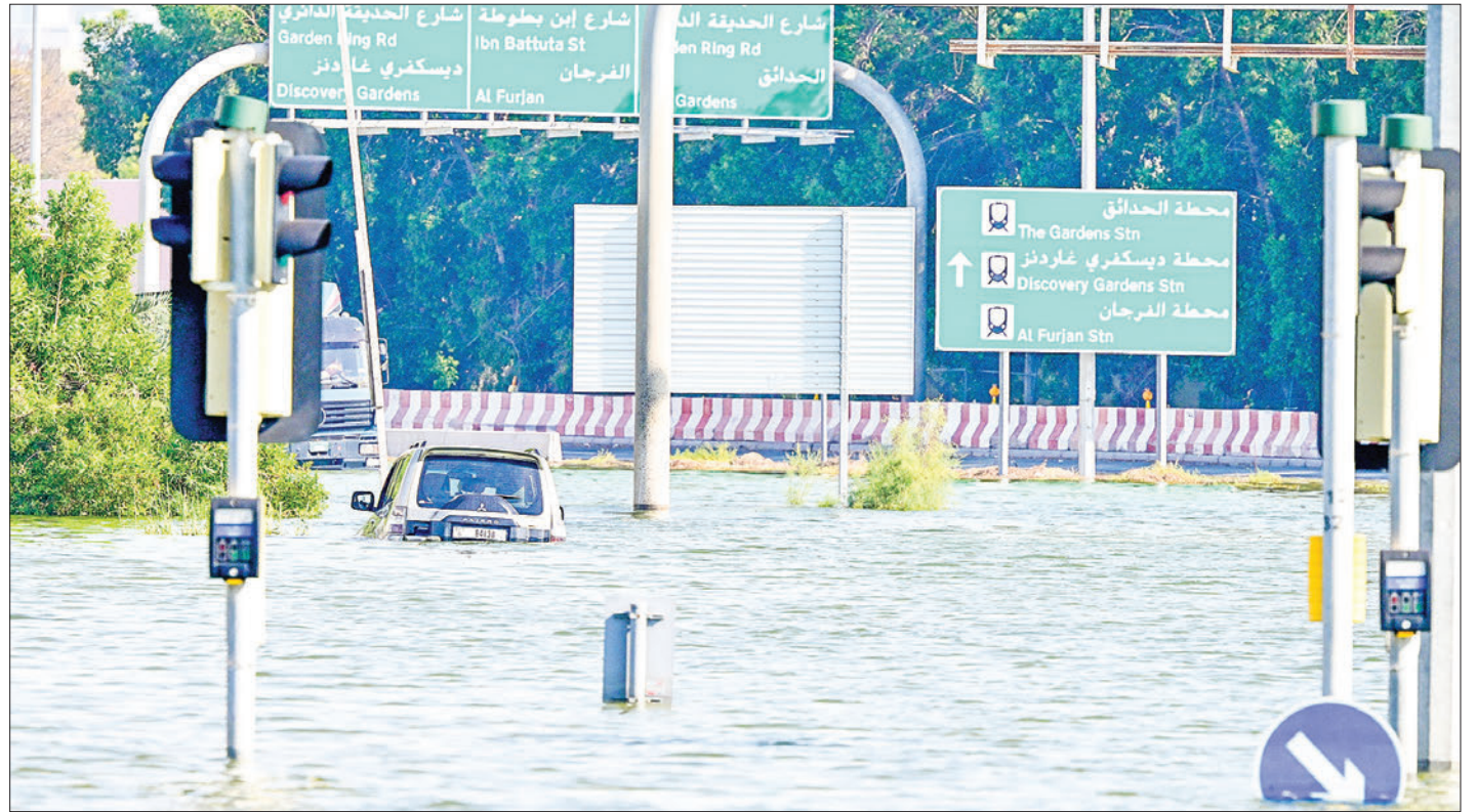
A car is stranded on a flooded street in Dubai on 19 April 2024.