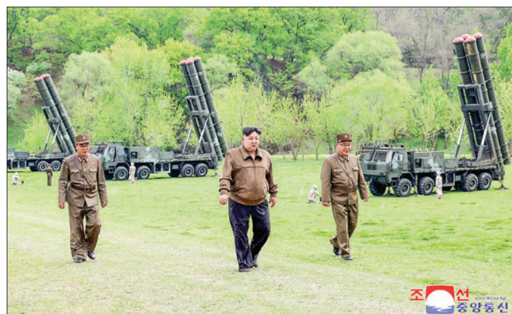
This picture taken on 22 April 2024 and released from North Korea's official Korean Central News Agency (KCNA) via KNS on 23 April 2024 shows North Korea's leader Kim Jong Un (C) observing a virtual nuclear counterattack training exercise with a large "rocket artillery" unit, at an undisclosed location in North Korea.

KIM Jong Un, top leader of the Democratic People's Republic of Korea (DPRK) oversaw a simulated nuclear counterattack drill on Monday, the official Korean Central News Agency (KCNA)