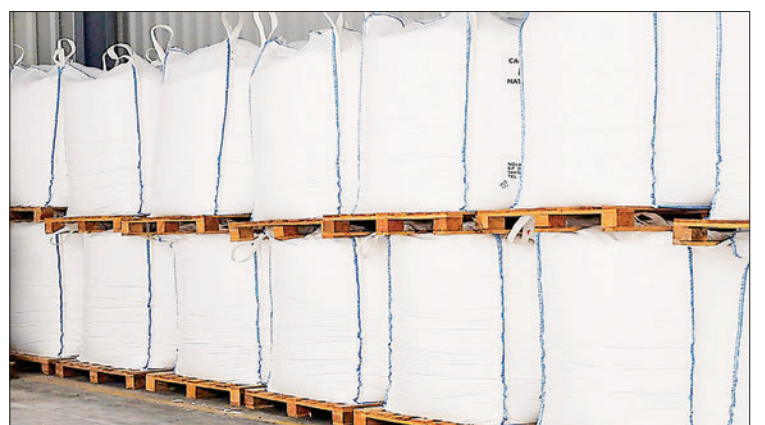
Bags of export sugar seen in the warehouse.

Cane is harvested only once a year since it usually commences cultivation in December and January and is harvested in December, January, and February of next year. — NN/ TMT