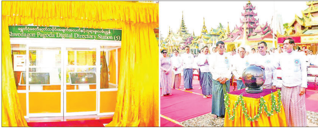
The opening ceremony of the pagoda digital directory was held at the Shwedagon Pagoda.