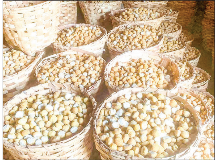
Baskets of toddy palm jaggery before transporting into markets.

Toddy palm jaggery is a traditional Myanmar sweet that is served as a dessert after meals for good digestion, while some eat it together with leftover rice.