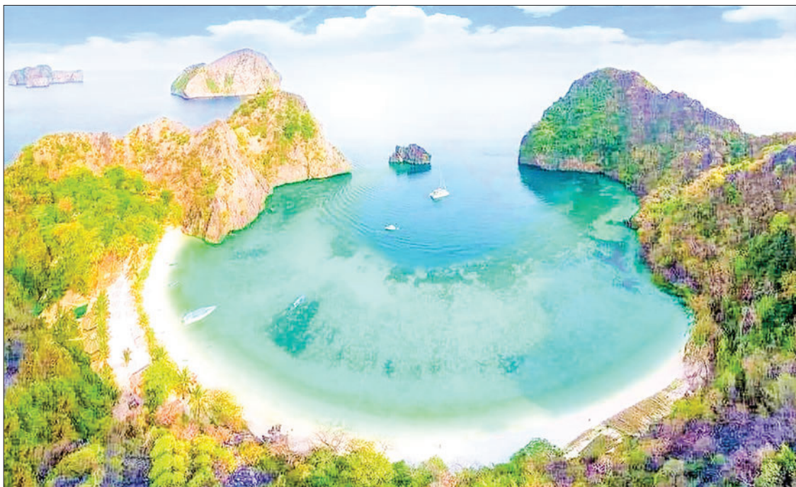
The photo captures a stunning recreation destination in the Myeik Archipelago, featuring a picturesque beach with a horseshoe-shaped coastline.