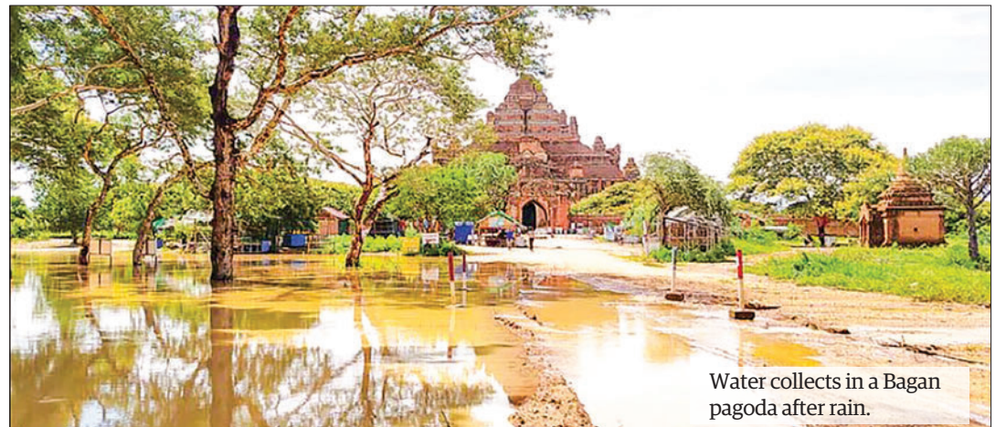
Water collects in a Bagan pagoda after rain.