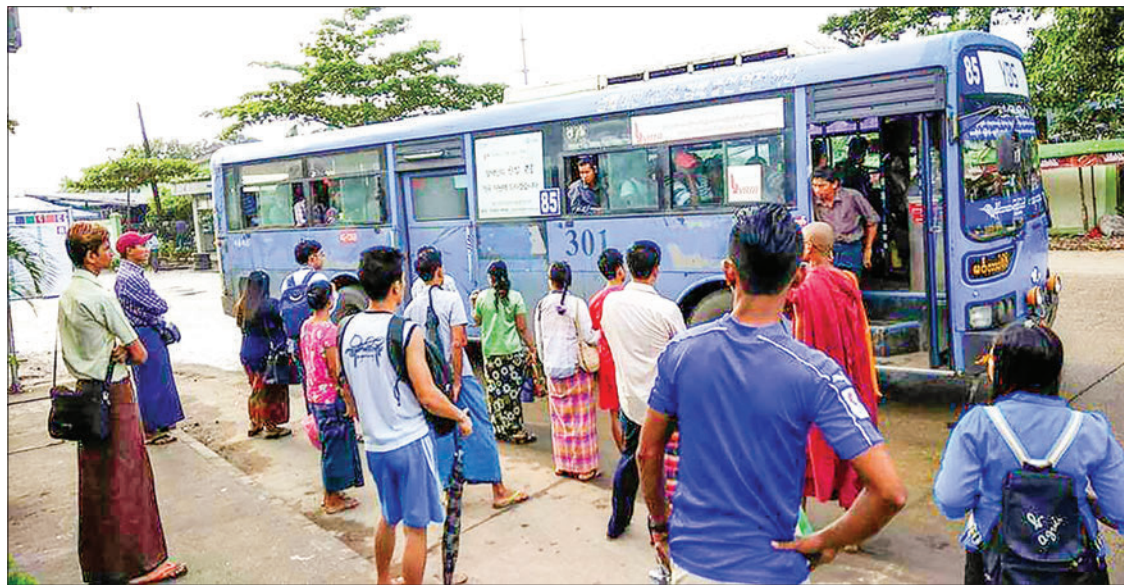
The photo shows some YBS buses running in Yangon's downtown areas.

The bus fare hike has caused some inconveniences to working-class people, according to a Yangon commuter.