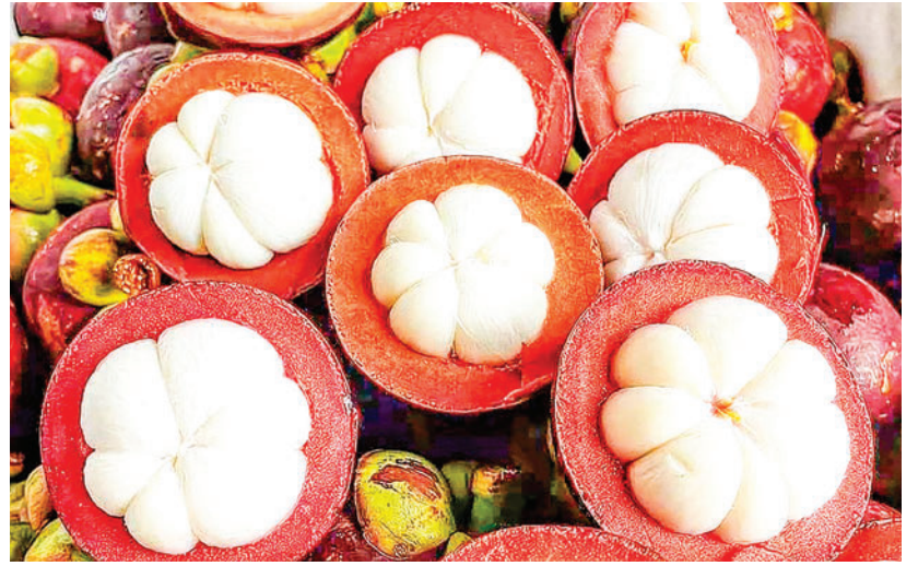
The images showcase a flourishing mangosteen tree bearing ripe fruits, with some half-peeled mangosteens revealing their enticingly sweet taste, attracting fruit enthusiasts.