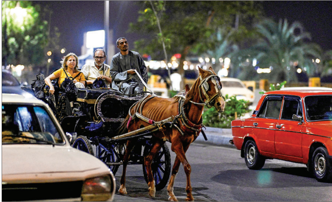
Tourists take a ride in a horse-drawn cart alongside the Nile river in Aswan in Upper Egypt on 19 April 2024.

At the same time, the report called for efforts by the global tourism industry to turn challenges from technology advancements and climate change into growth opportunities, proactively incorporating them into reshaping the industry.