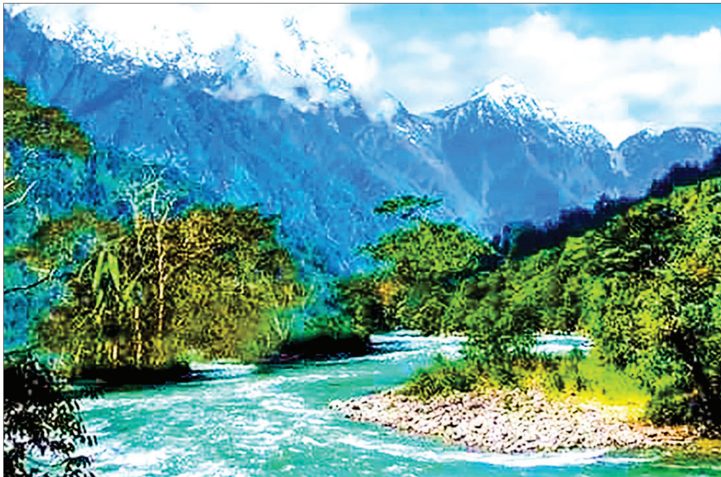
The photo captures the breathtaking scenery of Khakaborazi National Park against the backdrop of snow-capped mountain ranges in northern Myanmar.

tonnes. U Than Zaw Htay stated, "We can meet two-thirds of the local demand. No 33 Heavy Industry (Kyaukse) currently SEE PAGE-2