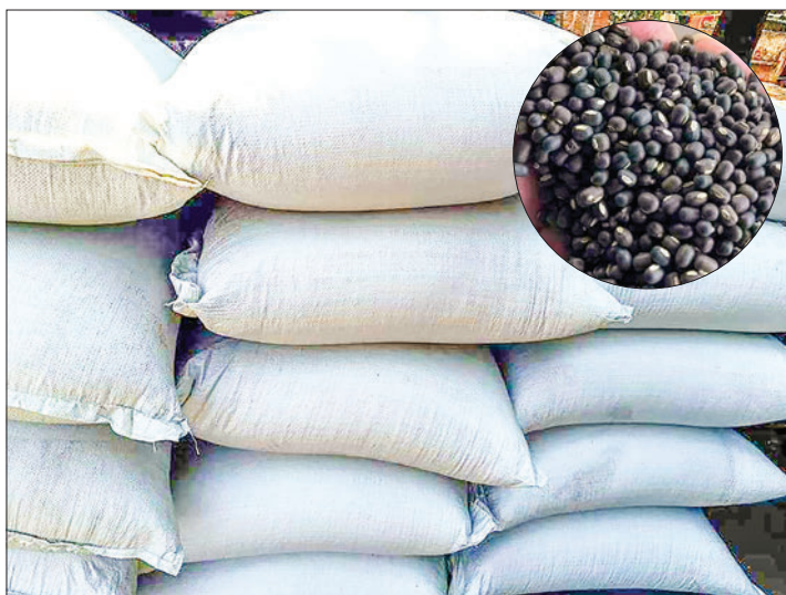
Bags of black grams are in the market, and the vendor shows the quality of the pulses.

Although India buys pigeon peas from Myanmar, Brazil and other countries, it prefers Myanmar's pigeon peas for good quality and sufficient quantity. What is more, the Indian government extended the duty-free import policy on pigeon peas and black grams until March