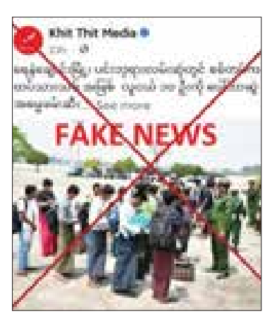
The screenshot validates misinformation.

Subversive media is spreading false information. Regarding