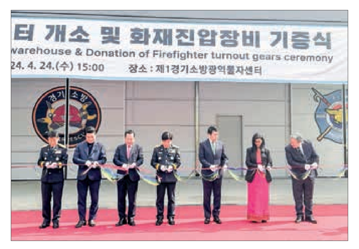
The handover event to donate firefighter turnout gears to Myanmar and Sri Lanka in progress on 24 April 2024.

THE Republic of Korea provided firefighting personal protective equipment, including jackets, helmets, gloves, and boots, to Myanmar at the opening ceremony of the Gyeonggi-do Firefighting Equipment Logistics Centre in Gyeonggi-do Province, Republic of Korea, on 24 April, according to the Ministry of Foreign Affairs.