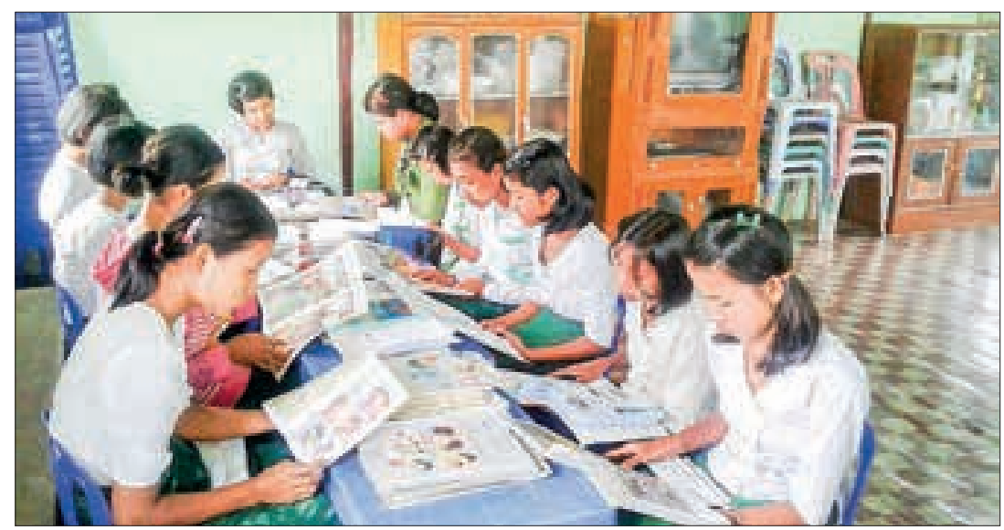
Students are seen reading in the school library at Thayetaung High School.

ACCORDING to the Ministry of Education, the schedule for Basic Education Schools includes dedicated time for both reading and sports.