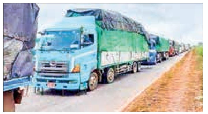
Trucks are seen queuing to pass the Nyaungkhashay permanent checkpoint in Bago Region.

Interested businesses can buy the tender form with K50,000 and shall submit the forms no later than the targeted deadline. In fact, submitting the tender forms via email will be unacceptable, the report stated. — NN/TMT