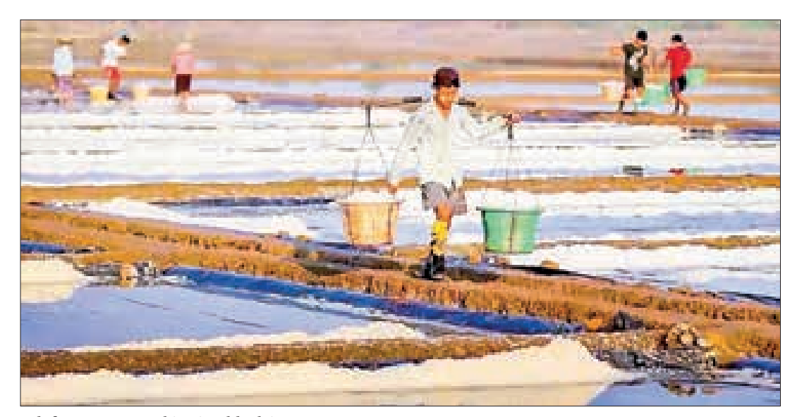
Salt farmers are working in a block in Mon State.

Mon State, the second largest producer in Myanmar, yearly produces 40,000 tonnes of sun-dried salt, beyond magnesium chloride (MgCl2), iodized salt (I2) and table salt (NaCl), with 12 salt processing factories. — NN/TMT