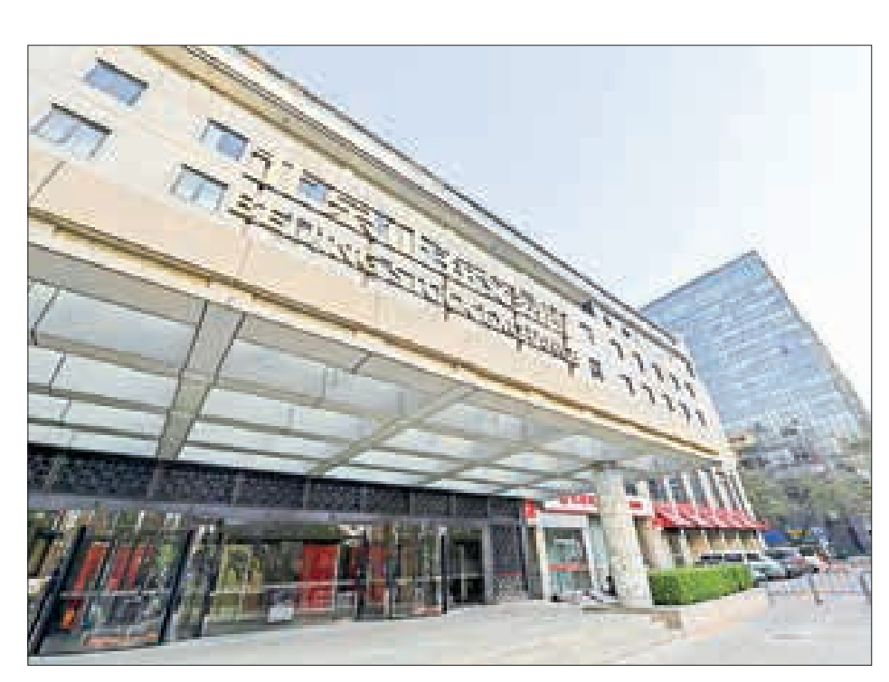
Photo taken on 14 November 2021 shows an exterior view of the Beijing Stock Exchange in Beijing, capital of China.

As of 25 April, there were 248 companies listed on the BSE, with a total market value of over 340.64 billion yuan, according to the data. — Xinhua