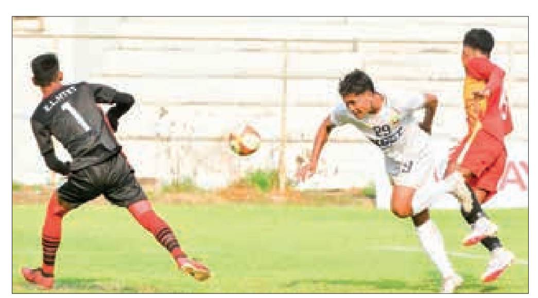
Players of Shan United and Rainbow FC are vying to control the ball in the group match.