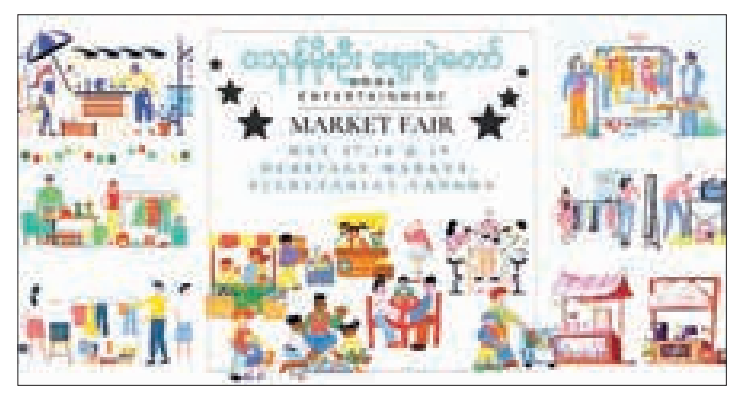
An advert poster for the early-monsoon market fair.

AN early-monsoon market festival will be held from 17 to 19 May at the Secretariat Yangon, formerly the ministers' office, in Botahtaung Township, Yangon Region, according to Dora Entertainment, an organizer of