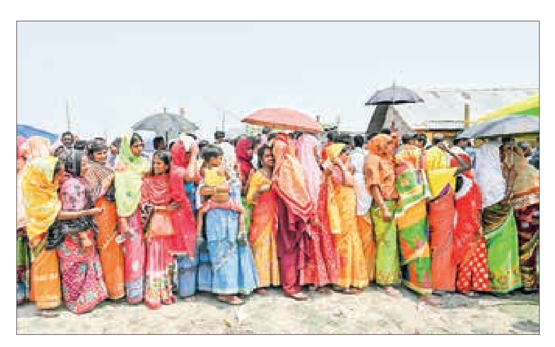
Voters stand in a queue to cast their ballot outside a polling station during the second phase of voting for the India's general election at Gashbari village in Darrang district of Assam state on 26 April 2024.