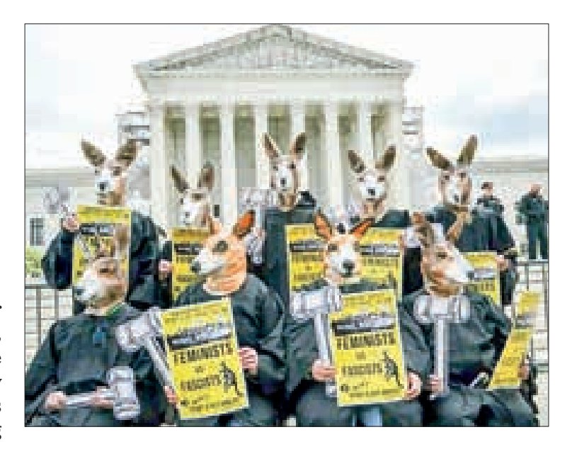
Protestors dressed like a "kangaroo court" demonstrate outside the US Supreme Court as it hears Donald Trump's presidential immunity claim.

By even agreeing to hear the case, the Supreme Court, which has a 6-3 conservative majority, already significantly delayed the start of Trump's trial on charges of conspiring to overturn the results of the 2020 election won by Joe Biden.— AFP