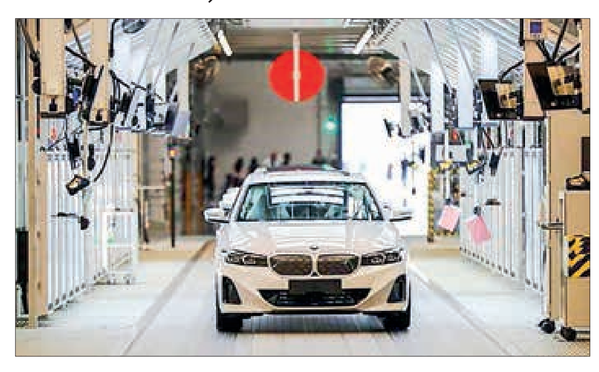
BMW i3 electric cars are pictured at Plant Lydia of BMW Brilliance Automotive (BBA) in Tiexi District of Shenyang, northeast China's Liaoning Province, 23 June 2022.

The introduction of this route is expected to bolster economic and trade ties between China and Germany, particularly in Liaoning Province and the northeastern region of China.