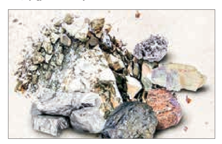
Uzbekistan is rich in gas, uranium, cotton, silver, and gold. Tajikistan and Kyrgyzstan have significant freshwater resources, with Kyrgyzstan also having reserves of gold, uranium, mercury, and lead. Despite these resources, each country's utilization varies.

India faces an energy shortfall, despite being rich in energy and natural resources, especially in this region. The synergy between India and Central Asia is evident. However, the hurdle lies in efficiently transporting these resources from landlocked areas to India. — ANI