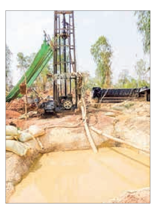
Mechanical digging a tub ewell in the hot and dry zone.

Mon State and Kayin State governments are preparing to conduct rehabilitation tasks together with the locals in Kawbein, Dhammathat, and surrounding villages to ensure that homes for displaced persons are provided as soon as possible. As peace and stability returned to the villages, locals returned to their homes. — MNA/TTA