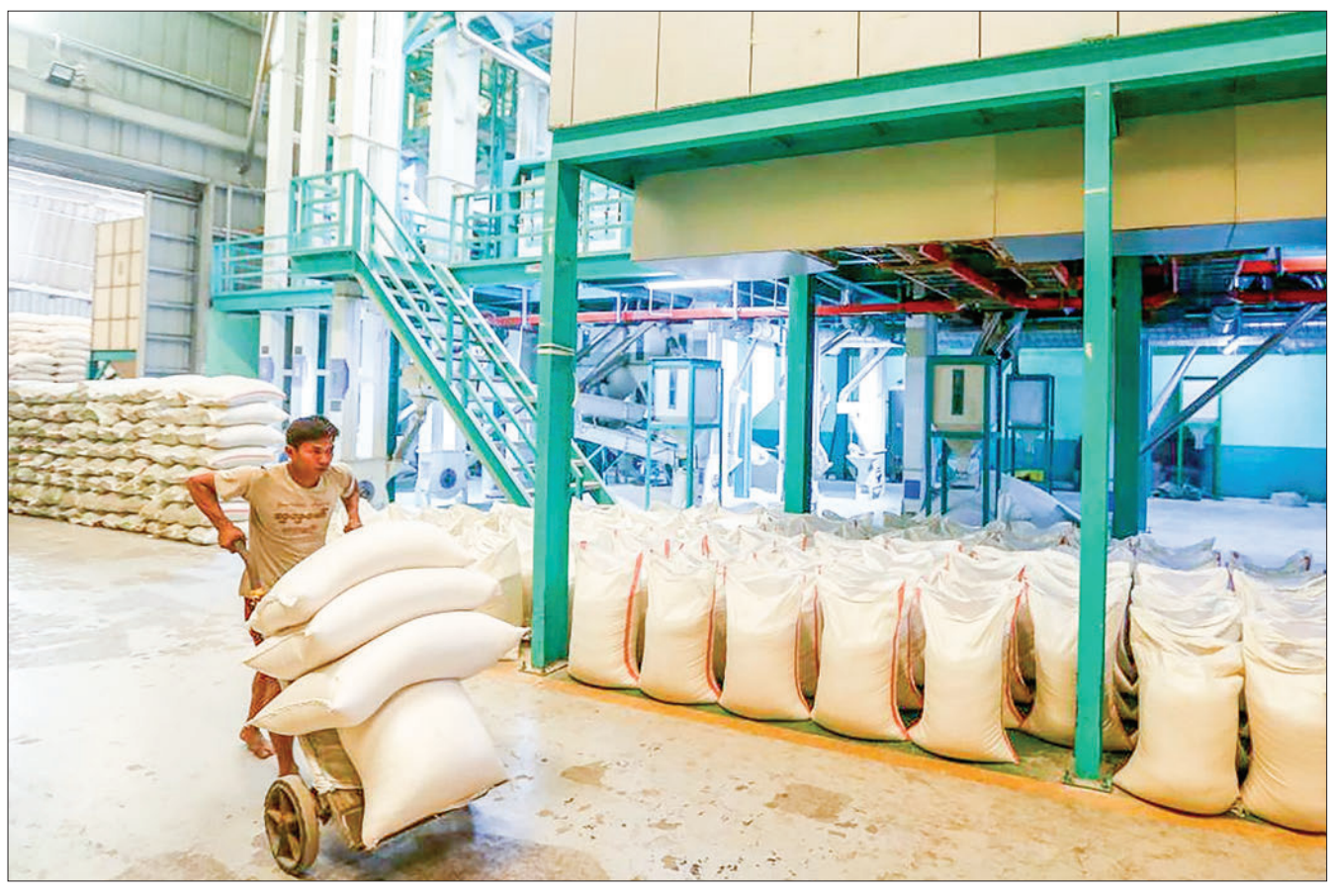
A worker transfers export rice bags at a warehouse in Yangon, Myanmar.