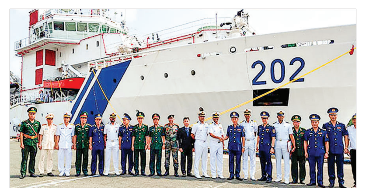
Indian Coast Guard ship in Viet Nam.

During the three-day visit, the crew of ICGS Samudra Paheredar will engage in professional interactions focusing on Marine Pollution Response (MPR), Maritime Search and Rescue (M-SAR), and Maritime Law Enforcement. Activities include cross-deck training, Sub-