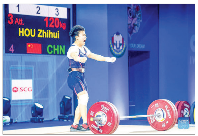
Hou Zhihui of China celebrates after a successful attempt in the women's 49kg competition at the IWF World Cup in Phuket, Thailand, 1 April 2024

CHINA'S Hou Zhihui set a snatch world record at the International Weightlifting Federation (IWF) World Cup here on Monday, as she renews her quest for another Olympic appearance.