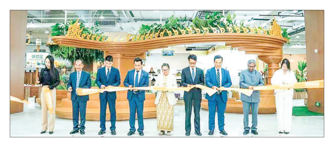
The opening ceremony of the Myanmar Trade Centre (Kunming) in action on 31 March 2024.

THE Myanmar Trade Centre (Kunming City) was opened at China (Yunnan) Pilot Free Trade Zone in Kunming City, Yunnan Province of the People's Republic of China, on 31 March, according to the Myanmar Trade Promotion Organization under the Ministry of Commerce.