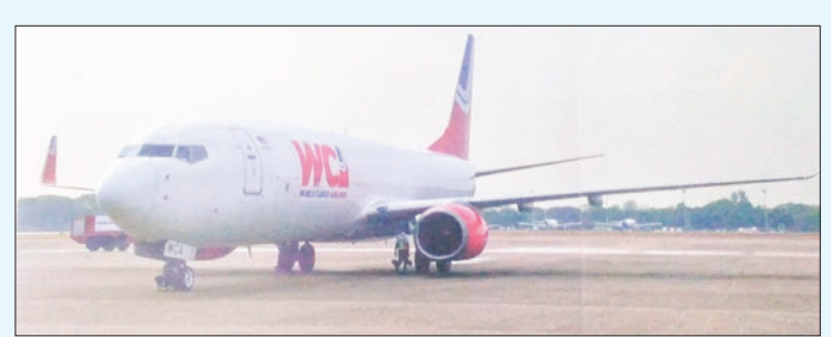
One aircraft of the MNA fleet.