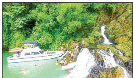
Kawthoung expected to draw more visitors than Myeik Archipelago during Thingyan