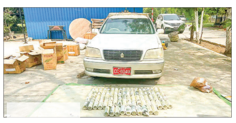
Seized illegal goods and vehicles in Mandalay Region.

An unregistered Honda Fit car, valued at approximately K7.3 million, was seized at the Ayeyawady Bridge checkpoint. A Canter truck, valued at approximately K20 million, was intercepted in Minhla township, carrying 500 gallons of illegal fuel oil worth K5.5 million. A Luojia 110 motorbike, with an estimated value of K650,000, was stopped