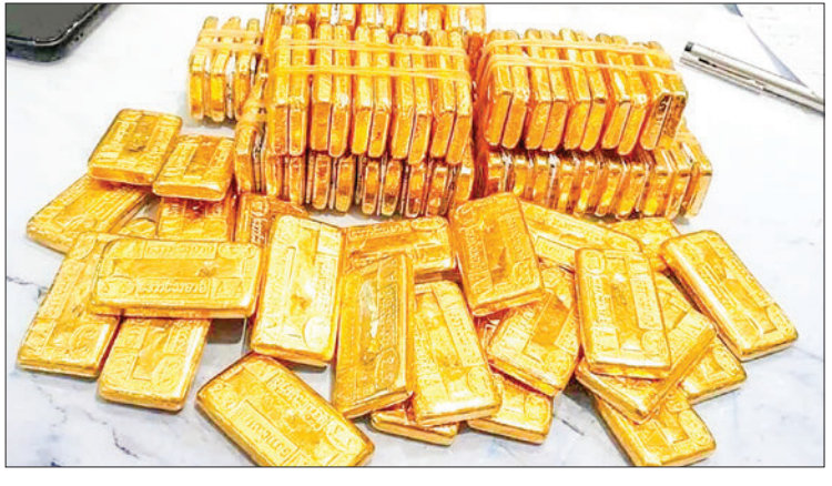
Premium gold of the Academy emblem with rising price on the market.

The domestic gold price is on the high side on account of the spot gold price rally and kyat depreciation against the dollar. The Yangon Region Gold Entrepreneurs Association (YGEA) set