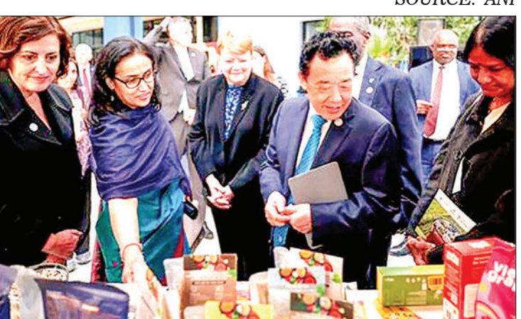
Millets are a group of small-seeded grains that are cultivated as cereal crops for human consumption. They are highly nutritious and are often used in various cuisines around the world.