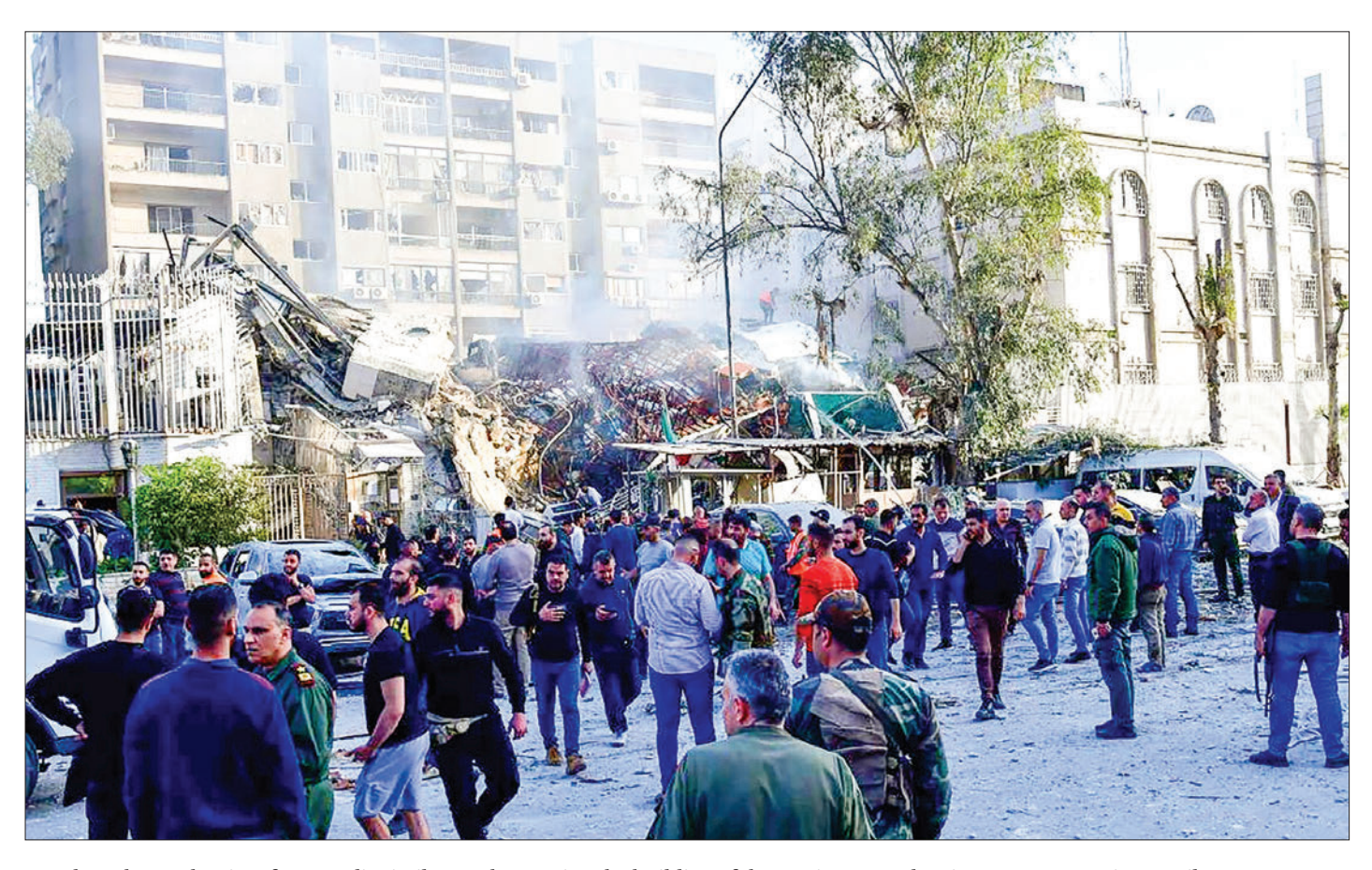
People gather at the site of an Israeli missile attack targeting the building of the Iranian Consulate in Damascus, Syria, 1 April 2024.

According to the Syrian Observatory for Human Rights, the strikes resulted in the death of eight people, including a high-ranking commander of the Quds