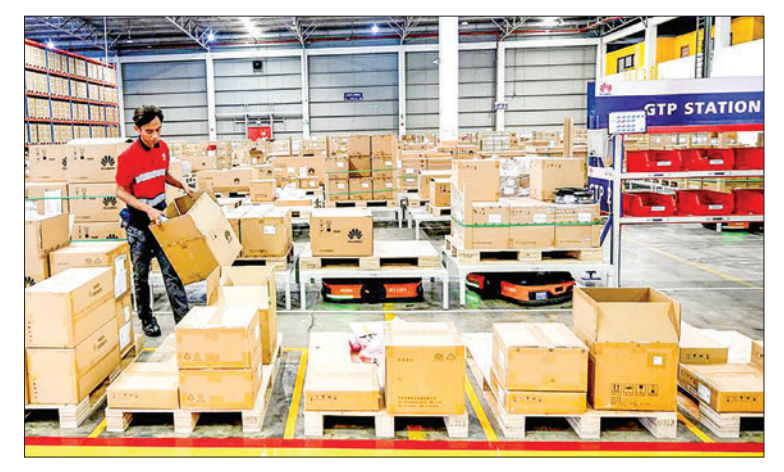
This photo taken on 7 March 2024 shows Indonesia's first 5G smart warehouse in Bekasi, West Java, Indonesia.

INDONESIA aims to achieve its "Golden Indonesia 2045 Vision", which involves becoming an ad-