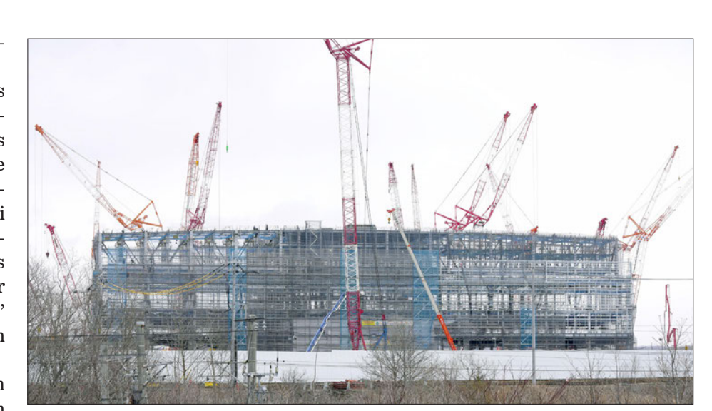
The construction site where Rapidus Corp is building a plant is pictured in Hokkaido's Chitose on 2 April 2024.

The company has said it will need roughly five trillion yen for the pro-