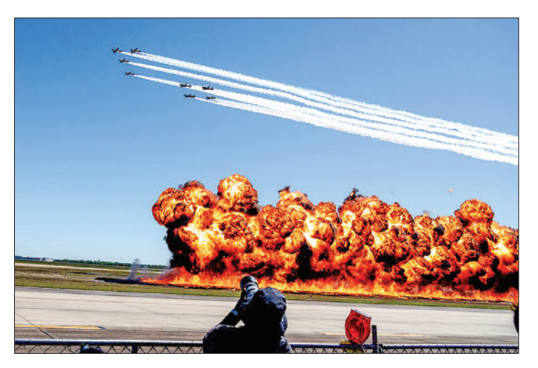
Aircraft perform "Tora, Tora, Tora" to simulate Japanese attack on Pearl Harbor during the airshow at Ellington Airport, Houston, Texas, the United States, on 14 October 2023.

Utterdyke pointed out that Conter had an exemplary career in the US Navy and was steadfast in imploring the schools, parents and everyday Americans to always remember Pearl Harbor. — Xinhua