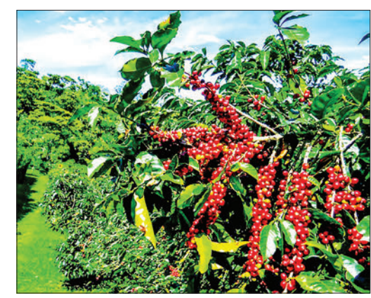
A coffee plantation.

The Department of Agriculture is sharing expertise, knowledge, and marketable coffee seedlings and tools to support this initiative. — ASH/NT