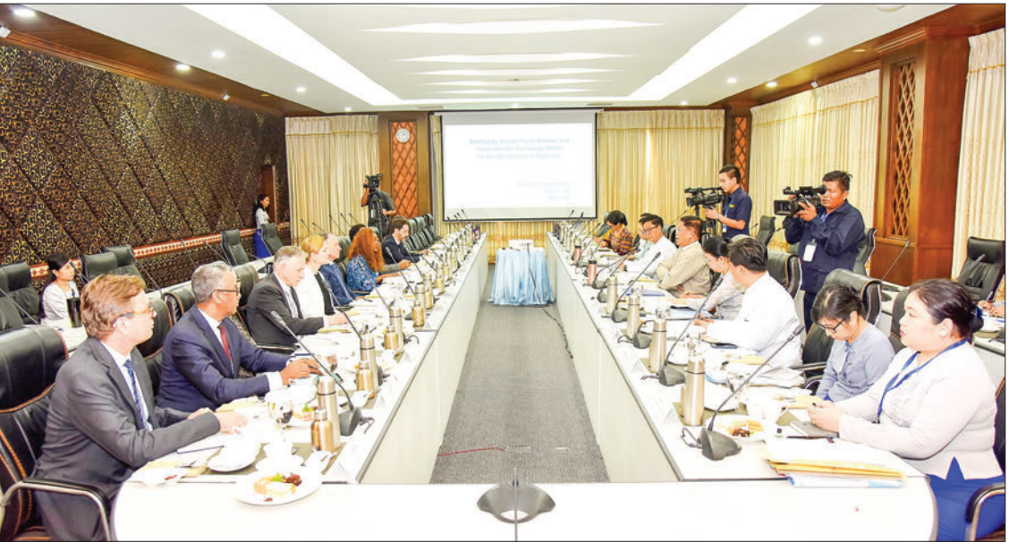
The meeting between Deputy Prime Minister Union Foreign Affairs Minister U Than Swe and the delegation led by the UN Resident and Humanitarian Coordinator ad interim underway yesterday.

The MoFA deputy minister and senior officials also joined