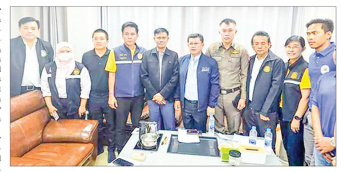
Officials from the Myanmar Labour Attaché office met families of victims.

"The factory said employers don't pay in full in such previous accidents. That is why workers blocked the car. But we reached