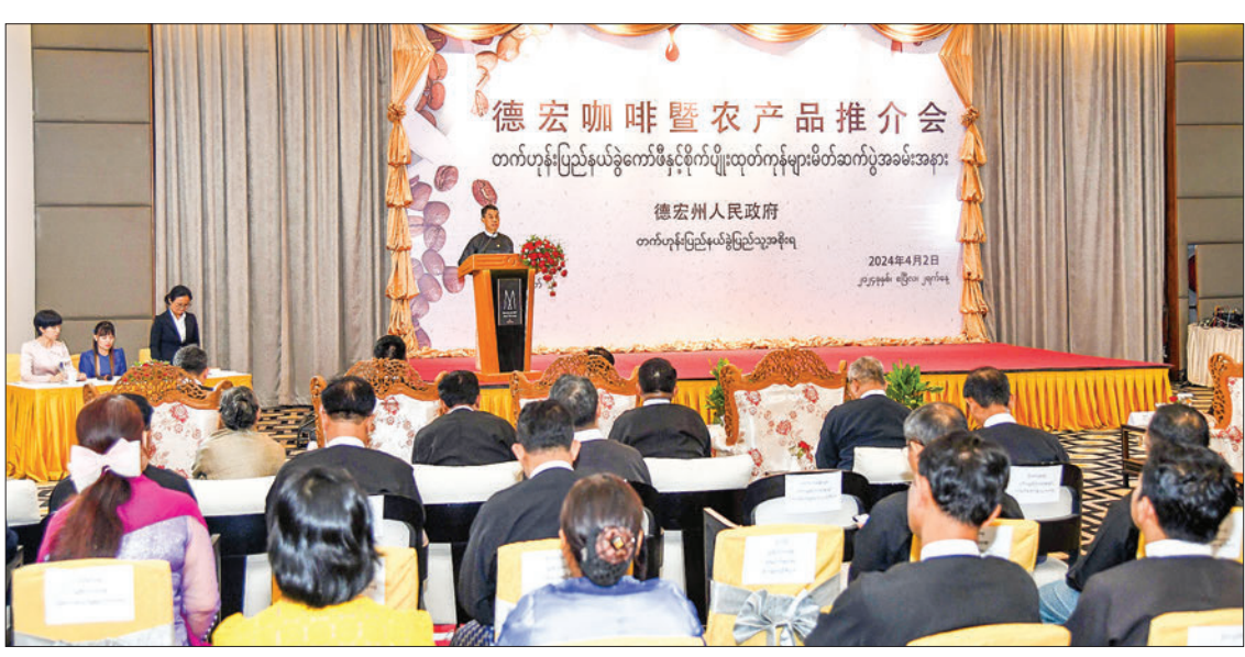
A debut ceremony for coffee and agricultural produce from Dehong Prefecture of Yunnan Province, the People's Republic of China, in progress yesterday in Nay Pyi Taw.

Participating coffee companies from Dehong included Hou Gu Co Ltd, Yun Cha Wu Co Ltd, Hei Rou Co Ltd, and Yi Nuo Chun Co Ltd. These companies displayed and explained their