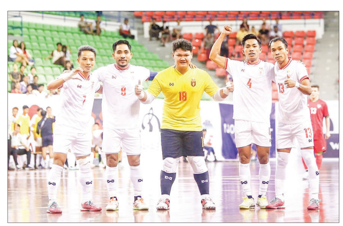
Myanmar National Futsal Team seen cheering up during an international match.

The Myanmar national futsal team is training with 20 preliminary players, and 17 players will be on the line-up ahead of Thailand. — Ko Nyi Lay/KZL