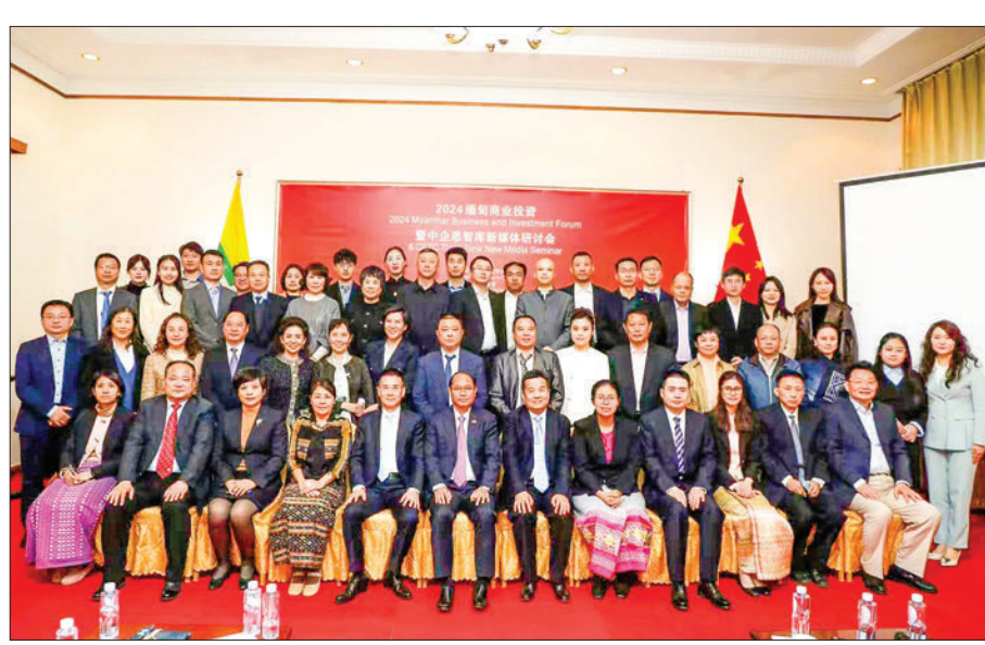
2024 Myanmar Business and Investment Forum & CETC Think Tank News Media Seminar and the attendees pose the group documentary photo.

na Culture and Tourism Promotion Society spoke about the friendly nature and cultural richness of the Myanmar people. He also addressed misinformation circulating on Chinese social media about Myanmar, emphasizing the safety of tour destinations in the