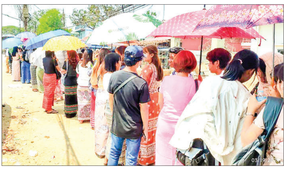
Applicants wait in line to pay the EPS-TOPIK exam registration fee on 19 March.

scheduled to be paid from 19 March to 5 April, and it has been reported that the