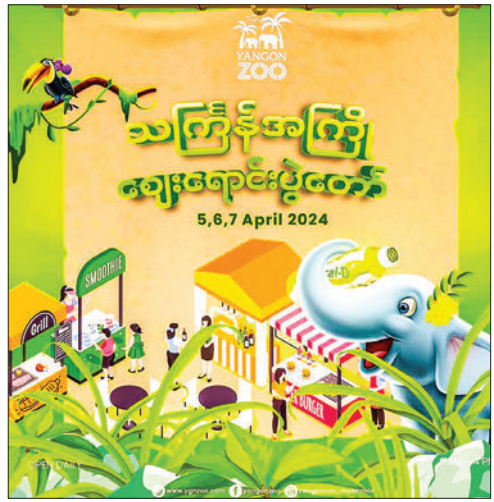
An advertisement poster for the Heat Protection Week and Pre-Thingyan Market Festival.

number of applicants for the exam this year is nearly 75,000. — TWA/MKKS