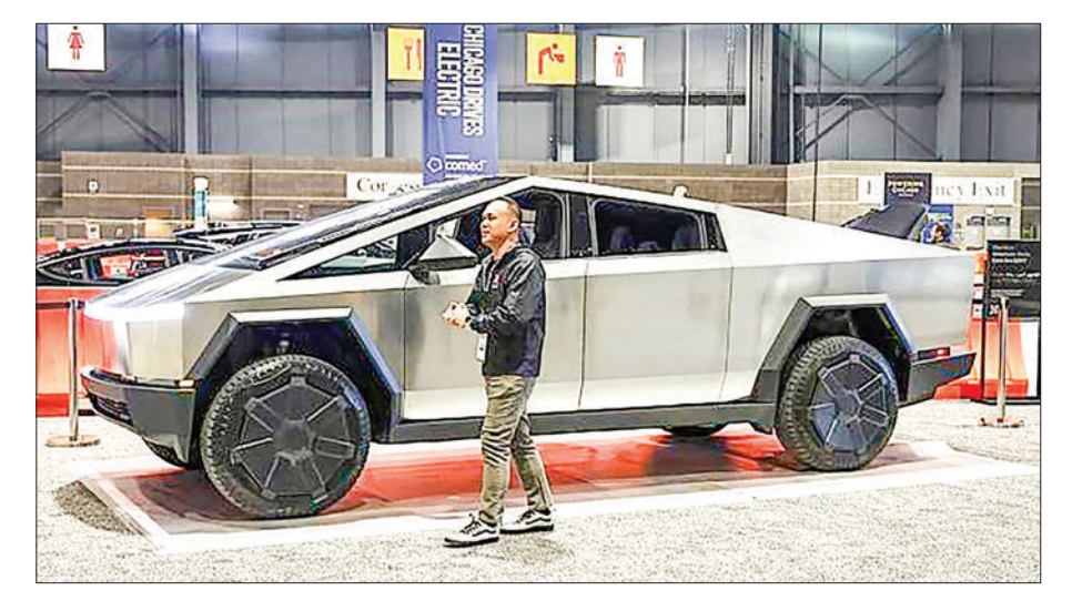
This photo taken on 8 February 2024 shows a Tesla Cybertruck at the 2024 Chicago Auto Show at McCormick Place in Chicago, the United States.

"Decline in volumes was partially due to the early phase of the production ramp of the updated Model 3 at our Fremont factory and factory shutdowns resulting from shipping diversions caused by the Red Sea conflict and an arson attack at Gigafactory Berlin," Tesla said in a statement. — Xinhua