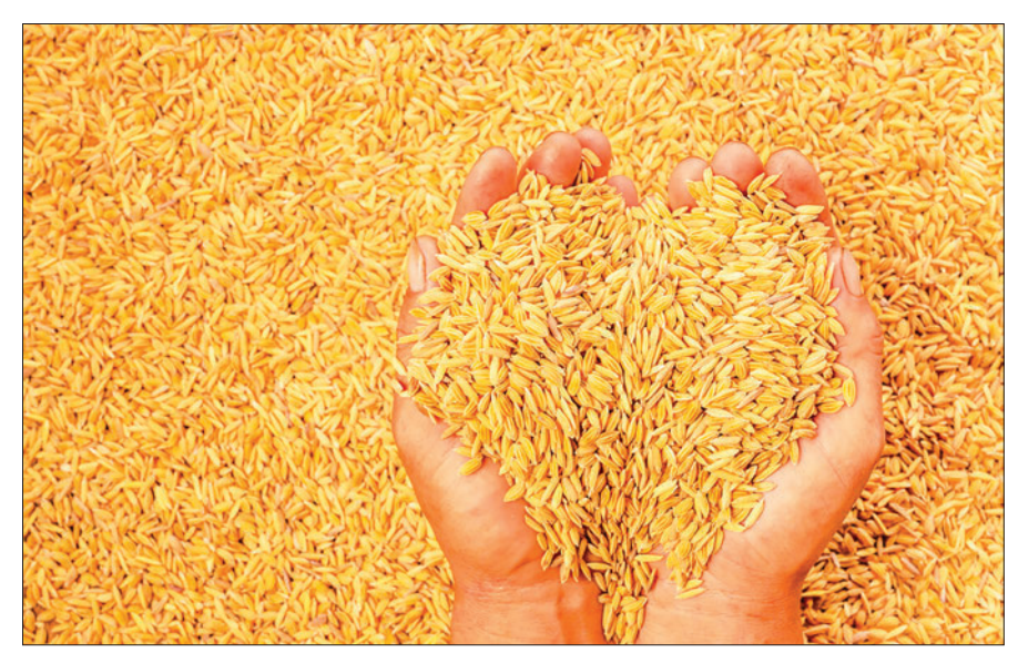
A trader checks the quality of paddy seed.

MYANMAR Rice Federation (MRF) called for Micro, Small and Medium Enterprises (MSMEs) engaged in rice seed production to compile the list of those MSMEs and help support them with sustainable development plans by analyzing their needs.