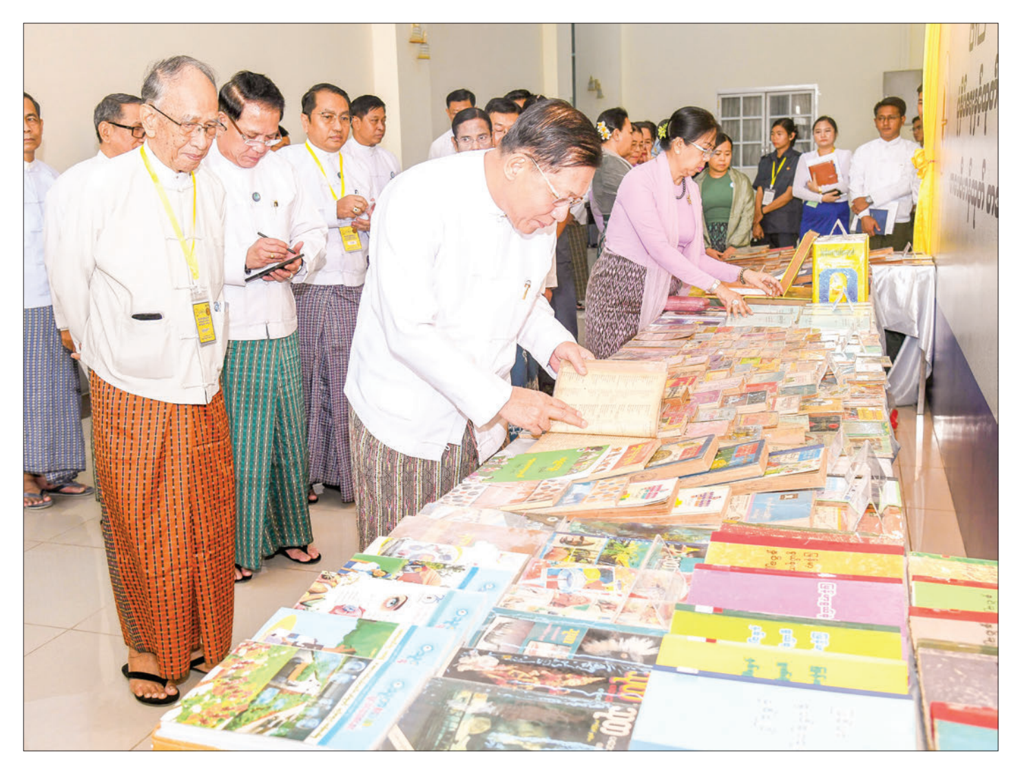
State Administration Council Chairman Prime Minister Senior General Min Aung Hlaing looks into the display of books and publications at the book donation ceremony in Nay Pyi Taw yesterday.

Series of the emergence of well-versed youths.