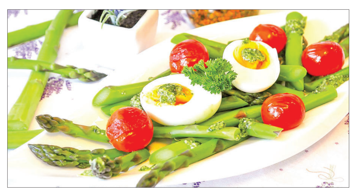
A ketogenic diet is a high-fat, low-carbohydrate eating plan designed to induce a metabolic state called ketosis. A ketogenic diet can improve both mental and metabolic health for these individuals alongside their drug regimen.