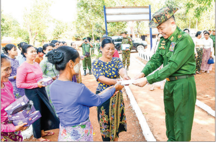
The Vice-Senior General presents cash assistance to families of Tatmadaw members yesterday.