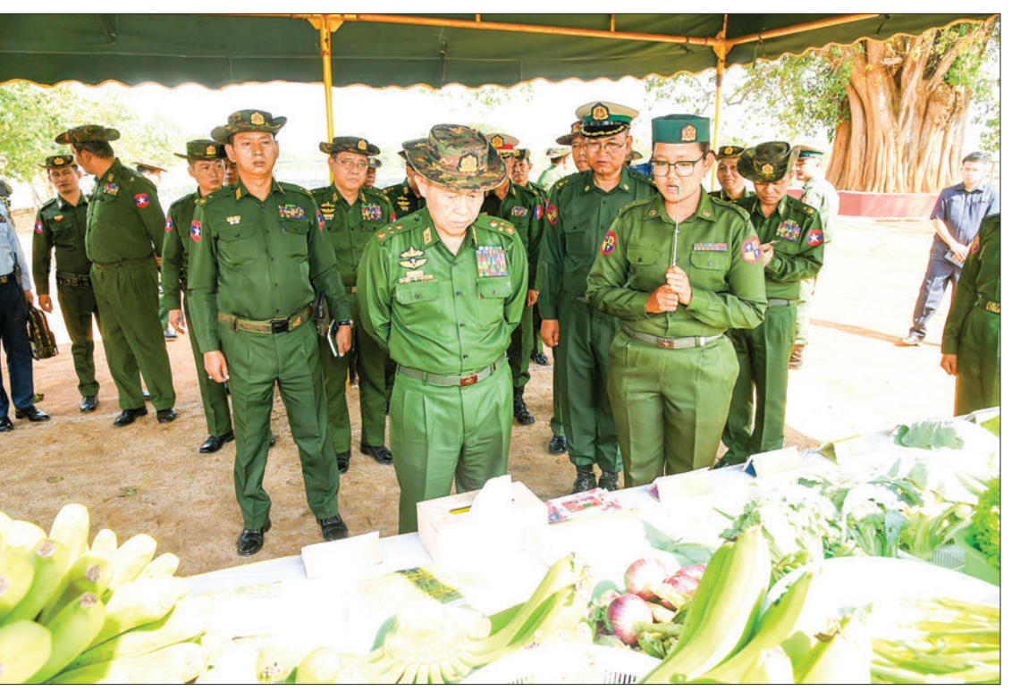
Vice-Senior General Soe Win views round the display at the Bahtoo Station yesterday.

In addition, the Vice-Senior General examined collective agriculture land at the Tatmadaw Combat Training