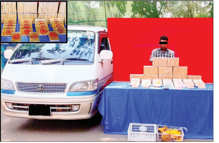
An arrestee is seen along with seized blocks of heroin and a vehicle.

48.3 kilogrammes and valued at K1.932 billion, in Kyaikto Township of Mon State.