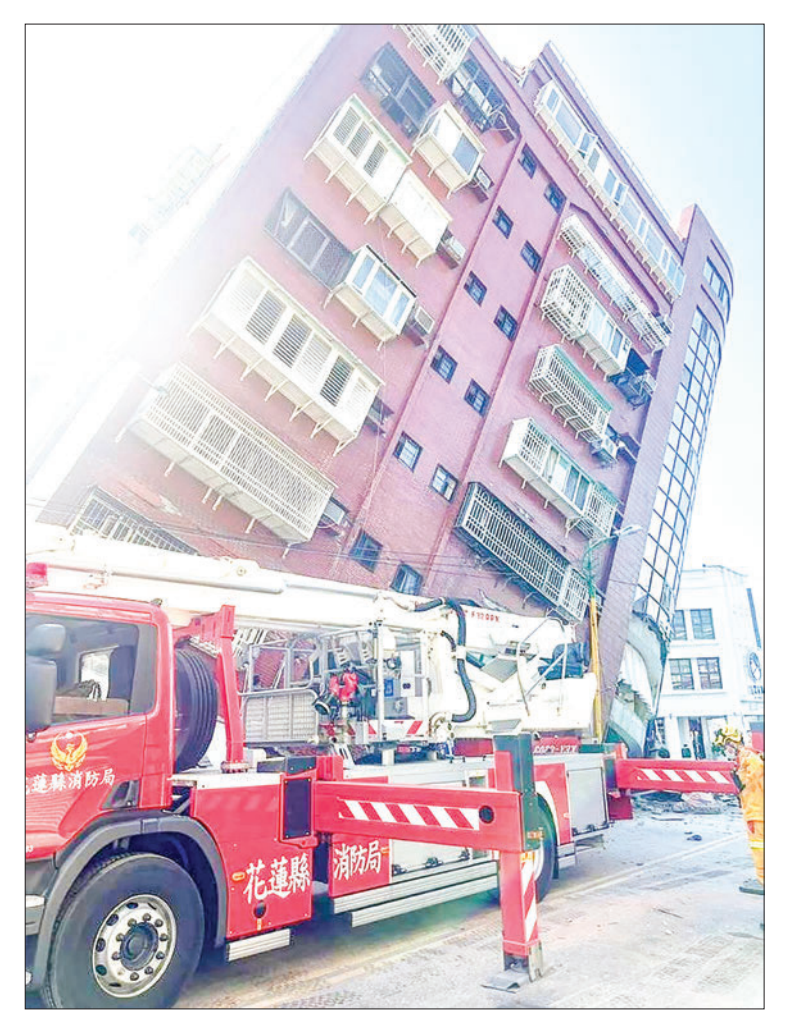
This photo taken on 3 April 2024 shows a damaged residential building in Hualien, southeast Chinese Taipei.