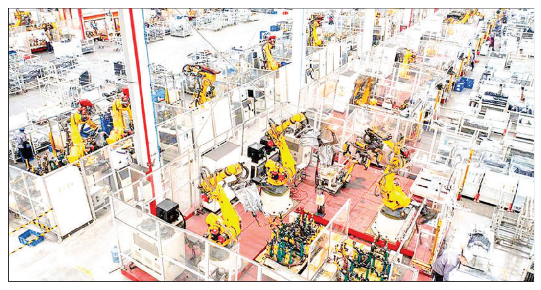
An aerial drone photo taken on 8 January 2024 shows robotic arms processing components for new energy vehicles at a private company in Changxing Economic and Technological Development Zone of Huzhou City, east China's Zhejiang Province.

Foreign investment in China's manufacturing sector reached 27.9 per cent of the total in 2023, reflecting its ongoing appeal for its manufacturing prowess and comprehensive industrial chain.