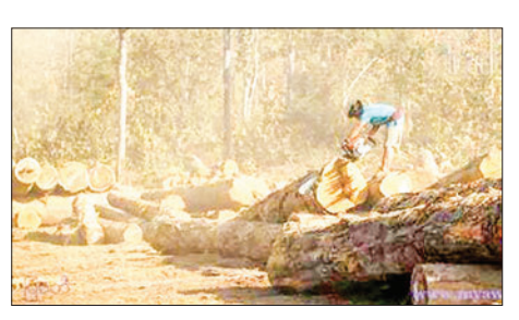
A worker seen cutting a teak log extracted from the Myanmar forest.

Myanmar's exports topped $14.3 billion over the past 11 months of the FY 2023-2024. — TWA/KK