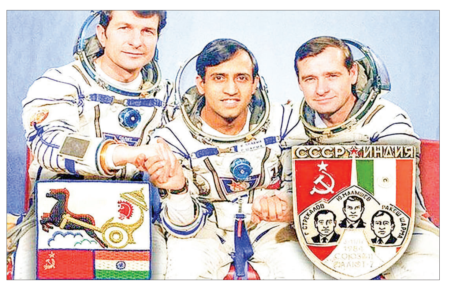
This historic achievement marked India as the 14th nation to send a cosmonaut into outer space.

Sharma, who flew aboard the Soyuz T-11 rocket launched from Baikonur Cosmodrome in 1984, became the first Indian to reach outer space, spending 7 days, 21 hours, and 40 minutes in space.