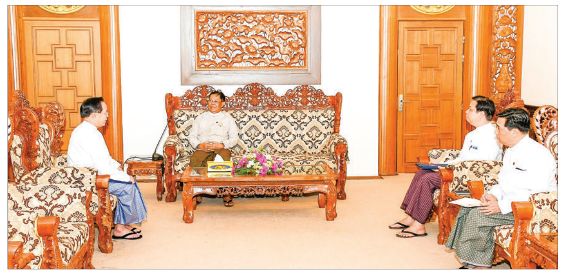
Deputy Prime Minister and Union Minister for Foreign Affairs U Than Swe meets U Myint Htay, newlyaccredited Honorary Consul of South Africa to Myanmar in Nay Pyi Taw yesterday.

of the Republic of South Africa to the Republic of the Union of Myanmar and presented him the exequatur at the office of the Union Minister of the Ministry of Foreign Affairs in Nay Pyi Taw at 3 pm on 3 April 2024. — MNA