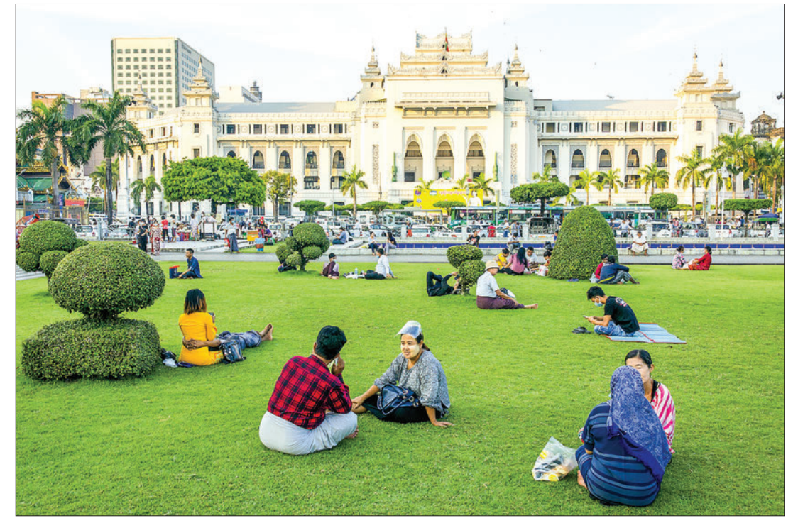
The Maha Bandoola Park is allocated for the initial water reserve construction project.

TO ensure the city's water sufficiency, the Yangon City Development Committee plans to establish water reserve zones within the municipal area for constructing rainwater harvesting ponds.