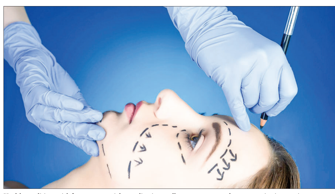
Health conditions, risk factors, potential complications, adherence to pre- and postoperative instructions, facility accreditation, reviews, testimonials, and realistic expectations are crucial aspects to ensure safety.

Unsatisfactory results: Despite the surgeon's best efforts, the outcome of cosmetic surgery may not meet the patient's expec-