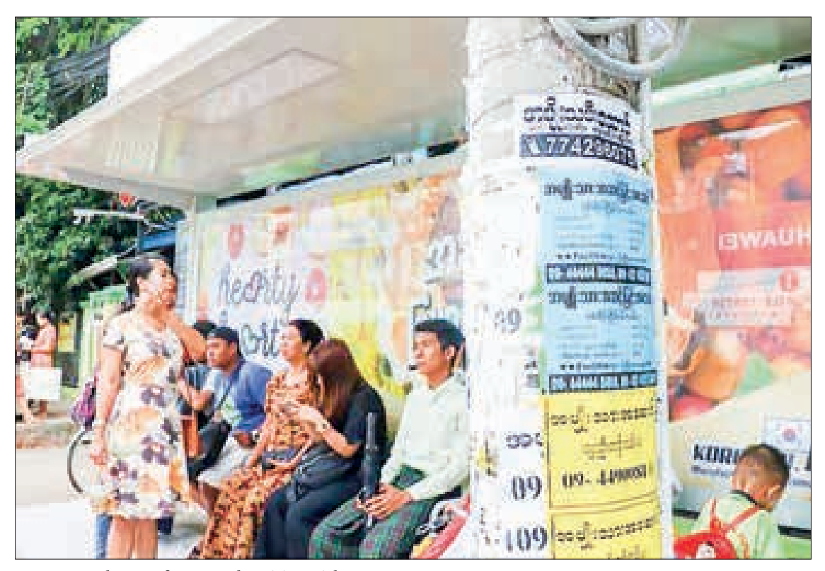
Some 'Hostel rooms for rent' advertising stickers.

HOSTEL fees are now rising in some Yangon locations where most workers stay, said the activists advocating for workers' affairs.