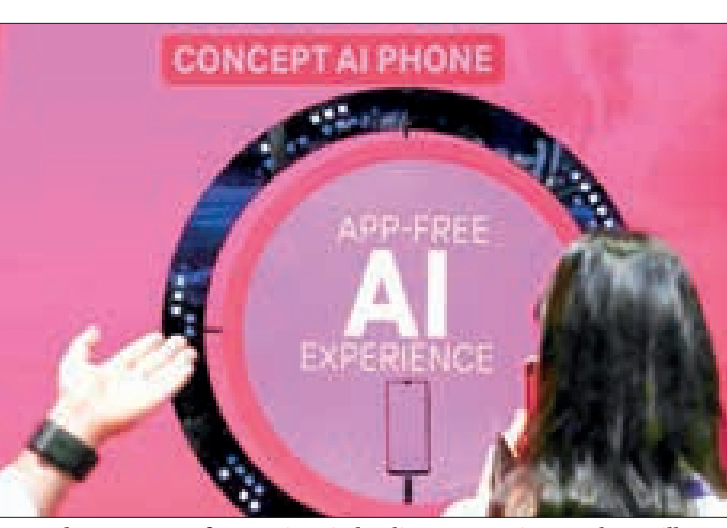
Around 41 per cent of executives in leading economies say they will employ fewer people within five years due to AI.

Adecco, the world's biggest temporary staffing agency, and Oxford Economics conducted a survey to see how companies are preparing for a technology that is growing fast but also raising concerns about what it