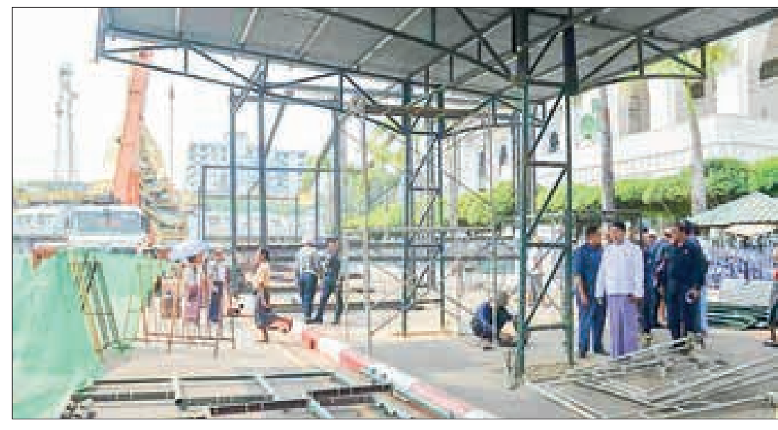
The photo shows the construction work of the Yangon City Hall Central Pavilion and water-splashing pandals on 15 March.