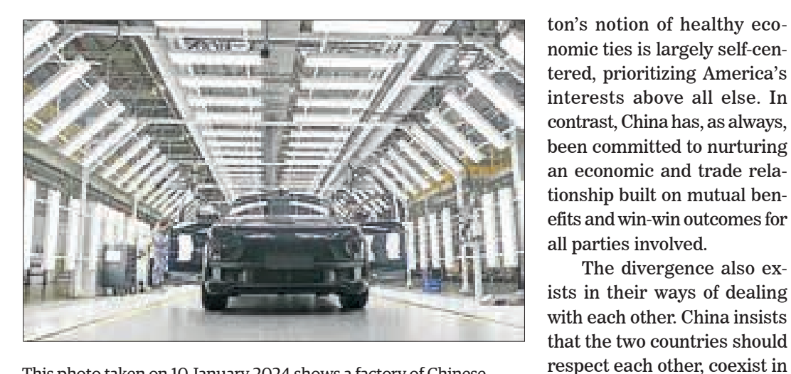
This photo taken on 10 January 2024 shows a factory of Chinese electric vehicle (EV) maker Li Auto Inc. in Changzhou, east China's Jiangsu Province.

Talking up "Chinese overcapacity" in the clean energy sector also smacks of creating a pretext for rolling out more protectionist policies to shield US companies.