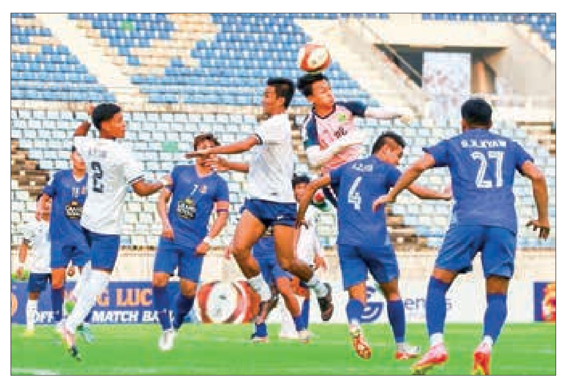
Players from Dagon Star vie for the ball with Hanthawady United players during the Week-5 match of the Myanmar National League.

with a pair of late birdies for a 2-under 70 that stretched his lead to five shots. He had started with a three-shot lead and opened at the tenth with a 15foot birdie putt, perhaps a sign that this might be another easy day. However, he bogeyed the 11<sup>th</sup> from the bunker on the next hole and then three-putted for bogey on 15. He also failed to birdie the par 5s on the back nine, his first nine for the day. He also lost the lead. — ANI