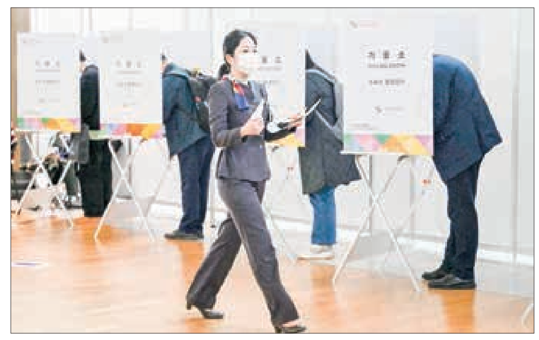
An airline employee casts her ballot during early voting at a polling station at the departure hall of Incheon International Airport on 5 April 2024, ahead of next week's parliamentary elections. South Koreans can cast their ballots for the upcoming 10 April parliamentary elections during the two-day early voting period until 6 April.

This turnout surpassed the 26.69 per cent recorded in the previous 2020 parliamentary elections, marking the highest participation rate since the adoption of early voting in the 2014 local elections.