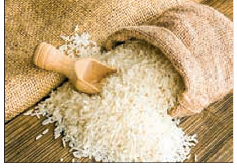
Additionally, quotas for eggs, potatoes, onions, sugar, rice, wheat flour, and dal have seen a 5 per cent increase.

Moreover, last year as well, India continued to export rice, sugar and onions to the Maldives despite a worldwide ban on the export of these items from India. - \Delta NI