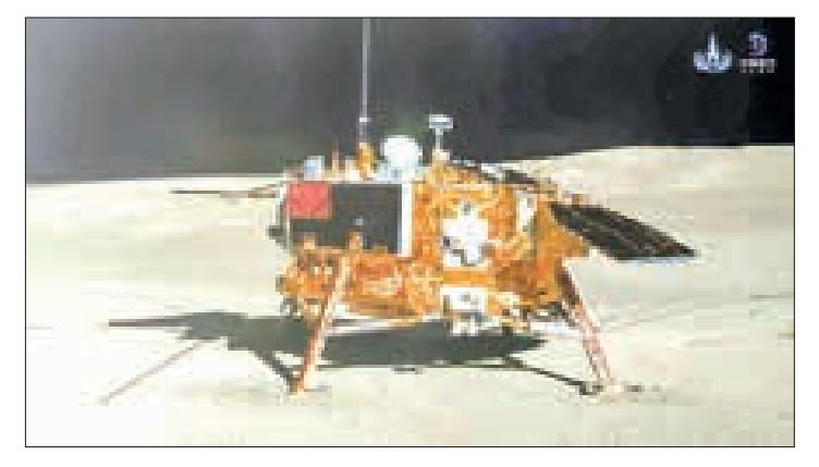
Photo taken by the rover Yutu-2 (Jade Rabbit-2) on 11 January 2019 shows the lander of the Chang'e-4 probe.

China's Chang'e-7 lunar exploration mission, to be launched around 2026, will have onboard a Thailand-developed global space weather monitoring device, which is designed to observe cosmic radiation and space weather from the lunar perspective. It will be the first time that a scientific instrument from Thailand has entered deep space from Earth