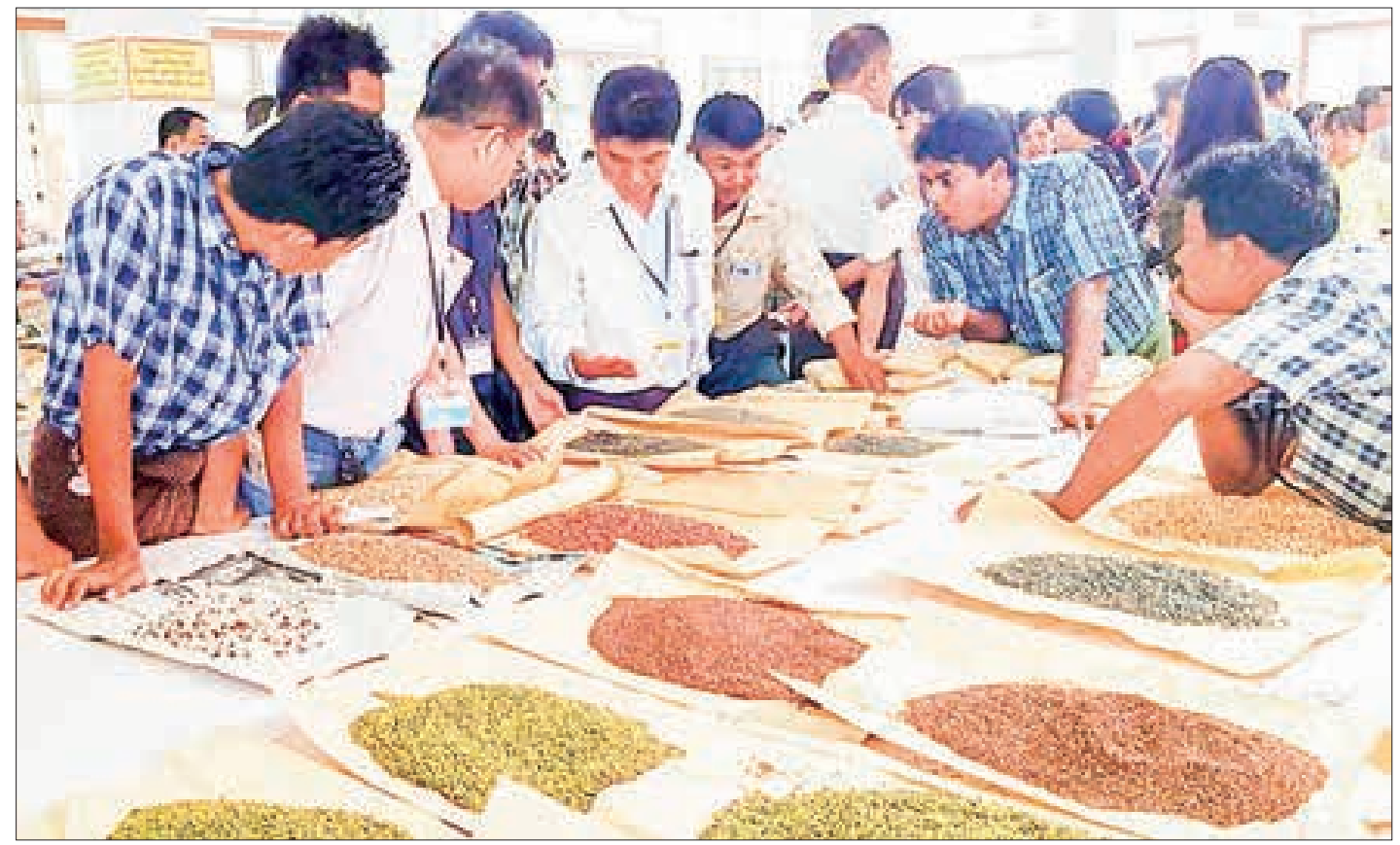
Traders meticulously access diverse beans and pulses at the Mandalay market.