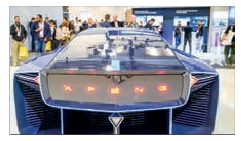
A flying car developed by XPeng AeroHT, a subsidiary of Chinese e-automaker Xpeng, is displayed at the 2024 Consumer Electronics Show (CES) in Las Vegas, the United States, 11 January 2024.

The turnout of overseas voting, which had run for six days through Monday among domestic voters staying abroad, hit a new high of 62.8 per cent. The overseas voting was introduced in 2012. — Xinhua