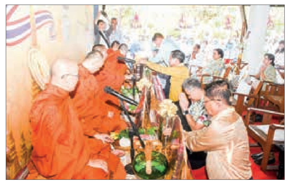
Deputy Prime Minister Union Minister U Than Swe and dignitaries donate offerings to members of the Sangha during the Thai Songkran Festival 2024 in Yangon on 6 April 2024.

DEPUTY Prime Minister and Union Minister for Foreign Affairs U Than Swe attended the Thai traditional Songkran