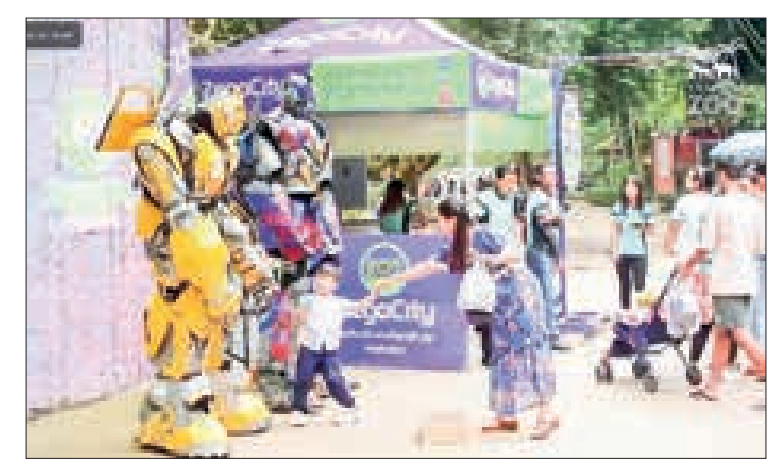
Visitors seen at Yangon Zoological Gardens.

Entrance fees are set at K2,500 for adult, K1,500 for child, and K7,000 for foreigner adult and K5,000 per foreigner child. Monks and nuns are granted free entry to the Yangon Zoo. — ASH/ TRKM