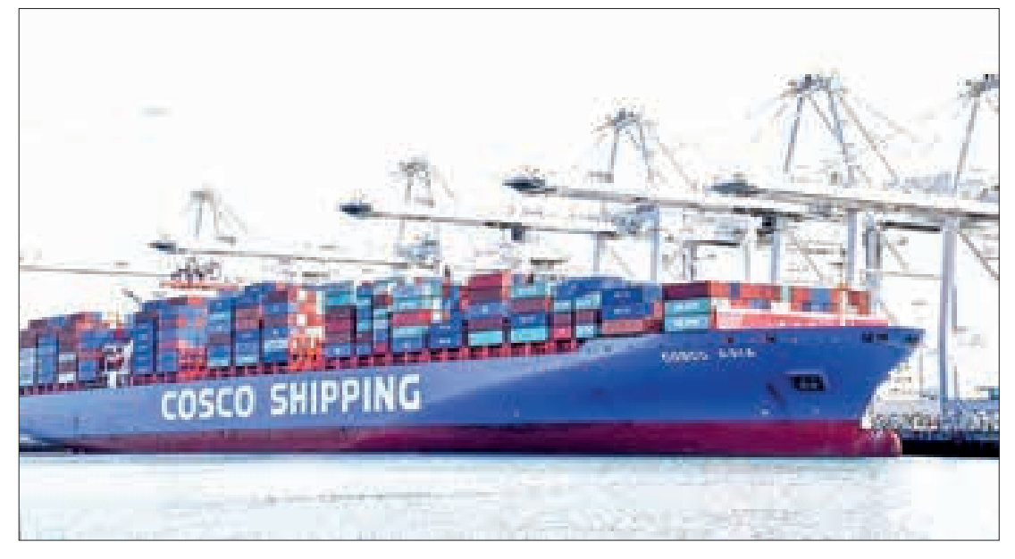
Containers of China COSCO Shipping Corporation Limited are seen at the Port of Long Beach in Los Angeles County, the United States, 27 February 2019.

Focused on implementing key consensus between the two countries' leaders, discussions were candid, pragmatic, and constructive, covering macroeconomic situations, economic ties between China and the US, and global challenges.