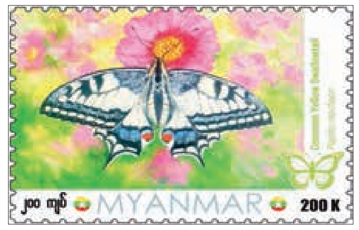
Sample of new postage stamp featuring the common yellow swallowtail, a species of butterfly.

The new postage stamp worth K200 will be sold simultaneously at the Central Post Office in Nay Pyi Taw, the General Post offices in Yangon and Mandalay and post offices in other regions and states at 9:30 am on 10 April.