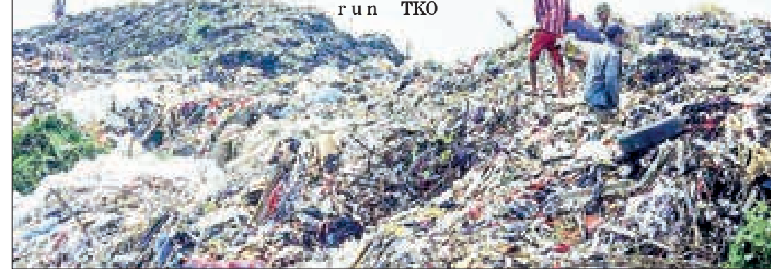
Hteinbin landfill in Hlinethaya Township, Yangon.

The volume of waste in Yangon City is increasing year by year, and the whole city disposes bout 2,500 tonnes per day. — TWA/