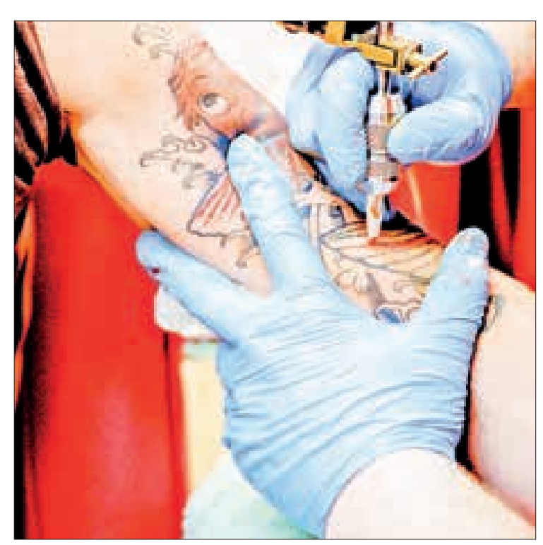
The art of tattooing, which dates back centuries and is associated with culture, is now being transformed with modernization.

The art of tattooing, which dates back centuries and is associated with culture, is now being transformed with modernization.