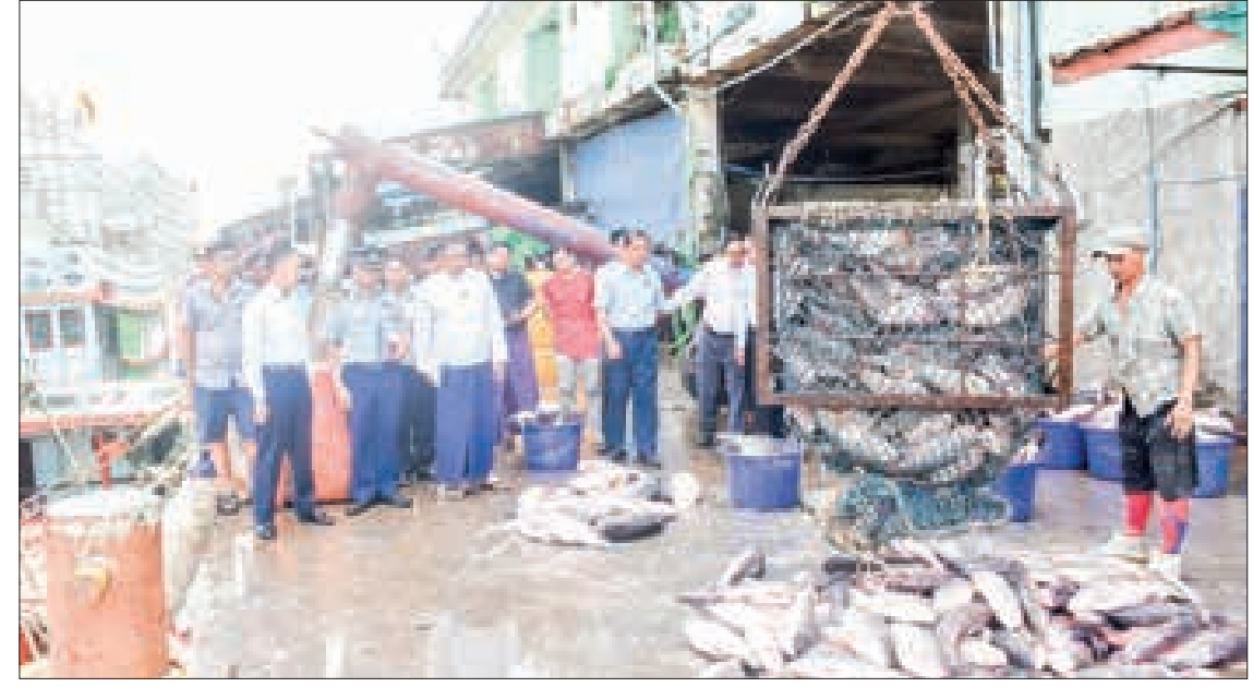
Union Commerce Minister U Tun Ohn views shipping of fish for export purpose at Aung Mingala Port in Kyimyindine Township.

The inspection aims to ensure local fish sufficiency and price stability. Furthermore, the Union minister directed the Department's One-Stop Services (OSS) to conduct thorough in-