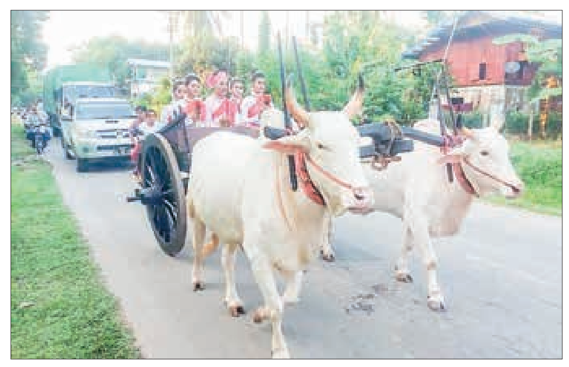
The photo depicts a Mon traditional adorned bullock cart competition in previous year.