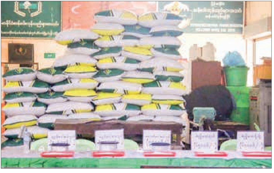
Rice sale centre of Myanmar Rice Federation which sells rice at fixed prices.

In the first week of April 2024, the price of new summer non-premium rice was K76,000 per bag, which declined from K80,000 per bag at the end of March. Currently, non-premium monsoon rice was priced at K86,000 per bag, newly-har-