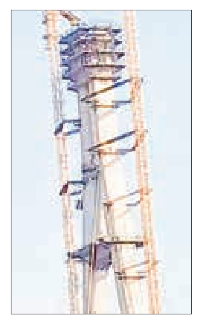
Cables are being installed in Dala, as a part of Dala-Yangon Bridge project.

The township's property market has been active at present and it is more active especially in its commercial areas including Tabin Shwehtee ward and Kyansittha ward which are located at the end of