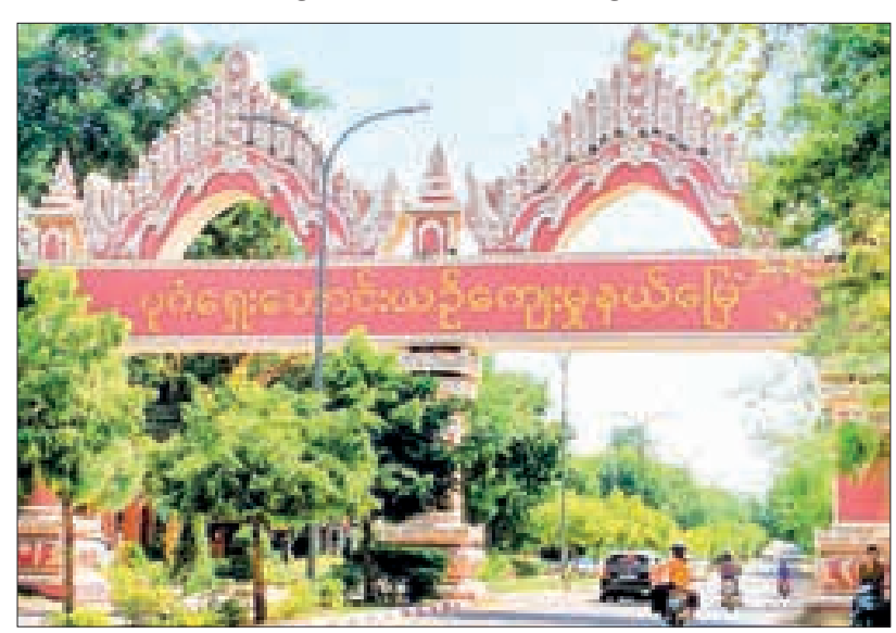
The entrance to Bagan ancient cultural zone.

OFFICIALS from the Directorate of have reported that all 90 hotels, motels, and lodges in the ancient cultur-