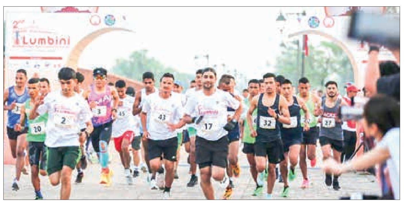
Runners participate in "Run For World Peace" programme in Lumbini, Nepal, 6 April 2024. A peace marathon was held on Saturday in Nepal's Lumbini, the birthplace of the Lord Buddha and a UNESCO world heritage site, to mark the first Lumbini international peace festival

Chinese premier meets US treasury secretary