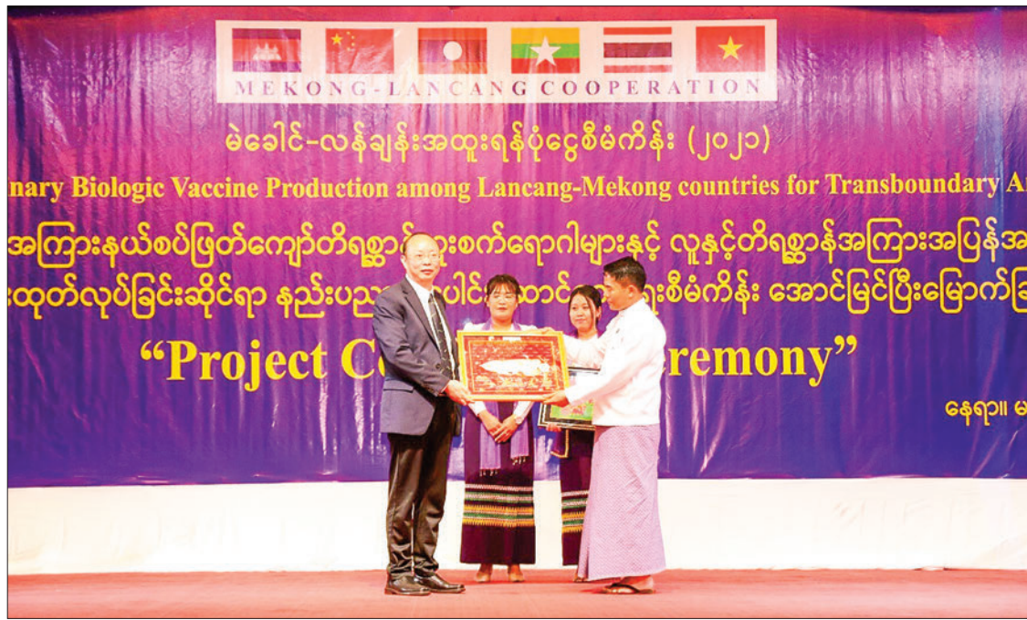
The completion event for the Mekong-Lancang Special Fund Project 2021 in progress yesterday in Nay Pyi Taw.

During the ceremony, the Union minister highlighted the achievements of the Mekong-Lancang Special Fund Project 2021 by the Department of Livestock Breeding and Veterinary. The project focused on