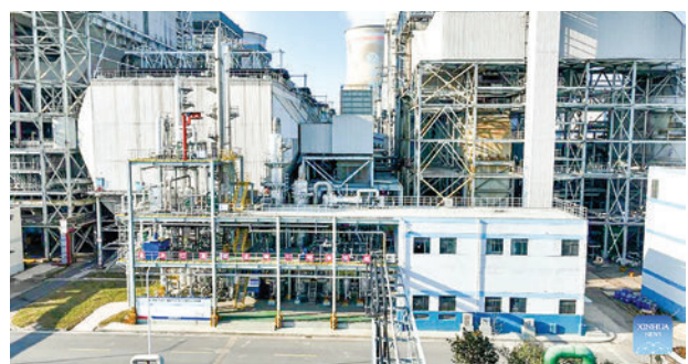
The undated file photo shows the CO2 capture zone of a pilot project for CO2 capture and utilization, affiliated with Zhejiang Provincial Energy Group Company (Zhejiang Energy), in Lanxi County, east China's Zhejiang Province.

The project was built at a power plant in Lanxi County that was affiliated with Zhejiang Provincial Energy Group Company (Zhejiang Energy). Its technology team consists of researchers from the company and institutions such as Zhejiang University and Baima Lake Laboratory. — Xinhua