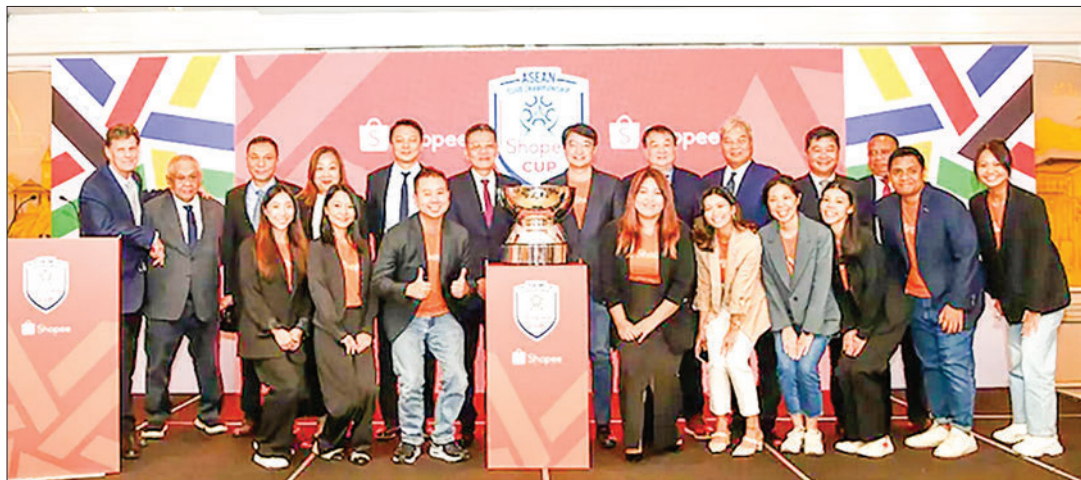
The screenshot on 8 April 2024 that AFF announces e-commerce giant Shopee as the title partner of the first-ever official ASEAN Club Championship named the Shopee Cup™.

THE ASEAN Football Federation will resume the ASEAN Club Championship this year, with the participation of 14 football clubs from member countries, including Myanmar, despite the fact that it missed hosting the tournament for many years.