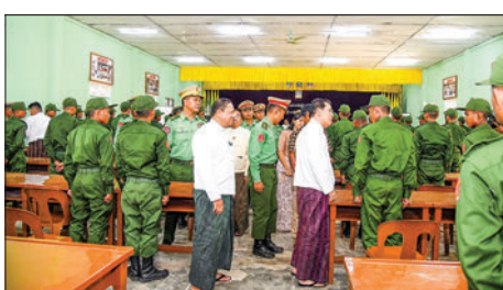
MoI Union Minister meets trainees of People's Military Servants Training 1/2024 in Nay Pyi Taw