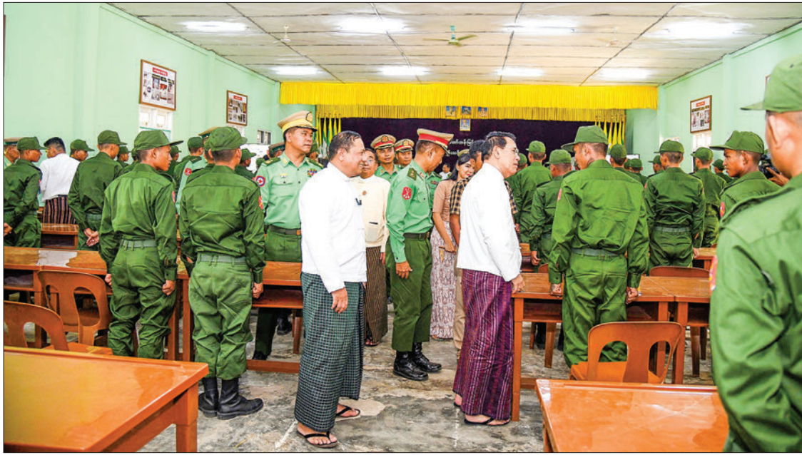
Union Minister U Maung Maung Ohn warmly greets trainees of the People's Military Servants Training 1/2024 yesterday.

MEMBER of the Central Body on Summoning People's Military Servants Union Minister for Information U Maung Maung Ohn