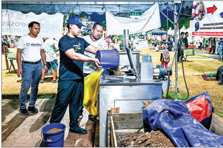
This picture taken on 3 April 2024 shows a Ramadan bazaar trader throwing food waste into a composting machine in Kuantan, Malaysia's Pahang state.

AFTER breaking their Ramadan fast outside a mosque in Malaysia, people throw their leftovers into a machine that converts the food scraps into organic fertilizer for crops.