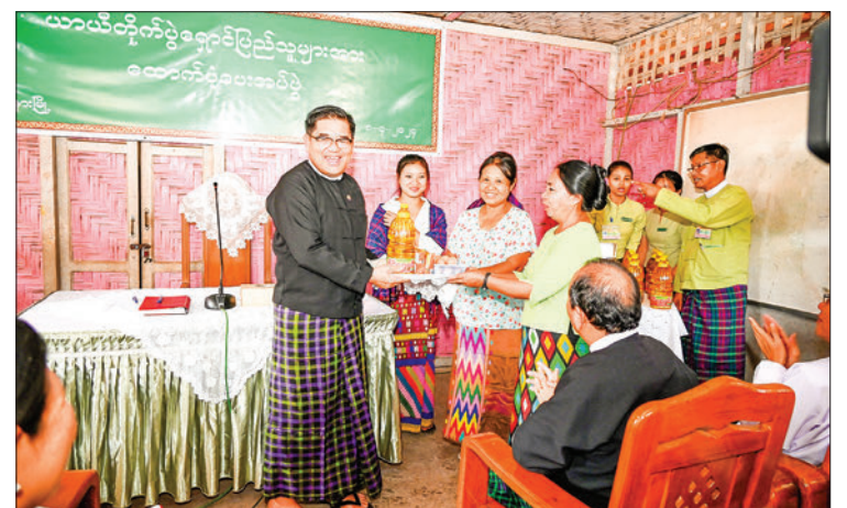
Kachin State Chief Minister U Khat Htein Nan provides foodstuffs and cash assistance to families of IDPs yesterday.

The committee members presented a restructuring plan for the committee and discussed pending cases awaiting decisions. The Chief Minister provided his insights on each case. — IRPD (Kachin State)/NT