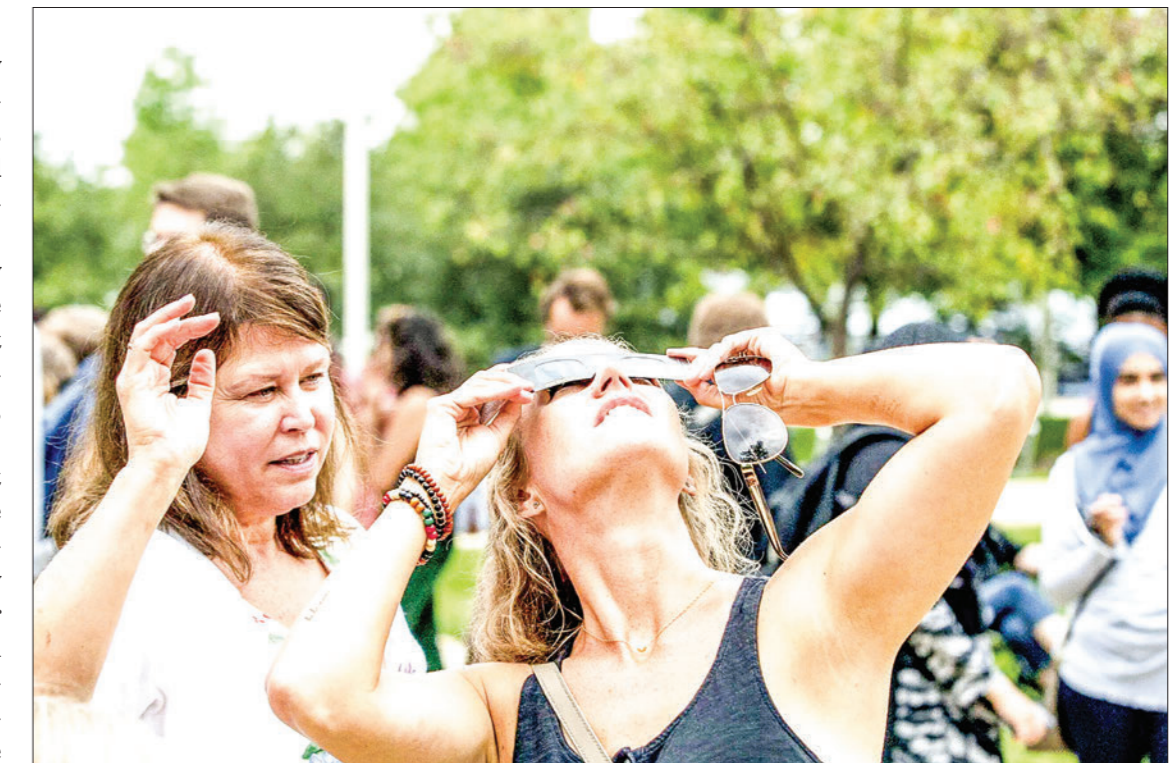
This year's eclipse's path of totality is about 185km wide, wider than in 2017.

Young adults might be more susceptible, the authors of the paper said, because of larger pupils, clearer eye structure, or