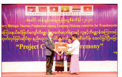
Completion ceremony held for Mekong-Lancang Special Fund Project 2021