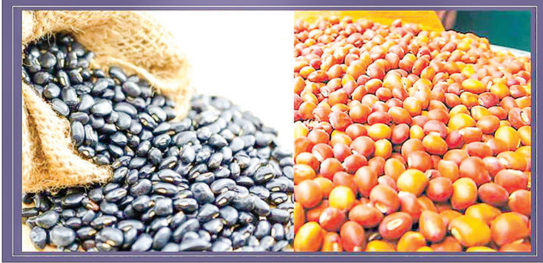
Images show black grams and pigeon peas in the market.

THE prices of black grams and pigeon peas showed upticks prior to the Thingyan holidays starting from 13 April.