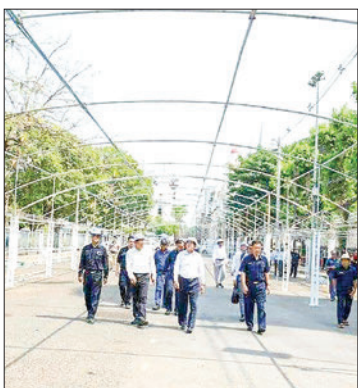
The Yangon Mayor inspects progress of Thingyan Pavilion.

Thingyan Festival, which is going to be celebrated from 13 to 16 April 2024, along with water splashing, Thingyan traditional Yein dance (choral dance) will entertain at the Yangon Mayor's Maha Thingyan Pavilion located at the front of Yangon City Hall.