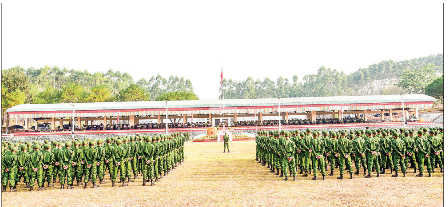
The inauguration event of the People's Military Servants Training No 1 in action yesterday.

join the training were able to serve the State duties as good citizens of the country. — MNA/KTZH