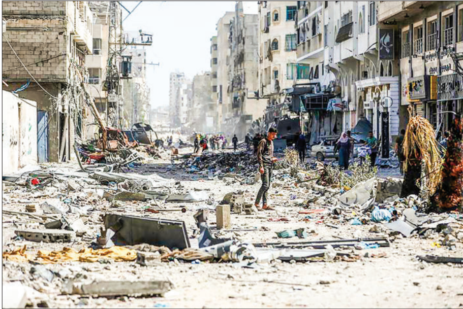
People are seen on a street with damaged buildings near the Shifa Hospital in Gaza City, on 1 April 2024.

THE Israel-Hamas conflict, which has created an unprecedented humanitarian crisis in the Gaza Strip, has lasted for half a year. Amidst this tragedy, the actions of the United States, Israel's key ally, have sparked serious concerns and criticism among the international community.