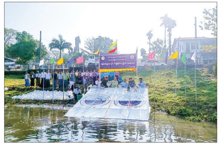
The photo shows the ceremony of breeding fishes in the land-leased grant lake (in Dahka River) in Kyaunggon Township, Kyonpyaw District in Ayeyawady Region for improving fish resources and for assisting the socioeconomic of the locals.

Due to the gradual decrease in freshwater fish production, public collaboration is necessary to ensure sustainable production and consumption.