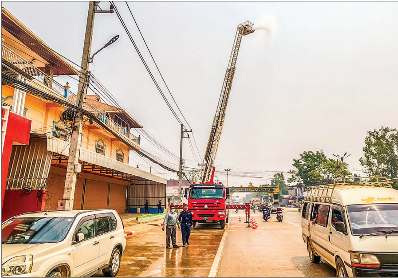
Tachilek is sprayed to ease the very unhealthy stage of air quality.