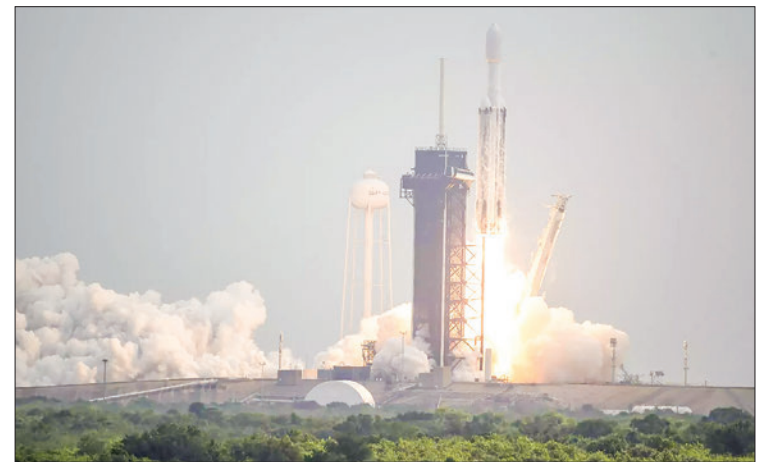
A SpaceX Falcon Heavy rocket lifts off from Launch Pad 39A at the Kennedy Space Centre in Cape Canaveral, Fla, on 13 October 2023.

Boeing has grappled with significant quality and safety issues concerning its aircraft for years, leading to the prolonged grounding of specific models and halted deliveries. — Xinhua