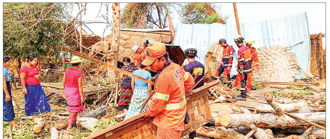
A tree uproots and falls onto the houses in Mingan village in Madaya township of Mandalay region due to strong winds on 8 April 2024.

THE Ministry of Social Welfare, Relief, and Resettlement has reported that in the financial year 2023-2024, strong winds caused damage to nearly 22,000 houses.