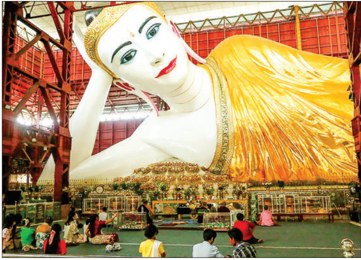
A panoramic view of the Chaukhtetkyee Pagoda from the front perspective.