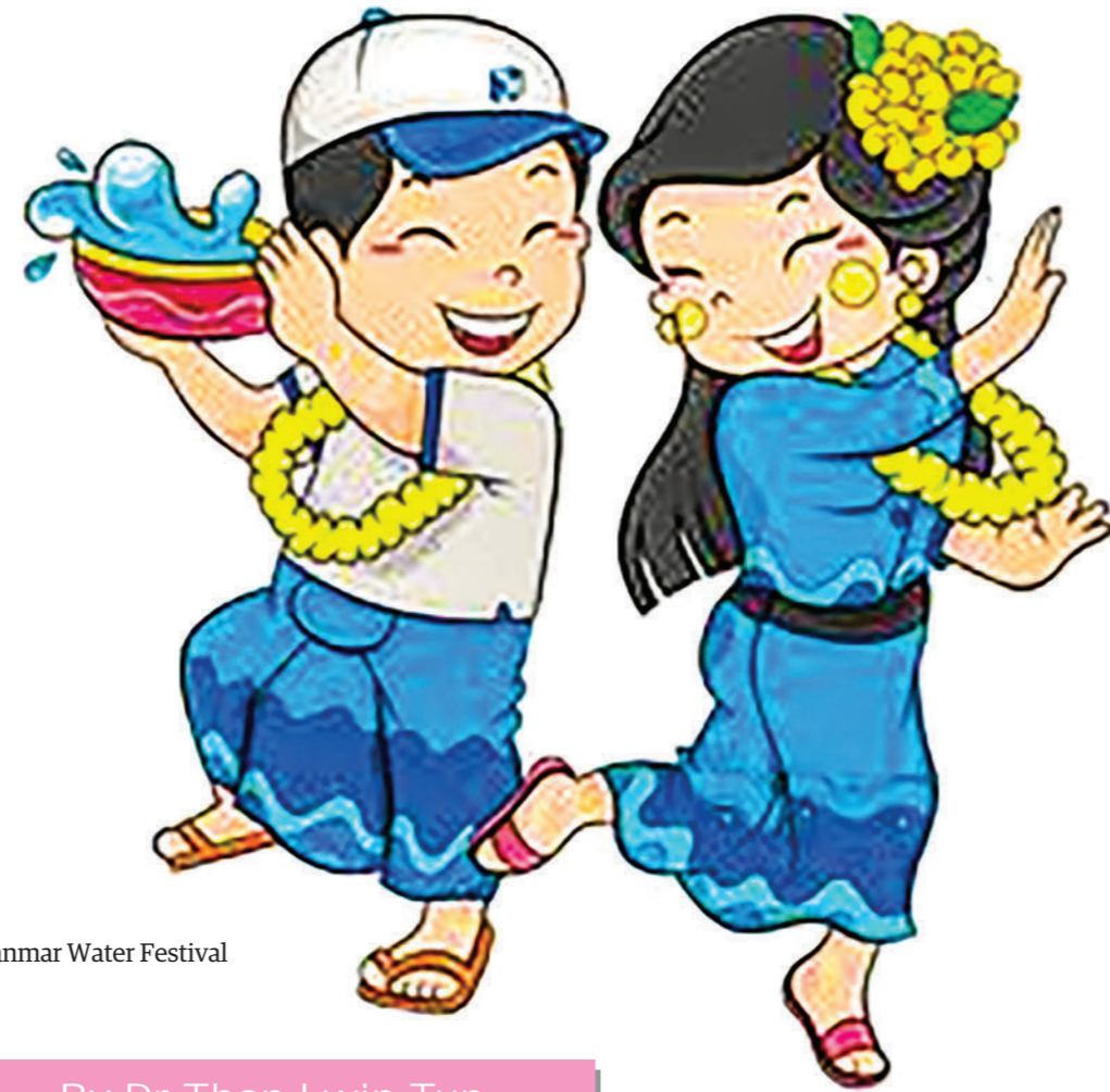
Myanmar Water Festival