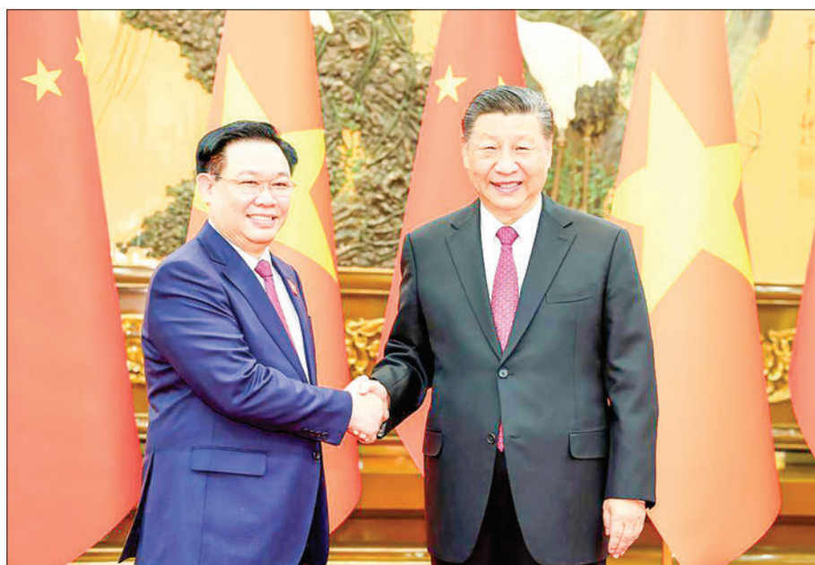
Chinese President Xi Jinping meets with Chairman of the National Assembly of Viet Nam Vuong Dinh Hue at the Great Hall of the People in Beijing, capital of China, 8 April 2024.

While asking Vuong Dinh Hue to convey cordial greetings to Nguyen Phu Trong, General Secretary of the Communist Party of Viet Nam (CPV) Central Committee, Xi also said that during his visit to Viet Nam at the end of last year, he and Nguyen Phu Trong had jointly announced the building of a China-Viet Nam community with a shared future that carries strategic significance — opening a new chapter