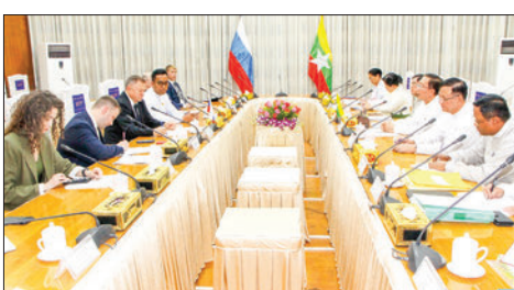
DPM Union MoPF Minister receives EEC Minister in Charge for Integration & Macroeconomics