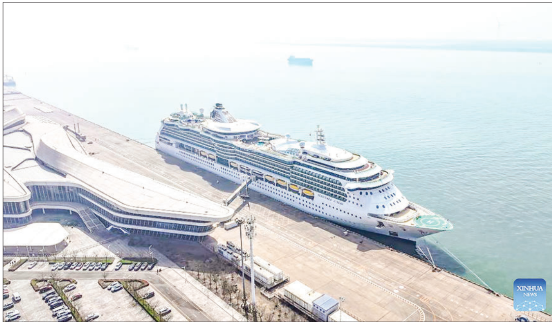
An aerial drone photo taken on 7 April 2024 shows cruise ship Serenade of the Seas docking at Tianjin International Cruise Home Port in north China's Tianjin Municipality.

"We work with the cruise line and the port company to streamline passenger clearance procedures and let them have more time to travel in China," said Bi Linlin, a local immigra-