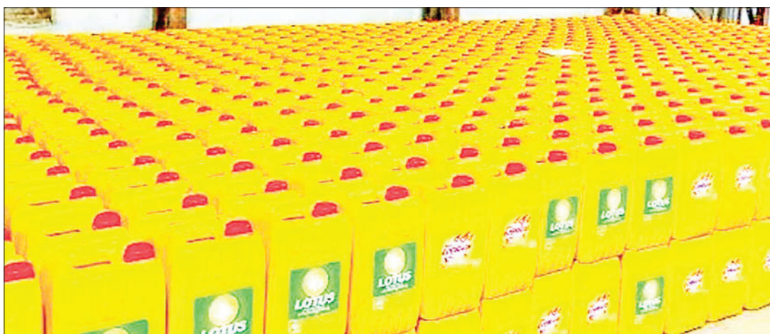
The photo shows imported jerry cans of palm oil at the warehouse in Yangon.

To control overcharging, the Consumer Affairs Department under the Ministry of Commerce informed