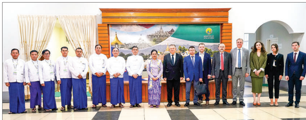
Union Minister Dr Thet Thet Khine and Minister in Charge for Integration and Macroeconomics pose for the documentary group photo in Nay Pyi Taw yesterday.

Deputy Minister U Phyo Zaw Soe, the permanent secretary, the director-general, and senior officials were also present at the meeting. — MNA/TRKM