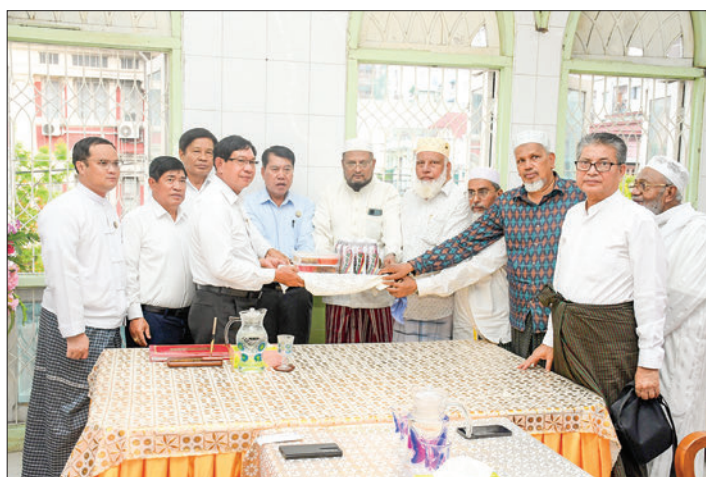
The donation of nutritious refreshments in progress yesterday.

Officials of the mosque accepted the donations and prayed for serving the inter-