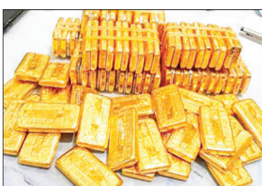
Domestic gold price hits record high at K4.56 mln per tical