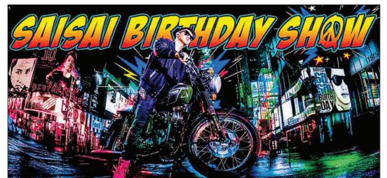
One of the previous posters bearing the Sai Sai Birthday Show.

It is also anticipated that following the upcoming Sai Sai Birthday Show in 2024, a music album will be released, as in previous birthday celebrations. — ASH/TRKM