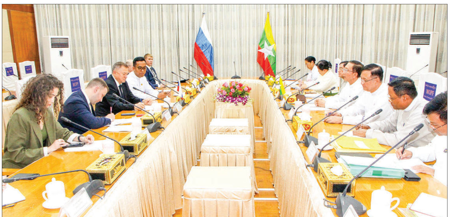
Deputy Prime Minister Union Minister for Planning and Finance U Win Shein holds talks with the delegation led by Mr Sergey Glazyev, Member of the Board—Minister in Charge for Integration and Macroeconomics, Eurasian Economic Commission, yesterday.

Also present at the meeting were Deputy Minister U Maung Maung Win and heads of departments, officials from the Ministry of Foreign Affairs and the Ministry of Commerce, and members of the delegation headed by Mr Sergey Glazyev. — MNA/TS