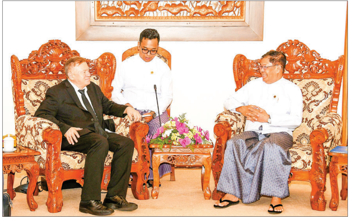
The EEC Minister in Charge for Integration and Macroeconomics calls on Deputy Prime Minister and Union Foreign Affairs Minister U Than Swe yesterday in Nay Pyi Taw.

They discussed matters on the enhancement of cooperation between Myanmar and Eurasian Economic Union (EEU/EAEU) member countries in the sectors of trade, investment, business-to-business, and people-to-people contact, among others. — MNA