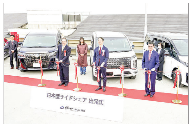
Transport minister Tetsuo Saito (front L) and digital minister Taro Kono (front R) attend a ribbon-cutting ceremony in Tokyo to mark the launch of Japan's first ride-hailing service on 8 April 2024.

"We will greatly expand the ride-hailing business and establish it throughout Japan to resolve a shortage of transport providers," transport minister Tetsuo Saito said at the ceremony. He went for a test