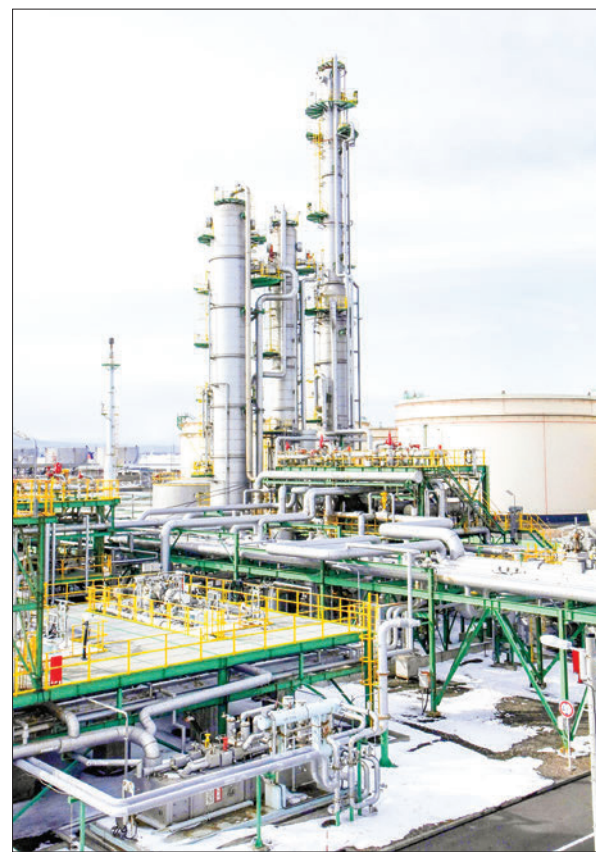
Photo taken in March 2024 shows a carbon dioxide capture and storage demonstration test plant in Hokkaido's Tomakomai.

Chubu Electric Power Co, based in Nagoya, central Japan, has also started, along with other companies, a feasibility study on collecting CO2 from plants and factories at the Port of Nagoya area for storage in Indonesia. — Kyodo