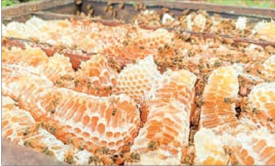
A glimpse of beehives.

THE Livestock Breeding and Veterinary Department warned the beekeepers of the deformed wing virus (DWV) induced by extreme temperature, causing twisted, shrunken and crumpled wings.