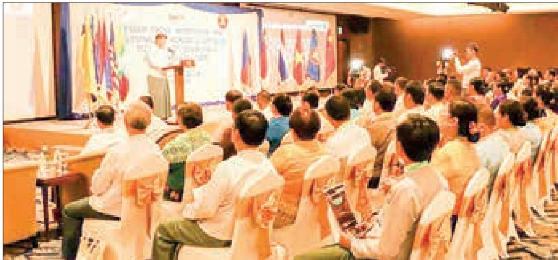
The ASEAN-China Workshop on Building Up Human Capital in Technology Transfer and Commercialization in progress yesterday in Yangon.

At the event, Union Minister Dr Myo Thein Kyaw, Minister Counsellor Dr Zheng Zhihong of the Chinese Embassy