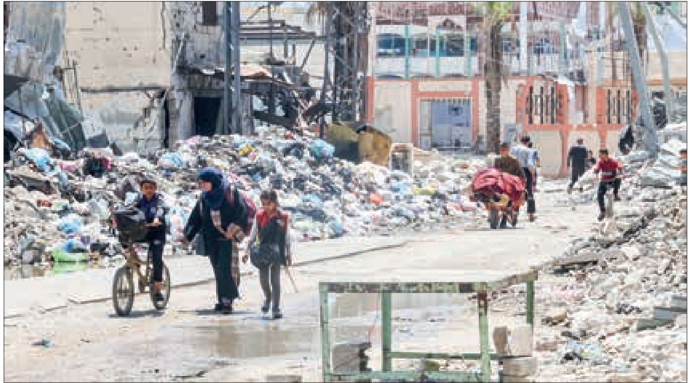
A boy rides a bicycle alongside a woman and girl walking past a mound of trash by a destroyed building in the Zaytoun neighbourhood of Gaza City on 9 May 2024 amid the ongoing conflict in the Palestinian territory between Israel and the militant group Hamas.

S MOKE rose from strikes on Gaza’s crowded southern city of Rafah Thursday after US President Joe Biden vowed to stop supplying artillery shells and other weapons to Israel if a full-scale offensive into the city goes ahead.