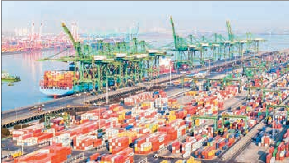
An aerial drone photo taken on 2 February 2024 shows an international container terminal of Tianjin Port in north China's Tianjin.

CHINA'S total goods imports and exports expanded 5.7 per cent year on year in yuan terms in the first four months of this year, stronger than the five per cent recorded in the first quarter, official data showed Thursday.