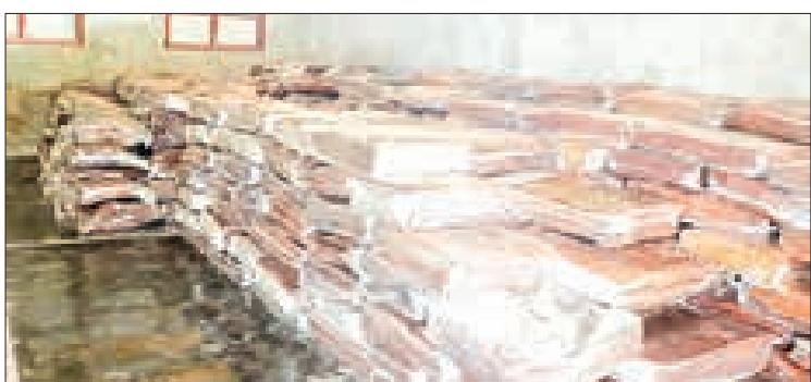
The private rubber manufacturing industry is seen in Mon State.

The rest of the regions, namely Yangon, Bago, and Taninthayi, also grow rubber. — TWA/KZL