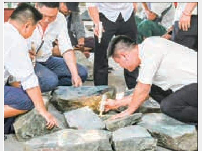
Gem traders look into jade stones at yesterday's emporium.

Officials will review and inspect the proposed price lists of jade lots numbered from 2751 to 3750 on the eighth day, and the sold-out jade lots will be announced on the ninth day of the exhibition.