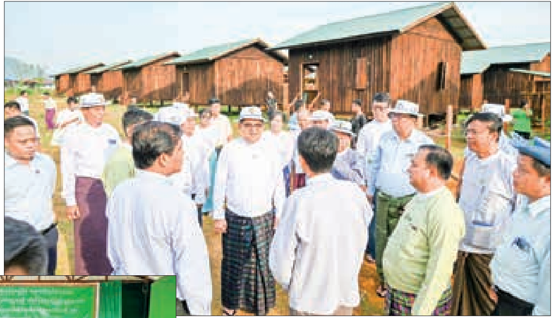
Photos show Kachin State Chief Minister U Khet Htein Nan and officials meeting household members and providing foodstuffs and cash assistance yesterday.