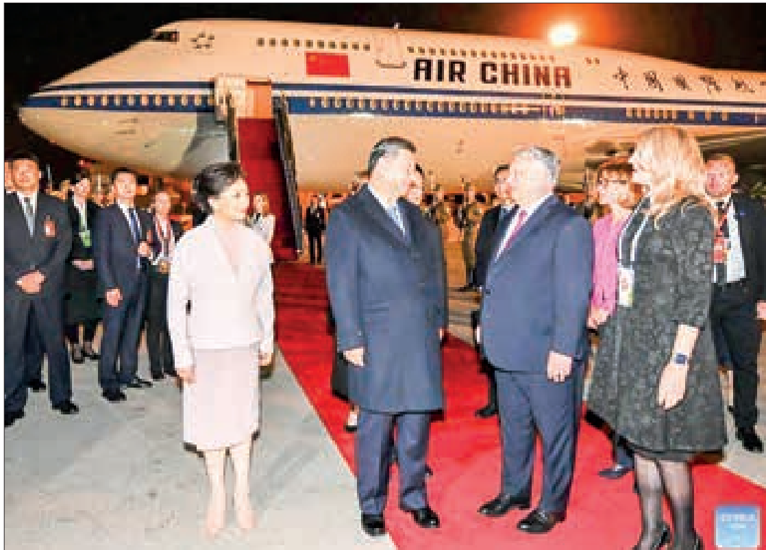
Chinese President Xi Jinping arrives in Budapest for a state visit to Hungary at the invitation of Hungarian President Tamas Sulyok and Prime Minister Viktor Orban, 8 May 2024. Xi was warmly welcomed by Hungarian Prime Minister Viktor Orban and his wife at Budapest Airport upon arrival.

The bilateral relationship has stood the test of the changing international landscape and continued to grow in depth from a friendship across the continent, to a friendly and cooperative partnership and then to a comprehensive strategic partnership, Xi said.