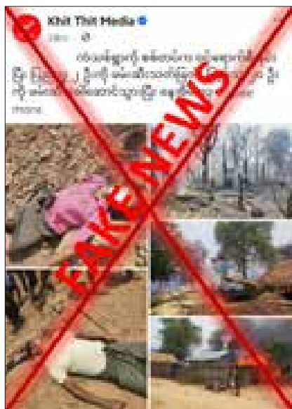
The screenshot validates misinformation.

REPORTS from certain media sources are spreading false information alleging that Tatmadaw security forces conducted a raid on Kanthit Village in Pakokku Township, Magway Region, on 8 May. They claim that two villagers were killed, 20 were arrested, and 13 houses were set on fire.