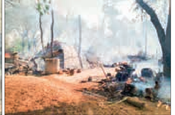
Damage and debris are seen in the aftermath of terrorists' attack.

PDF terrorists fired at Hsonywa Village, east of Sameikkhon Village in Myingyan Township of Mandalay Region with small arms and heavy weapons yesterday, leaving 17 men and 15 women of the village dead and five men and nine women wounded due to splinters of bombs.