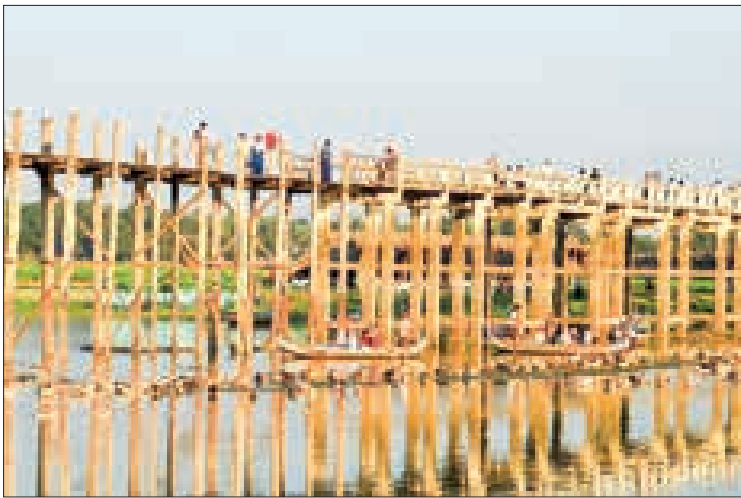
The photo shows some boats running in the lake.

U Soe Win, secretary of the U Bein Bridge Maintenance Committee, mentioned that nearly 600 local and foreign travellers frequent Taungthaman Lake and U Bein Bridge daily, with approximately 50 boats operating for passengers.