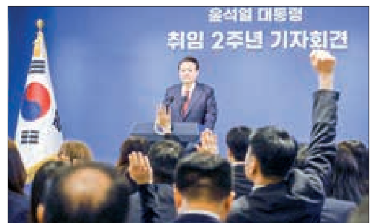
South Korean President Yoon Suk Yeol holds a press conference at his office in Seoul on 9 May 2024.

Yoon's administration decided to compensate the plaintiffs in a series of cases involving forced labour during Japan's colonial rule of the Korean Peninsula between 1910 and 1945 with money from a South Korean government-backed fund, rather than seeking restitution directly from the Japanese companies that were sued. — Kyodo