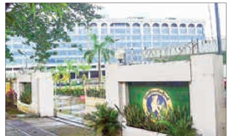
The front view of the office of Central Bank of Myanmar in Yangon.

According to CBM's notification on 15 March, it has been joining hands with law