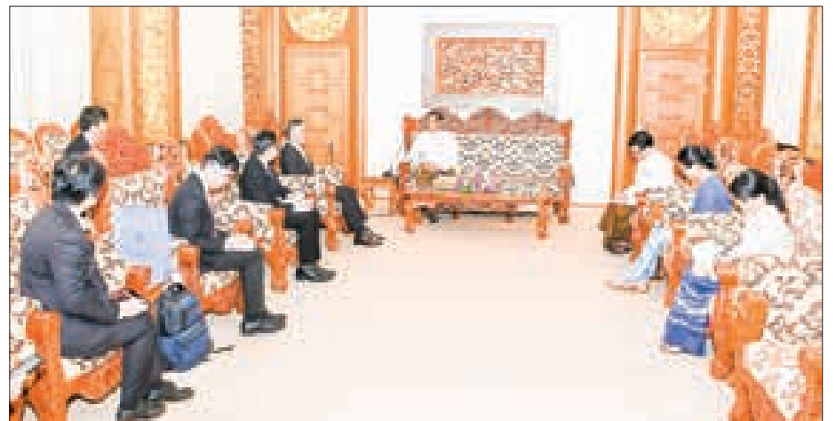
Thai Ambassador Mr Mongkol Visitstump calls on Deputy Prime Minister Union Foreign Affairs Minister U Than Swe yesterday.

of the existing long-standing cordial relations and bilateral partnership. Also, they discussed the expansion of mutually beneficial cooperation, especially in the areas of tourism, education, culture, trade, investment, and people-to-people connectivity between the two countries, as well as closer collaboration at both regional and multilateral arenas on the basis of mutual understanding and support. — MNA