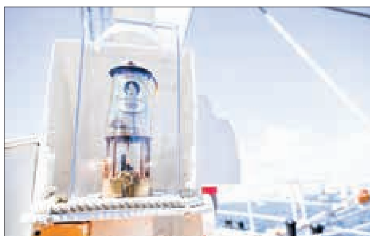
This photograph shows the Olympic flame on the French 19 th -century three-masted barque Belem as the boat sails near the coast of Marseille, in the Mediterranean Sea, on 8 May 2024, before landing with the Olympic torch, ahead of the Paris 2024 Olympic and Paralympic Games.

President Emmanuel Macron praised the "unprecedented effort" of the security forces in Marseille and said after watching the flame arrive that he hoped