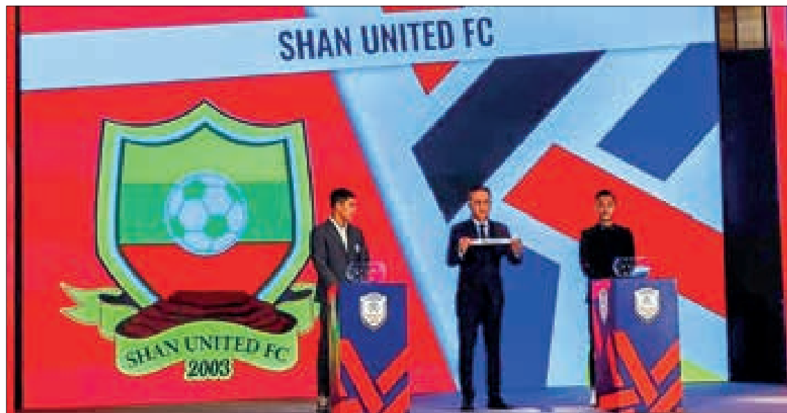
The Shan United logo is seen during the ASEAN Club Championship Qualifiers drawing-lots event held in Ho Chi Minh City, Viet Nam, on 9 May 2024.

ASEAN Club Championship Qualifiers and final round drawing-lots event held in Ho Chi Minh City, Viet Nam, on 9 May. Myanmar football club Shan United FC meets Brunei Football Club (Kasuka) in the qualifying play-off stage.