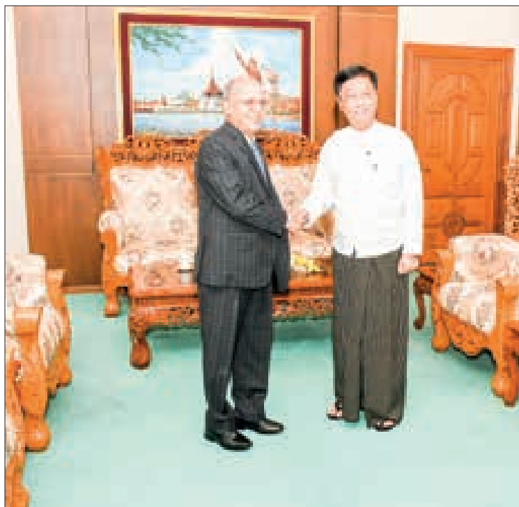
Deputy Minister U Lwin Oo greets the Nepali ambassador at yesterday's event.

DEPUTY Minister for Foreign Affairs U Lwin Oo received Mr Harishchandra Ghimire, Ambassador Extraordinary and Plenipotentiary of Nepal to the Republic of the Union of Myanmar, in Nay Pyi Taw yesterday.