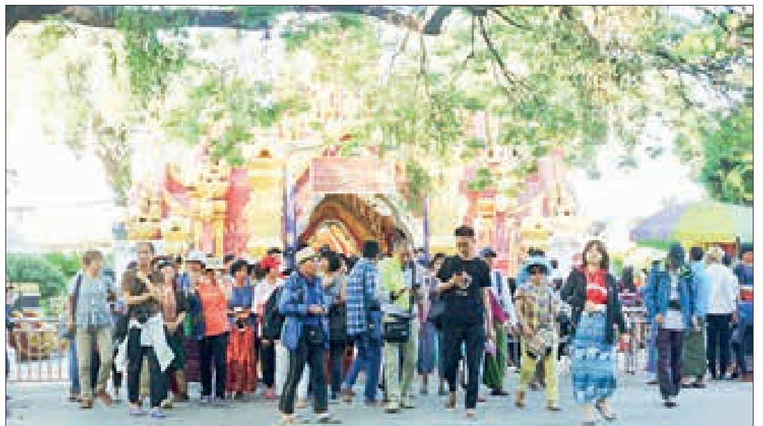
The image shows some foreign tourists visiting Myanmar.

In this year's tour season, the majority of visitors went to Mandalay, Bagan, Inlay, Kalaw, Kyaiktiyo, Chaungtha, Ngwehsaung, and newly developed beaches. In Thingyan, people flocked to famous destinations such as Chaungtha and Ngwehsaung beaches, but hotels could provide rooms for those only who had already made reservations. Some people couldn't find rooms in Chaungtha, and Ngwehsaung visited newly developed beaches. Some people took day trips during Thingyan. — MT/ZS