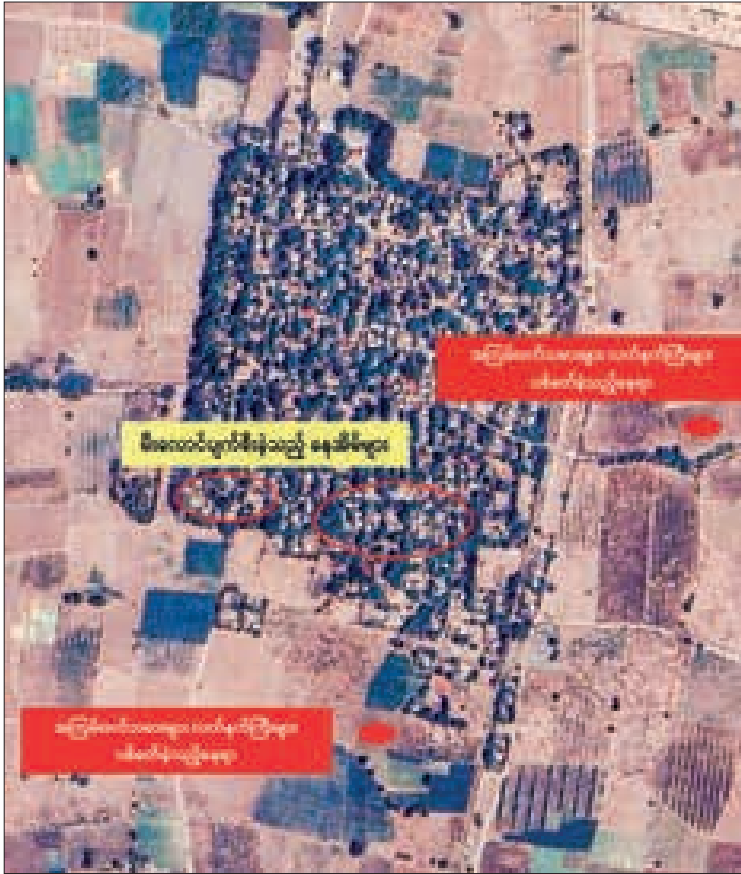
The location map of heavy-weapon attack by terrorists and houses ablaze.