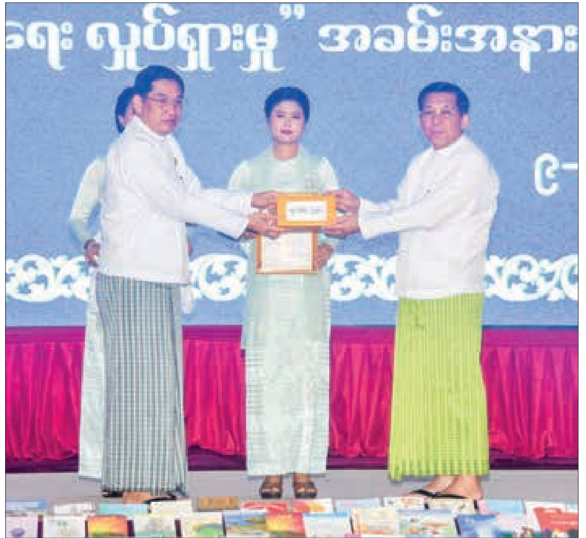
The Senior General accepts cash donations for the construction of libraries.