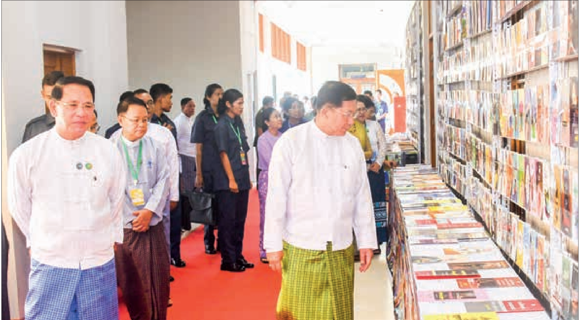
State Administration Council Chairman Prime Minister Senior General Min Aung Hlaing looks into the display at yesterday's event in Nay Pyi Taw.