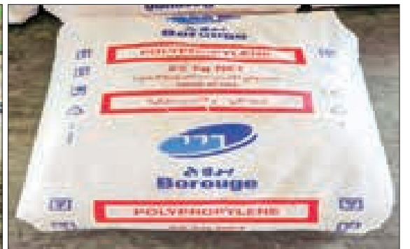
Confiscated illegal goods from different states and regions.

worth of illegal teaks and timbers in Lawe and Ottarathiri districts.