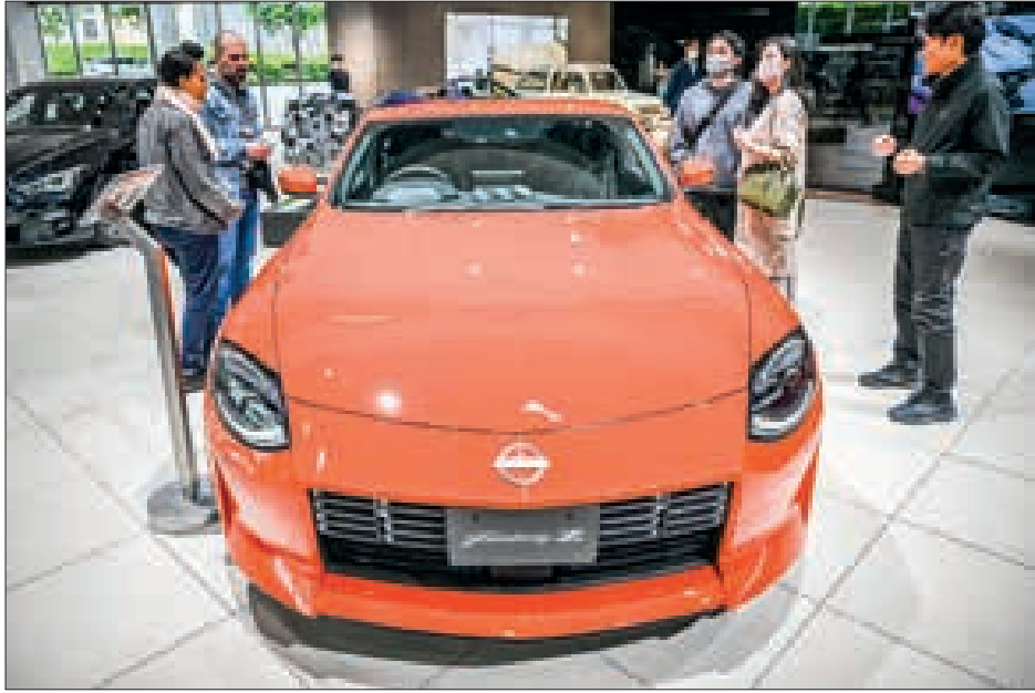
People look at a car on display at a showroom of Japanese automaker Nissan Motor in Yokohama on 9 May 2024.

NISSAN Motor Co said Thursday its net profit for the year ended March almost doubled from a year earlier to 426.65 billion yen ($2.7 billion), as vehicle sales grew following the coronavirus pandemic and a weaker yen boosted its overseas profit.