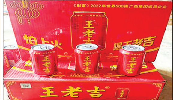
Confiscated\ illegal\ commodities\ from\ various\ states\ and\ regions.