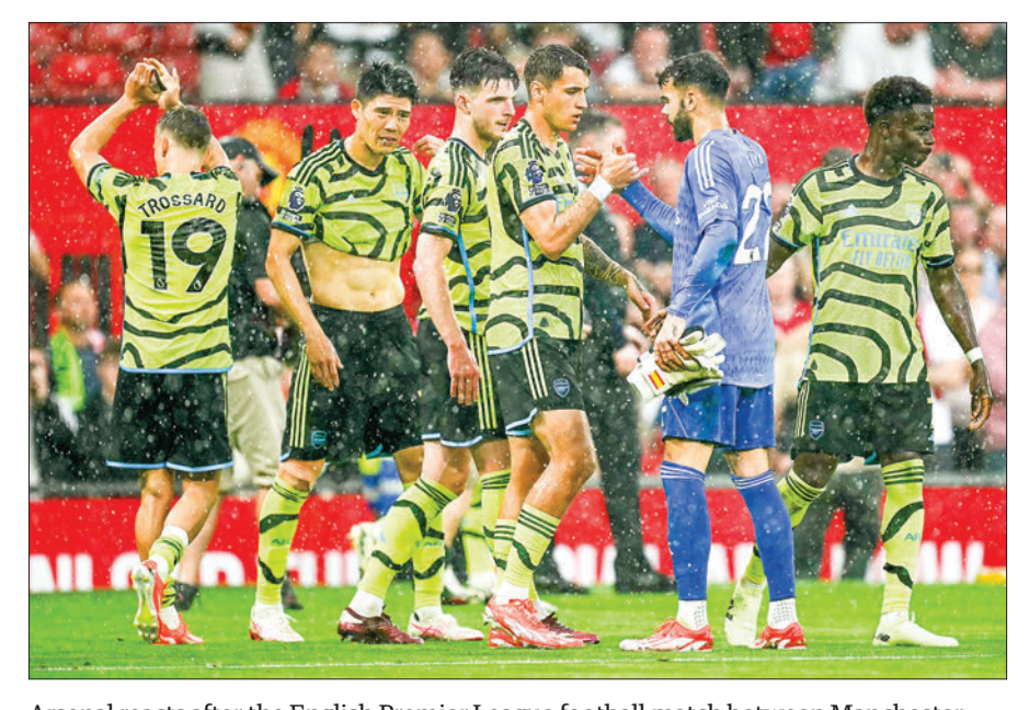
Arsenal reacts after the English Premier League football match between Manchester United and Arsenal at Old Trafford in Manchester, north west England, on 12 May 2024.

THE battle for the Premier League title will go to the last game of the season after Arsenal won 1-0 at Manchester United on Sunday afternoon.