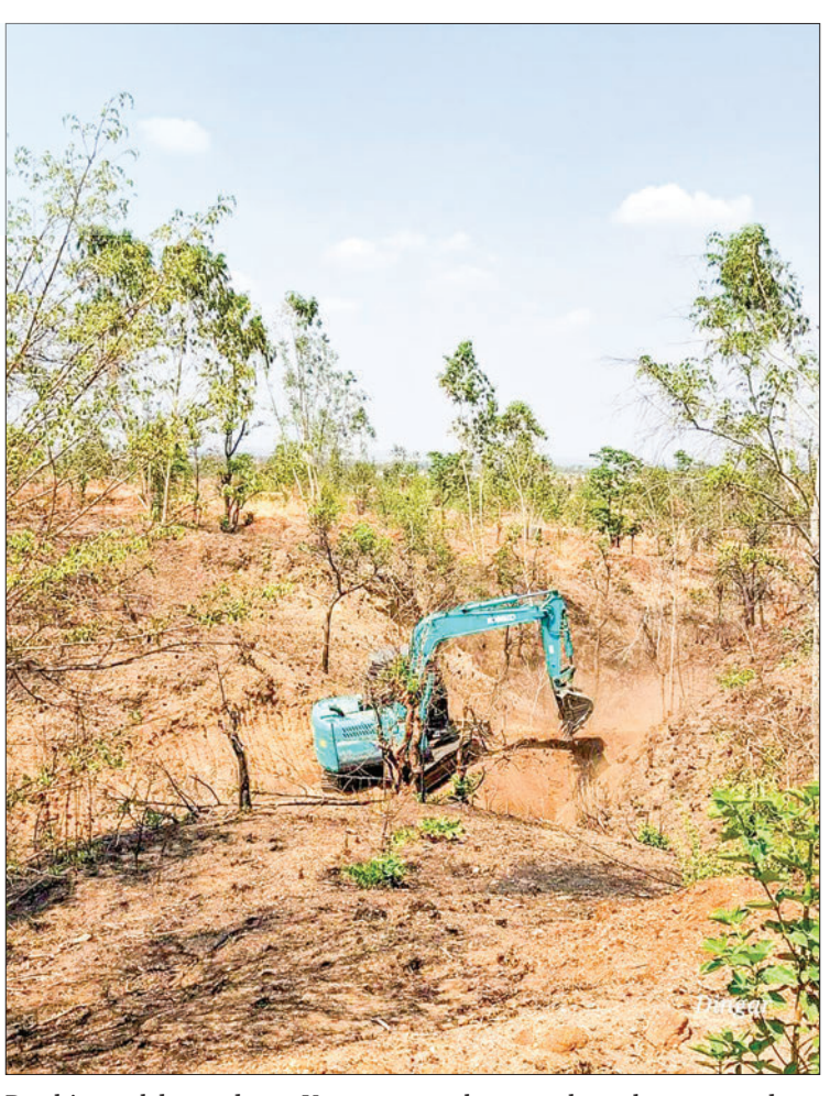
Parahita park located near Yenangyoung bypass where the man-made forest will be created.

In order to protect the manmade forest including shade trees such as rain trees, neem trees and Homalium longifolium from forest fire, arson attack and animals, gardeners including their families will be hired by providing financial support. — Thit Taw/ZS