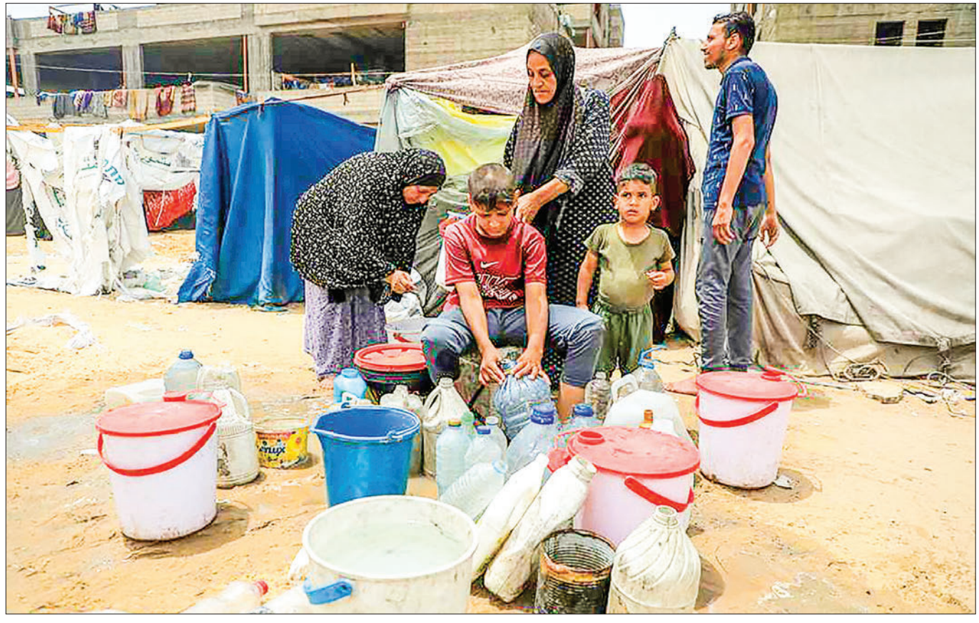
Palestinians are seen at a temporary camp in the southern Gaza Strip city of Rafah on 10 May 2024.