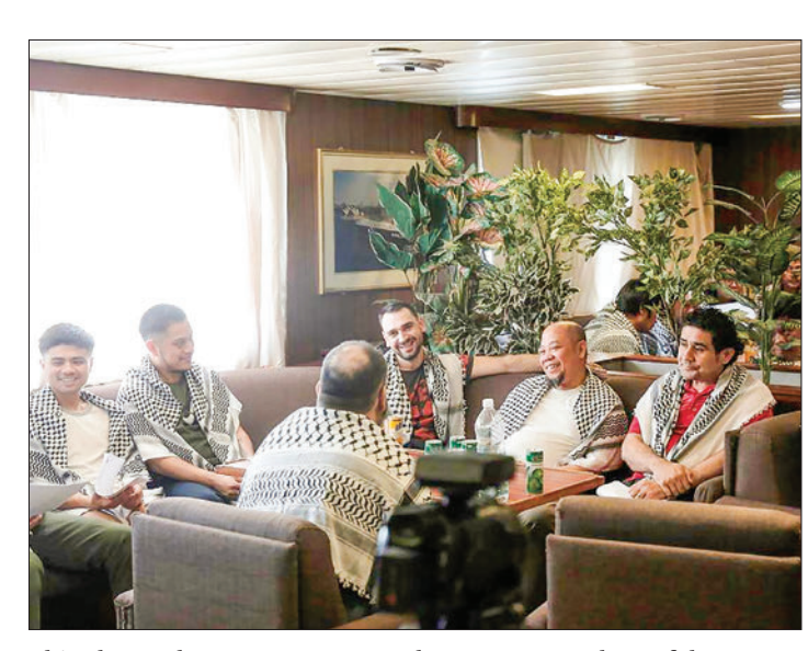
This photo taken on 12 May 2024 shows crew members of the Galaxy Leader on the ship near the port city of Hodeidah in western Yemen.