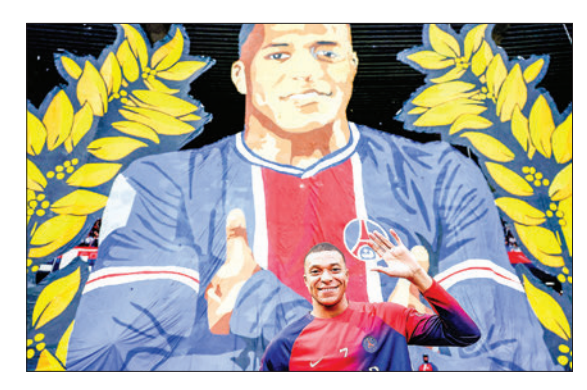
Paris Saint-Germain's French forward (7) Kylian Mbappe poses in front of a giant tifo before the French L1 football match between Paris Saint-Germain (PSG) and Toulouse (TFC) on 12 May 2024 at the Parc des Princes stadium in Paris.

However, Thijs Dallinga quickly equalised for the visitors against a PSG side which showed 10 changes to the team knocked out of the Champions League by Borussia Dortmund in the semi-finals in midweek, with Mbappe the only player to keep his place. — AFP