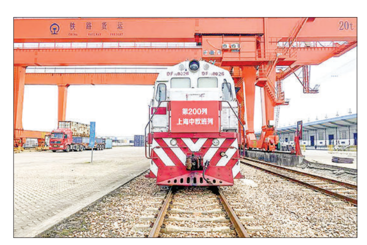
This photo taken on 19 April 2024 shows a China-Europe freight train departing from east China's Shanghai.

CHINA-EUROPE freight train services saw solid growth from January to April