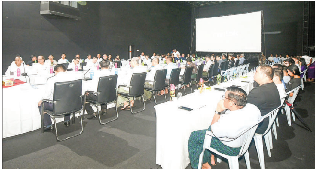
Union Minister U Maung Maung Ohn speaks on the meeting occasion with the film industry businesspeople yesterday in Yangon.

the COVID-19 period, and possible ways to cover the expenses of producers in making films.