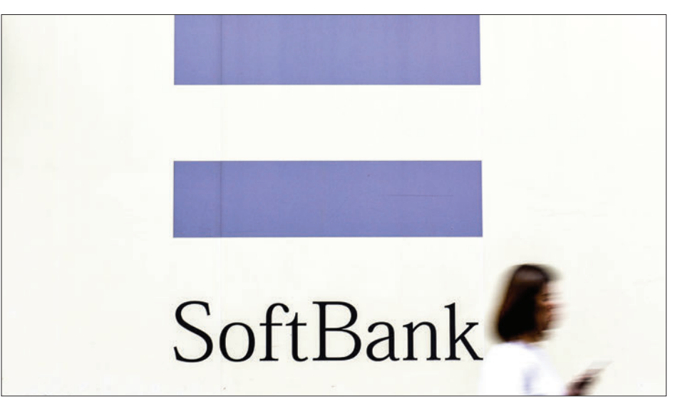
File \ photo \ taken \ May \ 2019 \ shows \ the \ logo \ of \ Softbank \ Group \ Corp \ in \ Tokyo. \ \textbf{PHOTO:KYODO}

SOFTBANK Group Corp said Monday it booked a net loss of 227.65 billion yen ($1.5 billion) for the year ended March, posting red from the 970.14 billion yen