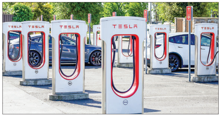
Tesla cars charge up at a Tesla Supercharger on 2 May 2024 in Petaluma, California. California Gov Gavin Newsom said over the weekend that Tesla's charging network will now be available to non-Tesla electric vehicles.

By the end of April, some 89,000 China-Europe freight train trips had been completed in total, serving 223 cities across 25 European countries, according to China Railway. — Xinhua