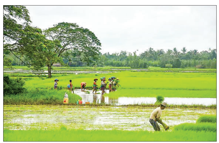
The photo shows the summer paddy field in Mandalay Region.

The objective is to assist cooperative society members in increasing crop yields and earning higher profits through collaboration. The loan carries an interest rate of one kyat per month, with both interest and principal repayment required after six months. — TWA/MKKS