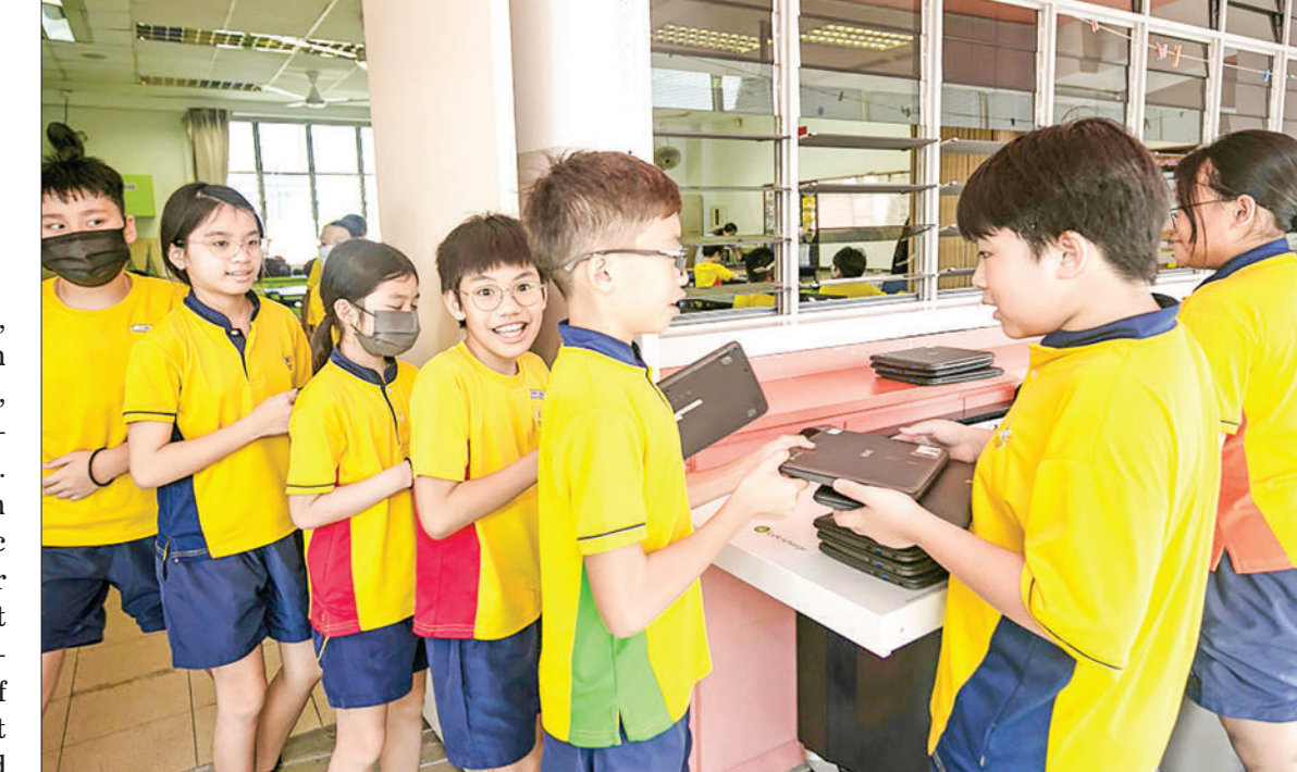
Students receive laptops for a mathematics lesson using artificial intelligence at Lakeside Primary School in Singapore on 9 November 2023.