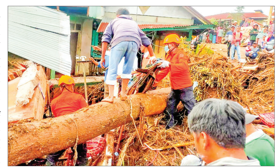
This handout image taken and released by Indonesia's National Search and Rescue Agency (BASARNAS) on 13 May 2024 shows personnel taking part in a search operation in Tanah Datar, West Sumatra.

Residents said they heard rocks thundering down roads outside their homes when the heavy rains struck.