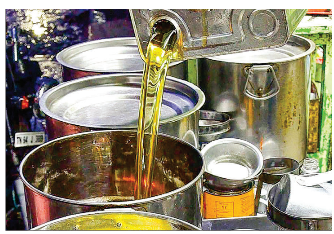
Cooking oil is arranged for sales in the market.

THE wholesale reference rate of palm oil for the Yangon market was set at K5,220 per viss this week starting from 13 May, similar to that of the previous two weeks, according to the Supervisory Committee on edible oil import and distribution. The reference rate remained unchanged in the past three consecutive weeks.