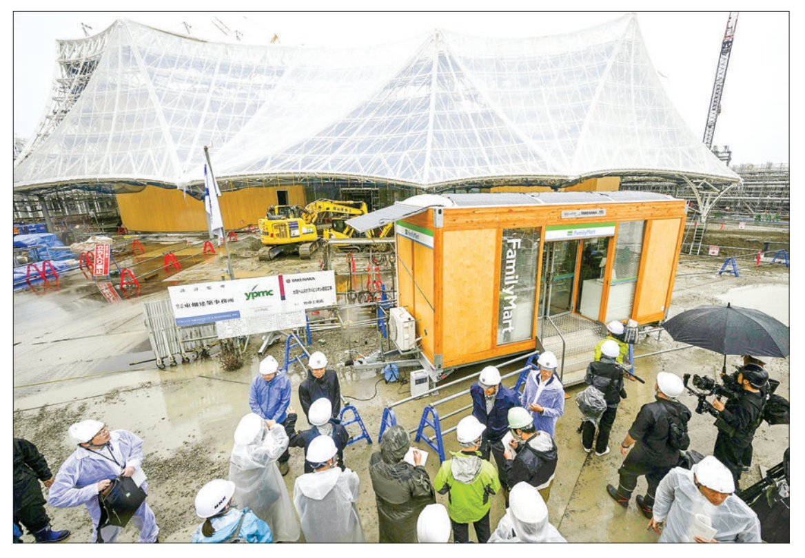
Photo taken on 13 May 2024, shows an unmanned, mobile convenience store operated by FamilyMart Co at a construction site at the venue for next year's 2025 World Exposition in Osaka.