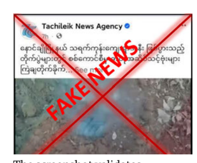
The screenshot validates misinformation.

They claim that these bombs resulted in symptoms of dizziness and nausea among terrorists. However, an official from the security forces has refuted these claims, stating that there was no use of chemical weapons. According to their statement, terrorists have falsely accused Tatmadaw of employing such tactics in conflicts where they faced significant losses. Reports from the recent