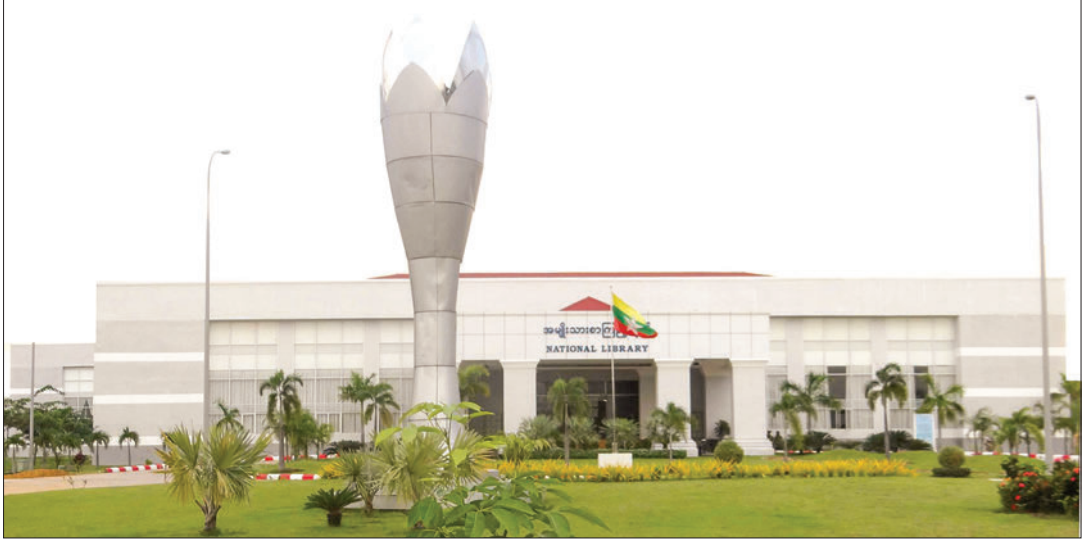
The photo showcases the National Library of Myanmar in Nay Pyi Taw.