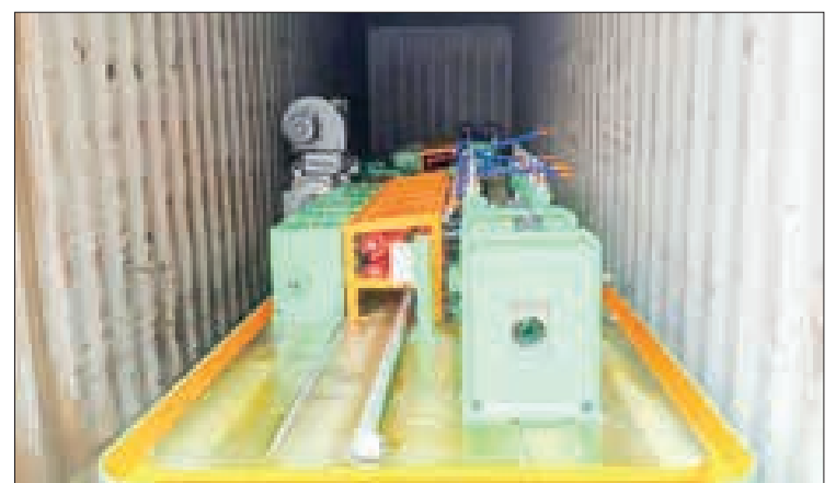
Seized illegal item.

Therefore, 11 arrests (estimated value of K920,785,714) were made on 30 April and 1 May, according to the committee. — MNA/KTZH