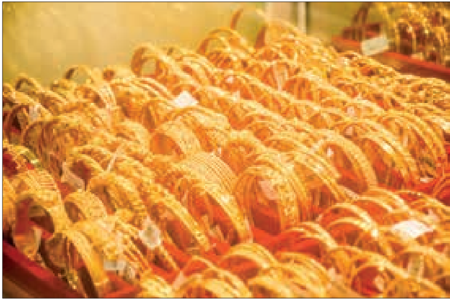
Jewellery is displayed at the gold outlet in Yangon.

THE domestic gold price slightly declined to K4.77 million per tical (0.578 ounce or 0.016 kilogramme) on 2 May after peaking at K4.85 million per tical on 26 April.