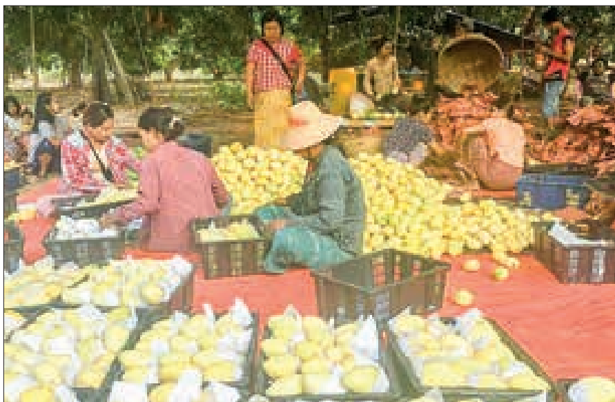
Mangoes that are being trial-exported to China.

Transportation charges have skyrocketed for export to foreign countries, and border-crossing export is lengthy, which is why it seems mango will have to rely more on the domestic market but needs to wait and see about exporters, said an official from Myanmar Mango Producers and Exporters Association. — MT/ZS