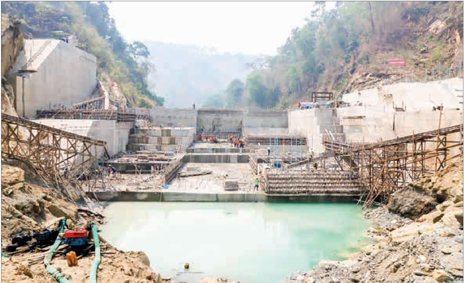
The image depicts the construction works of the Nampanga small-scale hydropower project in Homalin Township, Sagaing Region.