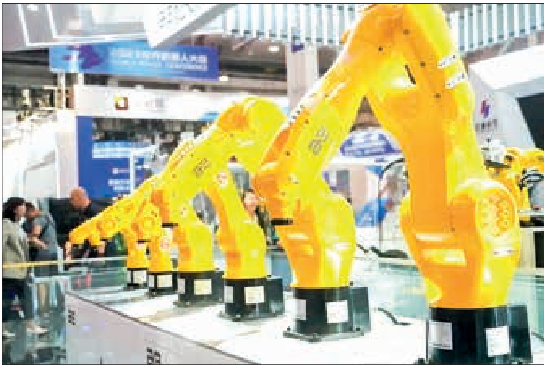
Desktop industrial robots are pictured at the World Robot Conference 2023 in Beijing.