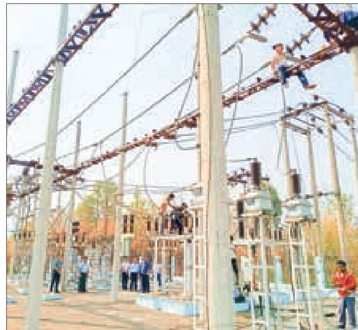
MoEP officials inspect the power line maintenance.

The report also highlights that dams have insufficient water levels due to lower rainfall during the 2023 monsoon compared to 2022. Water stored in dams and natural gas must be used cautiously from last November to the upcoming June for electricity production to ensure stable nationwide electricity distribution and prevent power outages before the monsoon season. As a result, the country can only meet around 50 per cent of its electricity demands. — TWA/TMT