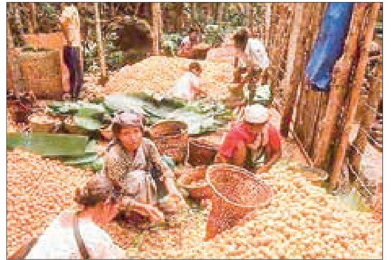
A betel farm and some female workers picking betel nuts.

“Betel nut is mainly exported to India. As the route situation is not good, we no longer deliver our products from Myeik to Tamu but send them down to Kawthoung for export to Ranong. The local betel nut production in one year cannot be consumed in three years. It has to rely on the export market. As demand is low while supply is high, betel nut price doesn't increase, and that's the nature of the market,” said a betel nut trader from Myeik. — Thit Taw/ZN