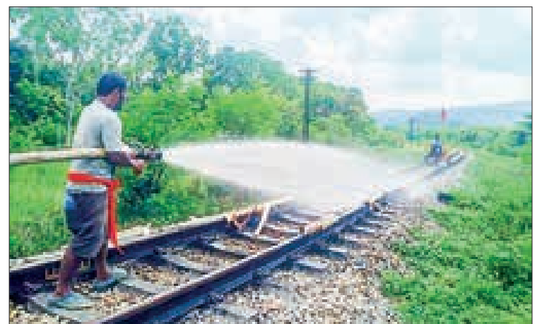
Thai railway workers doused the melting tracks with water to try to bend them back into shape /State Railway of Thailand. PHOTO: AFP

The well-known feline aversion to water means some link the animals to rainfall, with their furious meows after being drenched thought to summon precipitation. — AFP