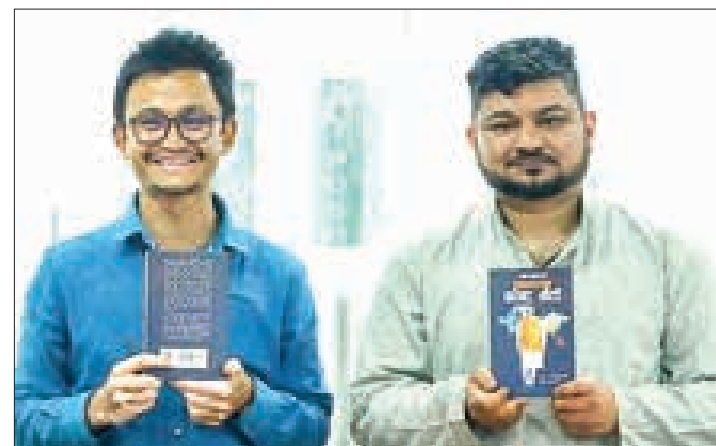
Chhetri compiled Modi's speeches meticulously, while Chand skillfully translated them into Nepali. The book offers insights into India's diplomatic strategies and global perspectives.

The compilation spans speeches delivered by PM Modi from 2014 to early 2024 during his various international engagements, shedding light on India's diplomatic approach