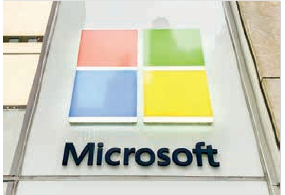
File photo taken in February 2020 in New York shows the logo of Microsoft Corp.

Nadella announced the investment during a forum in Kuala Lumpur. Earlier Thursday, he met with Prime Minister Anwar Ibrahim.