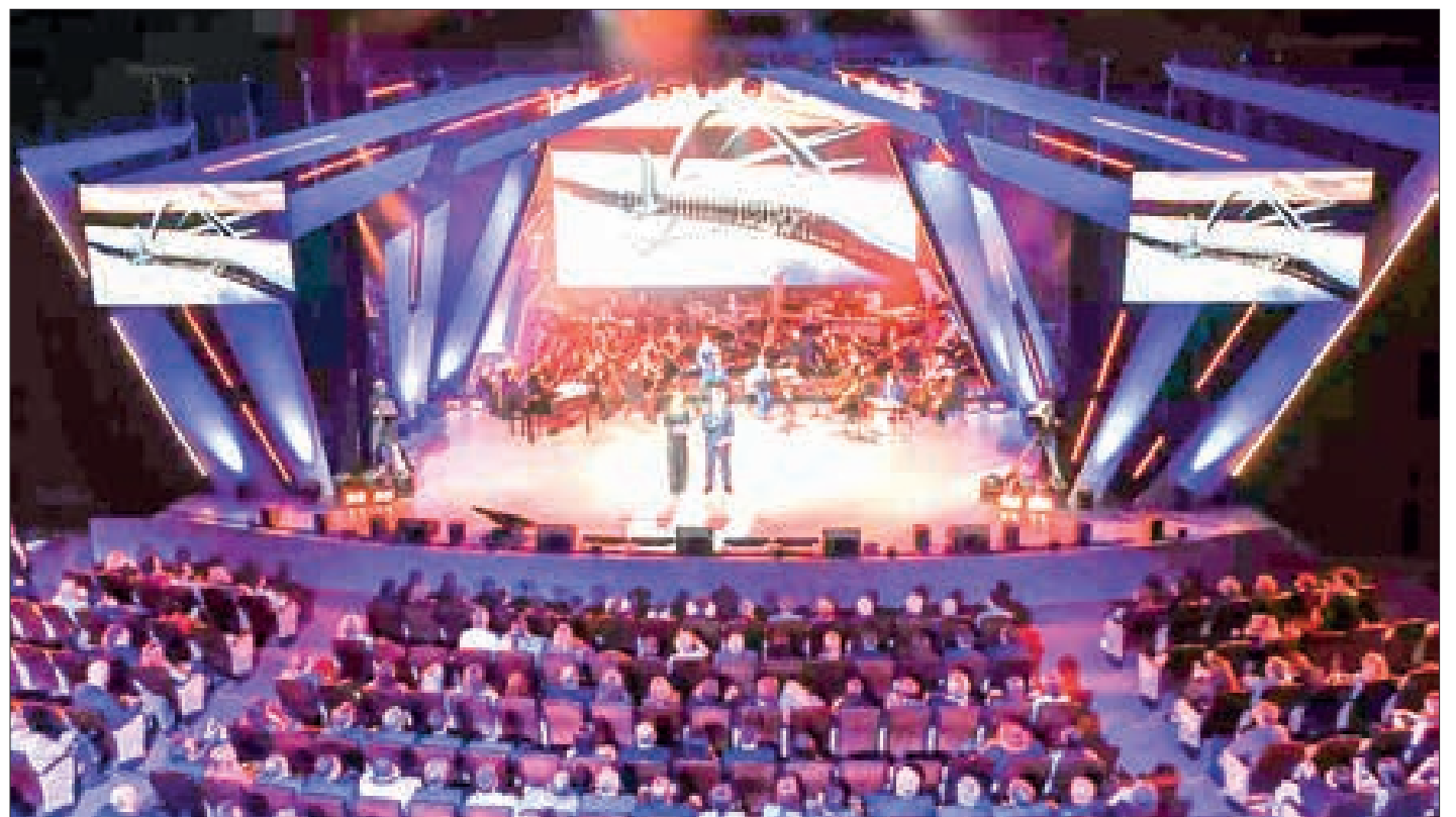
Solo performances by foreign vocalists took place on 28 April in the semi-final, with finalists teaming up for duets with Russian music and cinema stars during the final gala concert.

The festival, organized by the Russkiy Mir Foundation, received 210 applications from vocalists representing 55 countries, with 15 participants chosen after an online qualifying round.