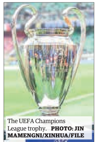
The UEFA Champions League trophy.

Italy, at the top of UEFA's points table, wrapped up the first European Performance Spot last month and no matter how well Aston Villa do in the Europa Conference League, England cannot secure an extra berth. Villa must now hold on to fourth spot in the Premier League to qualify for the Champions League. — AFP