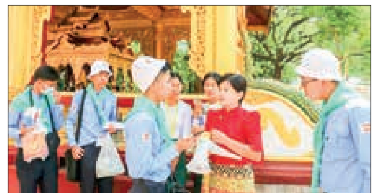
Visitors are exploring the Bagan Archaeological Museum in 2023.

"Foreigner admission is still few. There were about 40 foreign admissions in March and about 23 in February. So the number of local visitors was larger than foreign visitors,"