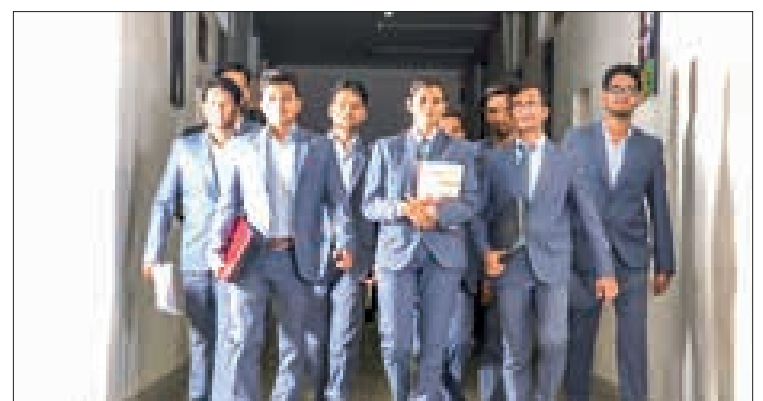
Ahmedabad has entered the in the top 100 global cities as destination for working professionals.

a different country for work, cited a strong emotional attachment to their country. The global average was 33 per cent. As many as 23 per cent participants are actively seeking jobs in other countries, and 63 per cent expressing an overall willingness to do so, the survey read. — ANI