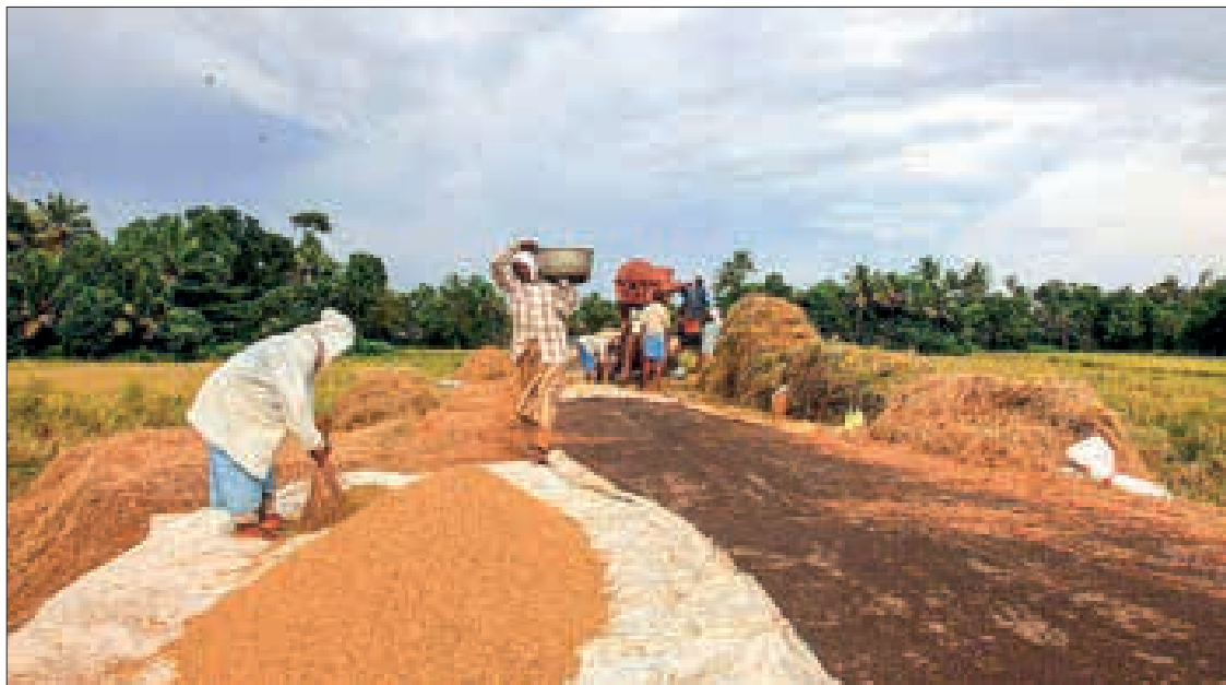
Some farmers are winnowing and packaging paddy in the Ayeyawady Region.

“There are buyers who buy paddy sensibly. In the past, when farmers sold in a rush, prices plunged down. This year, the price has been steady, and the trade has been normal. Paddy quality has become different between the beginning of harvest and now. In Pathein, paddy fields, in which saltwater flows, have declined in its quality, and the price of such non-premium paddy is K1.8-K2 million per 100 baskets,” said the association’s