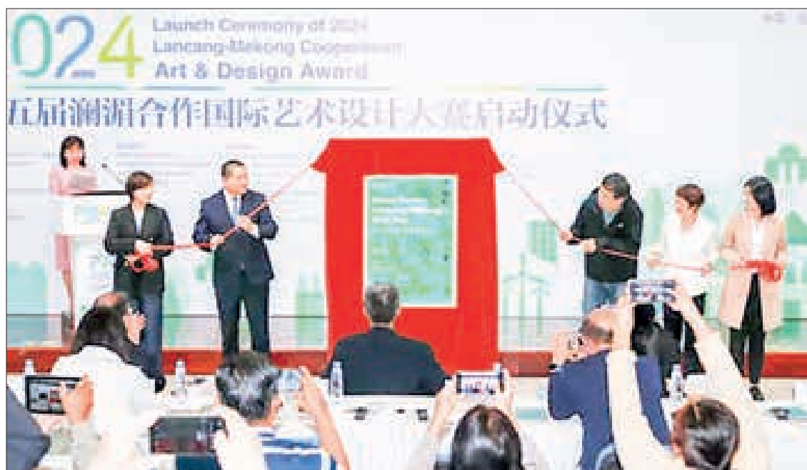
The photo captures the ceremony of the Lancang-Mekong Cooperation International Art Design Competition.

MSMEs and developing the MSMEs and local job opportunities. — Nyein Thu (MNA)/KTZH