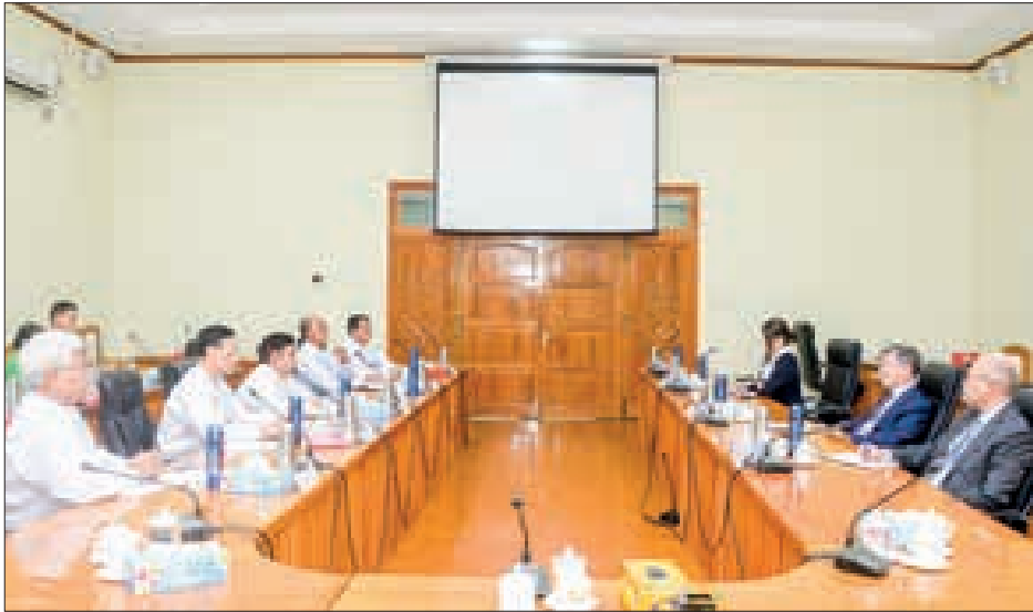
Union Minister U Nyunt Pe holds talks with the Russian ambassador yesterday.