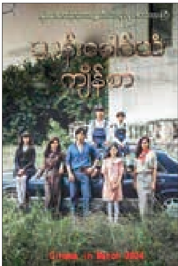
A poster of the Cambodian film ‘Midnight’s Curse’.

A Cambodian film titled ‘Midnight Curse’, featuring My-