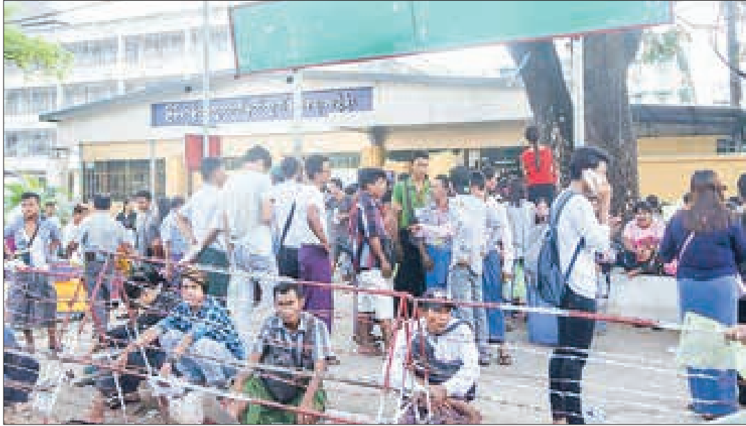
Passport applicants are seen at the office of the Myanmar Passport Issuing Board in 2023.

ACCORDING to the Myanmar Passport Office, the issuing of Myanmar passports through the online booking System will be extended to 11 cities.