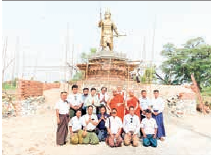
The compound inside the short-drum-shaped city wall of ancient Inwa seen with scarce trees in 2019 when the bronze statue of King Thatoe Minphya, founder of the First Inwa, was erected.

"To restore the originality of the north-south road in the short-drum-shaped city wall and the Thayetthonpin street from