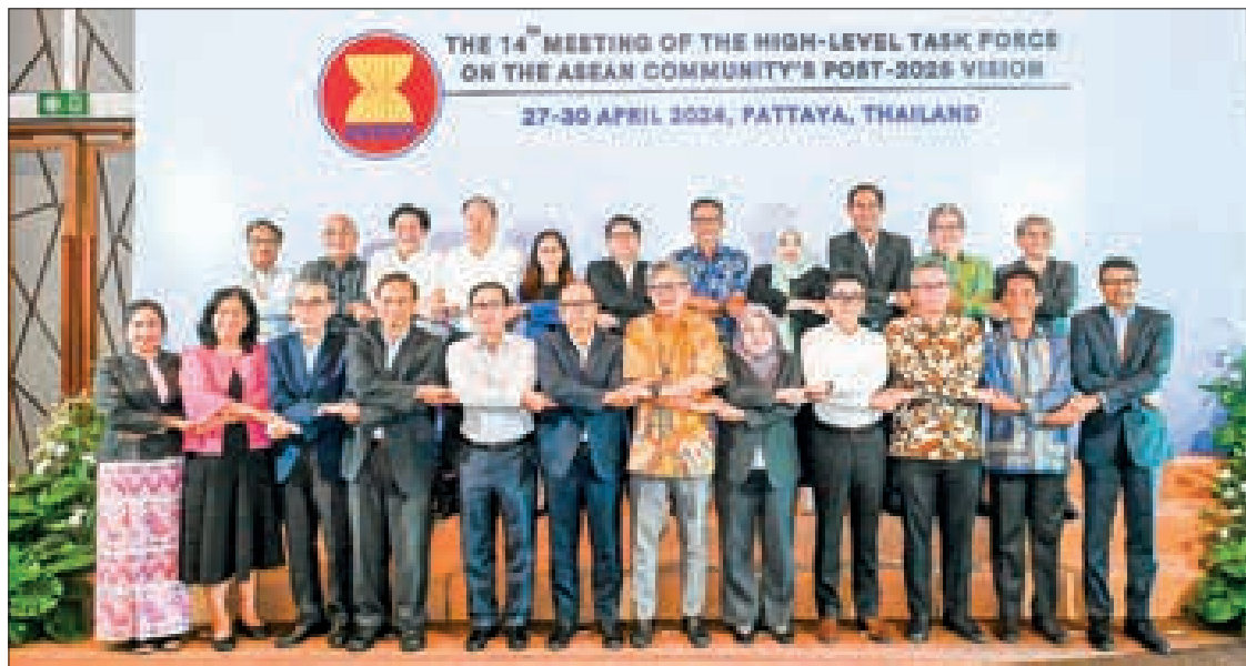
Myanmar delegates join the group documentary photo session at the 14 th (HLTF-ACV) meeting in Pattaya, Thailand on 27-30 April 2024.

Minister expressed appreciation to the Co-Chairs and the host for organizing the important Meeting. She commended high-level representatives for their efforts in completing the first reading of the APSC Strategic Plan of the ASEAN Community Vision 2045. She looked forward to its narrative format for further negotiations. On Strengthening ASEAN's Capacity and Institutional Effectiveness, the Deputy Minister highlighted the need to strengthen not only the ASEAN Secretariat but also the respective national secretariat so as to bridge the gap between human resources