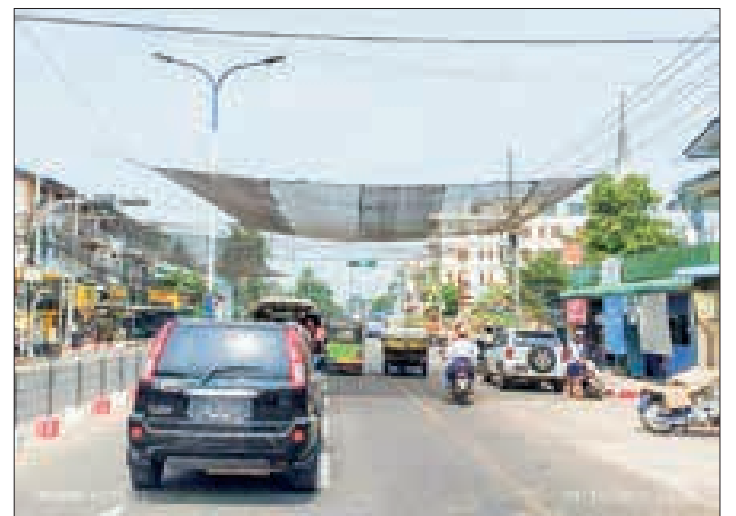
Sun protection roofs and shades installed at major roads in Mandalay.

sprinklers have been installed at major road intersections since early April to help mitigate the effects of the heat on the public. — ASH/TKO