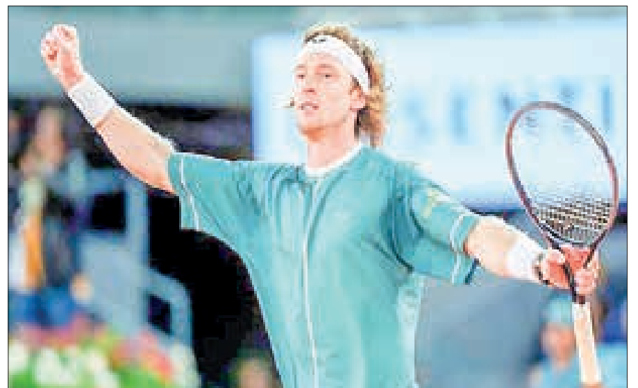
Andrey Rublev, ranked World No 8, delivered a masterclass performance to end Carlos Alcaraz's Madrid dominance in the ATP Masters 1000 event.

Under the cover of Manolo Santana Stadium, the 26-year-old occasionally overpowered Alcaraz with his powerful forehand wing hits. After defeating Jan-Lennard Struff for two hours and fifty minutes in the fourth round, Rublev won thirty games and often stepped inside the baseline to pressure the Spaniard.