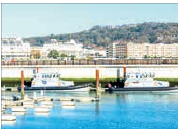
Photo taken on 29 November 2021 shows two Border Force patrol boats moored in Dover Docks in Dover, Britain. Authorities are exploring safer routes to deter illegal migration across the perilous English Channel.

BRITISH authorities have commenced the detention of asylum seekers as part of the new initiative aimed at deporting them to Rwanda, with initial flights slated for departure as early as July, the government announced, Al Jazeera reported. Home Secretary James Cleverly remarked, "Our dedicated enforcement teams are working at pace to swiftly detain those who have no right to be here so we can get flights off the ground."