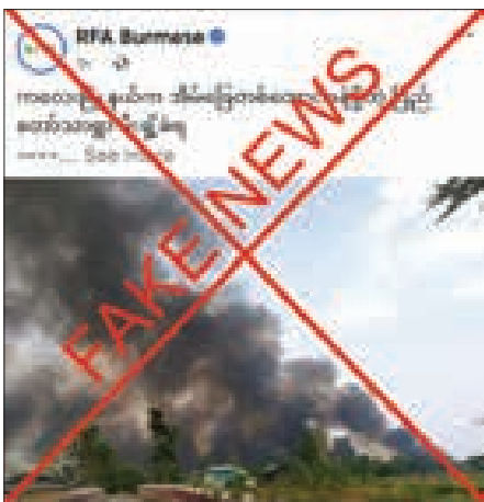
The screenshot validates false claims.

Media accuses security forces of raiding, torching Kalay's Pyitawtha village