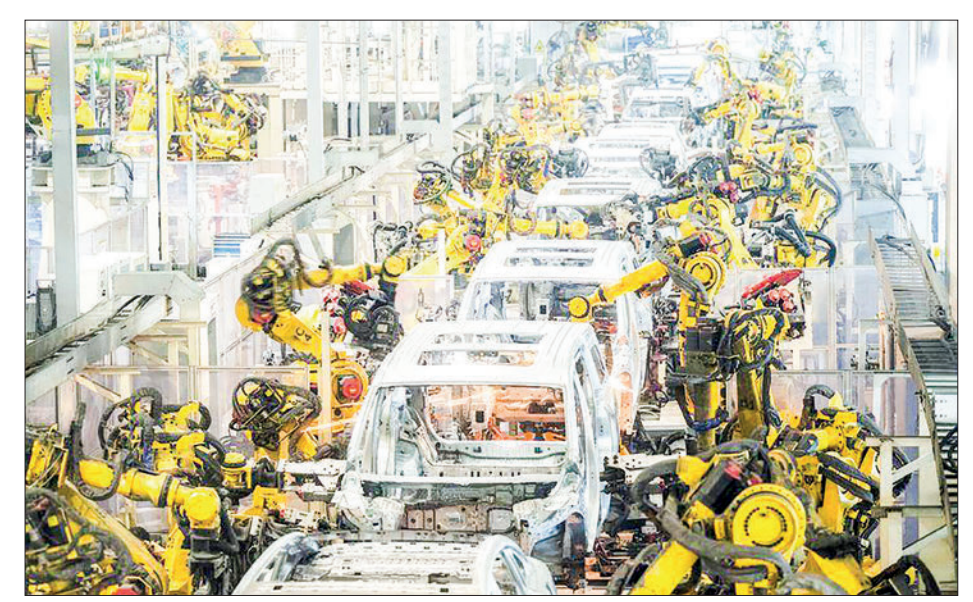
Robots are seen at an assembly line of Voyah, a Chinese luxury electric auto brand, in Wuhan, central China's Hubei Province, 1 April 2024.

During the January-April period, nearly 2.48 million units of new energy vehicles (NEVs) were sold through retail channels, surging 35 per