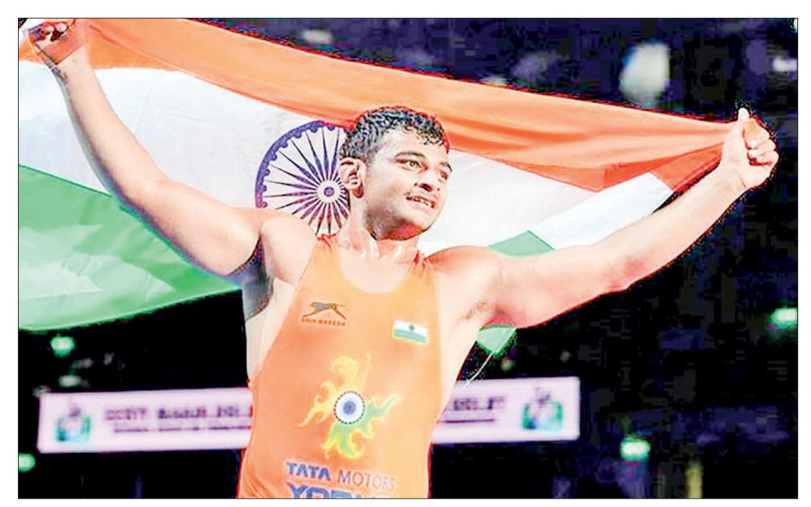
India is sending a 14-member squad to the World Wrestling Olympic Qualifiers in Istanbul, starting Thursday, the last opportunity for wrestlers to secure quotas for the Paris 2024 Olympics.

INDIA is fielding a 14-man squad for the World Wrestling Olympic Qualifiers scheduled in Istanbul from Thursday, the last chance