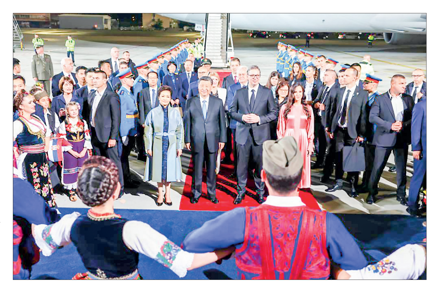
Chinese President Xi Jinping arrives in Belgrade for a state visit to Serbia at the invitation of Serbian President Aleksandar Vucic, 7 May 2024.

Xi expressed the robust friendship between China and Serbia, focusing on cooperation and development plans for their bilateral relations.