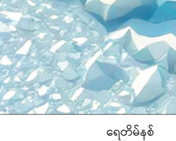
/ Yay dain nit/