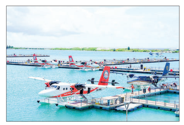
This photo taken on 28 April 2024 shows the seaplane docking facility at Velana International Airport in Male, the Maldives.

The Maldives is currently working on reaching a target tourist arrival of two million by the end of this year, local media said. — Xinhua