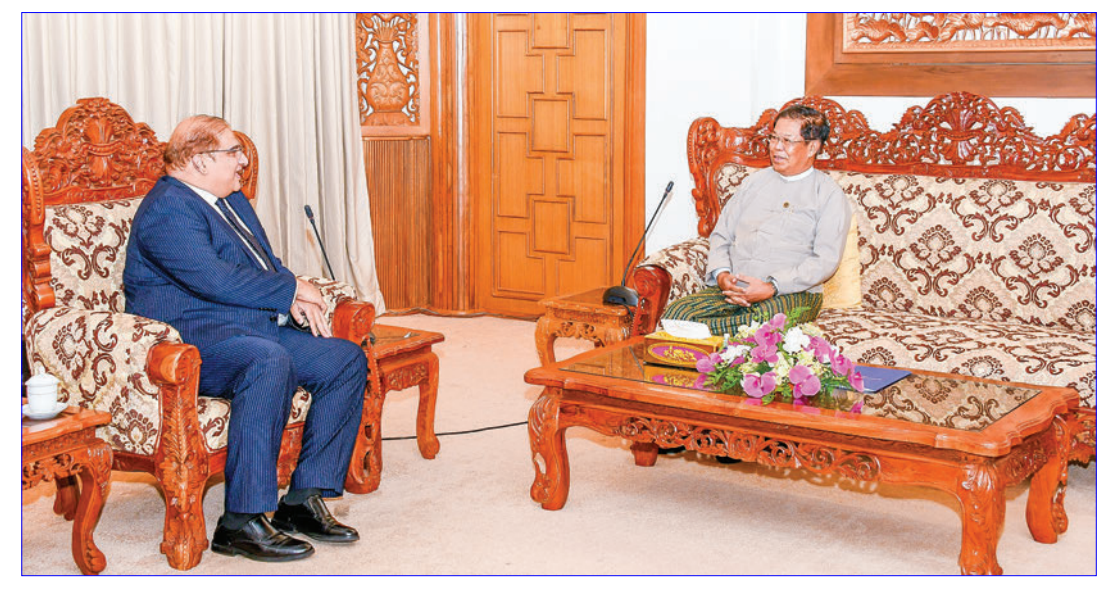
Pakistani Ambassador to Myanmar Mr Imran Haider calls on Deputy Prime Minister Union Minister for Foreign Affairs U Than Swe yesterday in Nay Pyi Taw.

DEPUTY Prime Minister and Union Minister for Foreign Affairs of the Republic of the Union of Myanmar U Than Swe received Mr Imran Haider, Ambassador of the Islamic Republic of Pakistan to the Republic of the Union of Myanmar, in Nay Pyi Taw yesterday.