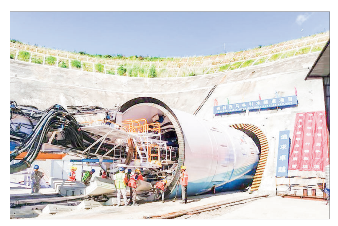
A double-shield tunnel boring machine (TBM) works at a construction site of the Sunkoshi Marin Diversion Multipurpose Project in Sindhuli, Nepal, 14 October 2022.

After the prime minister pushed the button, a double-shield tunnel boring machine broke through the last section of the tunnel within minutes, to the applause from the audience. The tunnel is the main part of the Sunkoshi Marin diversion multipurpose project, which is aimed at diverting water from the Sunkoshi River to the Marin River through the tunnel to irrigate 122,000 hectares of farmland in the districts of Dhanusha, Mahottari, Sarlahi, Rauthat and Bara in the Terai Plains. In addition, a powerhouse is being built to generate 28.62 megawatts of electricity to alleviate the shortage of power supply in the area.