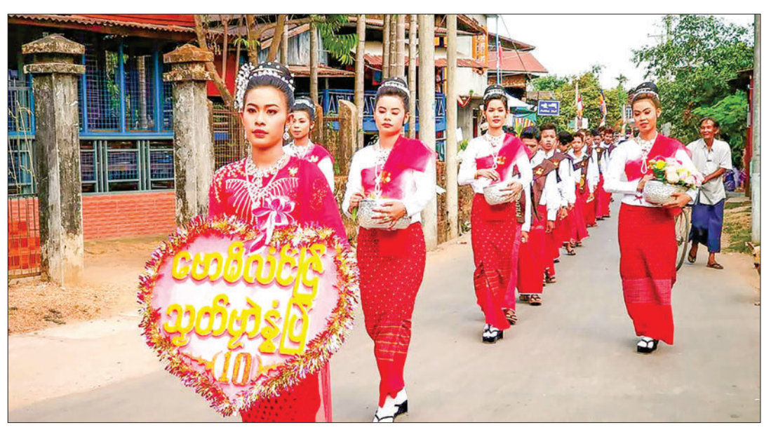
The photo shows Mon's traditional Kason water-pouring festival.

Answer "1111" to fight against corruption Answer "1111" to improve services