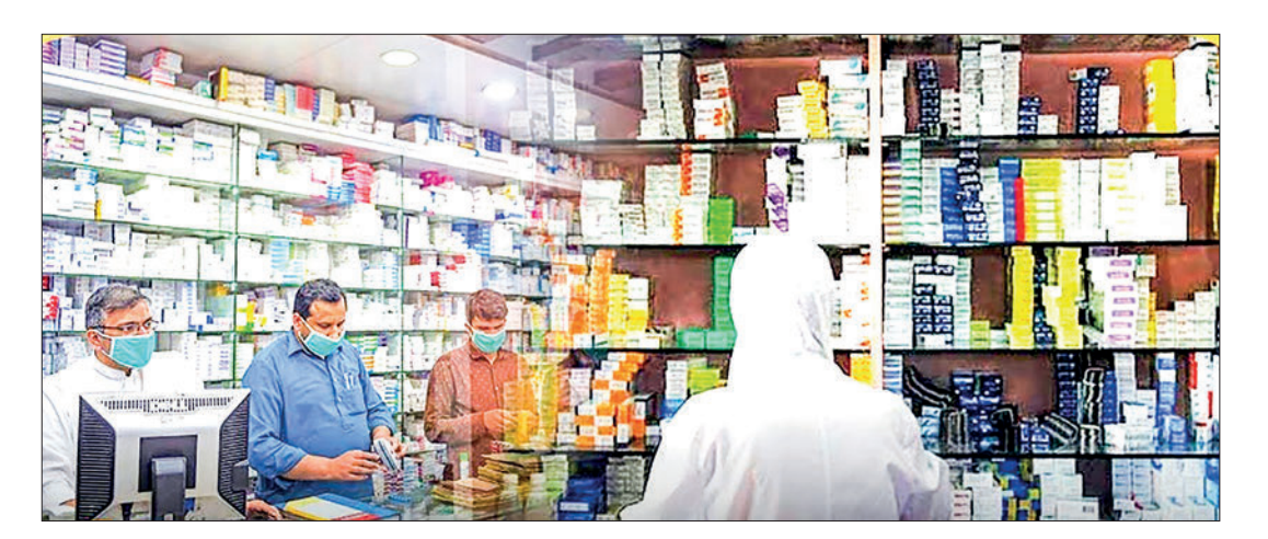
The smuggling of fake medicines is the most perilous aspect of trafficking.