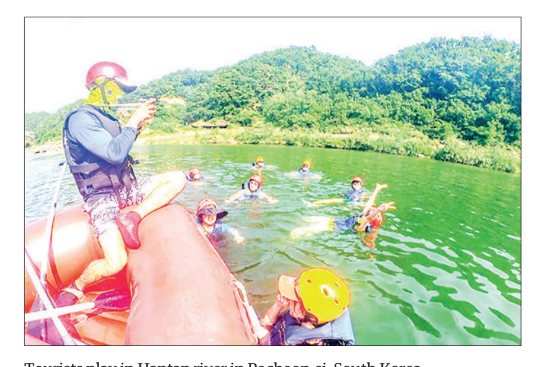
Tourists play in Hantan river in Pocheon-si, South Korea.

SOUTH Korea experienced its hottest April since comprehensive records began in 1973,