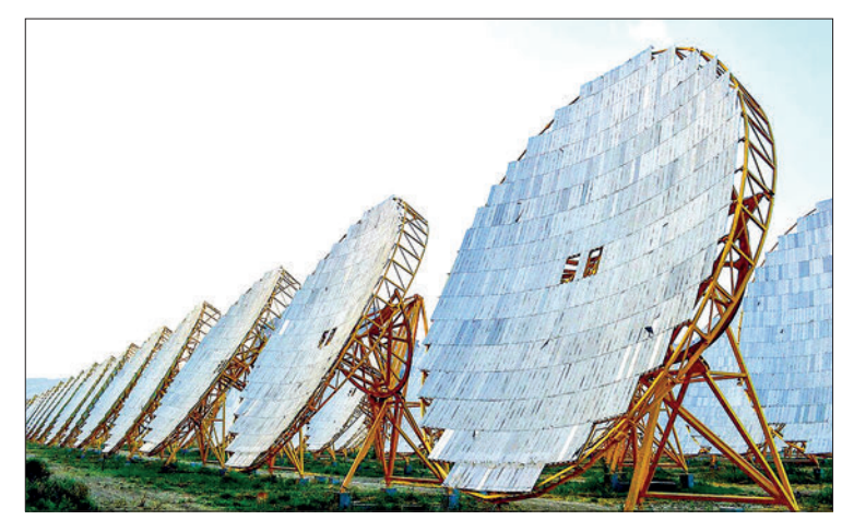
This significant growth has elevated India from being ranked ninth in 2015 to the third-largest solar power producer globally. India One Solar Thermal Power Plant in Rajasthan, India.

INDIA overtook Japan to become the world's third-largest