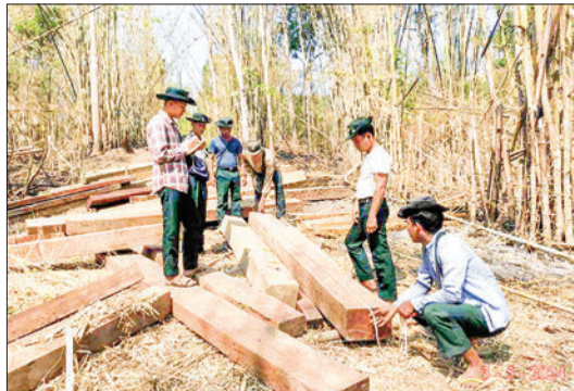
Officials check and seize illegal timbers in Bago Region.