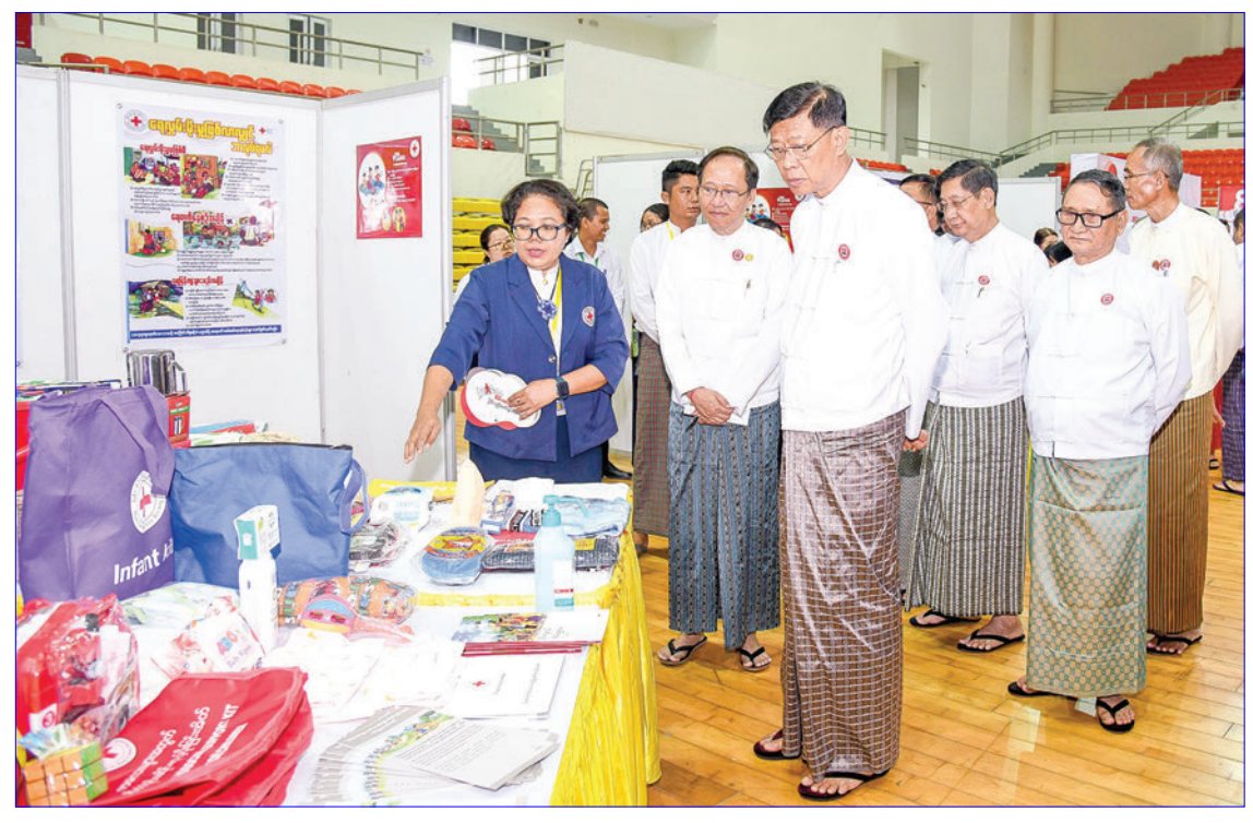
State Administration Council Member Deputy Prime Minister Union Minister for Transport and Communications General Mya Tun Oo views round the booths displayed at the event yesterday.

The World Red Cross Day has been celebrated annually since 8 May 1948, and the theme of this year is "Keeping Humanity Alive". — MNA/KTZH