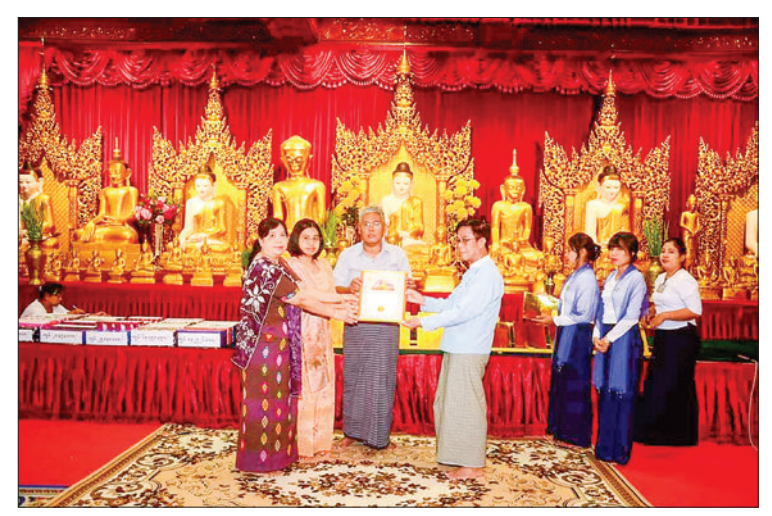
Shwedagon's 586th ceremony of donations.

THE 586<sup>th</sup> ceremony for handing over donated funds took place at the Shwedagon Pagoda on 7 May, with the total amount exceeding two billion kyats.