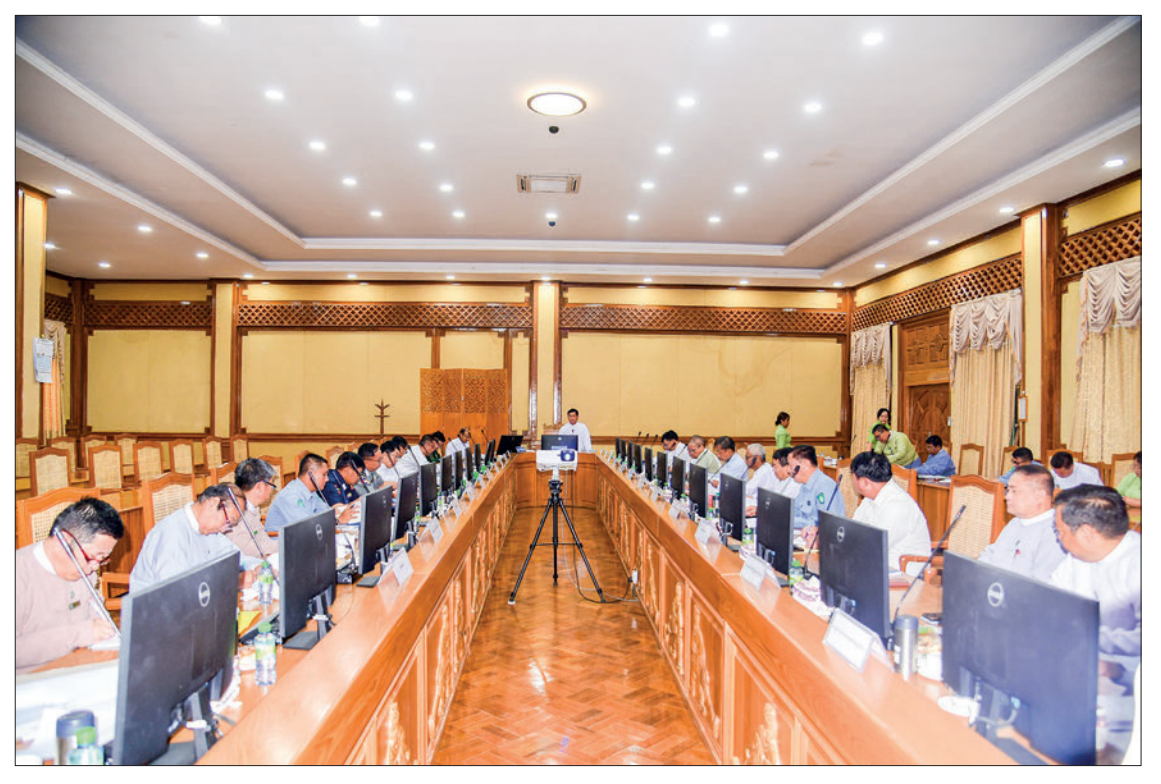
The coordination meeting on rehabilitation processes of Hsihseng Township, Pa-O Self-Administered Zone in progress yesterday in Taunggyi, Shan State.