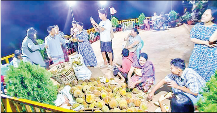
Arrival of durians in advance to Taung Pula, and they are to be offered at a free public feast.

DURIAN Satuditha food offering and plant growing festival will be held at Taung Pula mountain pagoda in Watwun village-tract, PyinOoLwin township, near Peik Chin Myaung, which attracts about 1000 pilgrims every day, Ashin Pyinnya Bawga (Taung Pula) told The Global New Light of Myanmar (GNLM).