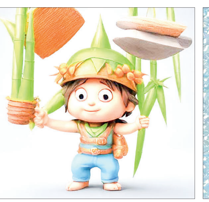
လေဖမ်းဝါးတန်းချည် /lei hpan wa dan chi/