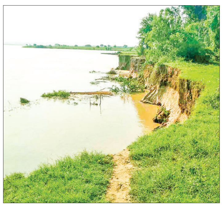
Large trees are seen floating in the Ayeyawady River due to landslides.

Such collapses may result in the floating of trees or tree fragments in the river, prompting the Directorate